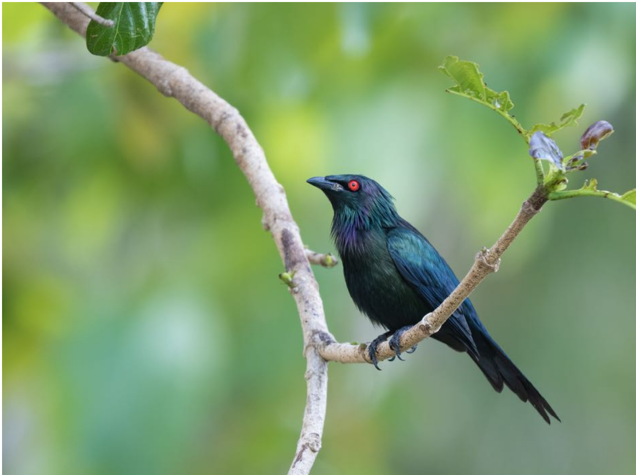
Metallic Starling

When it was finally time to head up to the Daintree, we took the route through Mossman. We do this for one reason. Though this time, we needed to do some shopping so it just made extra sense this time. When we got into Mossman, I took the group to one of the many Metallic Starling colonies around town. This particular one I feel is the best based on light, proximity and height of the nests. So we spent about 15-20min with the colony and then we continued north towards our overnight halt. By the time we arrived it was too late to do anything so we had a fantastic dinner and called it an evening.