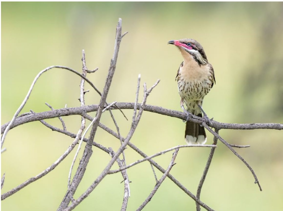
Spiny-cheeked Honeyeater