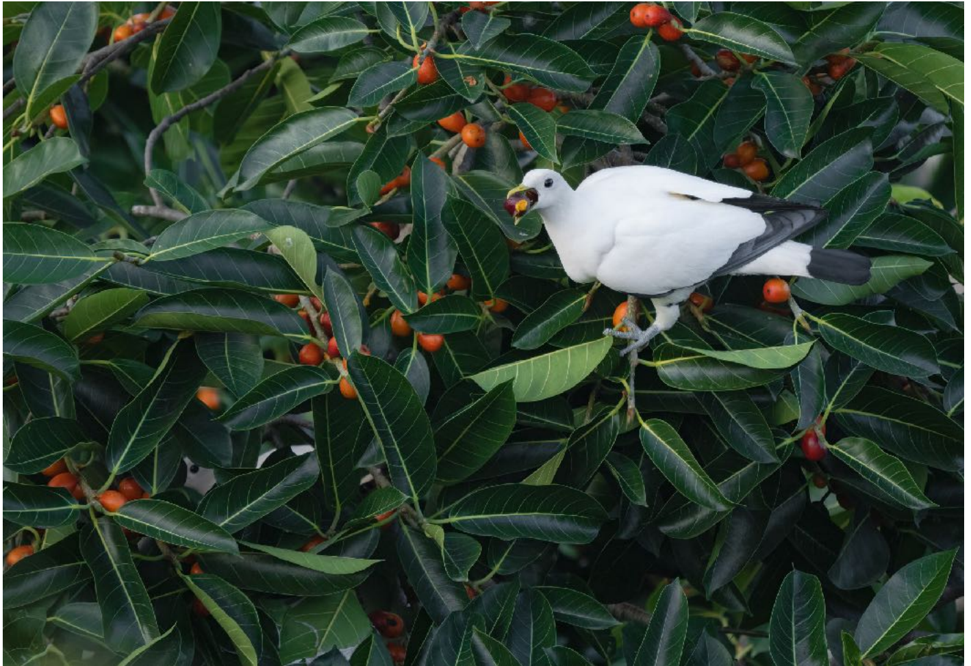
Torresian Imperial Pigeon

Today was our day to go to Michaelmas Caye , a seabird breeding sandy island in the middle of nowhere. However, before we did that, I took the group to the mall. “The mall?” you ask...well yes but you see I have a good reason. Torresian Imperial Pigeons use the fruiting trees next to the mall to feed in the morning. Luckily, the top level of the parking garage puts you at eye-level and in great light to photograph these stunning pigeons. We had some mixed light but overall, it was a great shoot before we grabbed breakfast and headed off for the boat.