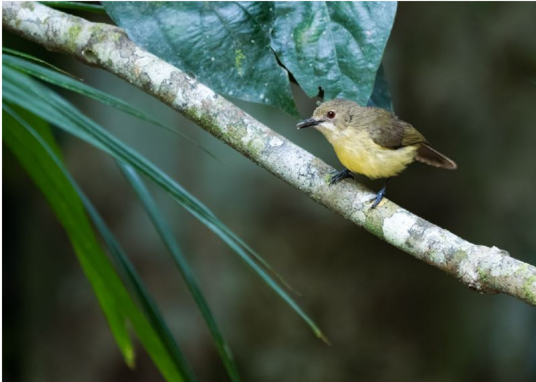
Fairy Gerygone - Photo by guide: Ben Knoot