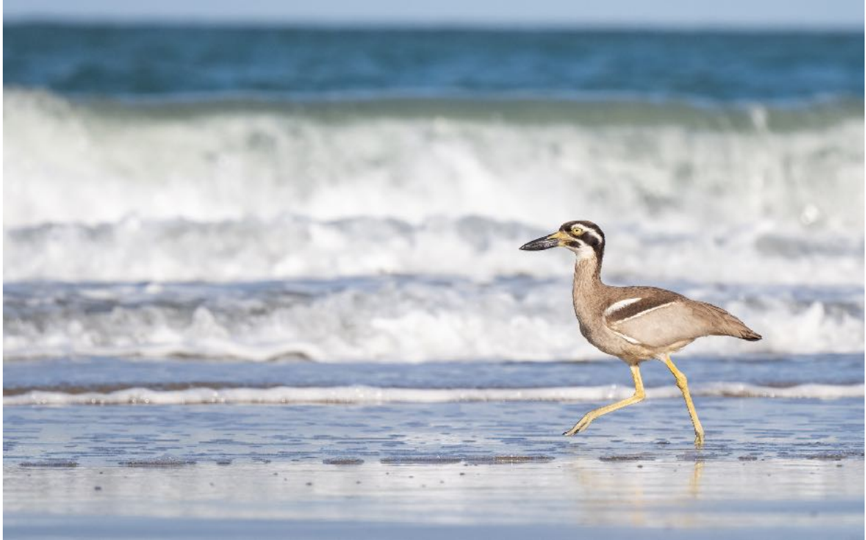
Beach Thick-knee