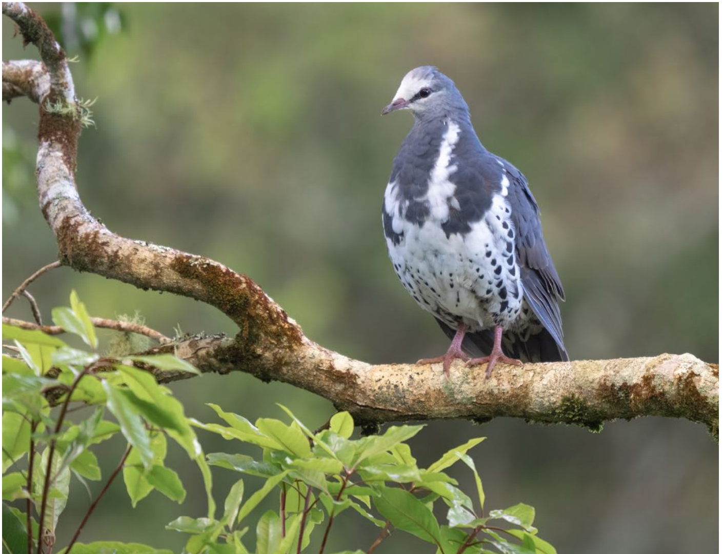
Wonga Pigeon

Our time around O'Reilly's Rainforest Retreat is quite special. There really isn't a lot of birds to photograph but the nature of the grounds and the birds make this a very special place. The grounds offered us; Crimson Rosella, Australian King Parrot, Albert's Lyrebird, Green Catbird, White-browed and Yellow-throated Scrub-wren, Eastern Yellow Robin, Satin Bowerbird, Regent Bowerbird, Wonga Pigeon, Red-browed Firetail, Eastern Whipbird, Australian Logrunner, Australian Brush Turkey, Brown Gerygone, Rose Robin, Rufous and Gray Fantail, Eastern Spinebill, Superb Fairy-wren, Lewin's Honeyeater, Pied Currawong, and Bassian Thrush.