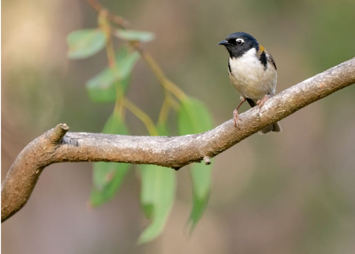
Black-headed Honeyeater