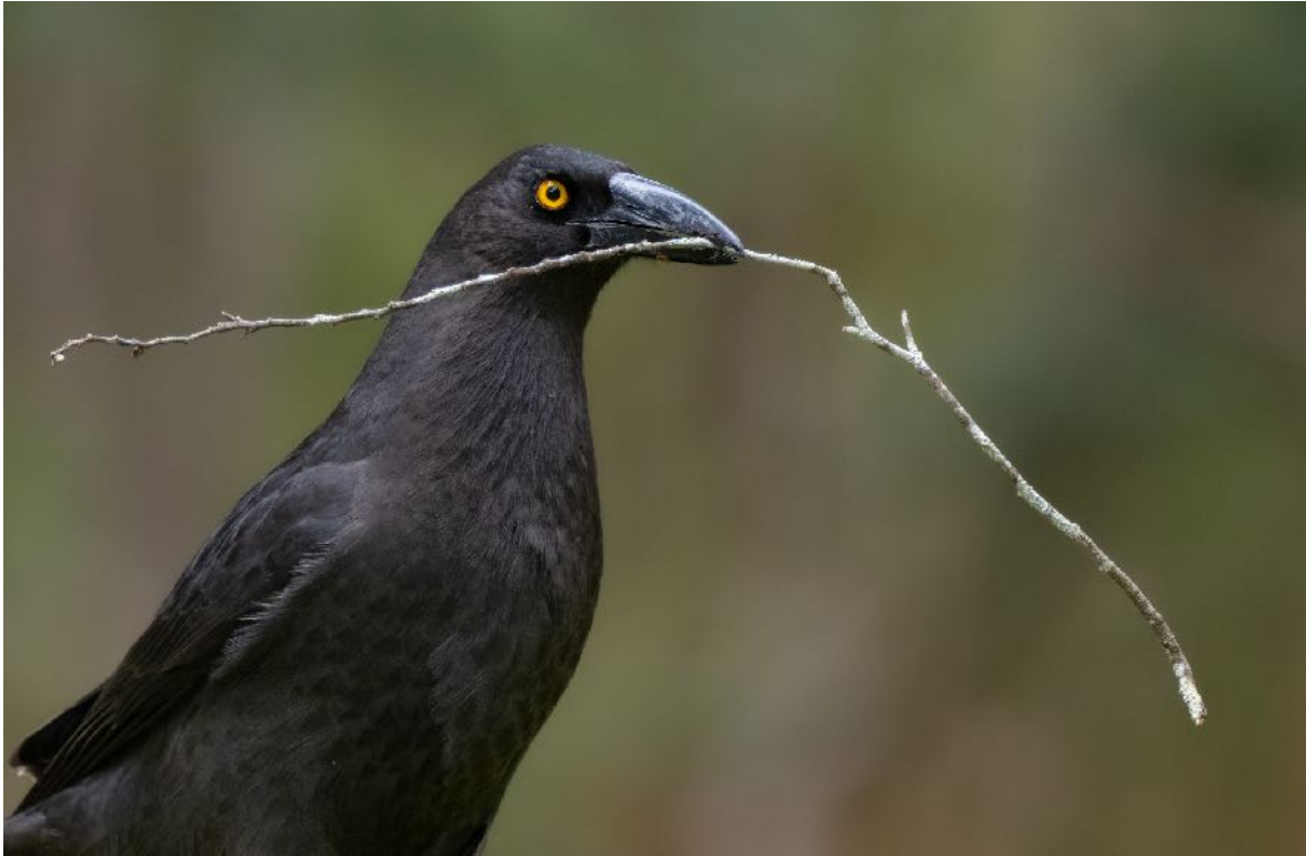
Black Currawong - Photo by guide: Ben Knoot