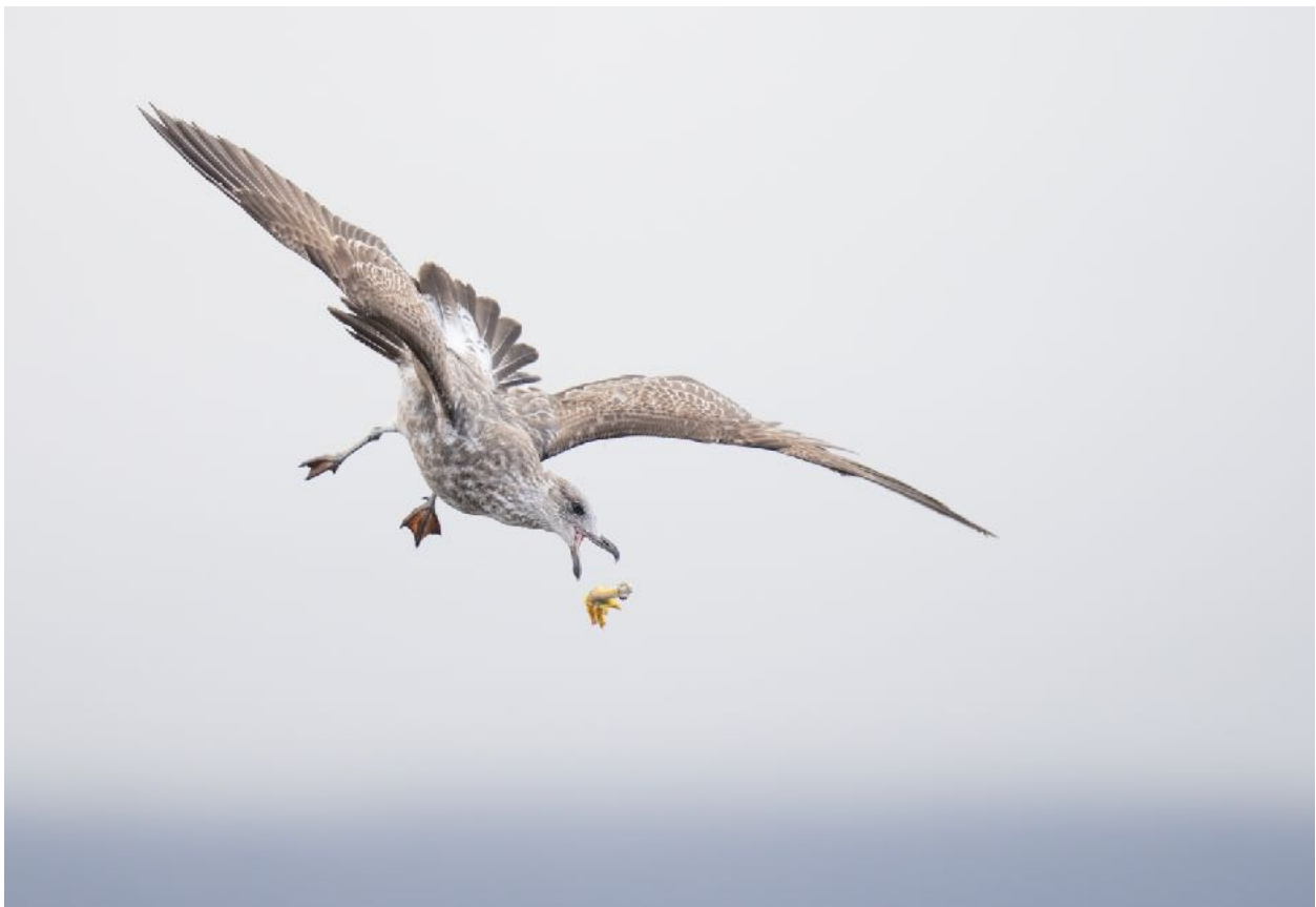
Kelp Gull