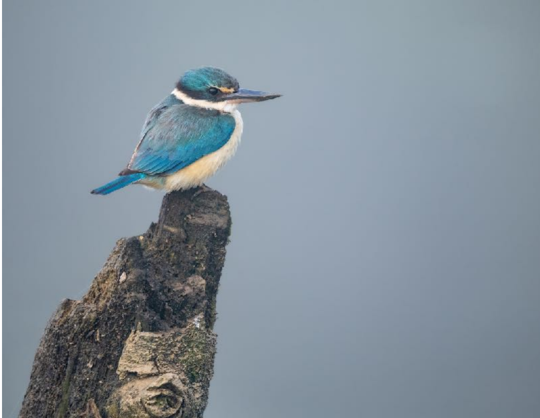
Sacred Kingfisher