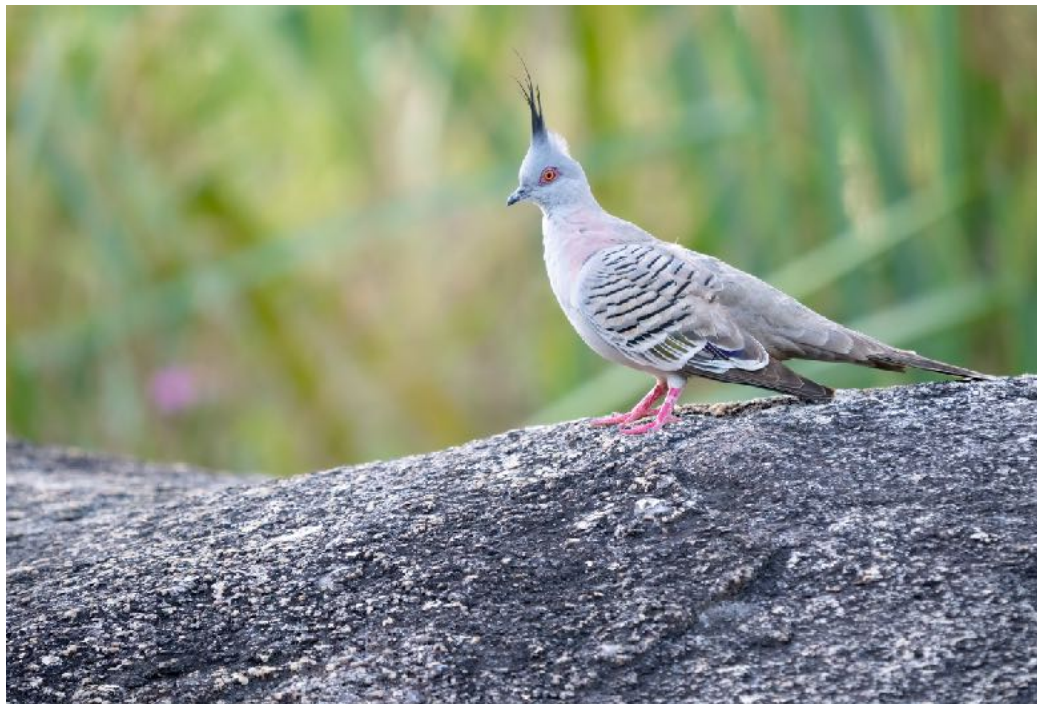
Crested Pigeon - Photo by guide: Ben Knoot