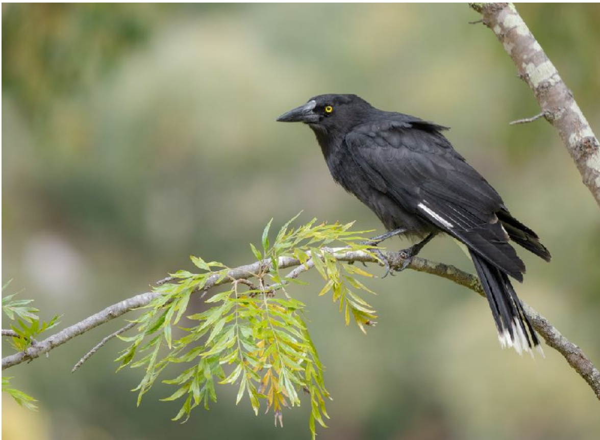
Gray Currawong