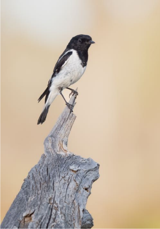
Hooded Robin