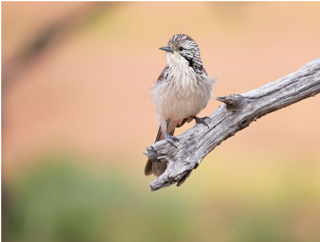
Striped Honeyeater