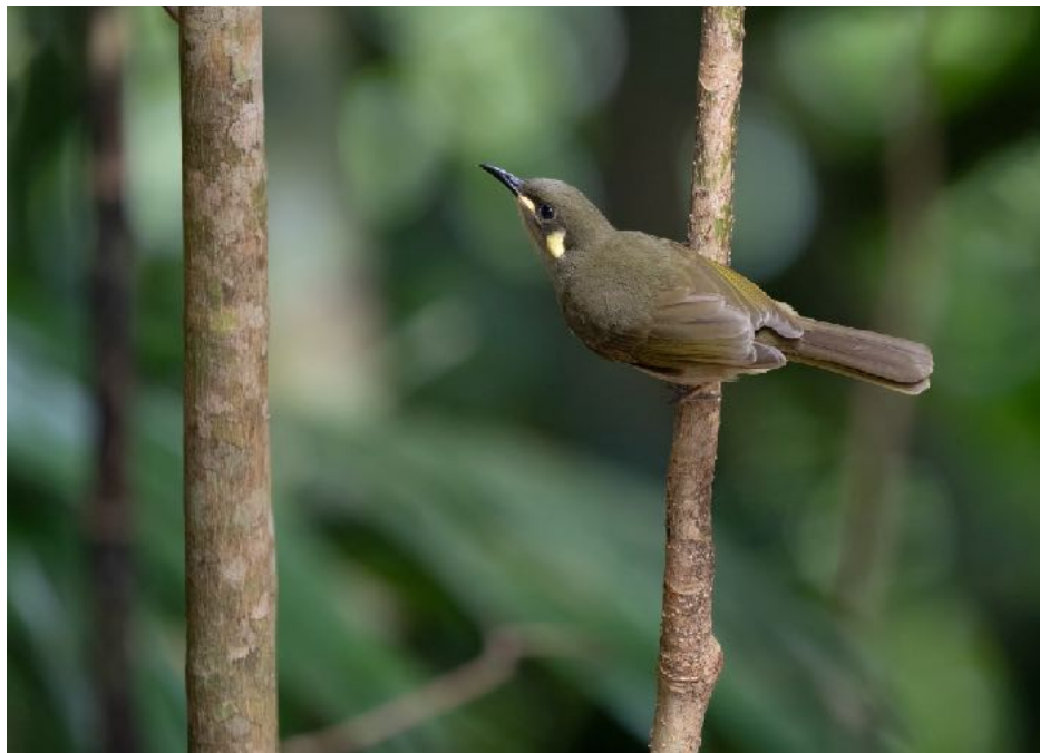
Yellow-spotted Honeyeater

We then went up Lake Morris Road to see if we could photograph any forest specialties. We managed some good birds but highlights included; Fairy Gerygone , Yellow-spotted Honeyeater and Pied Monarch .