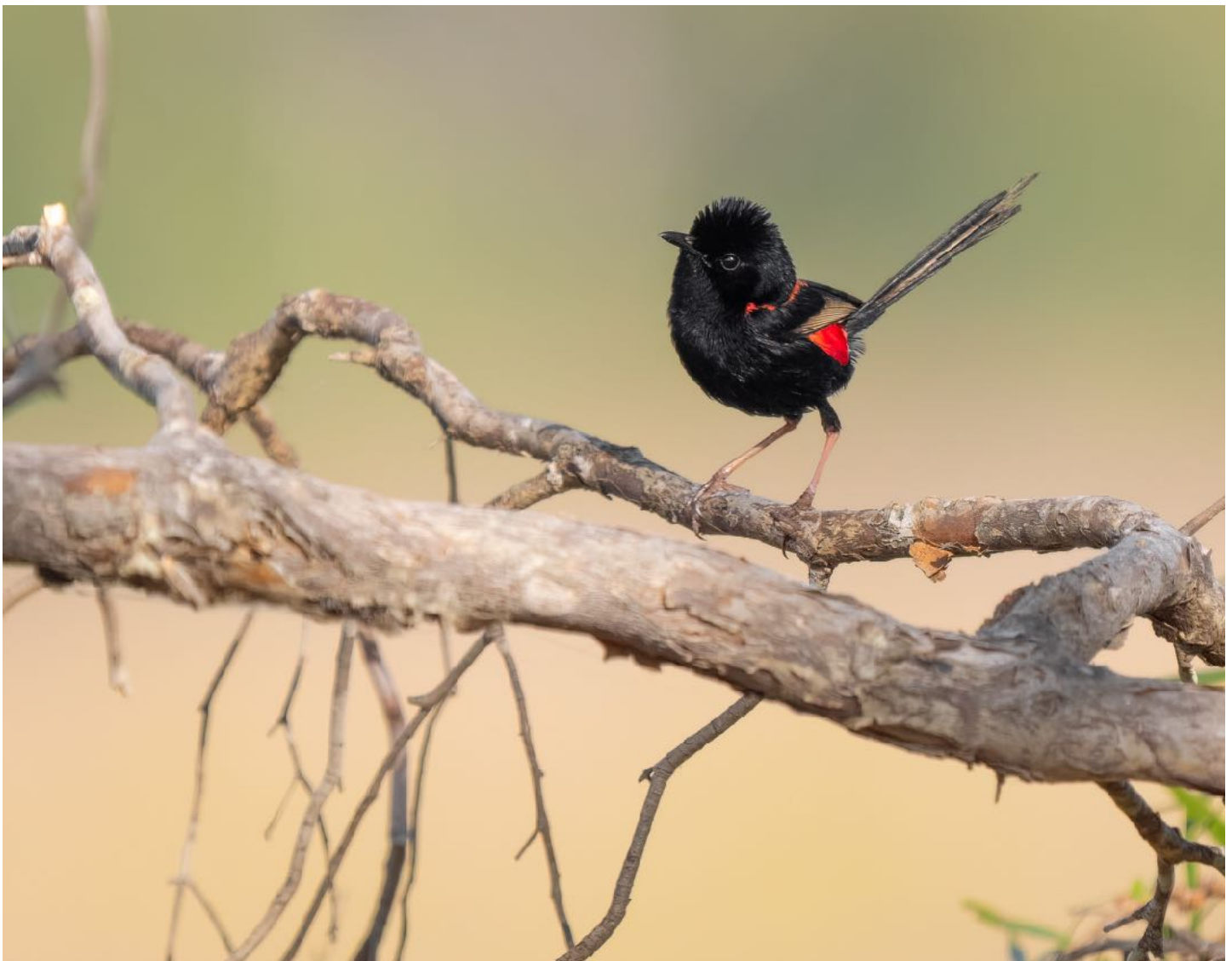
Red-backed Fairy-wren

Today we began early and ventured towards Mount Carbine but first we stopped off at East Mary Roads "Bustard Downs" . Here we photographed Great Bustard and Red-backed Fairy-wren . Those were our only two targets really so after this success, we continued on towards Mount Carbine caravan park.