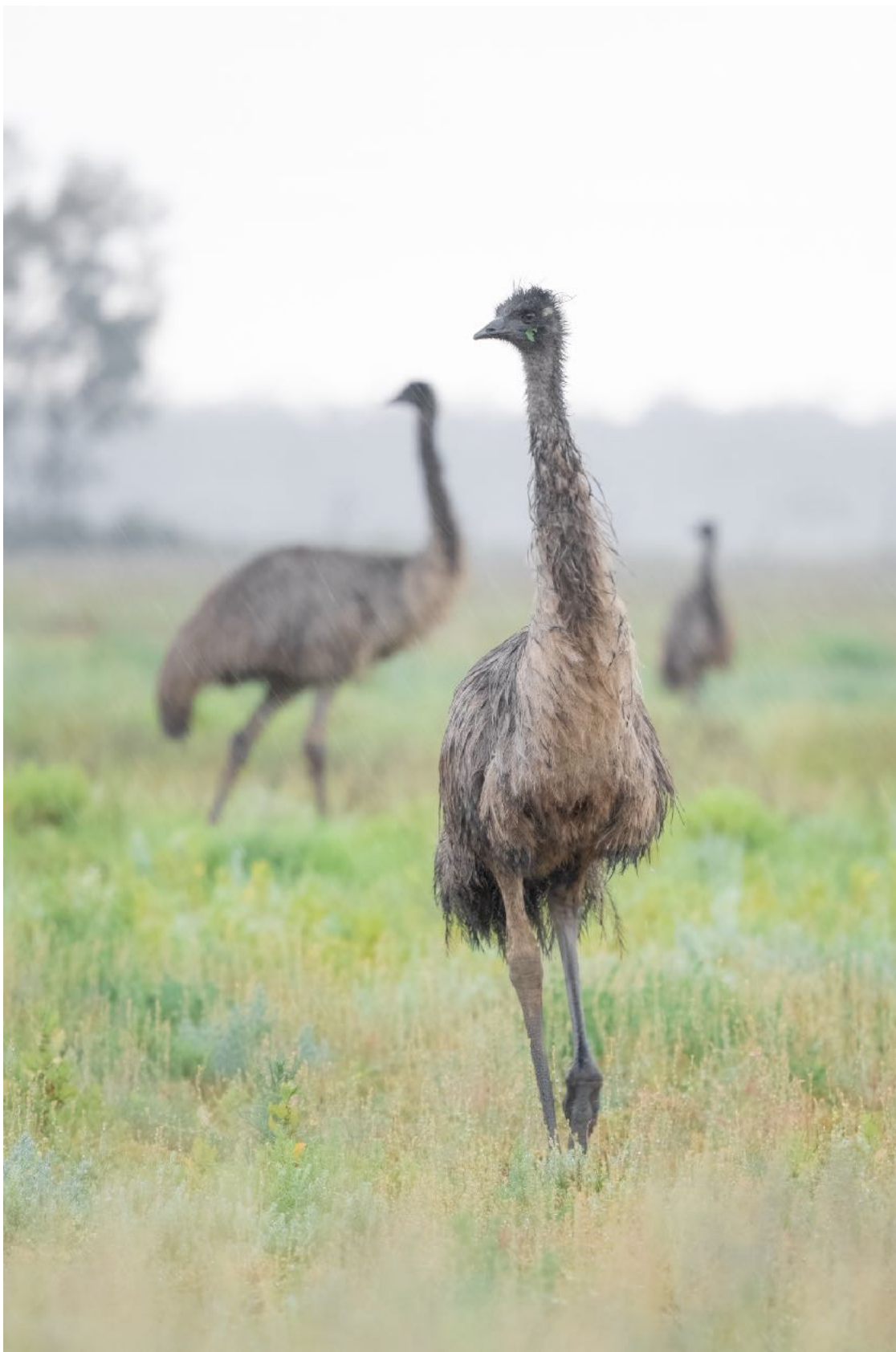
Emu - Photo by guide: Ben Knoot