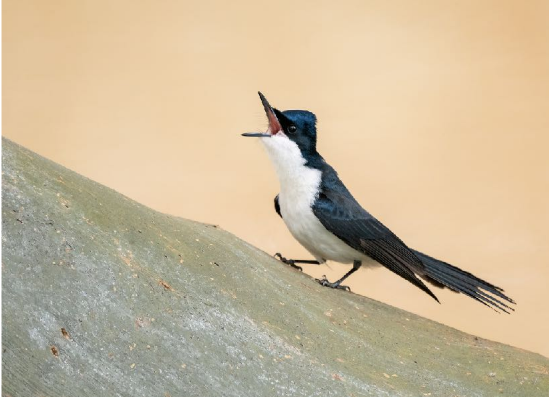
Restless Flycatcher