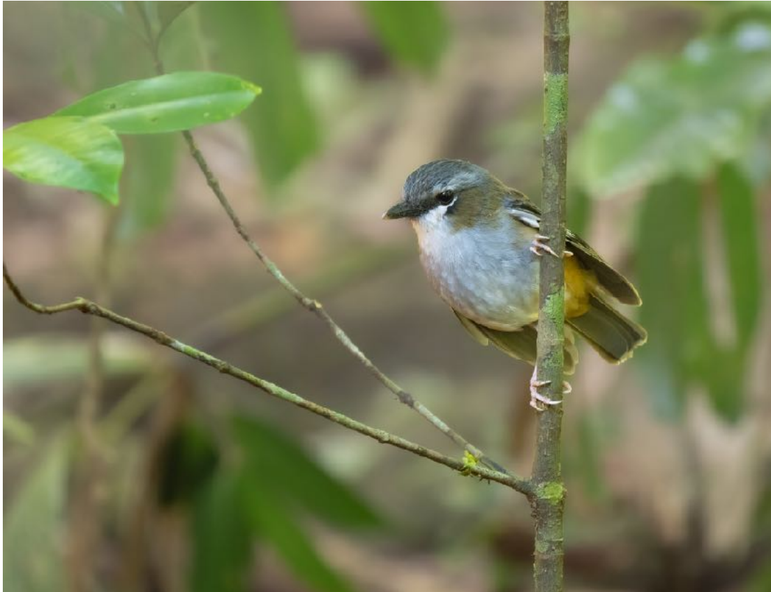
Gray-headed Robin