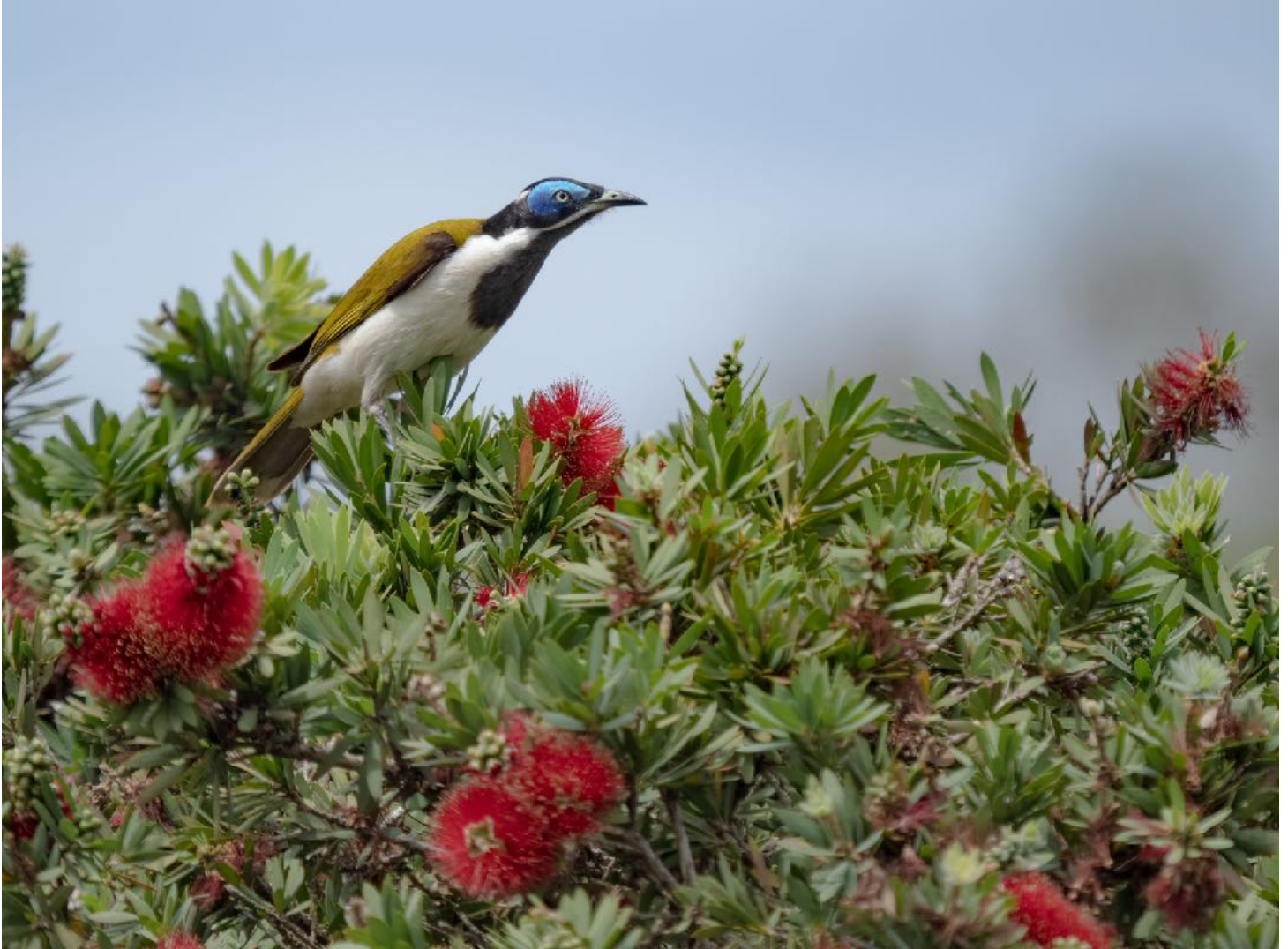
Blue-faced Honeyeater

We ended our day and our time in the Cairns region by visiting Cattana Wetlands . We walked around the wetlands for a good few hours until we found our targets; Green Pygmy Goose and Comb-crested Jacana . I was however still looking for one target, Australia's only stork species. I was planning on heading to a spot where one had been reported but over 10-days ago...it was by no means guaranteed or even likely but upon leaving the wetlands, I took a left and headed towards the Yorkey's Knob area. And I kid you not, 50-meters after my turning and in the most random field there it stood...a magnificent and gorgeous Black-necked Stork . HOW ABOUT THAT!?! I love it when things like this happen. Follow your gut, stay open-minded and stay observant...great things will happen! After this fantastic ended to our Cairns section, we grabbed one last dinner and hit the hay. Tomorrow we had an exceptionally early flight to Brisbane and our next trip section.