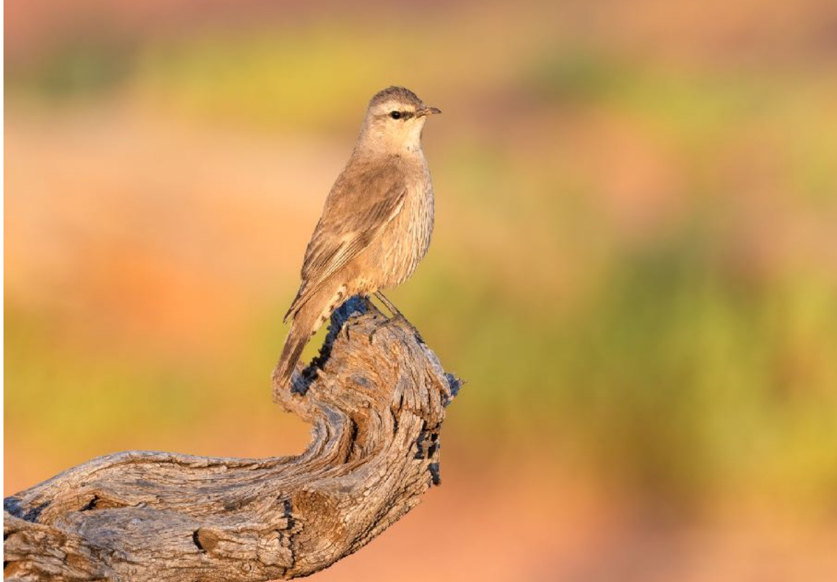
Brown Treecreeper