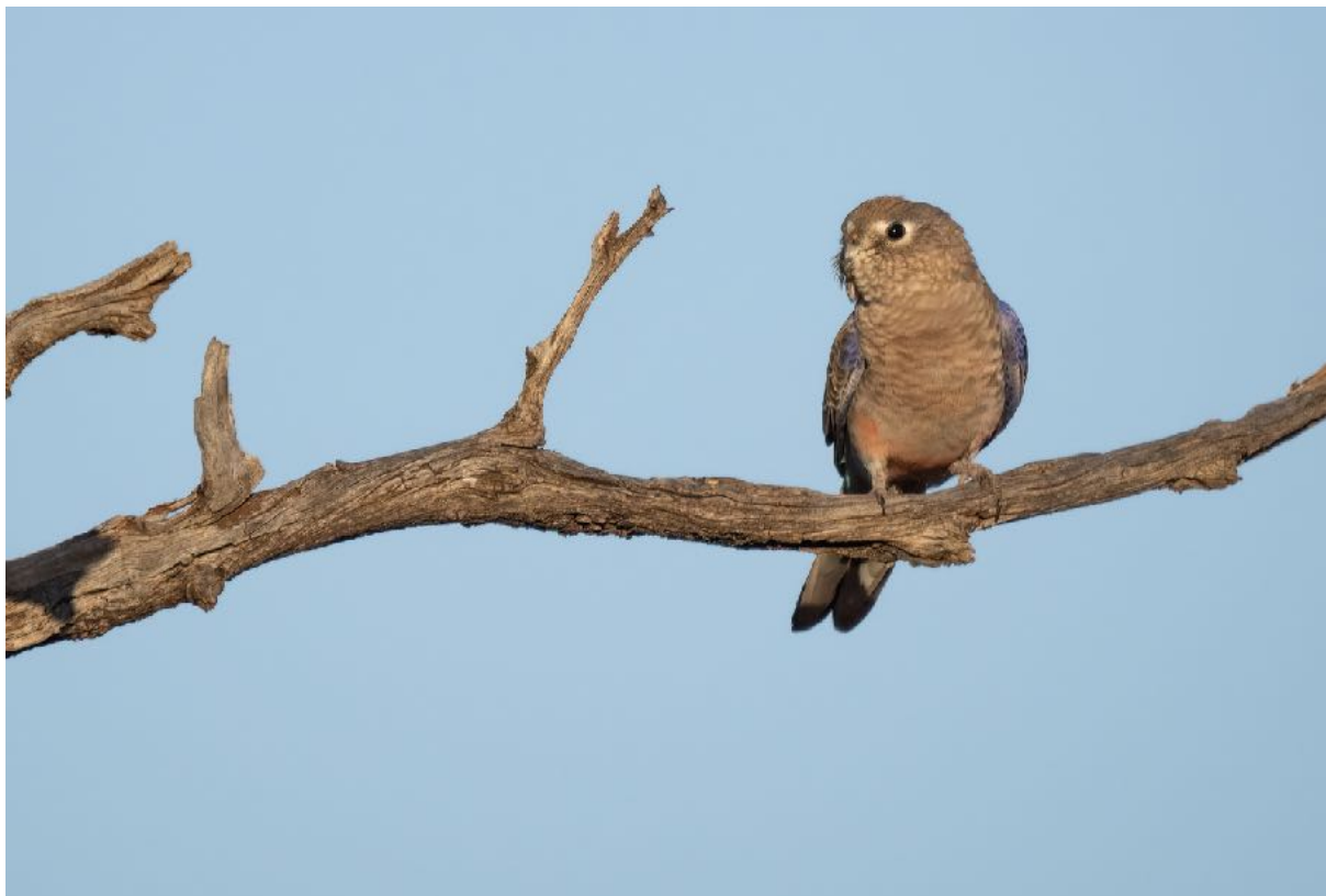
Bourke's Parrot