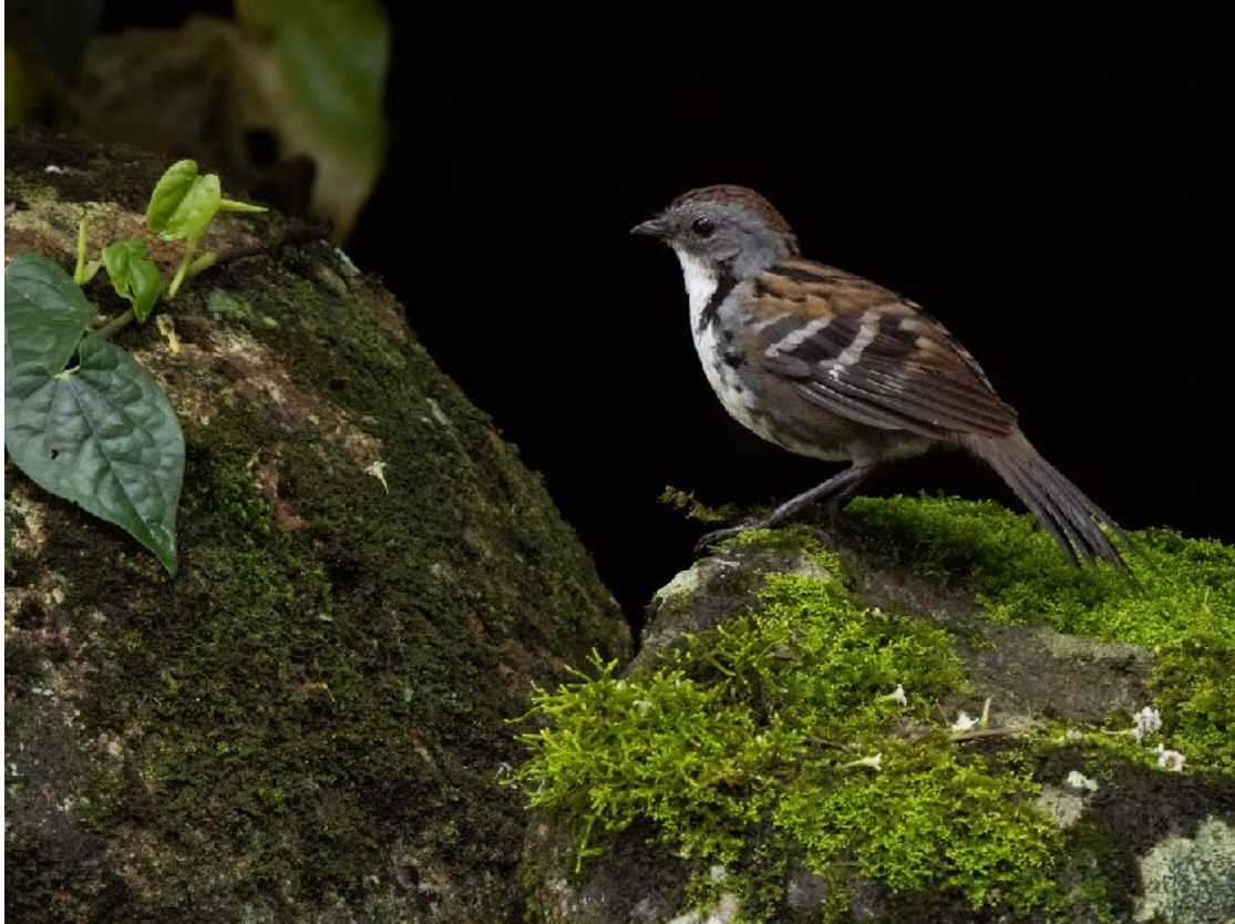
Australian Logrunner - Photo by guide: Ben Knoot