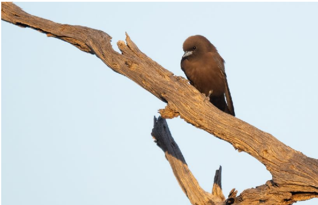
Little Woodswallow