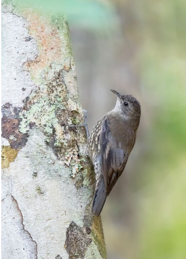
White-throated Treecreeper - Photo by guide: Ben Knoot