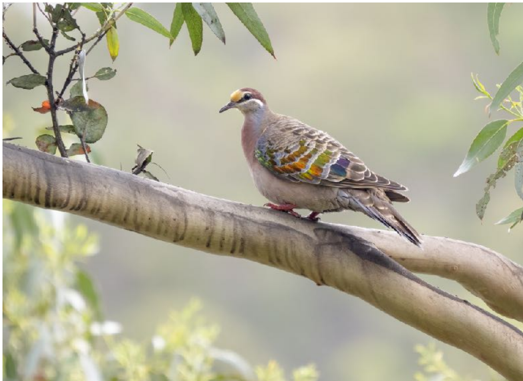
Common Bronzewing