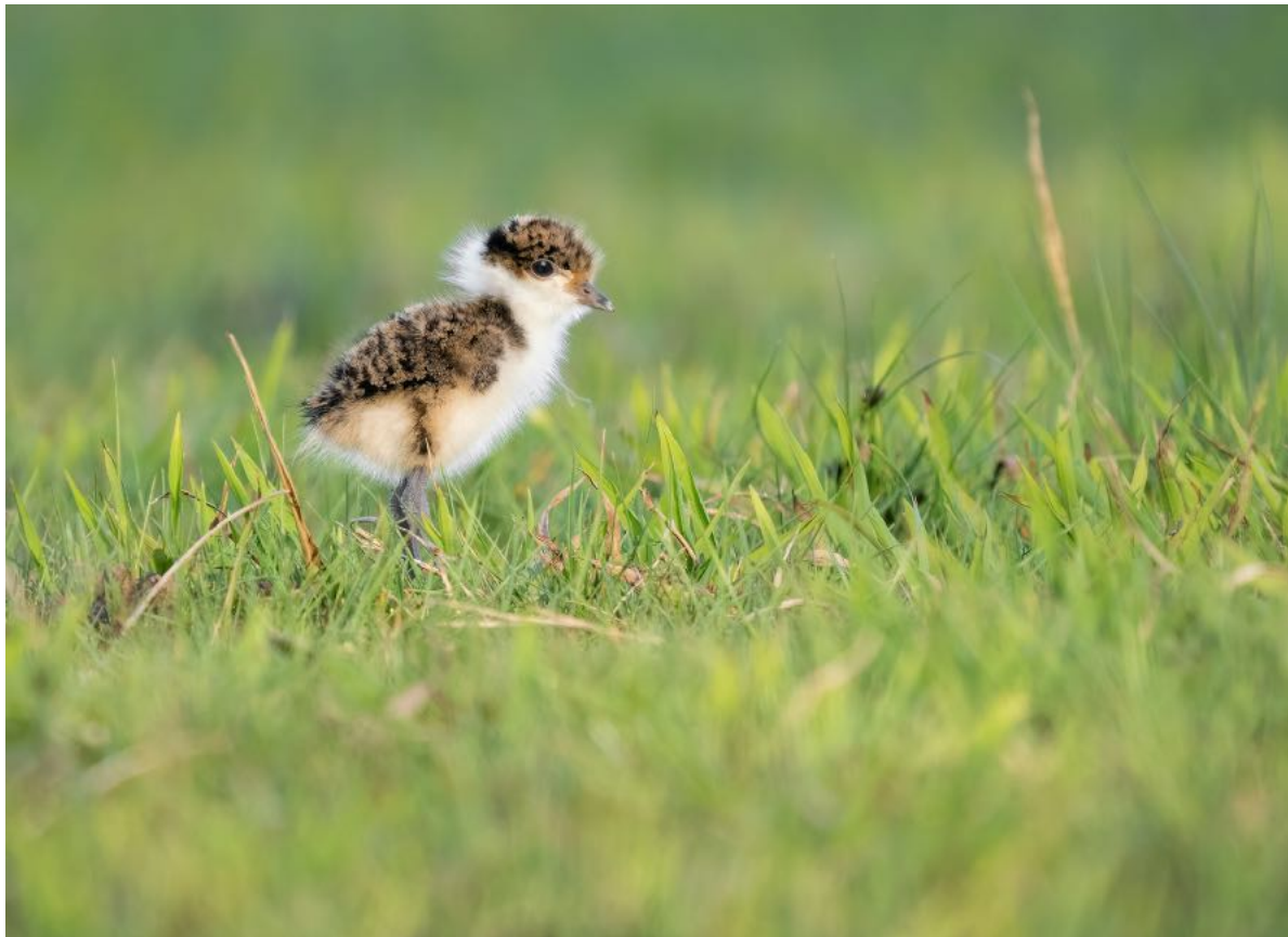
Masked Lapwing (chick)