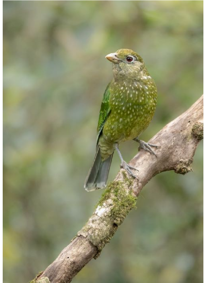
Green Catbird - Photo by guide: Ben Knoot