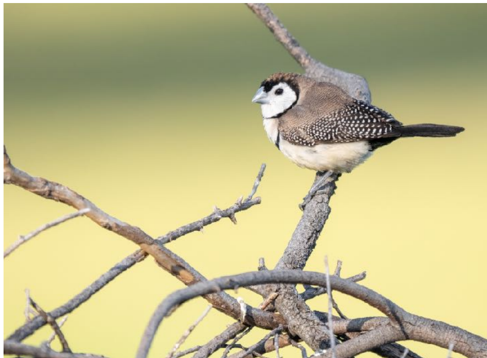
Double-barred Finch