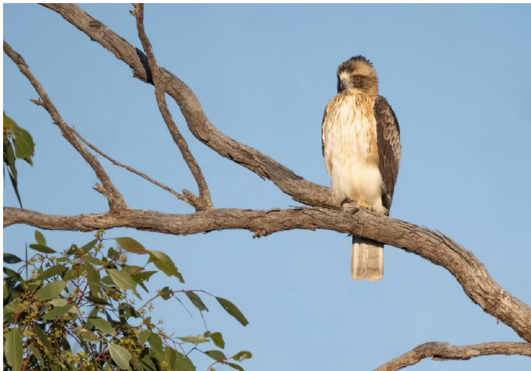
Little Eagle