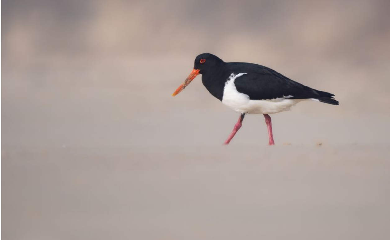
Pied Oystercatcher