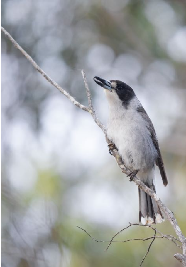
Gray Butcherbird