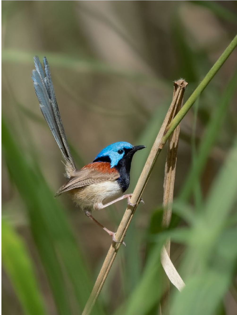
Variegated Fairy-wren