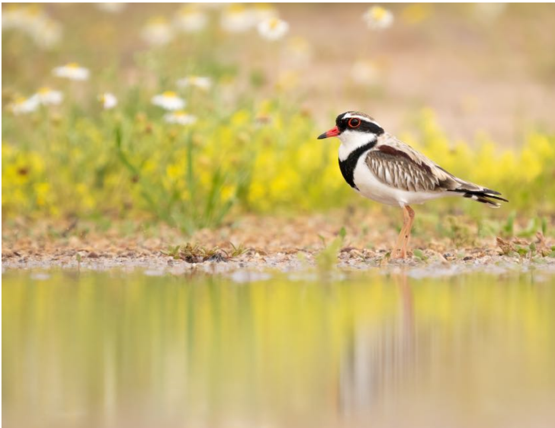
Black-fronted Dotterel