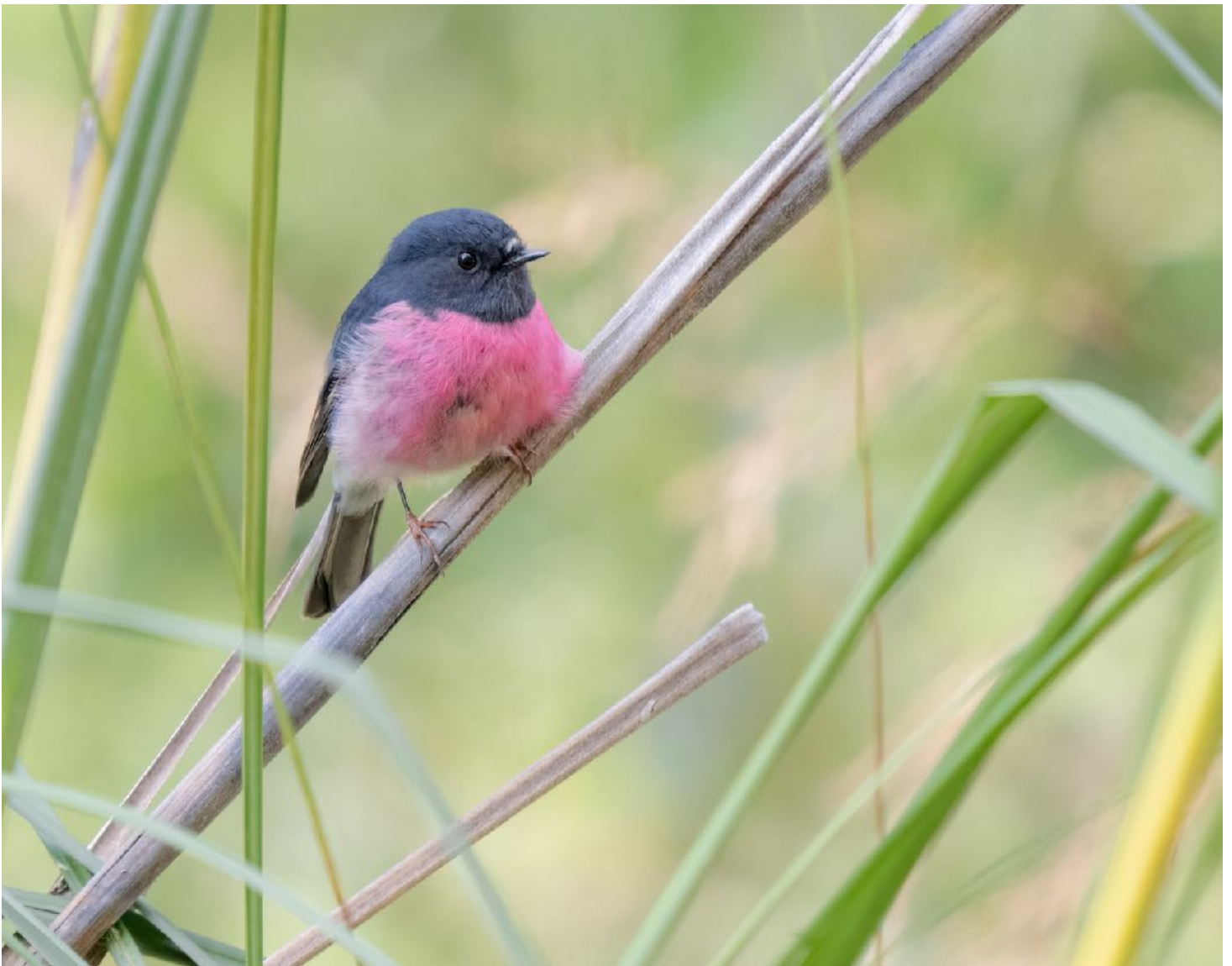
Pink Robin

Today we took the early ferry and photographed as much as we could on Bruny Island . We found; Swift Parrot , Hooded Plover , Pink Robin , Australian Magpie , Gray Butcherbird , Strong-billed Honeyeater , Black-headed Honeyeater , Chestnut Teal , Sooty Oystercatcher and Black Swan . After we had done what we could on Bruny, we moved back towards mainland Tasmania and hit the coast areas. We found; Masked Lapwing , Long-billed Corella , Black-faced Cormorant , Kelp Gull , Little Pied Cormorant , Eastern Rosella , White-faced Heron and Pied Oystercatcher . During our visit in Tasmania, we managed to find all of the endemic species (though we did not photograph all of them) of Tasmania. There are 12 in all and the Scrubtit is typically the hardest to photograph and that is indeed the only one we missed photographically.