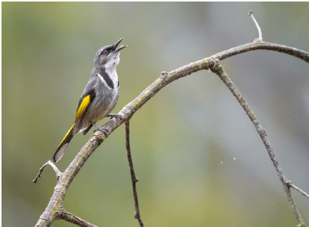
Crescent Honeyeater