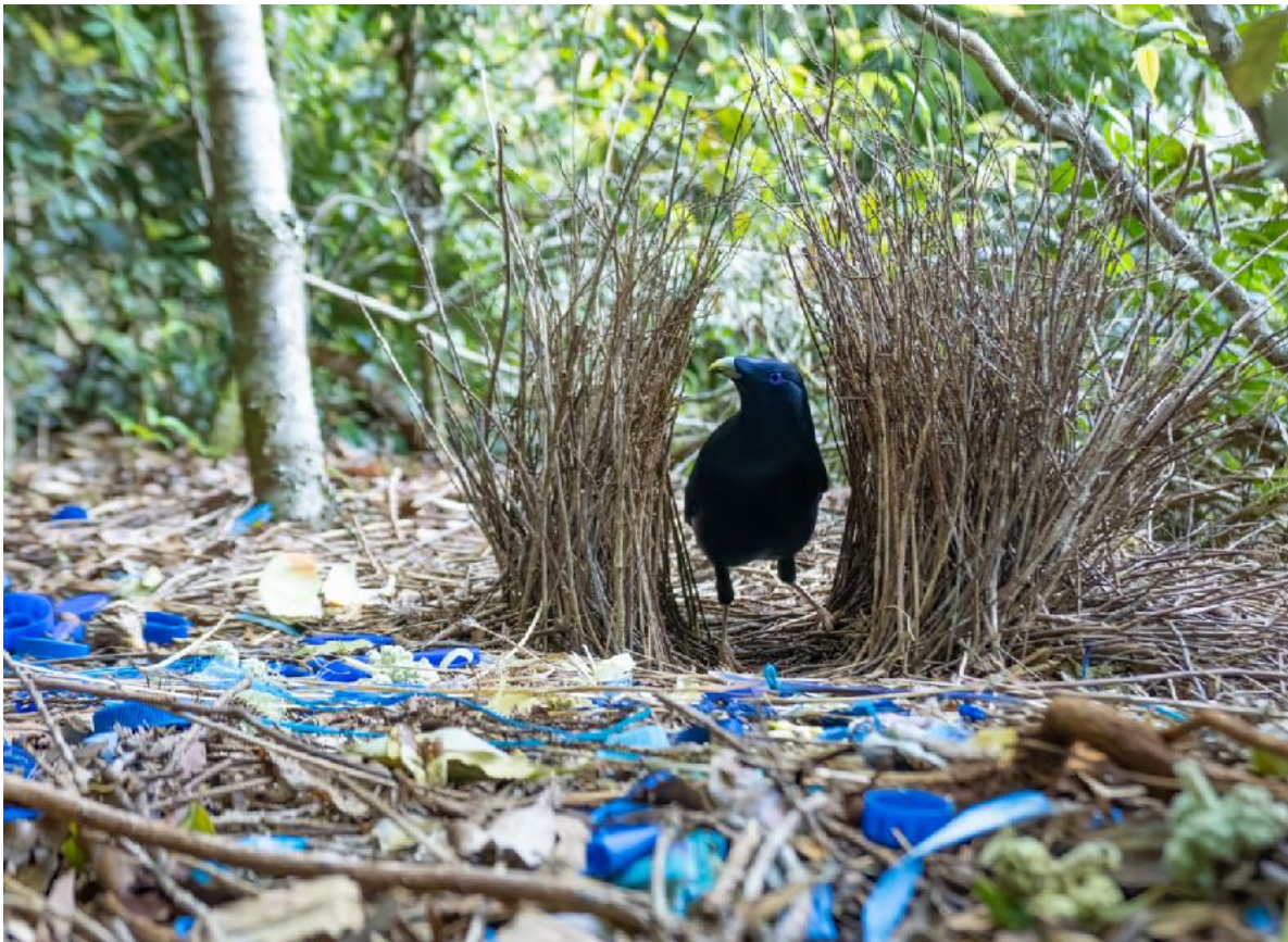
Satin Bowerbird - Photo by guide: Ben Knoot