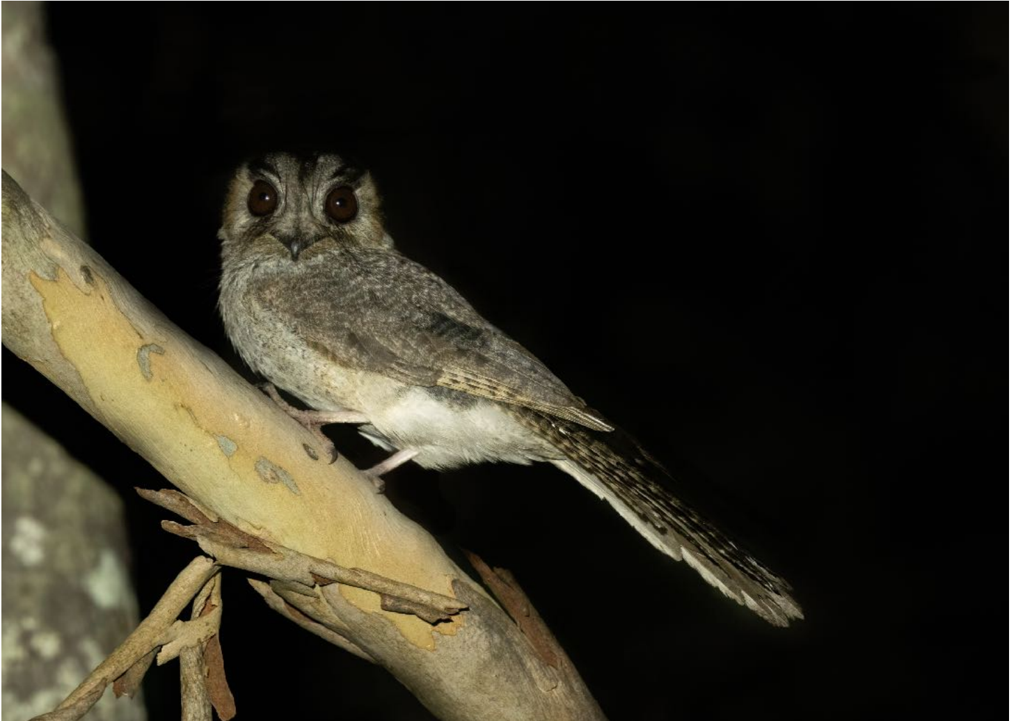
Australian Owlet Nightjar

One member of the group opted for a night outing to see Australian Owlet Nightjar . After a bit of searching in Davies Creek , we found a few individuals who wanted to pose for some decent photo opportunities!