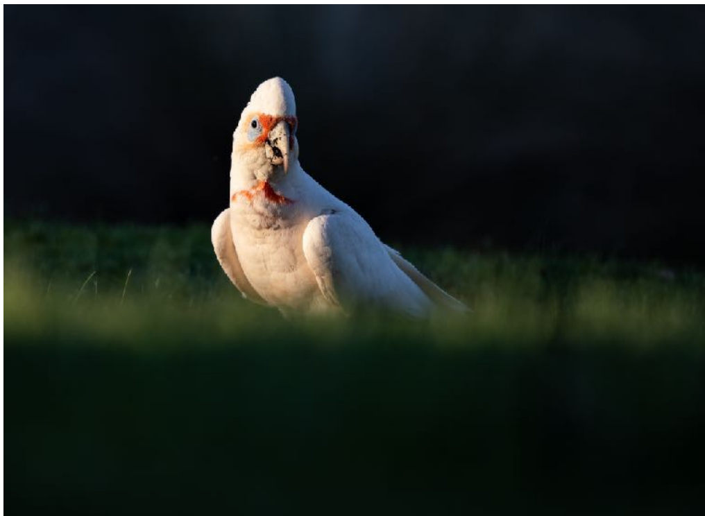
Long-billed Corella