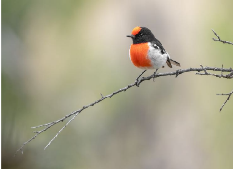
Red-capped Robin - Photo by guide: Ben Knoot

After our time at the bore, it was unfortunately time to head back. The drive back towards Dalby is exceptionally long. We made several opportunistic stops along the way photographing; Red-kneed Dotterel , Black-fronted Dotterel , Australasian Grebe , Pied Stilt and a stunning male Red-capped Robin . Eventually we pulled into Dalby during the late evening for a good nights rest.