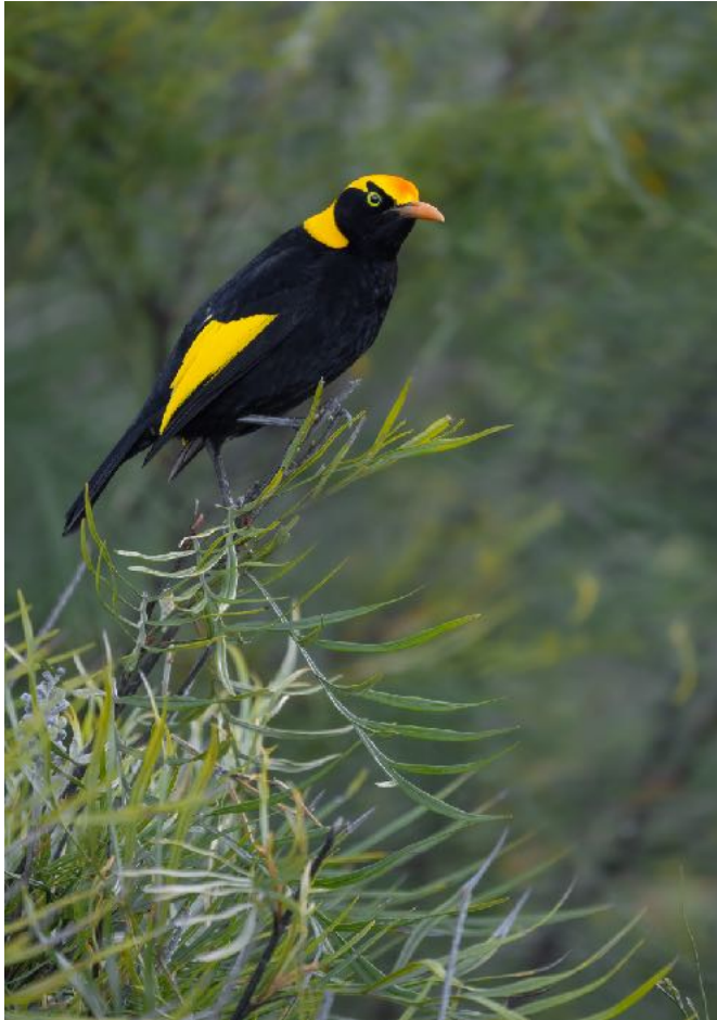
Regent Bowerbird