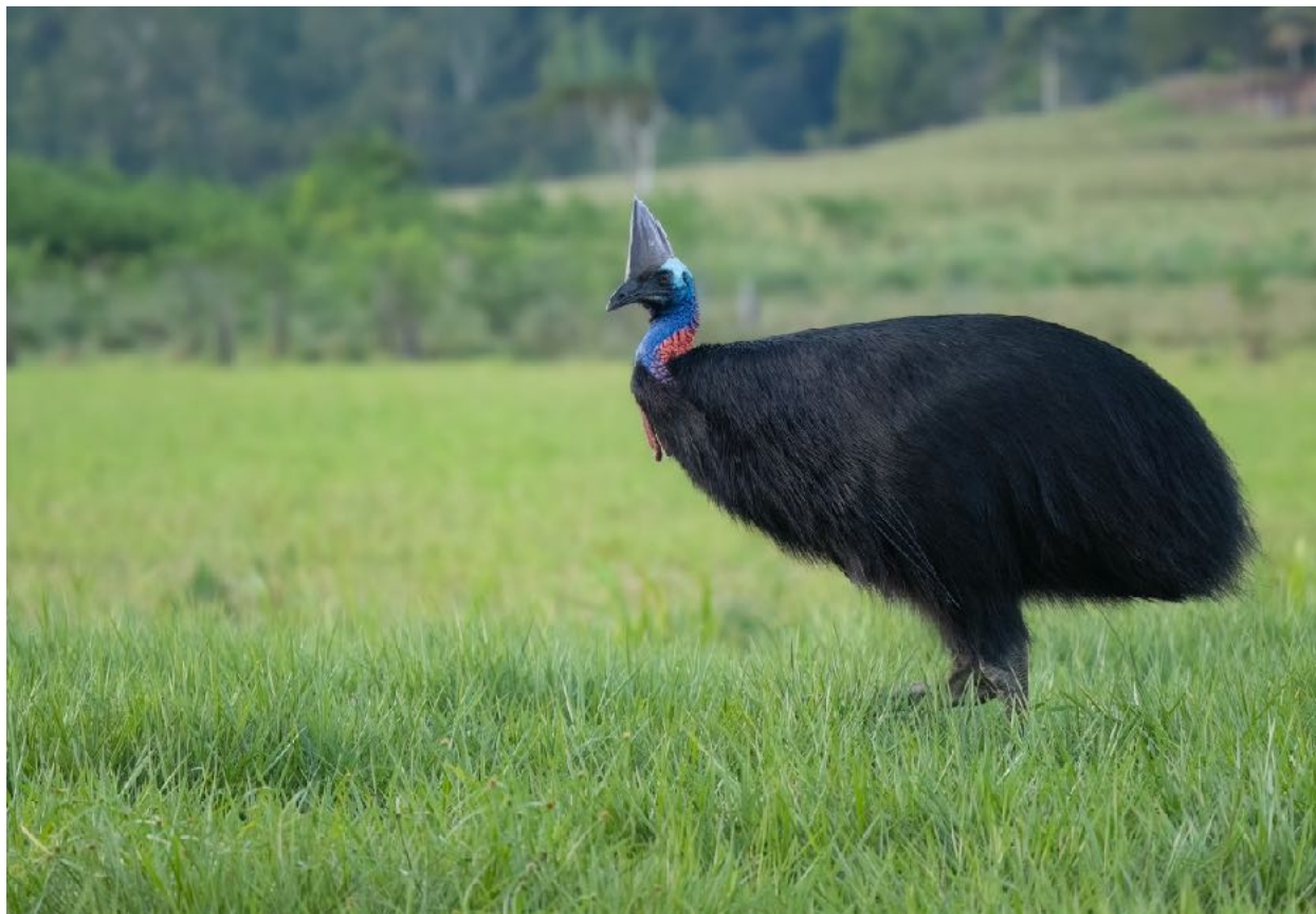
Southern Cassowary - Photo by guide: Ben Knoot