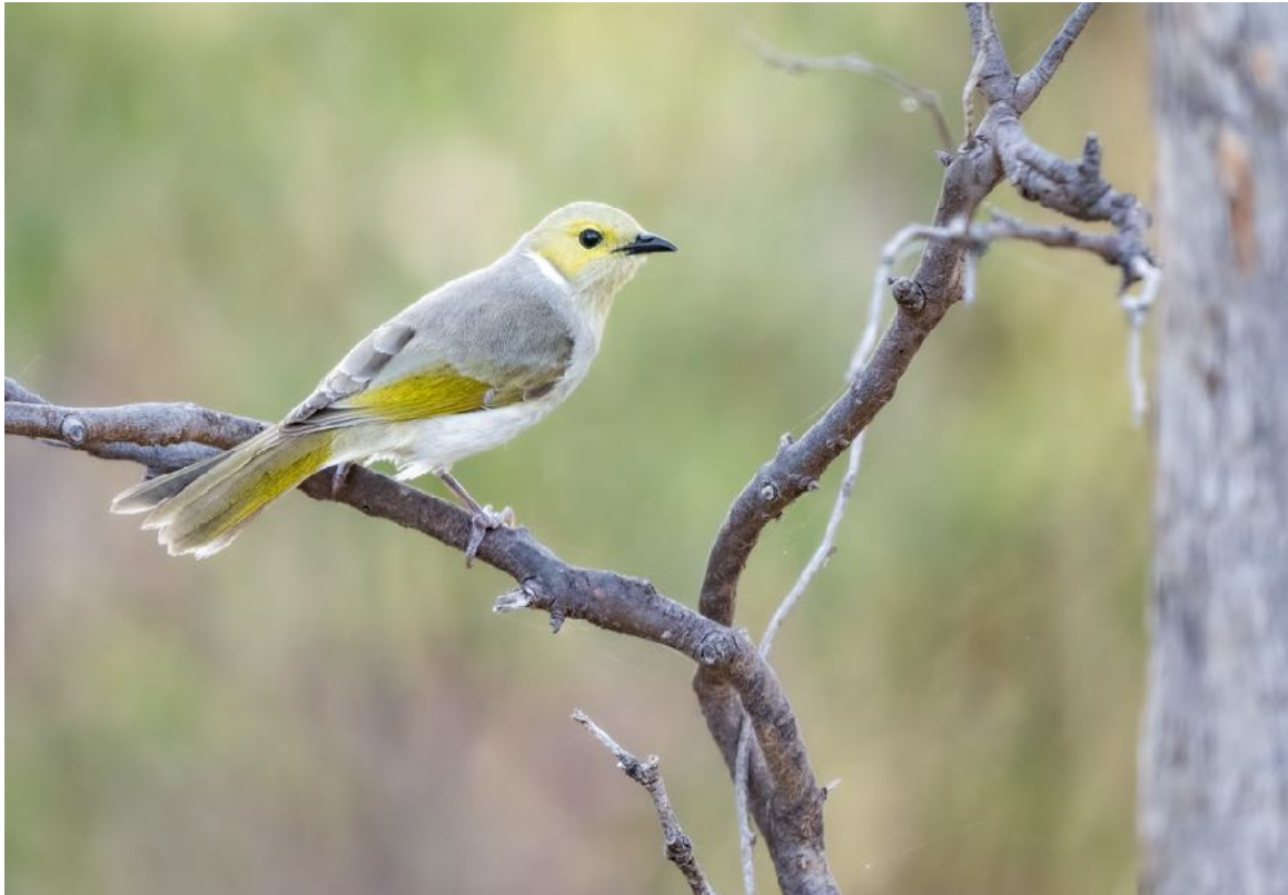
White-plumed Honeyeater