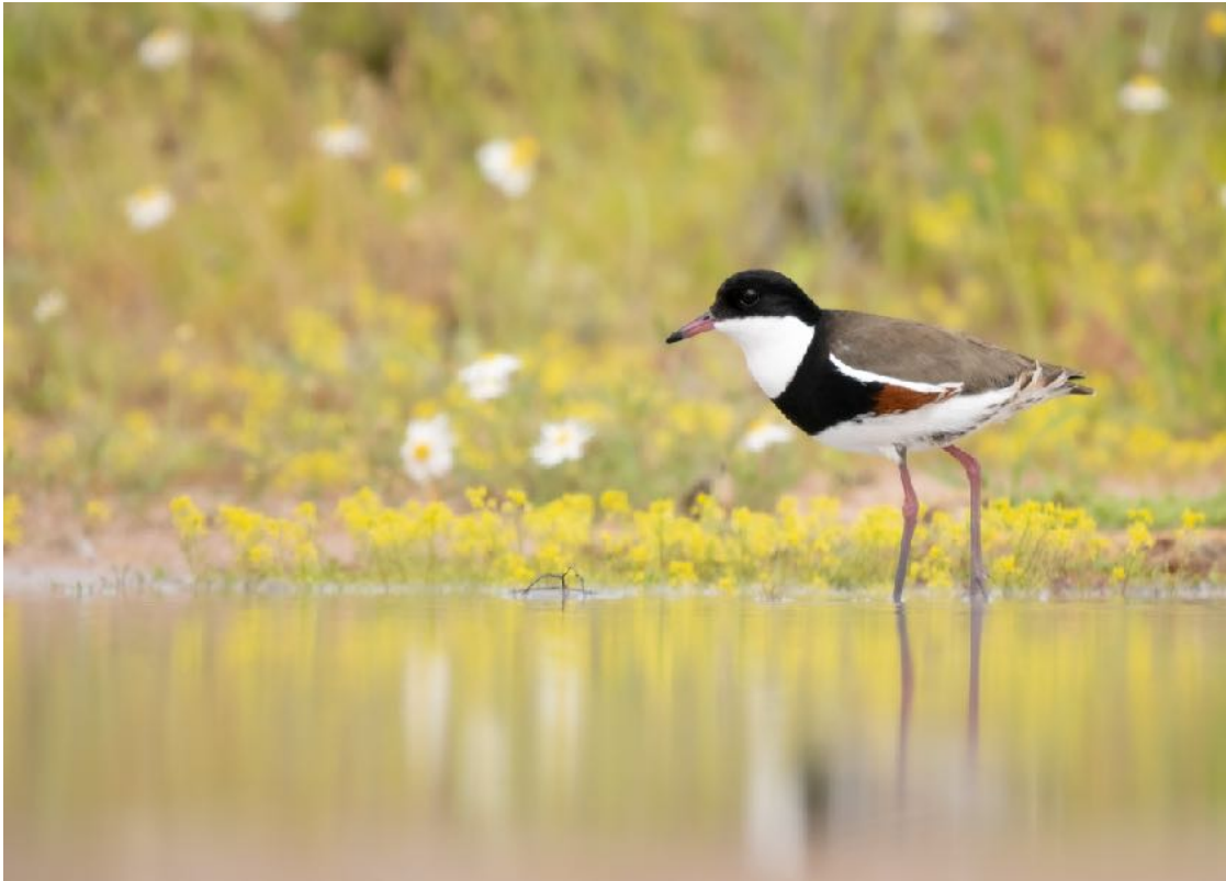
Red-kneed Dotterel