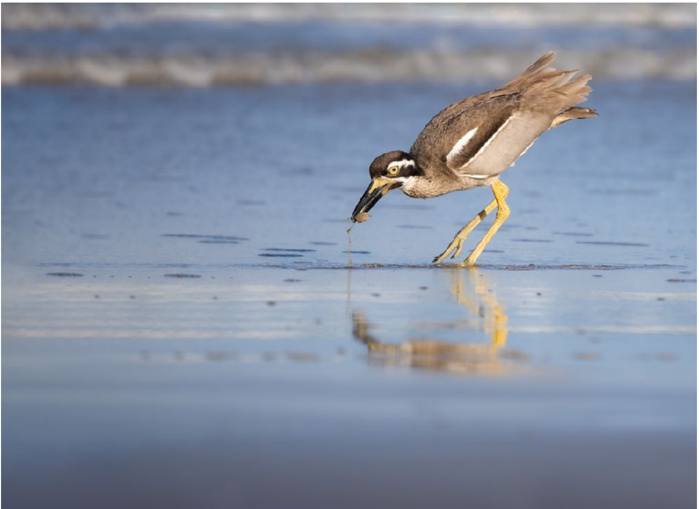
Beach Thick-knee

The first afternoon is a biggie, there is no denying that. And there is always a bit of fear on my part for this first target. It is a big decision to take a group of people over an hour and a half away from good birds to try and find one bird. A bird that while typically is quite predictable, can obviously decide “eh...I’m not showing up today” and then you’ve essentially wasted the whole afternoon and photographed nothing. Because the location of this bird in Etty Bay , really doesn’t have a lot of other species around. Having said that and deciding to take the risk (I almost always do...) We arrived and I was extremely surprised to find a Beach Thick-knee wandering around the beach hunting in-between waves...EPIC! Normally this bird can be quite shy and quite a challenge to find so to have one in excellent light, be so accommodating and to not have to work very hard for it was a real treat. We continued our search and luckily, we didn’t have to wait long for the star of the day to arrive, a beautiful female Southern Cassowary (the cover image). Typically the bird of the trip, this towering, flightless beast of a bird graced our presence for about half of an hour or so and then just disappeared into the forest. We actually managed to see another one walking the road on the way out! Very cool afternoon!