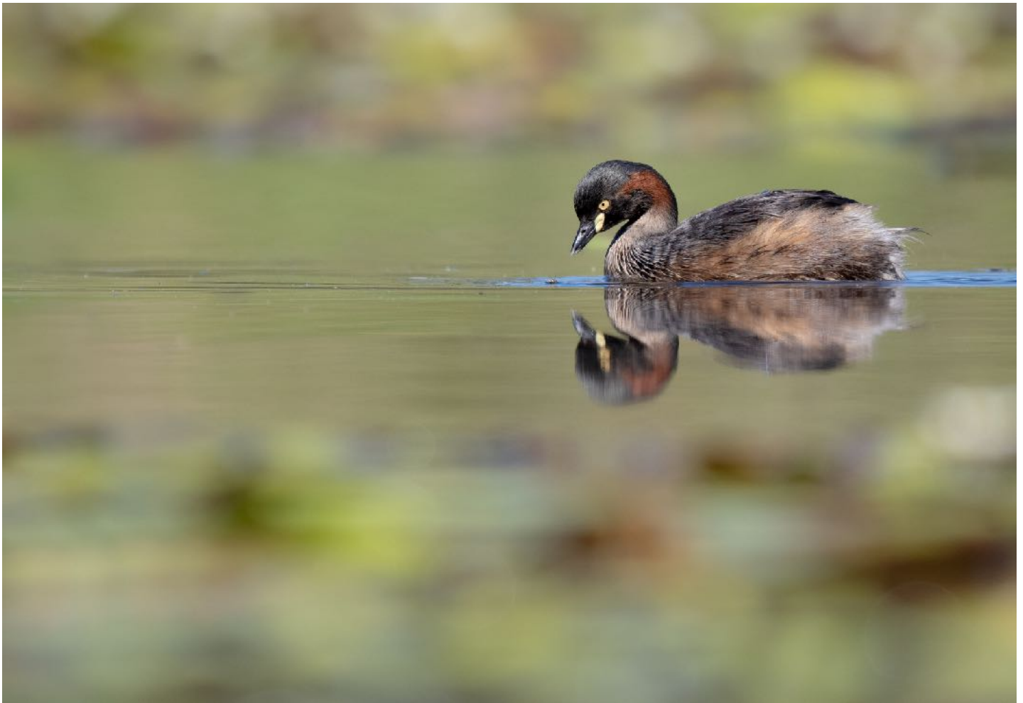
Australasian Grebe

After an exceptionally early flight, we landed in Brisbane. After we gathered our luggage, rental car and few provisions, we made our first stop at a nearby park; Minnippi Wetland Park . Here the group got their first looks at; Variegated Fairywren , Australasian Grebe , Gray Butcherbird , Maned Duck , Australasian Swamphen , Little Black Cormorant , Noisy Miner and a host of other common birds. But after a while, we had to continue on, we had a very important search to conduct before we left for our long drive towards Goondiwindi.