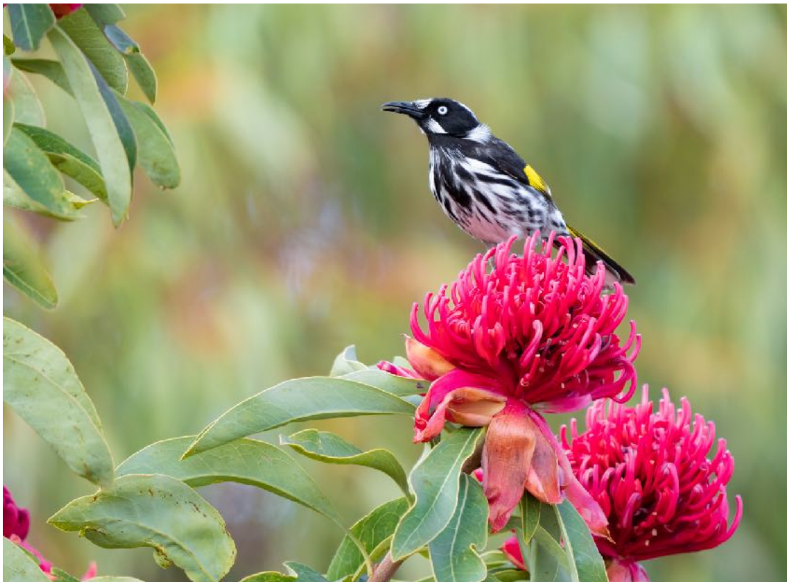
New Holland Honeyeater