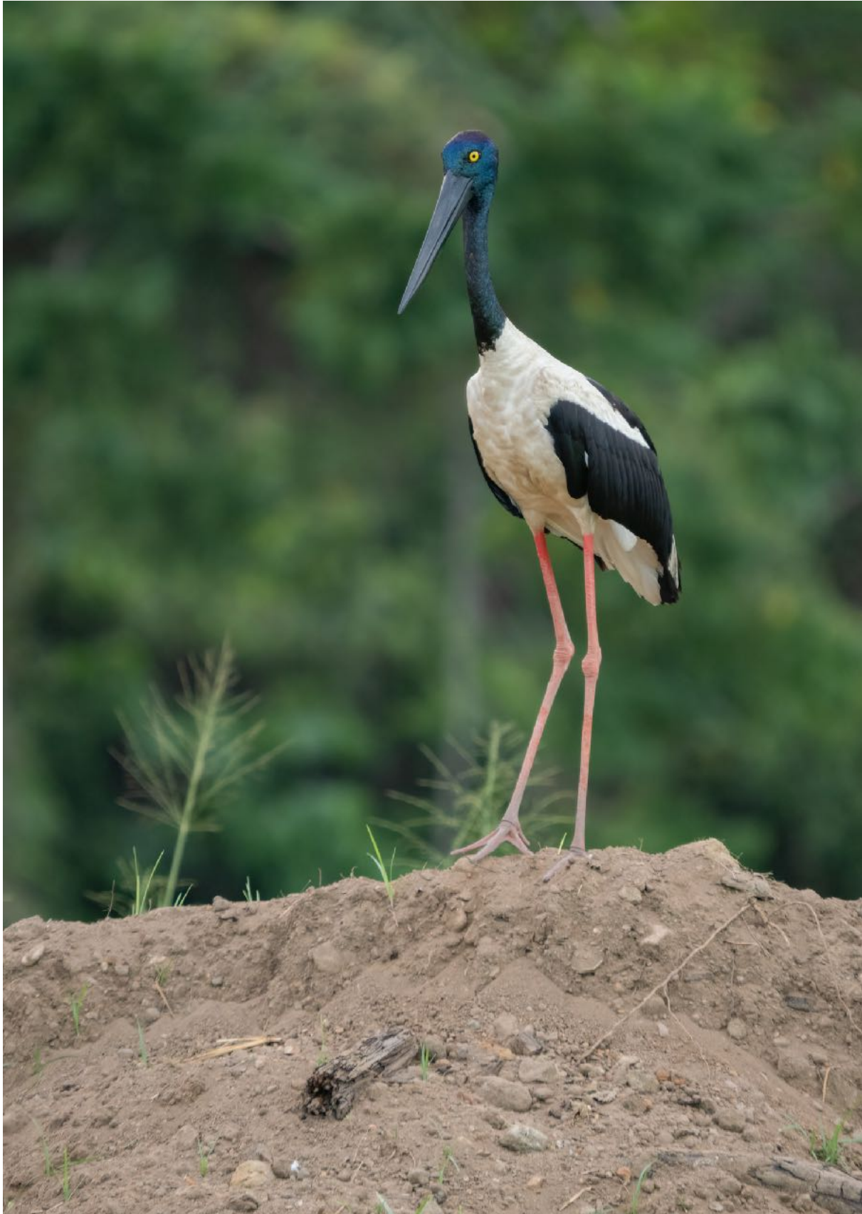
Black-necked Stork