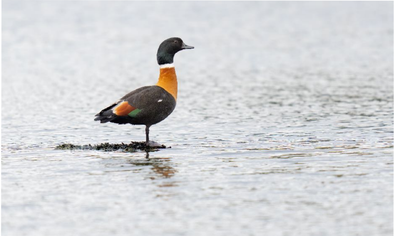
Australian Shelduck