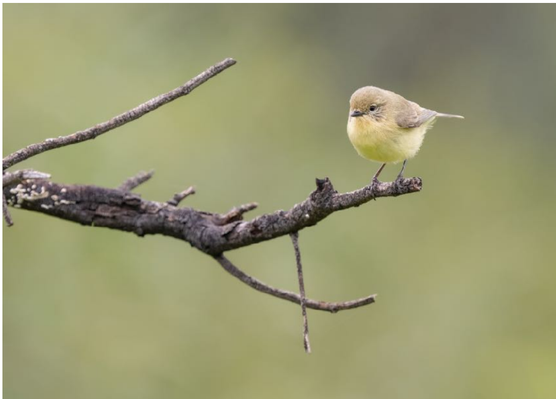
Yellow Thornbill