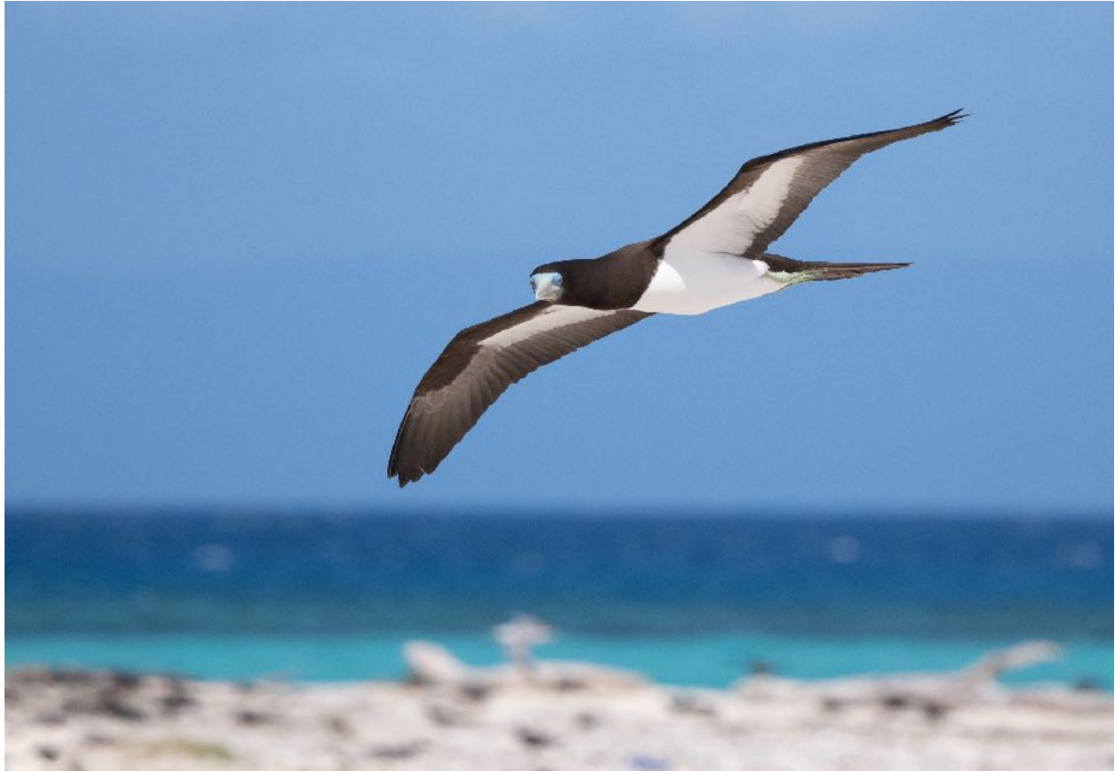
Brown Booby - Photo by guide: Ben Knoop