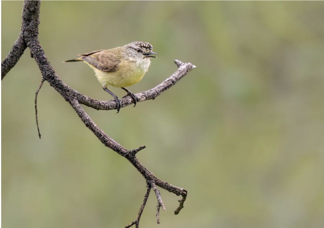
Yellow-rumped Thornbill - Photo by guide: Ben Knot