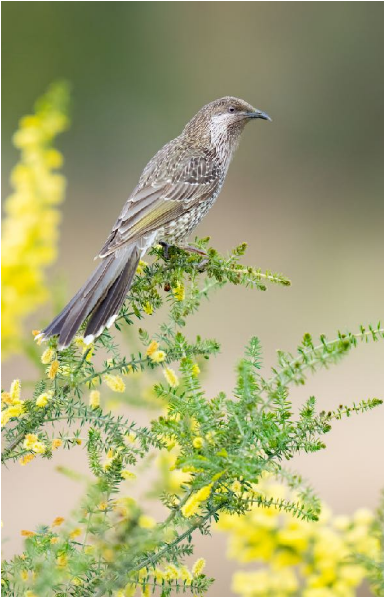
Little Wattlebird

*Many of the guests opted on their own to stay two extra days and I asked them if they'd like to go out and do some more shooting. This is not typical or to be expected on our tours but the following images are just a few more examples of what you may be able to photograph on this tour.