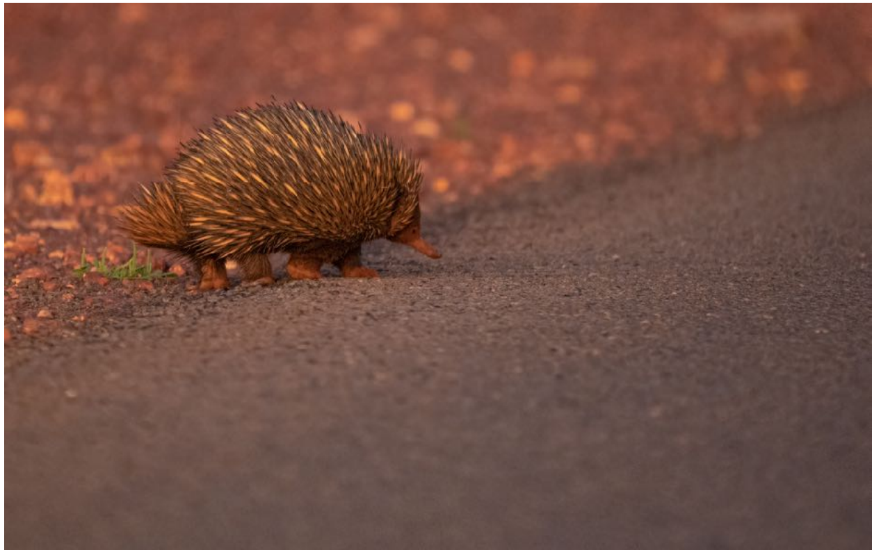
Short-beaked Echidna