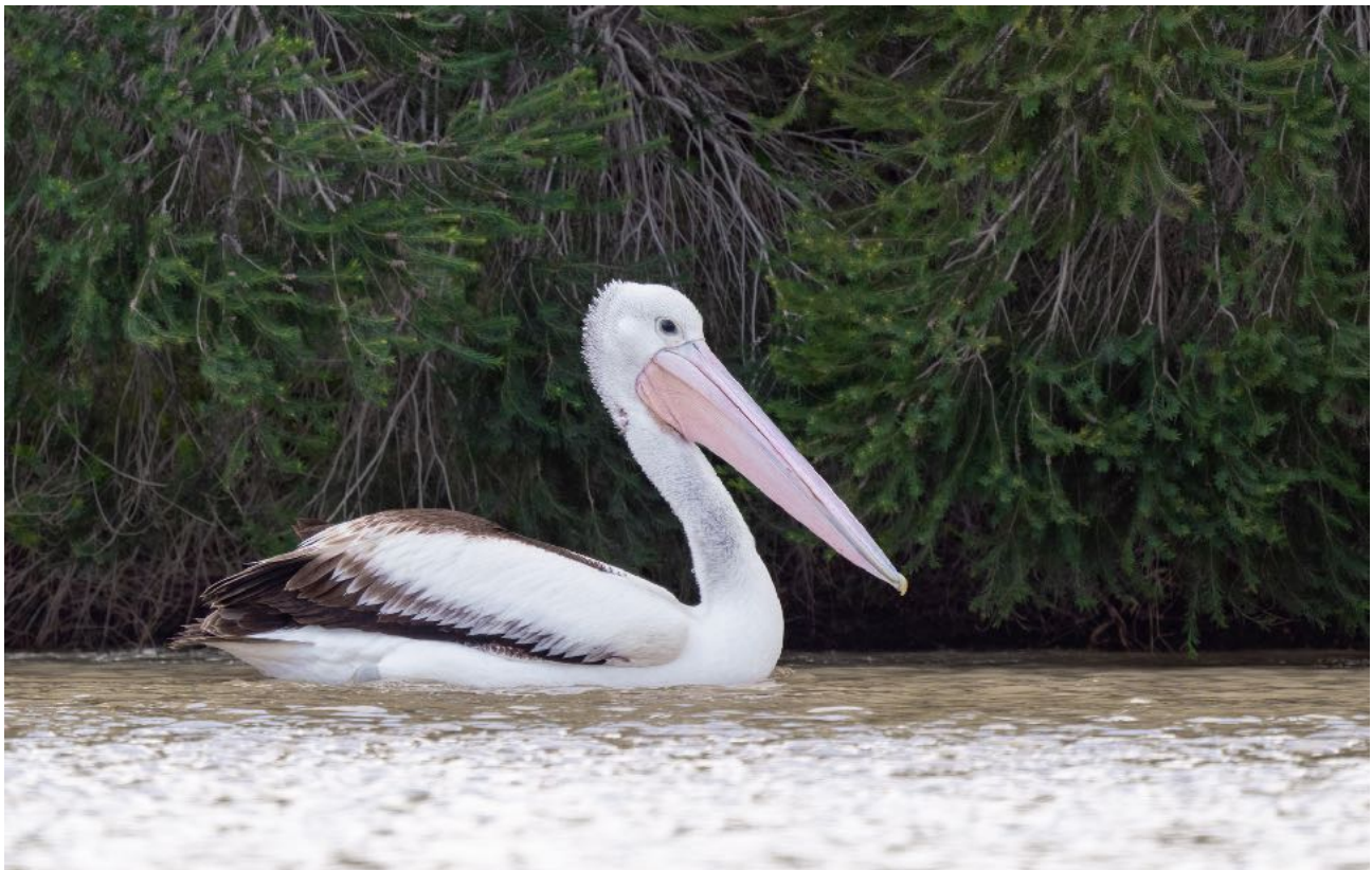
Australian Pelican