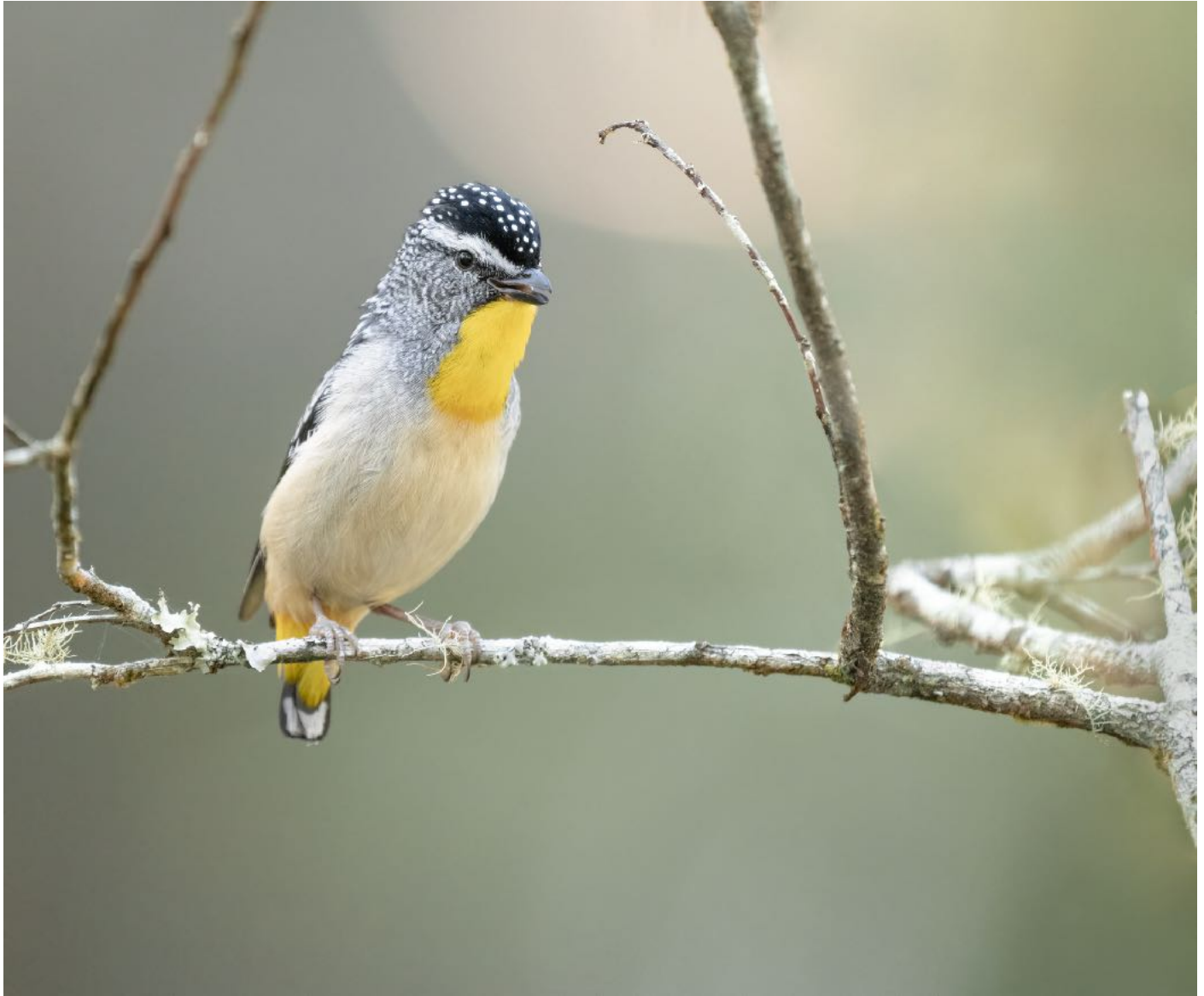
Spotted Pardalote

On the way back towards the parking lot and main birding road, we ran into a cooperative White-throated Treecreeper . The main areas here are the trail, the parking lot and the main road in and out. Again, the forest environments of Australia are pretty tricky to shoot it. It is often very dark and you'll find yourself shooting in high ISO situations and pretty low shutter speeds. In my opinion the photography is really fun but frustrating, which really makes it even more fun, if you like that kind of self-torture - haha. In these various locations, we managed to photograph; Large-billed Gerygone , Gray-headed Robin , Pale-yellow Robin , Yellow-breasted Boatbill , Gray Fantail , Bridled Honeyeater and one member of the group who spent some alone time managed to photograph a Golden Bowerbird .