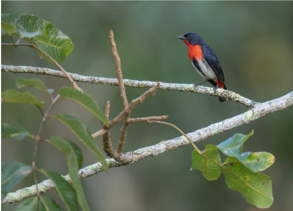
Mistletoebird - Photo by guide: Ben Knoot

We then went up Lake Morris Road to see if we could photograph any forest specialties. We managed some good birds but highlights included; Fairy Gerygone , Yellow-spotted Honeyeater and Pied Monarch .