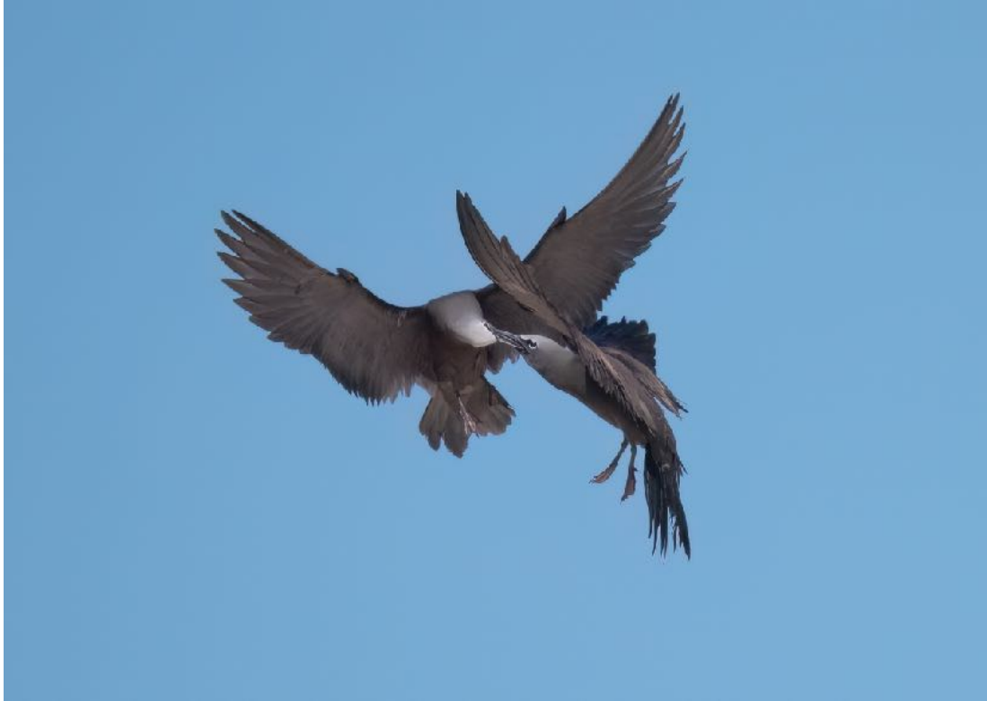
Brown Noddy