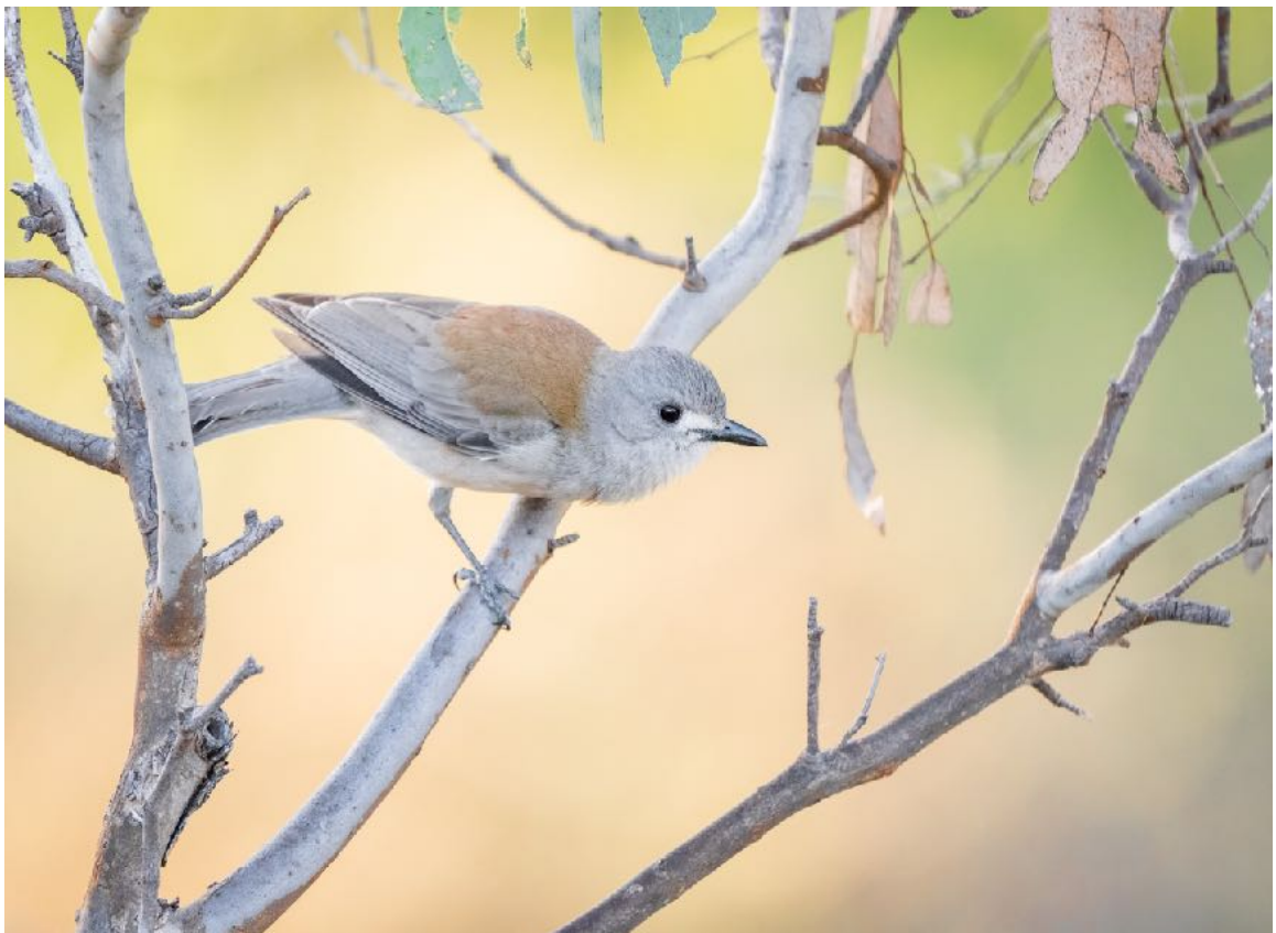
Gray Shrike-thrush