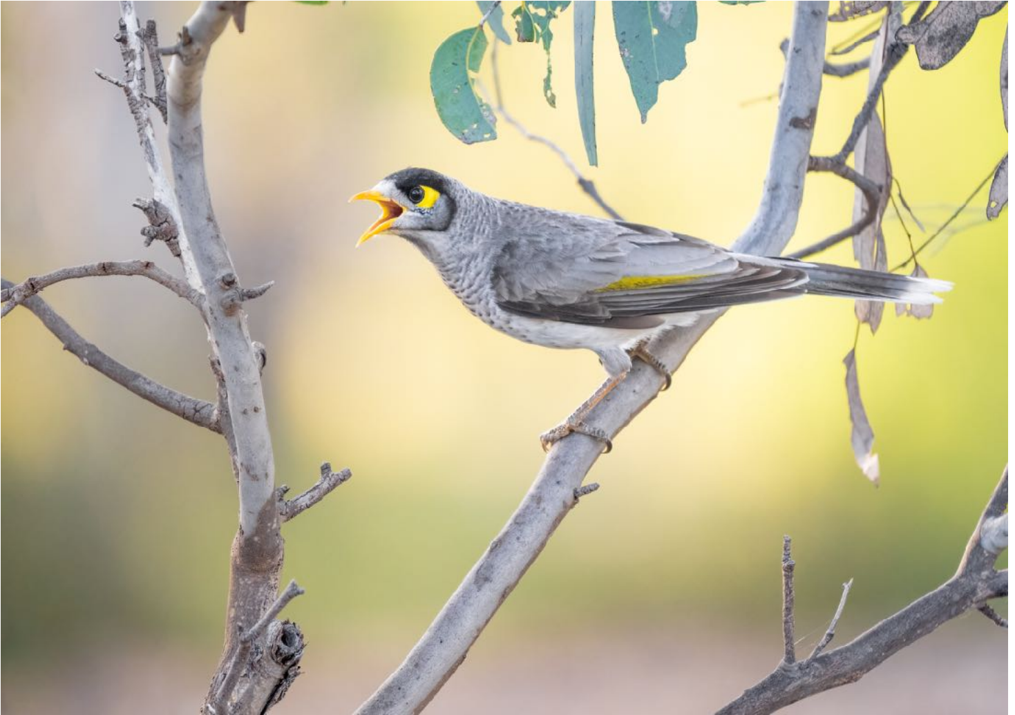
Noisy Miner

We finished here and then took one of our longest drives of the trip. We traveled towards Cunnamulla and from here on out, we would be shooting many species. This is perhaps the most photographic section of the tour. We would travel through Mulga, Grasslands and heaps of recently flooded fields. It was a truly remarkable portion of our journey as we witnessed hundreds and thousands of birds taking advantage of the newly flooded fields and flowering trees. I have never seen this territory so green and alive...it was a truly amazing and beautiful spectacle and the birdlife equally impressed! On the way into Cunnamulla, we photographed; Noisy Friarbird, Little Friarbird, Yellow-throated Miner, Crested Pigeon, Black-tailed Native-hen, Rufous Songlark, Maned Duck, Wedge-tailed Eagle, Restless Flycatcher , and we weren't able to photograph but we did see a Spotted Bowerbird . All the while, we were keeping on eye out for Echidna along the roadside. I can't quite remember if we saw any on this night but never fear reader...you're in for a shock if you continue!