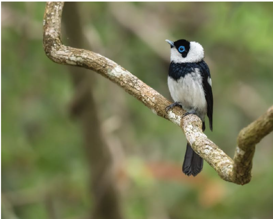
Pied Monarch - Photo by guide: Ben Knoot