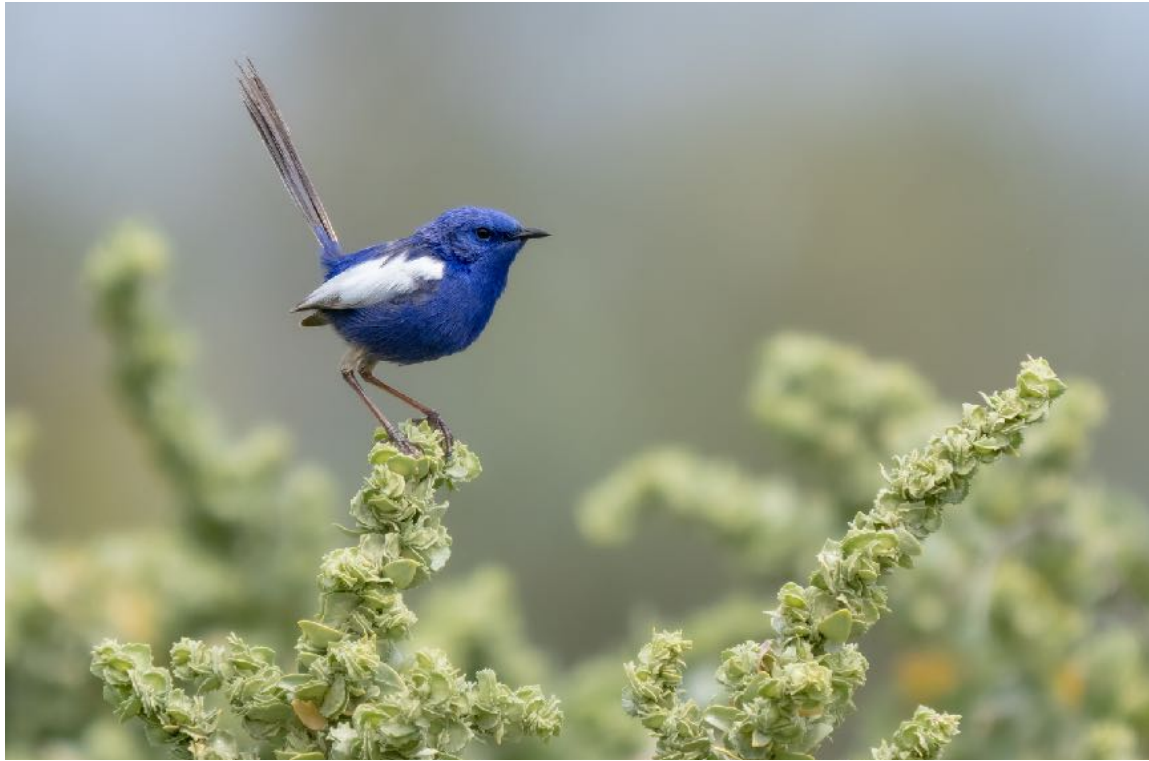
White-winged Fairy-wren