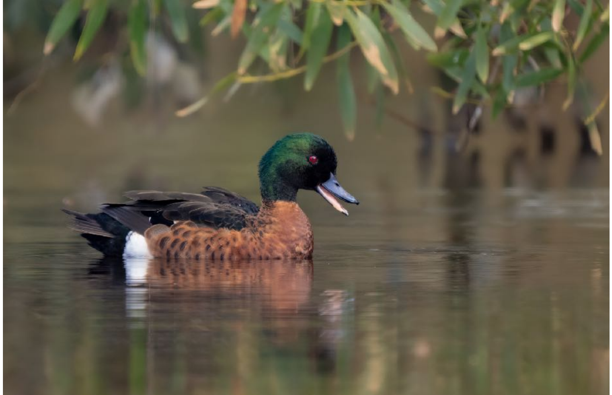
Chestnut Teal