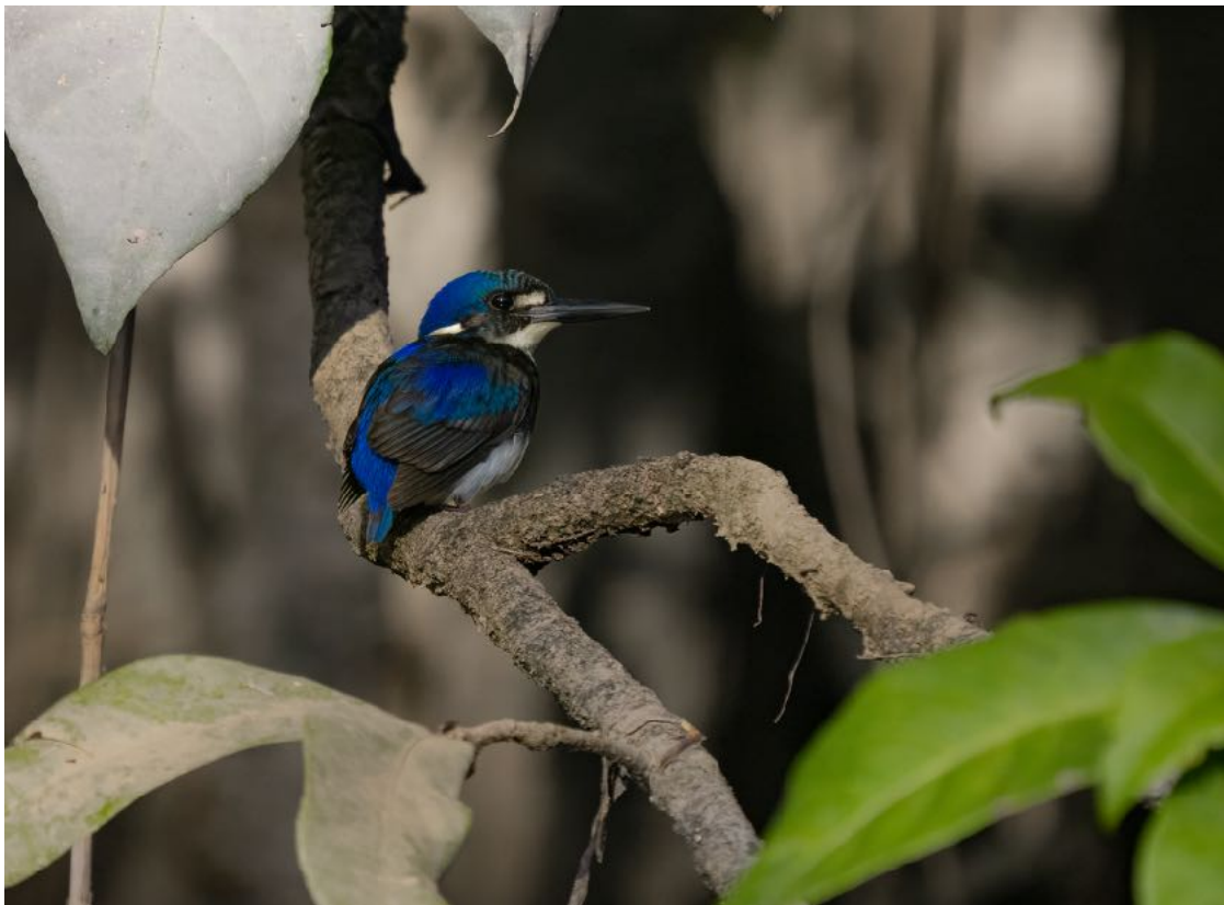
Little Kingfisher