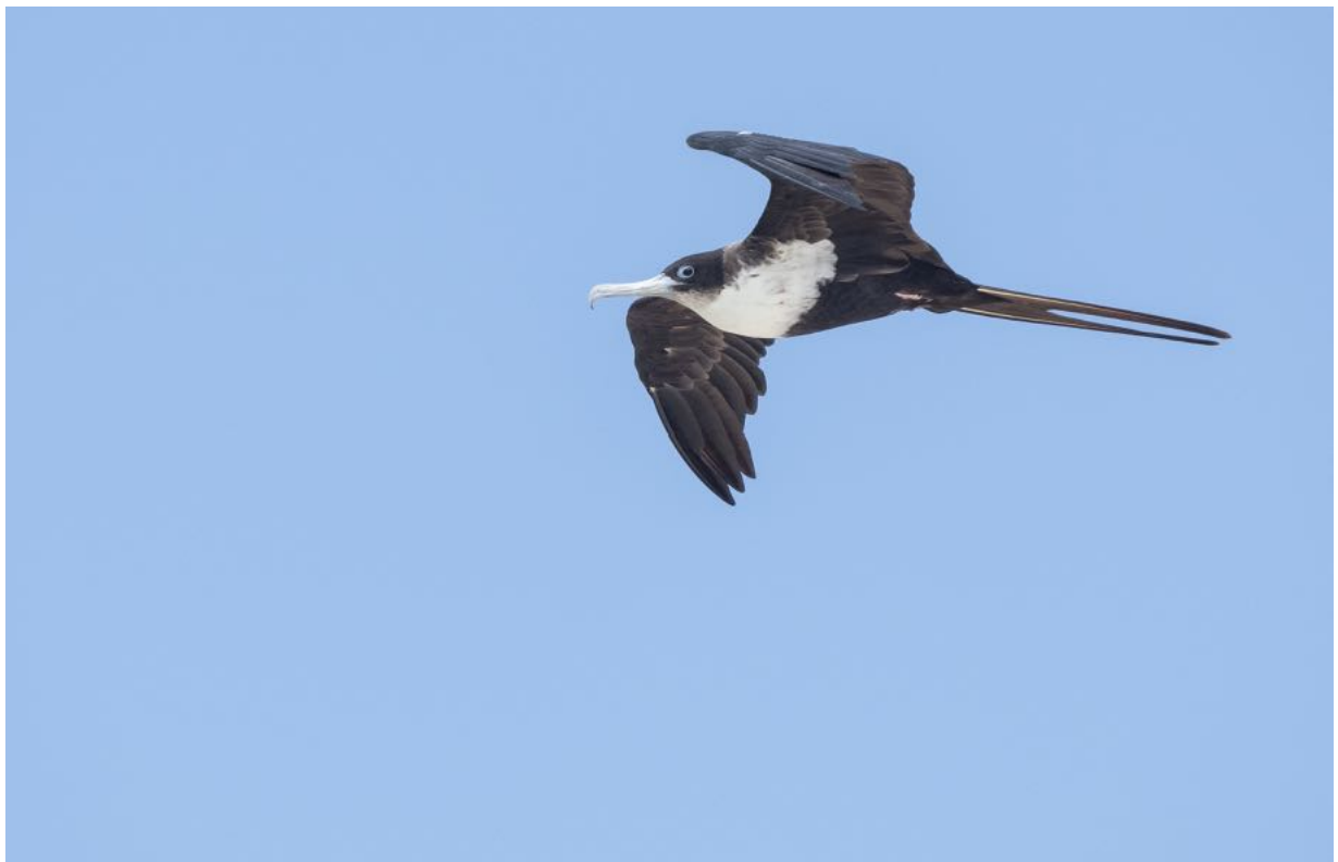
Great Frigatebird