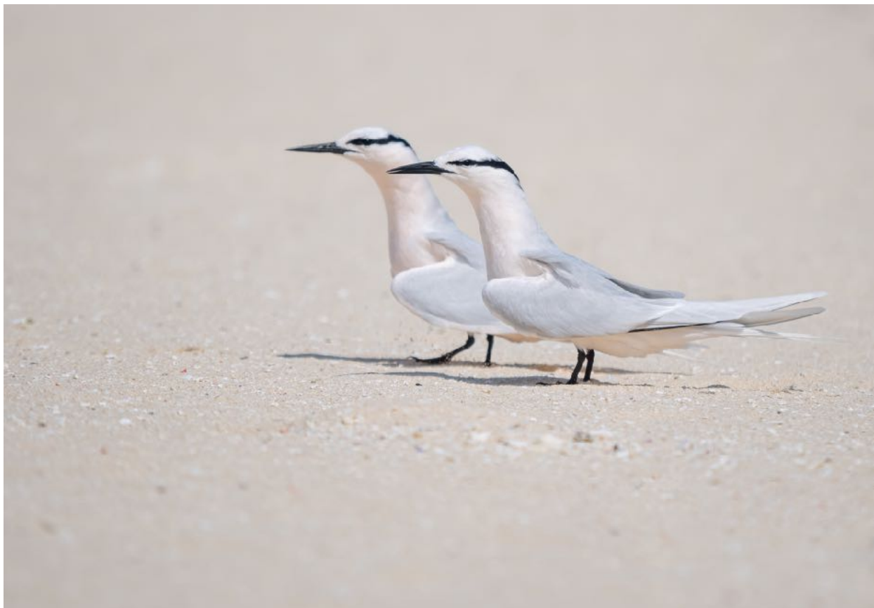
Black-naped Tern - Photo by guide: Ben Knoot