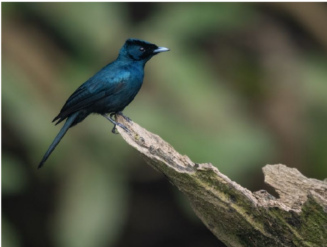
Shining Flycatcher