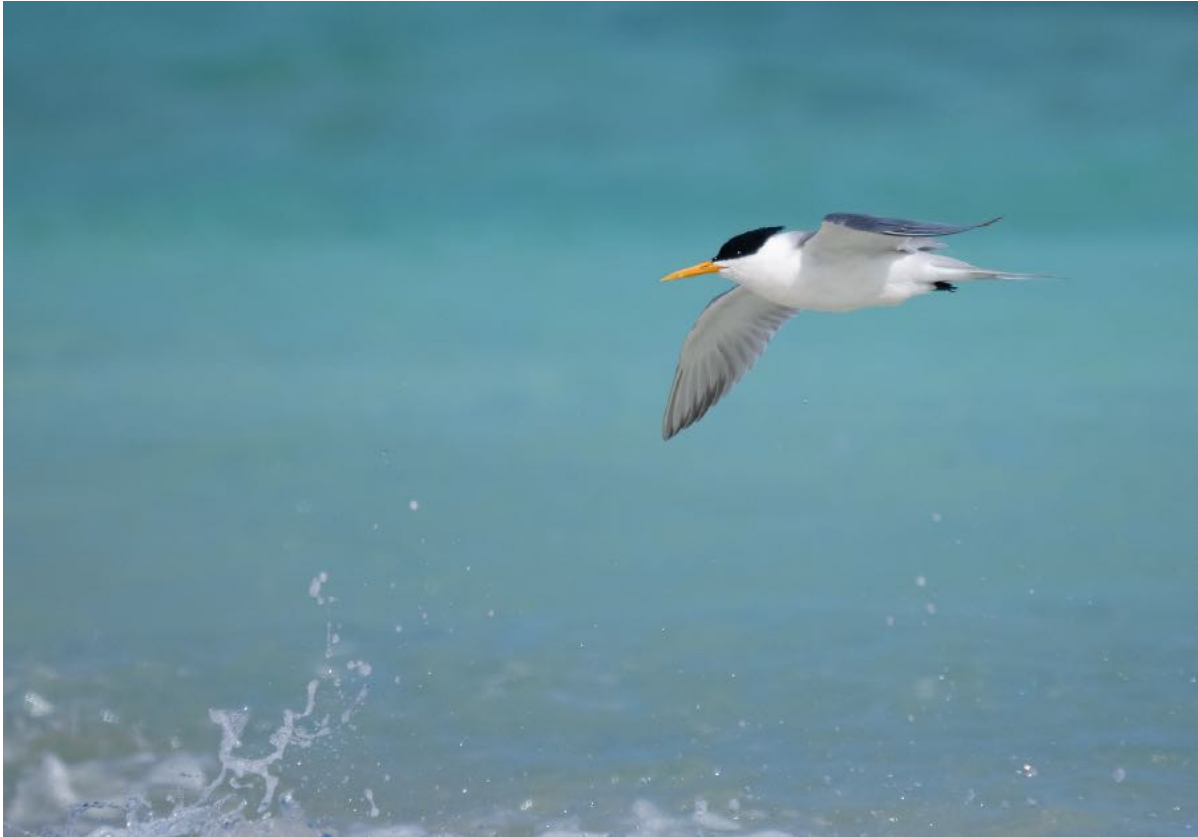
Lesser-crested Tern