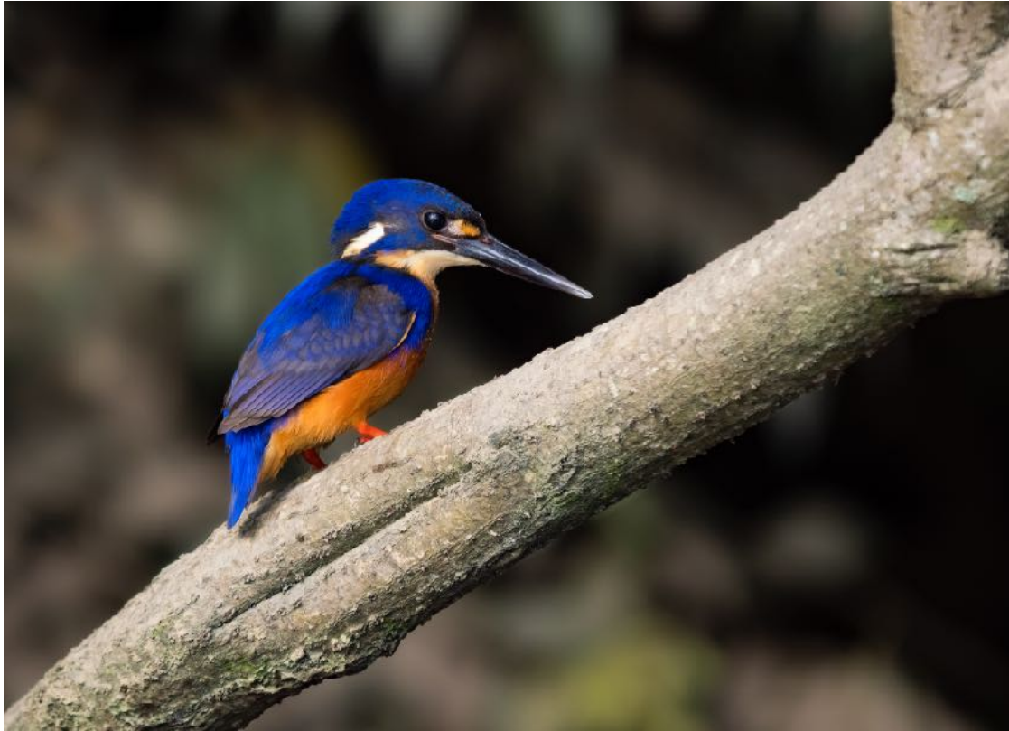
Azure Kingfisher