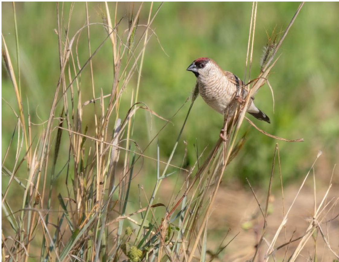
Plum-headed Finch