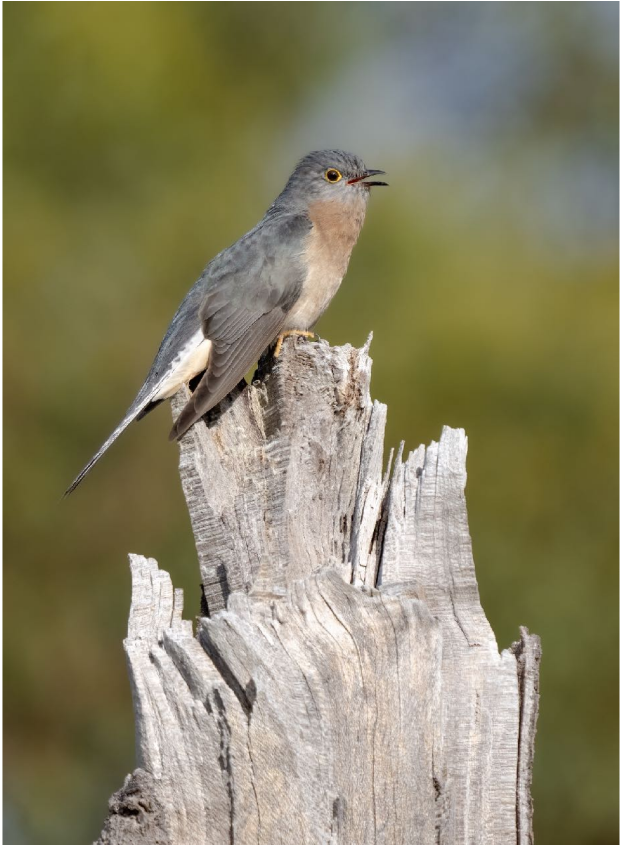
Fan-tailed Cuckoo - Photo by guide: Ben Knoot