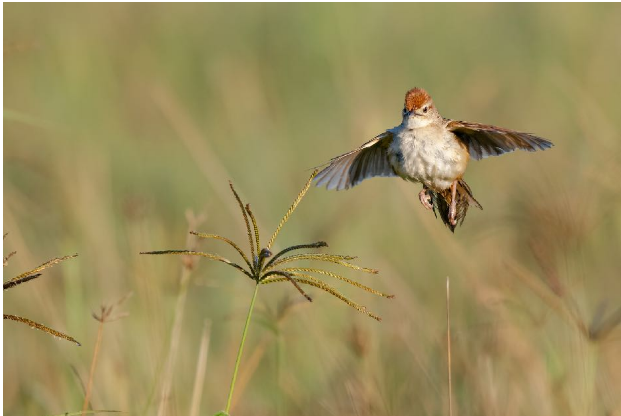
Tawny Grassbird