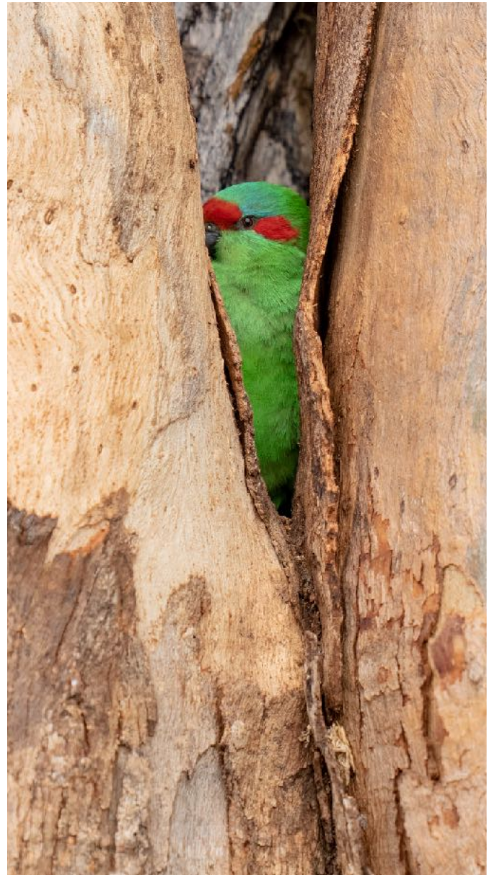
Musk Lorikeet