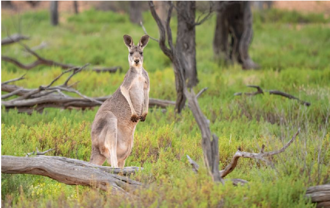
Red Kangaroo (female)

Today we visited Eulo Bore once more to try and have even more success. The morning was indeed a bit slower but we added; Pink Cockatoo , Little Eagle , Striped Honeyeater , Singing Honeyeater and Red Kangaroo to our growing list.