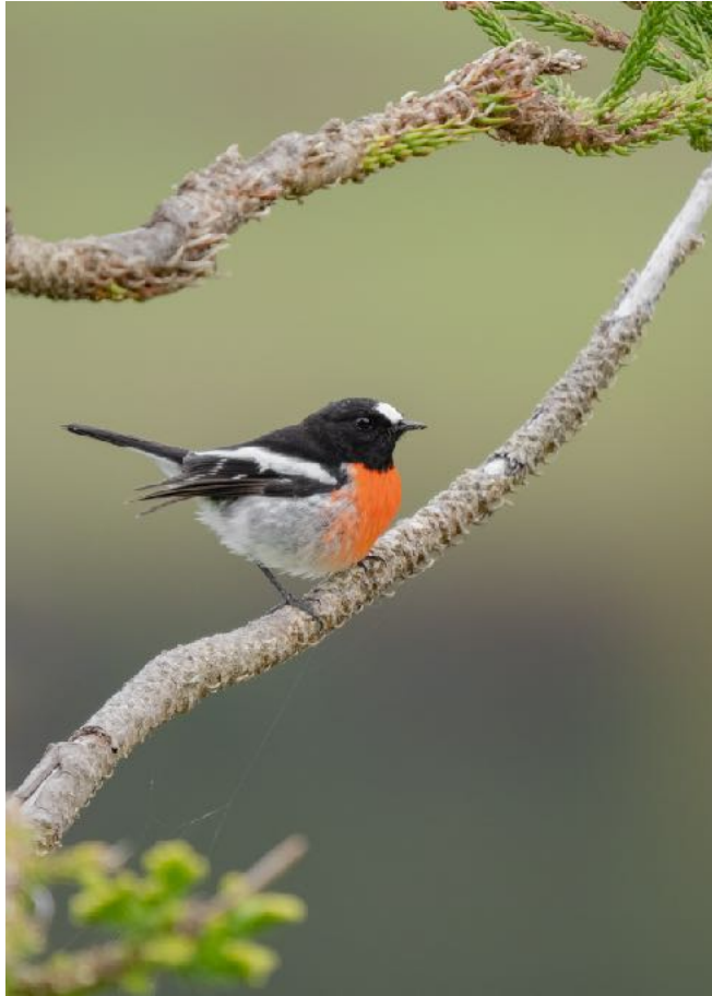
Scarlet Robin