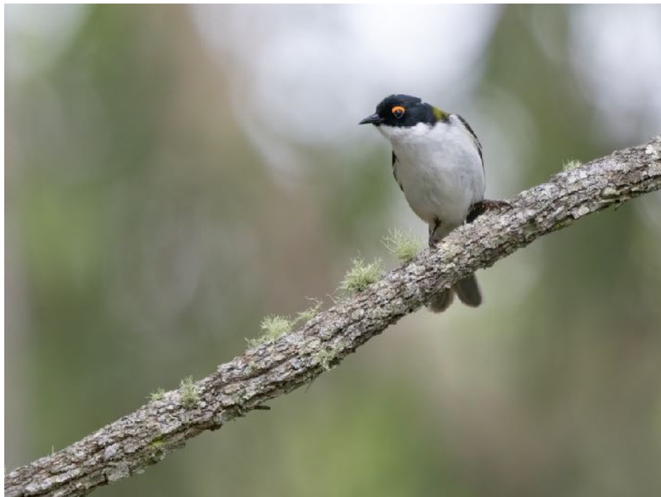
Painted Honeyeater