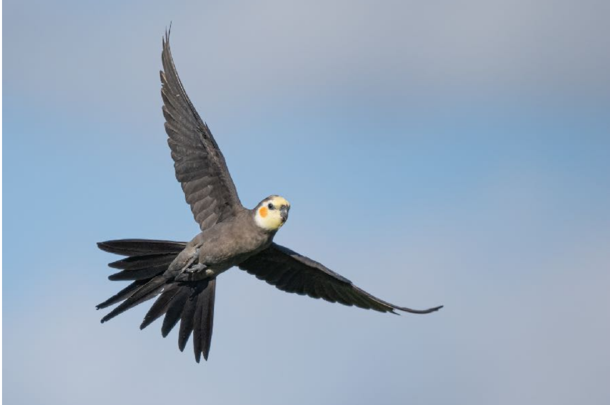
Cockatiel - Photo by guide: Ben Knoot