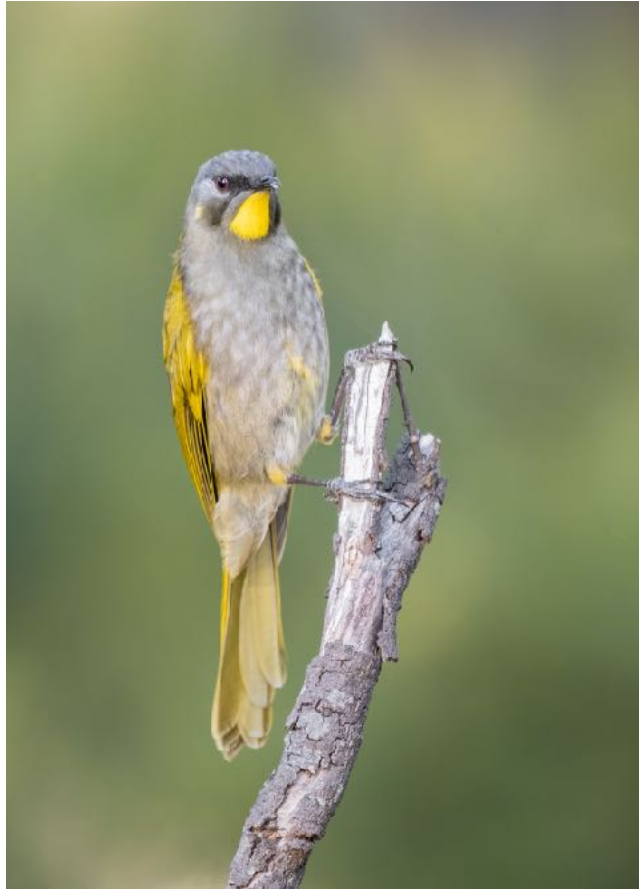
Yellow-throated Honeyeater