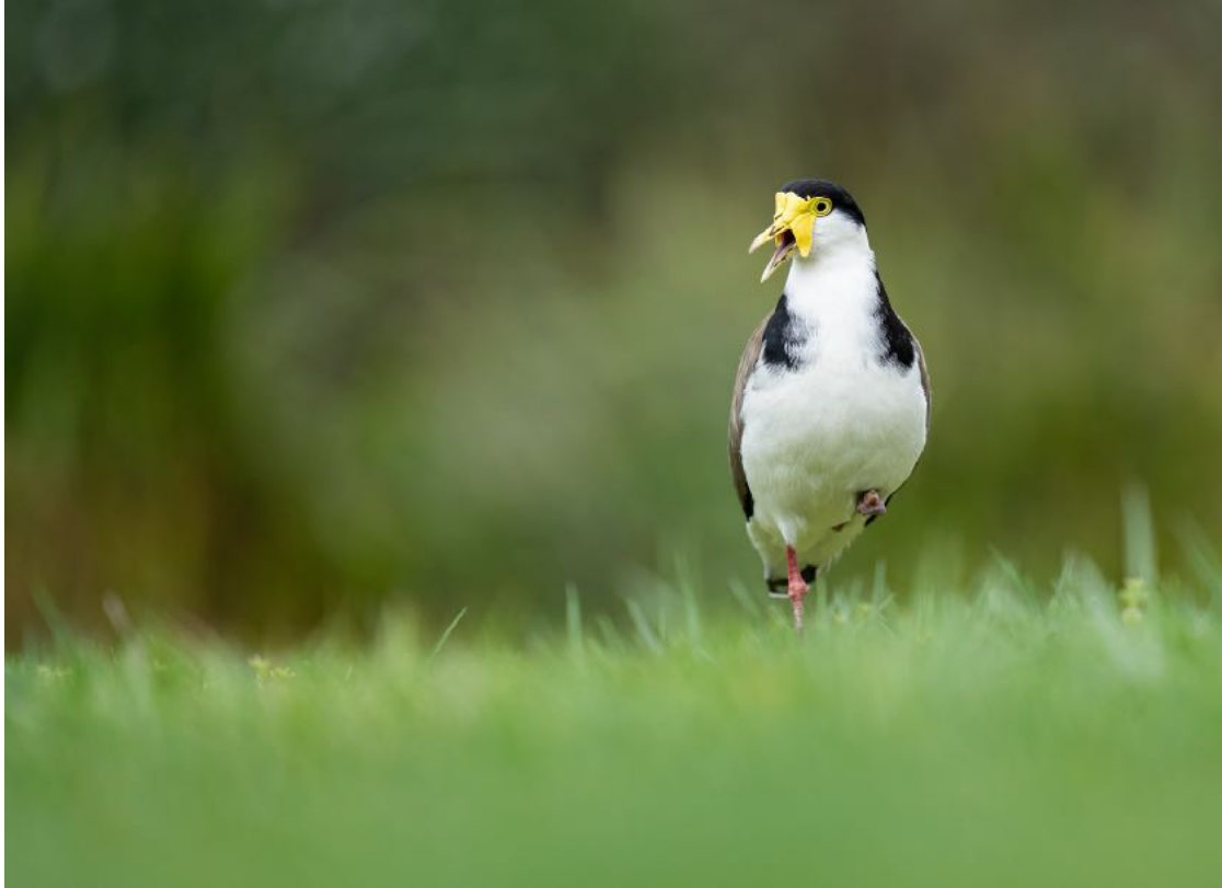
Masked Lapwing