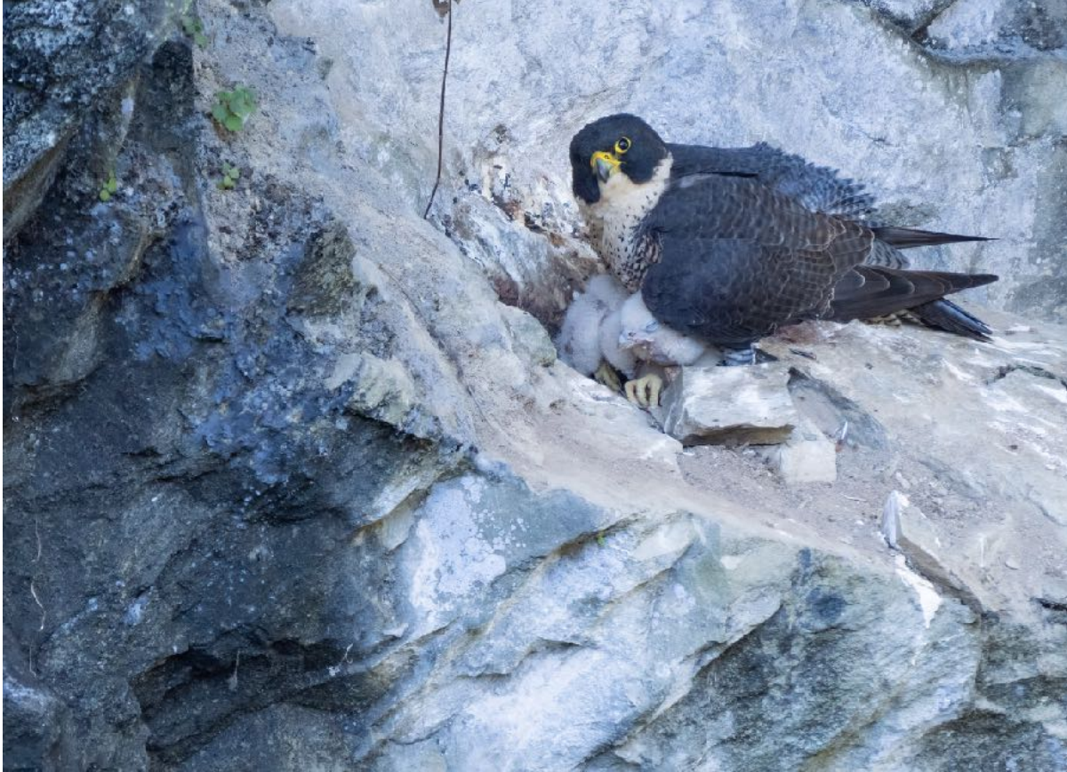
Peregrine Falcon

Our next stop was Mount Hypipamee . First things first, we wanted to get over to “The Crater” to see this years nesting Peregrine Falcon . Both parents were hanging around and the chicks were squirming around the rocky cliff edge. We hung out there for a minutes and enjoyed the loving family moments.