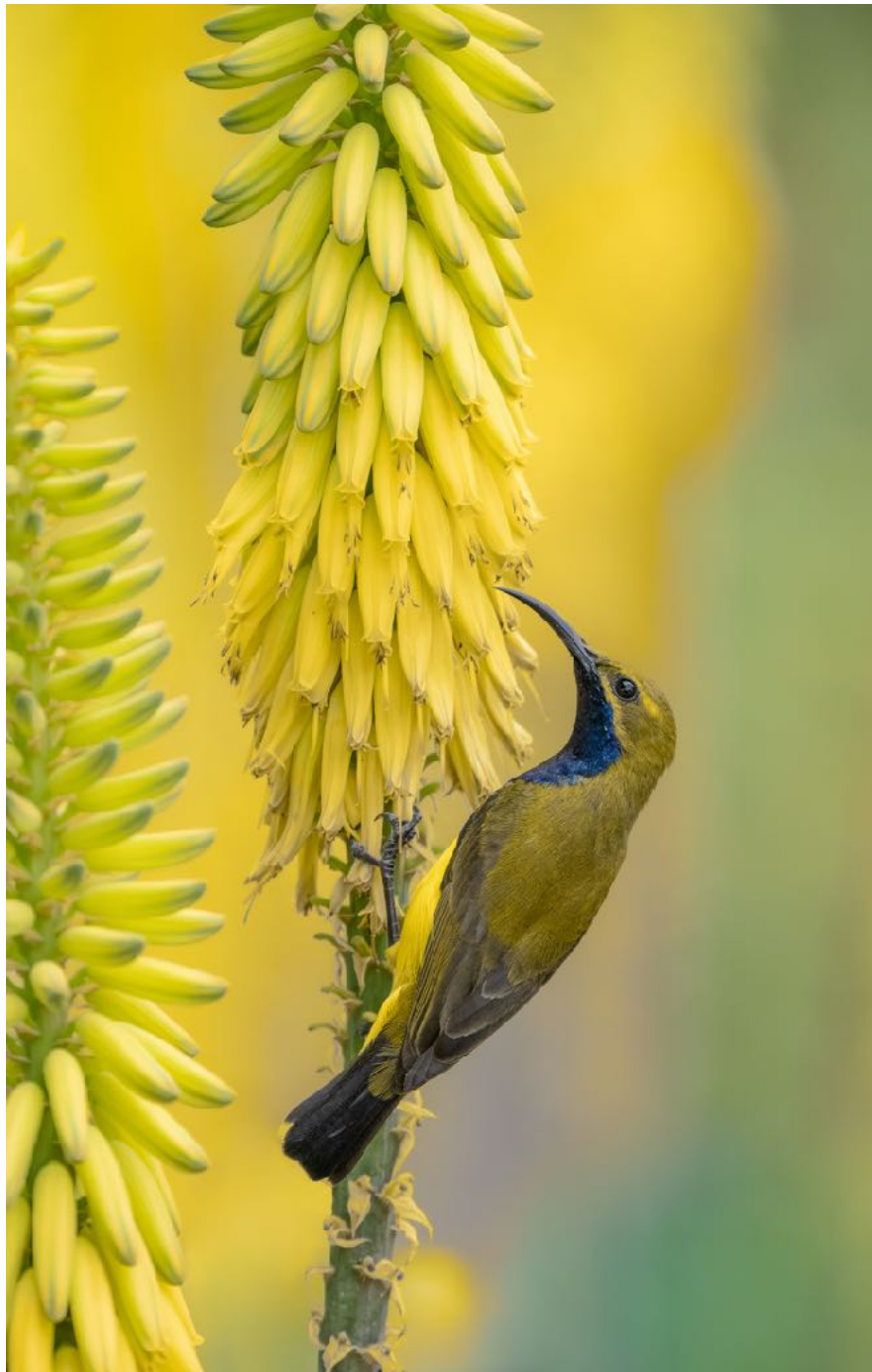
Olive-backed Sunbird - Photo by guide: Ben Knoot

After we concluded our shoot here, we traveled back through Mount Molloy . Here we had a fun shoot with Olive-backed Sunbird and Blue-faced Honeyeater .