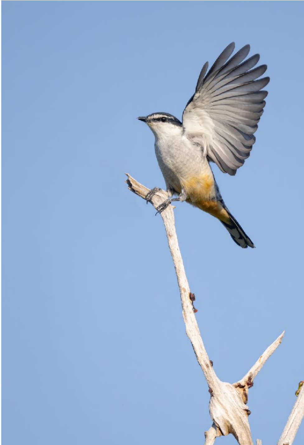
Varied Triller

We began the morning by looking for one of the hardest fairywren species of our tour, the Lovely Fairywren. We went to Machans Beach and trails and though we found a nice family unit, we were unable to get photographs. We did however manage some great photos of Mistletoebird and Varied Triller .