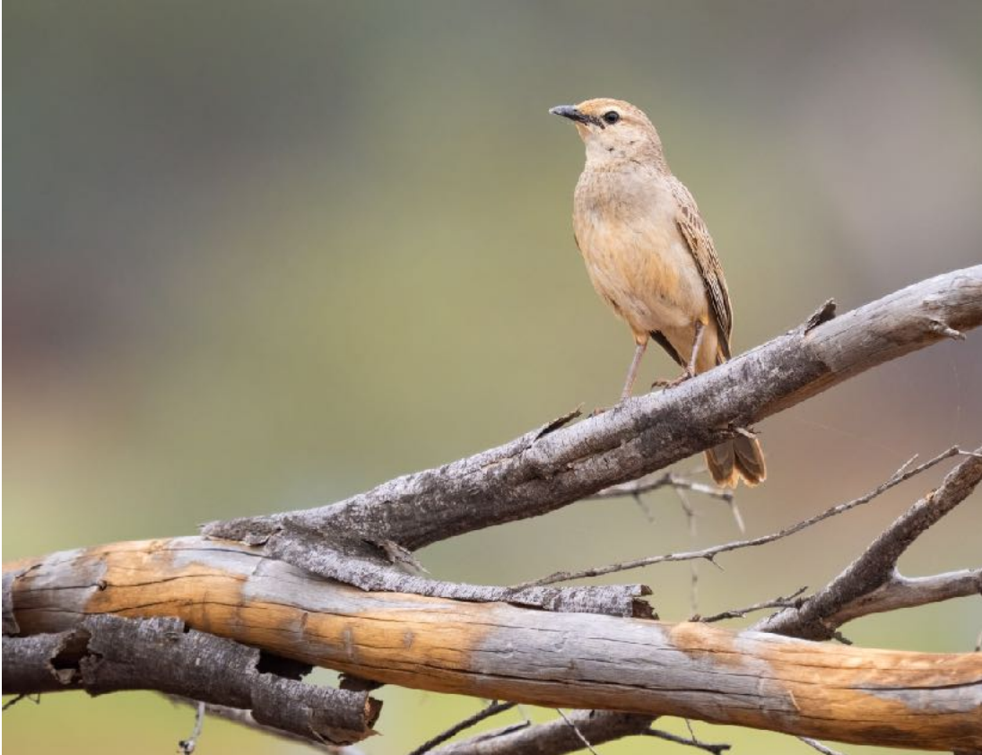
Rufous Songlark