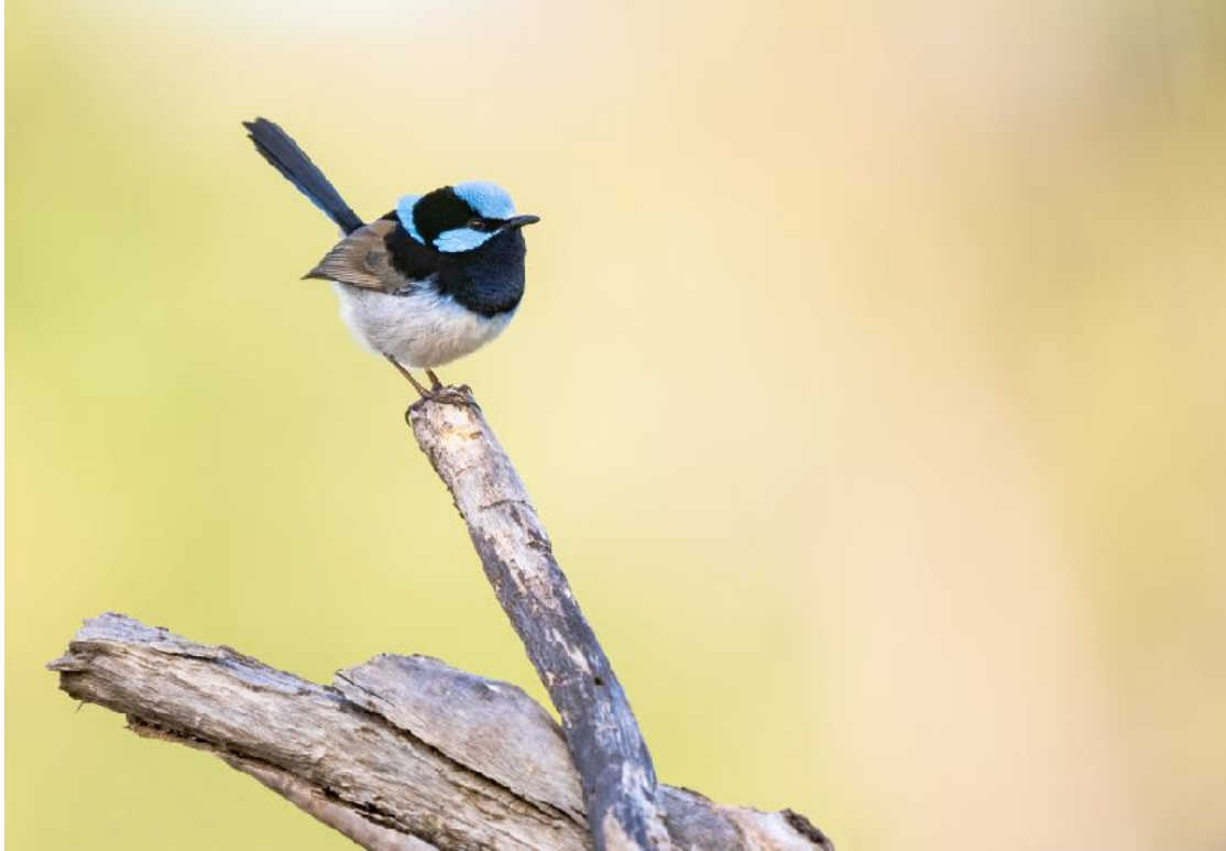
Superb Fairy-wren