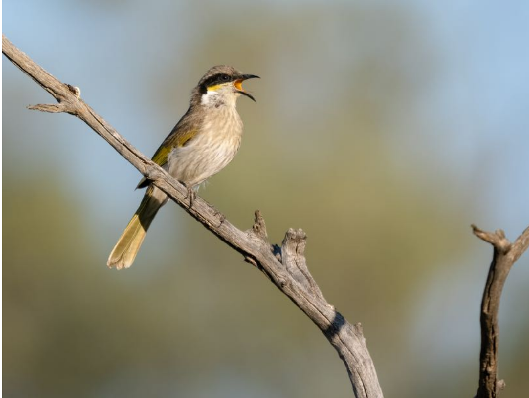
Singing Honeyeater