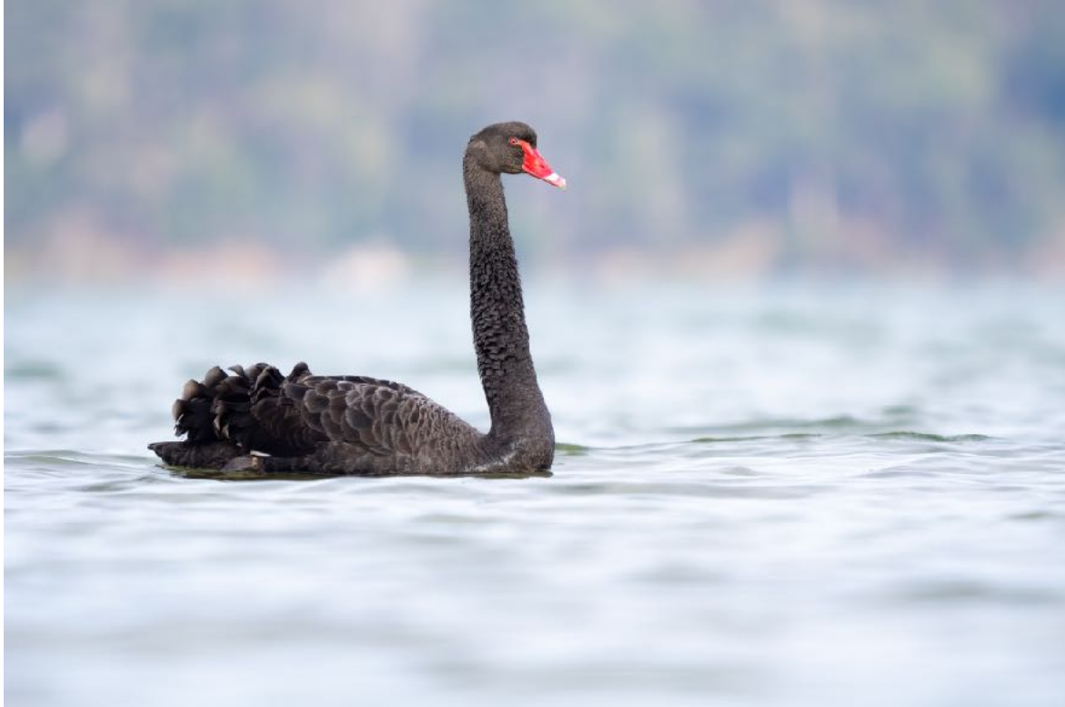
Black Swan