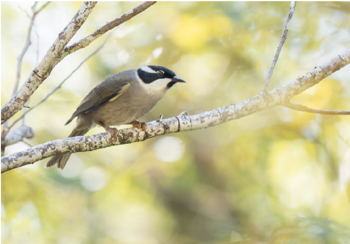
Strong-billed Honeyeater