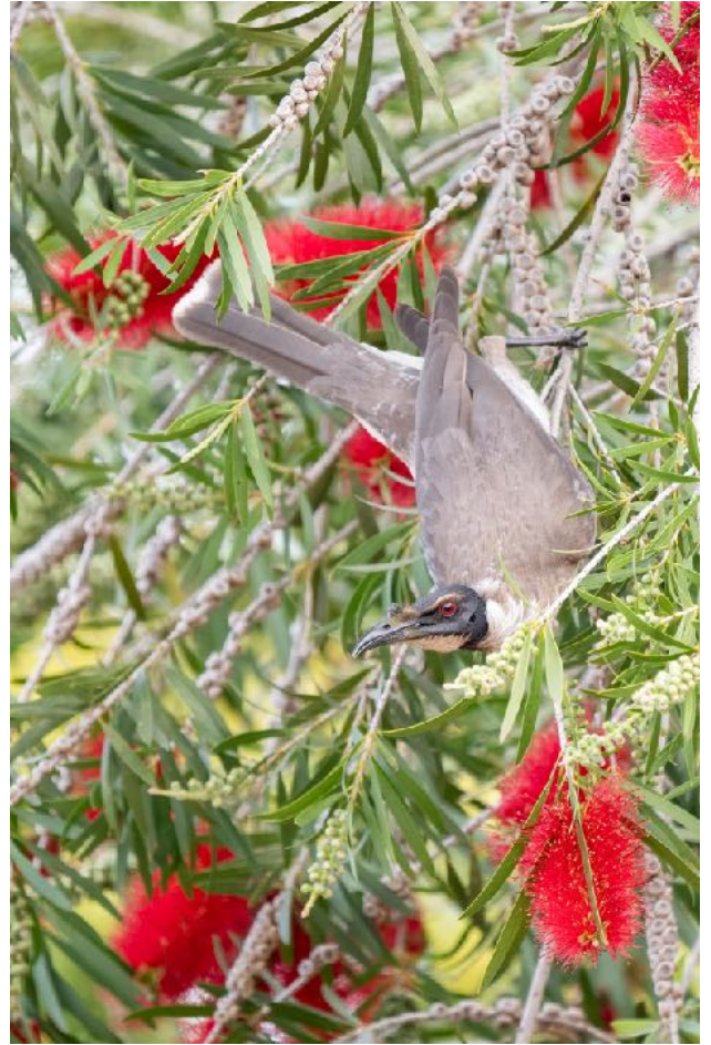
Noisy Friarbird