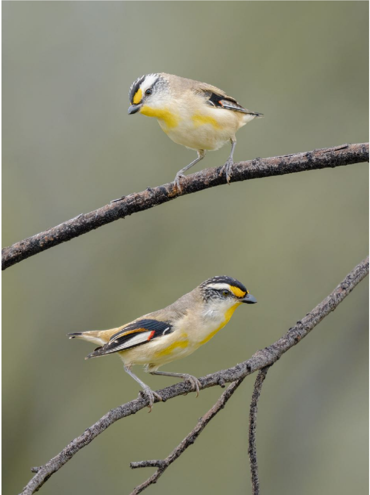
Striated Pardalote