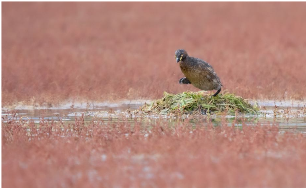
Australasian Grebe