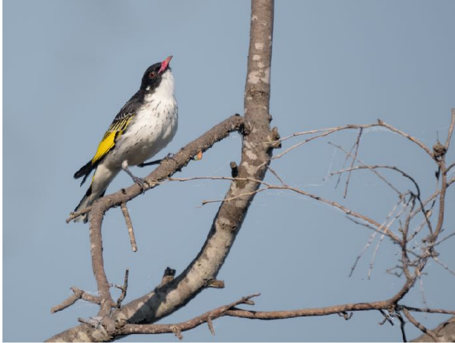
Painted Honeyeater

We had one target around Dalby, the stunning Painted Honeyeater. Upon our arrival to a row of flowering trees, I heard the unmistakable call of our quarry, not one but two beautiful Painted Honeyeater graced us with their presence. They were reasonably cooperative but just wouldn't come down the last 5ft we needed. We still managed some decent shots!