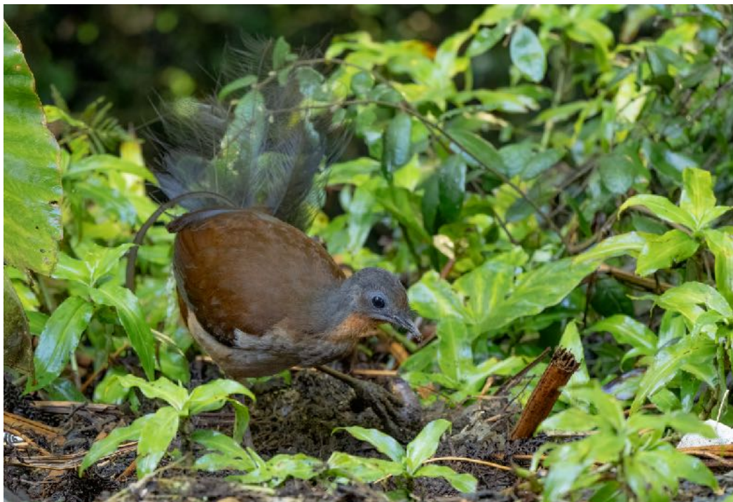
Albert's Lyrebird