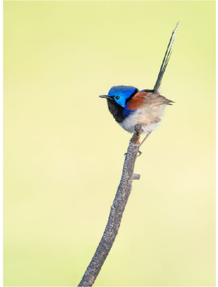
Purple-backed Fairy-wren