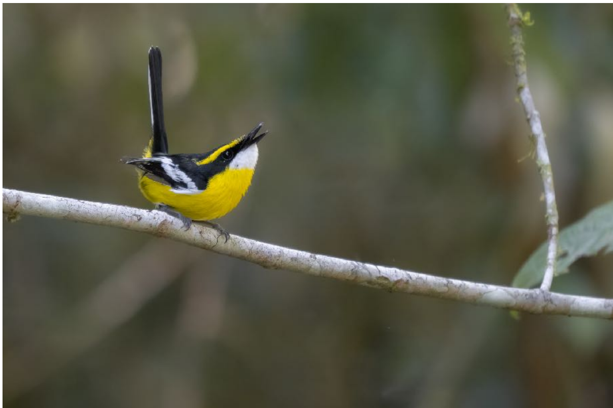
Yellow-breasted Boatbill