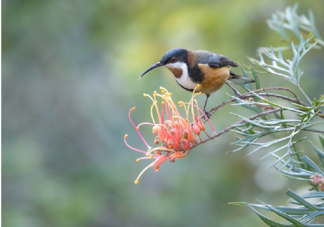
Eastern Spinebill