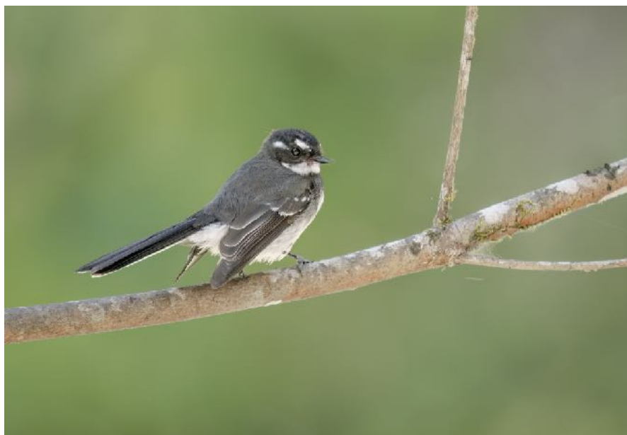
Gray Fantail