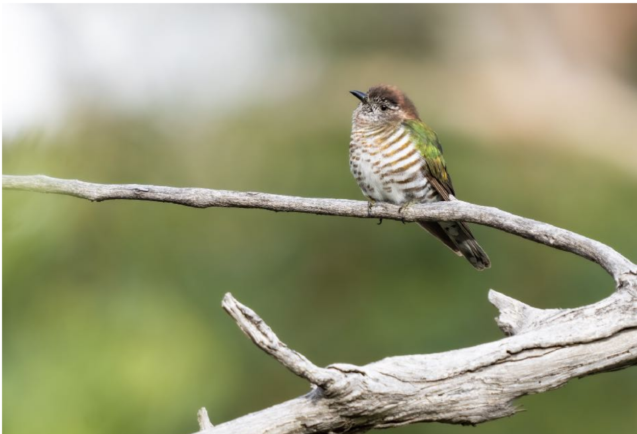
Shining-bronze Cuckoo