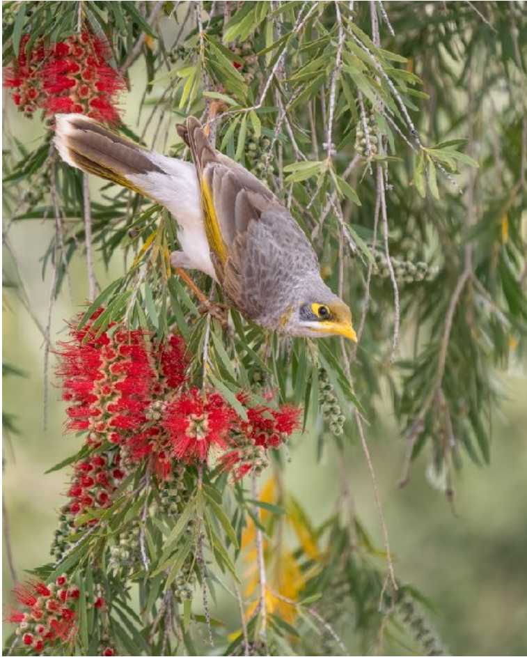
Yellow-throated Miner