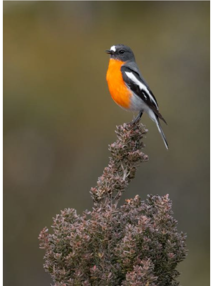
Flame Robin