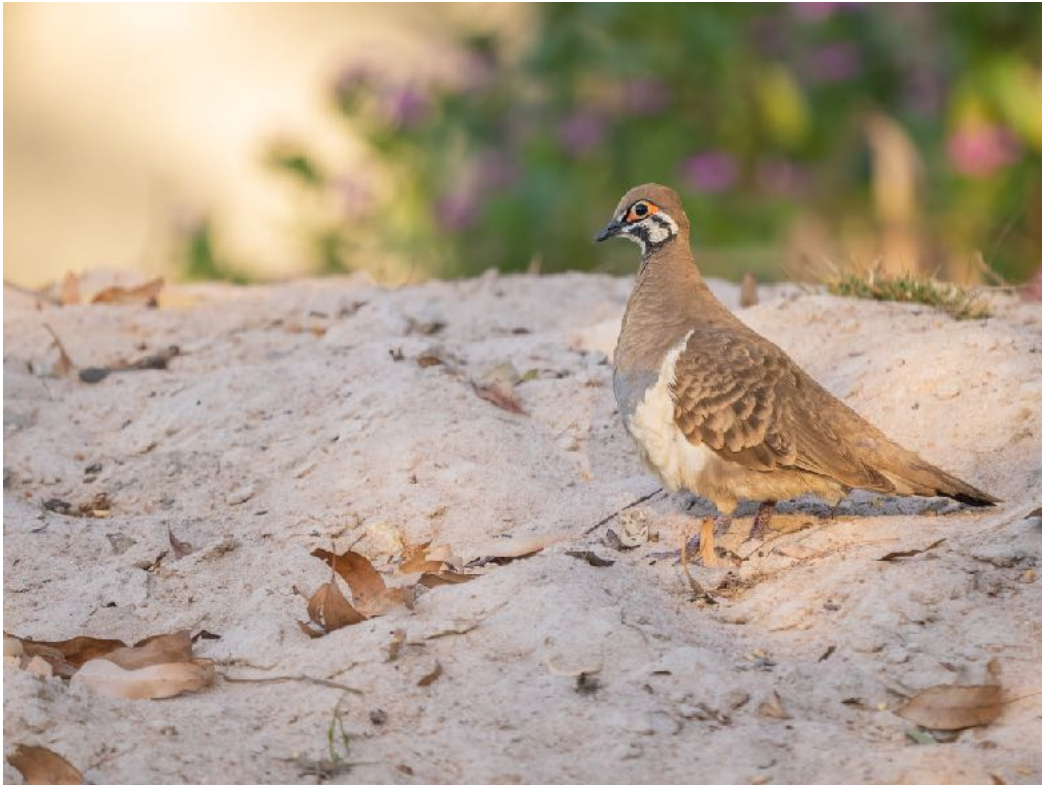
Squatter Pigeon

The afternoon was spent at Granite Gorge Nature Park . Here we photographed Squatter Pigeon , Crested Pigeon , Laughing Kookaburra , Australian Brush Turkey and of course, the adorable little Mareeba Rock Wallaby .