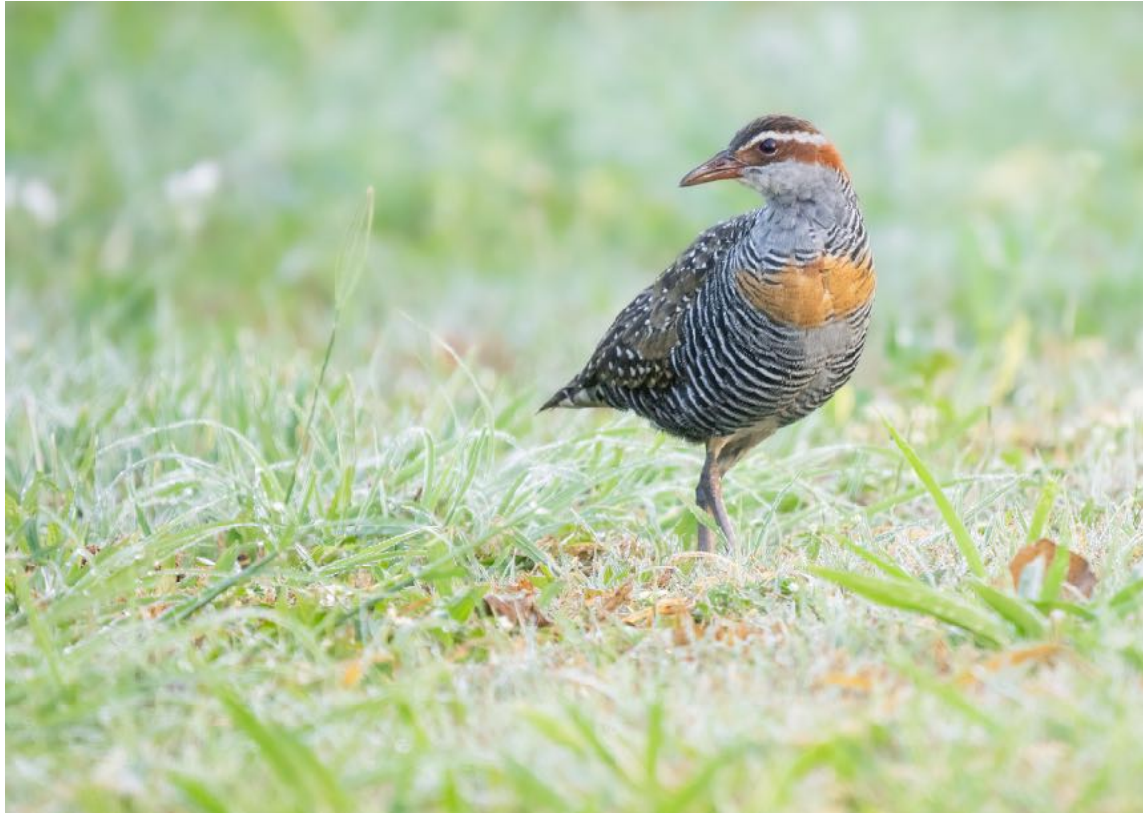
Buff-banded Rail - Photo by guide: Ben Knoot