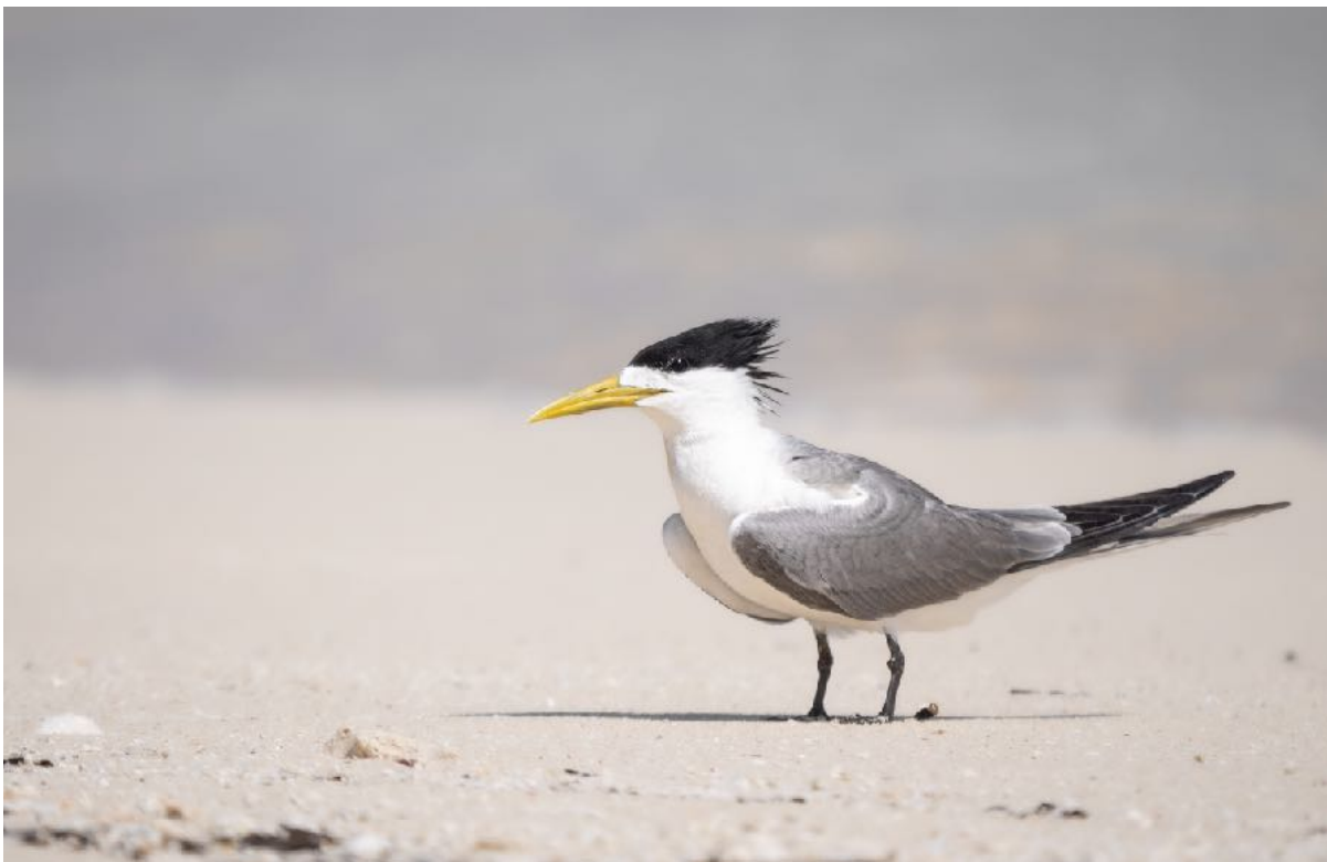
Great-crested Tern