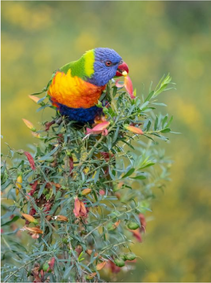
Rainbow Lorikeet