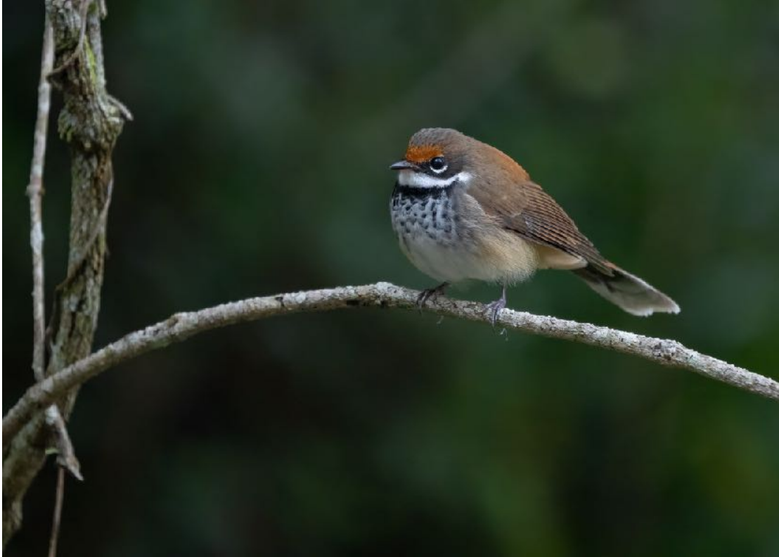
Rufous Fantail