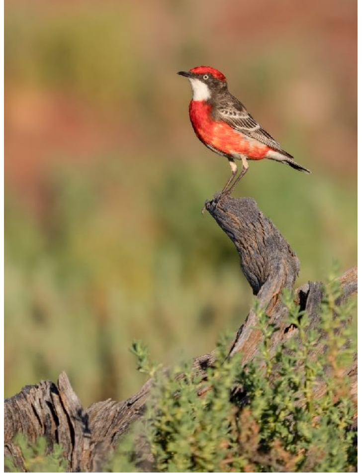
Crimson Chat - Photo by guide: Ben Knot