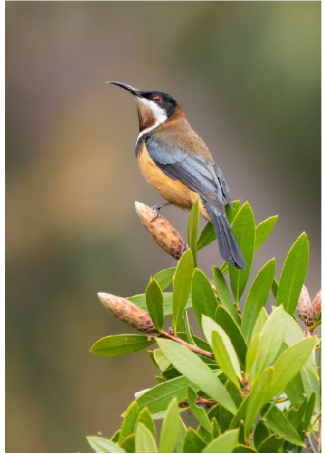
Eastern Spinebill