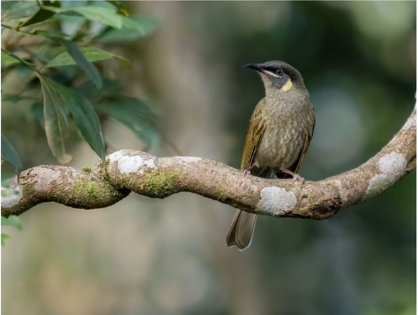
Lewin's Honeyeater - Photo by guide: Ben Knot