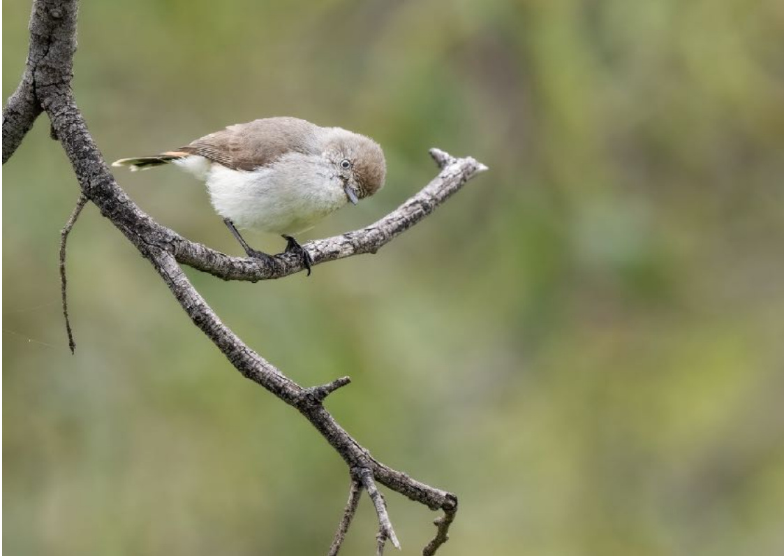
Chestnut-rumped Thornbill