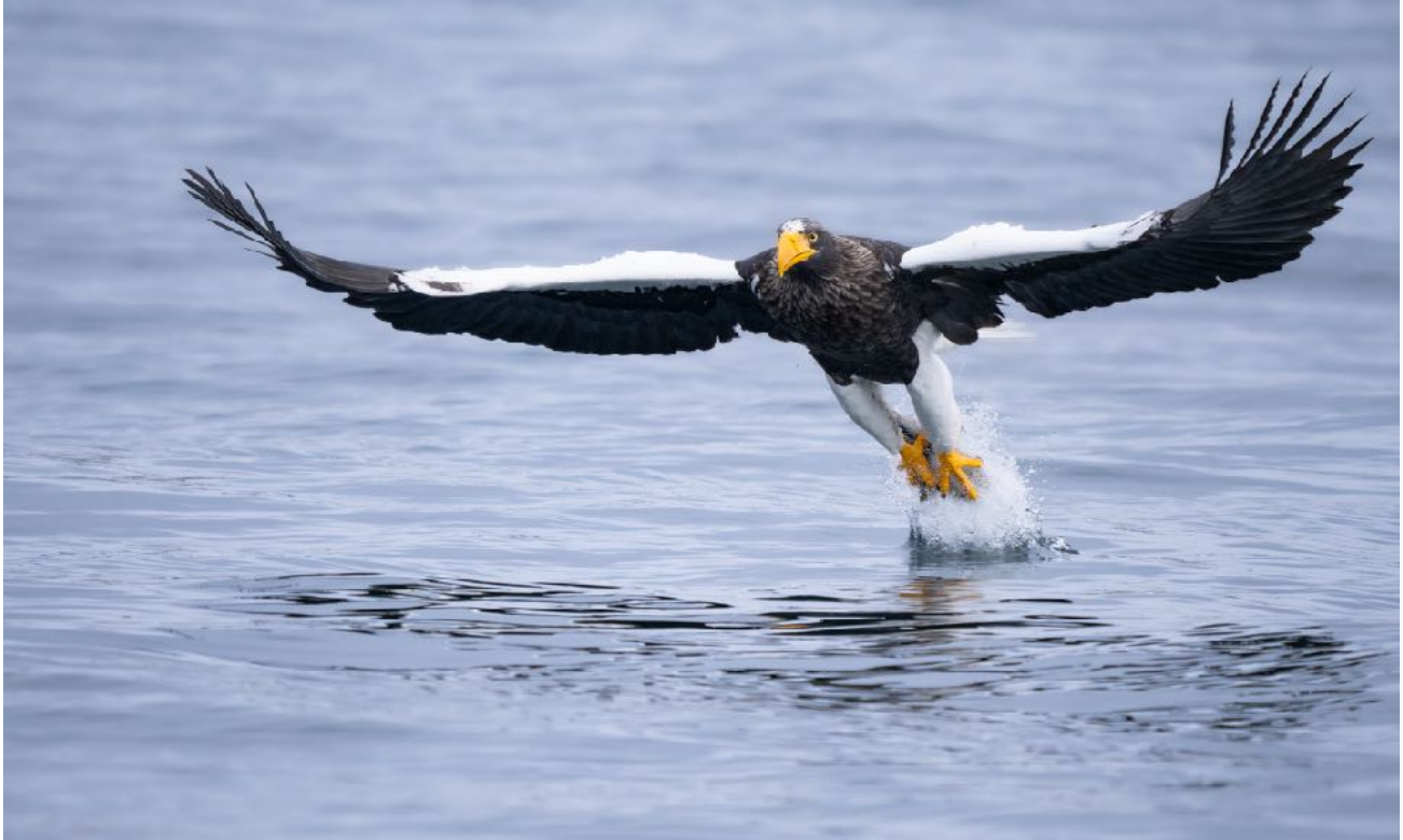
Steller's Sea Eagle (both): Photo by guide - Ben Knoot