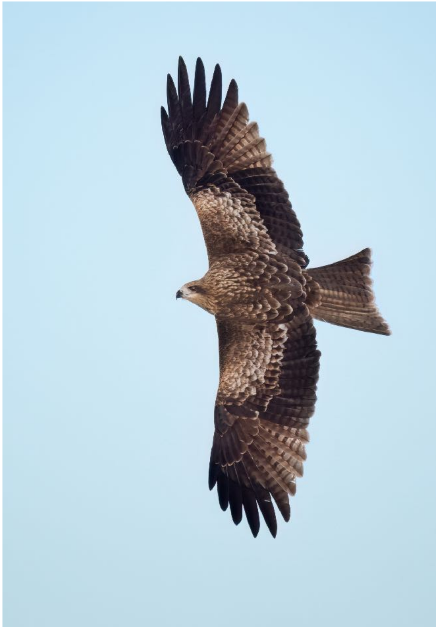
Black Kite: Photo by guide - Ben Knoot

January 27th (Day 13): The morning was spent rather triumphantly at the Shunkunitai Nature Center . I say triumphantly because this was the first time we really got a nice mixed flock species that were eye level in some good light to enjoy AND we had a killer session with Black Kite, Carrion Crow, White-tailed and Steller's Sea Eagles coming down to bait placed on the ice. The morning was freezing but the semi-frost bitten hands were overshadowed by the pure chaos we all witnessed. Here we saw; Long-tailed Tit, Great Spotted Woodpecker, Eurasian Treecreeper, Marsh Tit, Willow Tit, Coal Tit, Japanese Tit, Goldcrest, Eurasian Nuthatch, and Japanese Pygmy Woodpecker. Epic morning, truly.