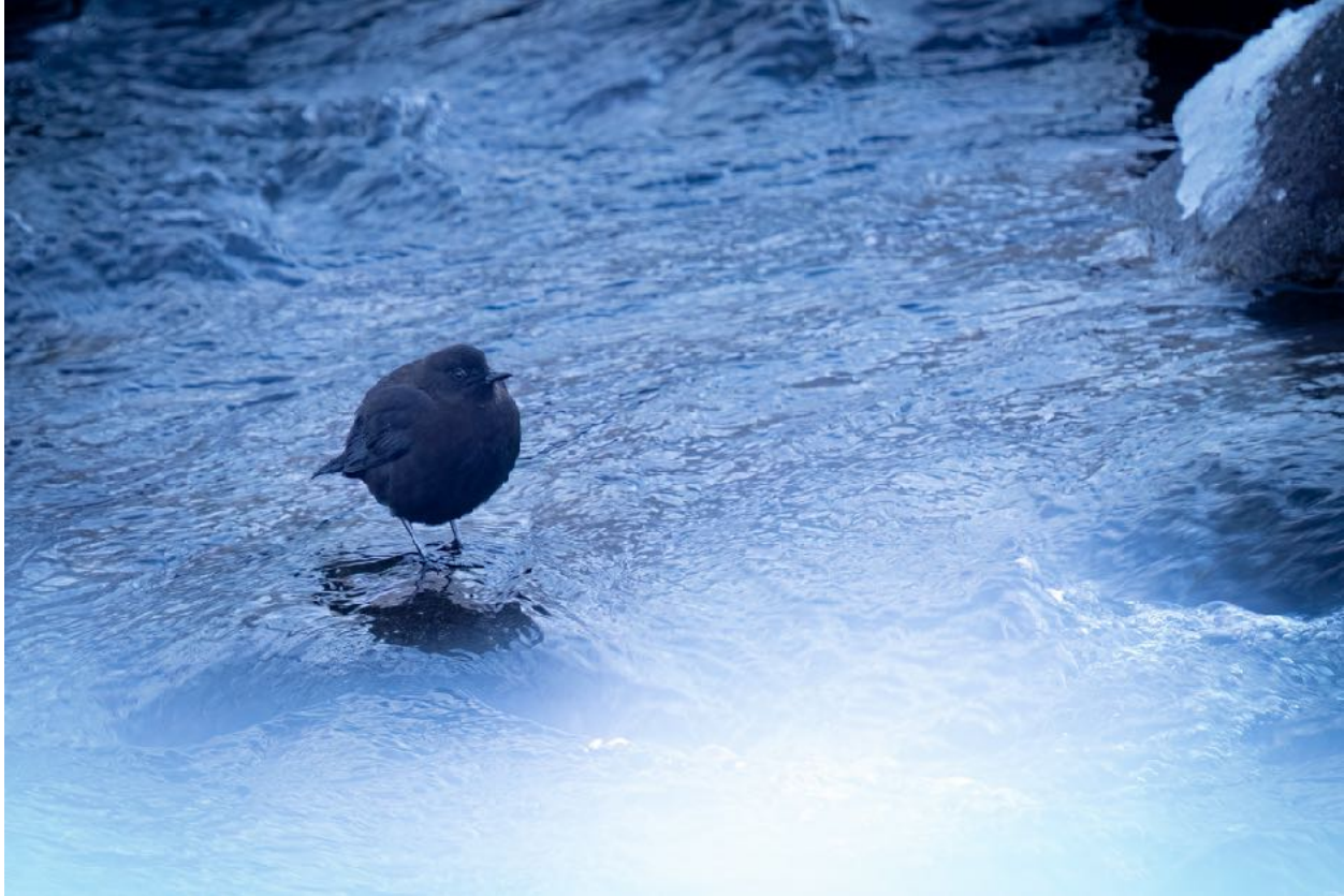
Brown Dipper: Photo by guide - Ben Knoot

January 29th (Day 15): Time to pack up and head on to our next location. This area was really quite fun but before we left for the day, we enjoyed a nice viewing of the local Brown Dipper doing its thing in the little creek on the grounds of the Washi-no-yado Inn . Very fun!