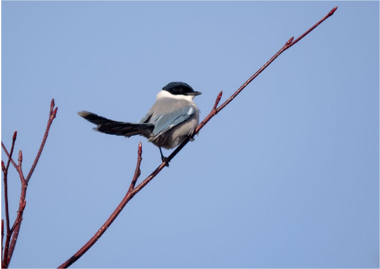
Azure-winged Magpie: Photo by guide - Ben Knoot

January 23rd (Day 9): Our main target for the morning was the spectacular Green Pheasant . After a few solid hours of searching the farm fields, we finally managed to pick up a really nice male around the Karuizawa Garden Farms .