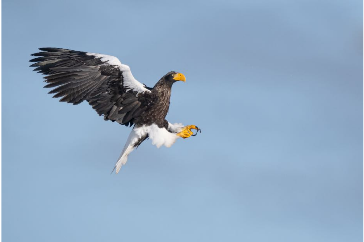
Steller's Sea Eagle