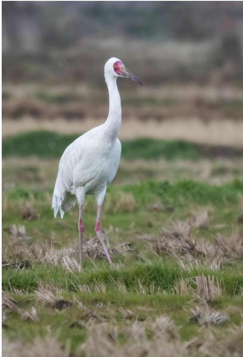
Siberian Crane: Photo by guide - Ben Knoot

January 31st (Day 17): Now in Izumi, the land of cranes, we enjoyed our time here thoroughly, even though there was a bit of mist and well, heavy rain...haha - The show here comes in the form of thousands upon thousands of Hooded Crane that gather in the East Reclamation Area to feed. Among those, we also found several Common Crane , White-naped Crane , Sandhill Crane and one lone Siberian Crane . We also added Rook , Eurasian Kestrel , Oriental Greenfinch and American Pipit .