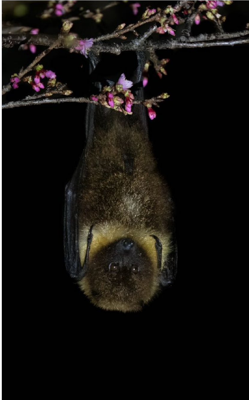
Ryukyu Flying Fox

Our night time excursion however was very successful. We checked out the Yanbaru Discovery Center and were rewarded with a pleasant Japanese Scops Owl for our efforts. Our final visit for the evening was the Aha Dam . We had two targets here and thankfully, we got them both! The Eurasian Woodcock and the Northern Boobook showed off perfectly for some great views and we even added a surprise visit from a small group of Ryukyu Flying Fox ! How cool! A solid evening out but now it was time to head back to the hotel, grab some “zzzz’s” and prep for our next morning.