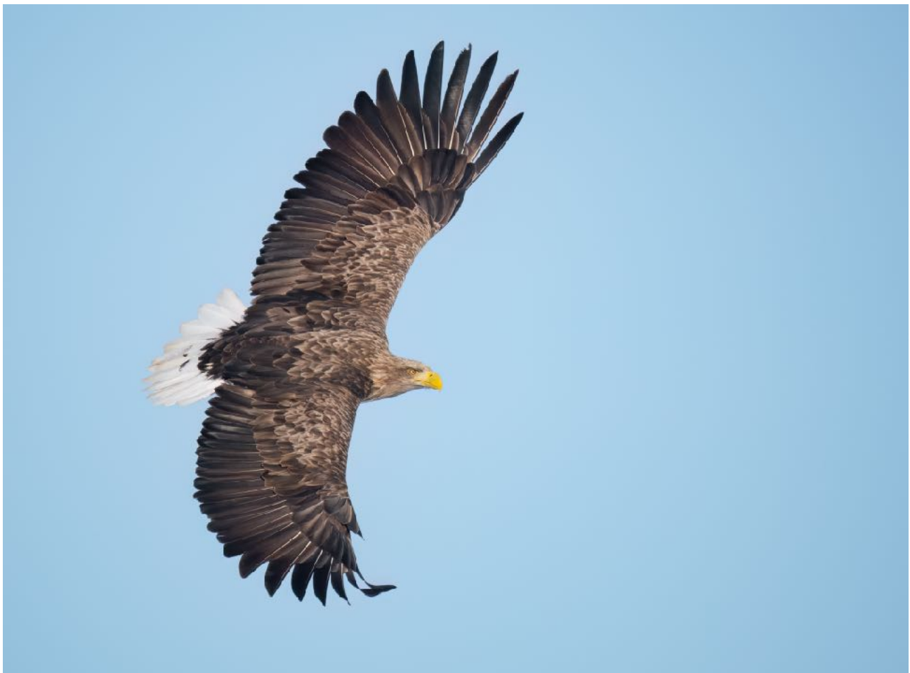
White-tailed Eagle: Photo by guide - Ben Knoot

After lunch we continued to bird Cape Nosappu and we added; Common Gull, Black-legged Kittiwake, Black-headed Gull, Common Redpoll, White-tailed Eagle, Whooper Swan our first of many Red-crowned Crane and Spectacled Guillemot. A sweet day!