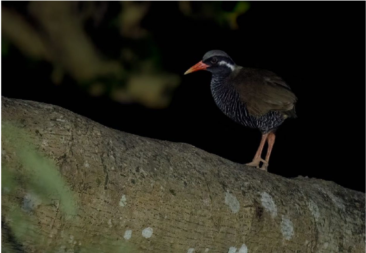
Okinawa Rail: Photo by guide - Ben Kroot

January 17th (Day 3): Our final day on Okinawa and we had a big problem. We still hadn't seen one of the most iconic and sought after birds we were after. But luckily, our guide Charley was on it like no-one's business. We got up early and went out under the cover of darkness and after a few hundred meters of walking the road and using our thermal cameras, Charley spotted our quarry, the striking Okinawa Rail . An amazing start to the day for sure!