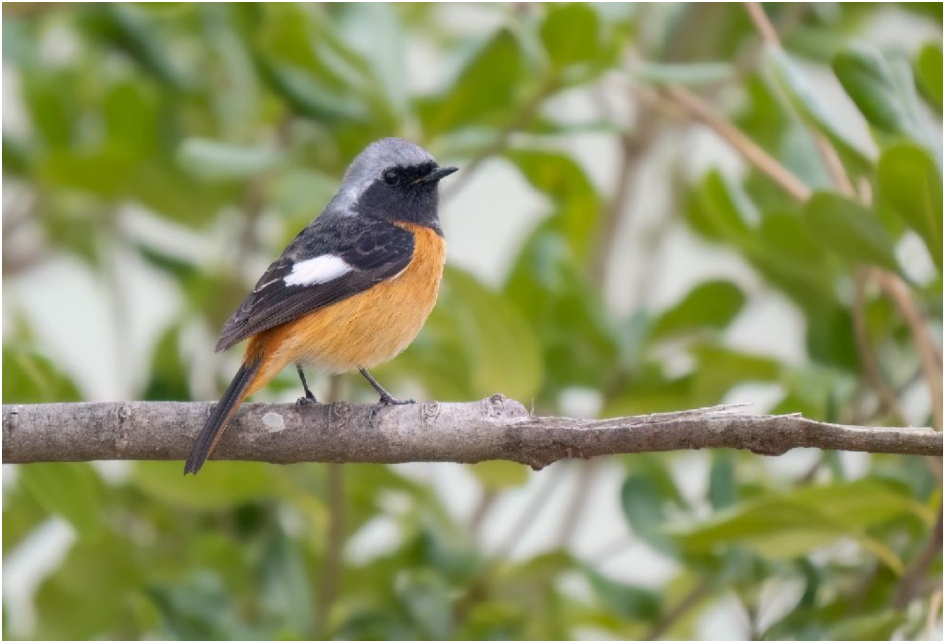
Daurian Redstart: Photo by guide - Ben Knoot

February 2nd (Day 19): The first stop for the morning was Kirishimahigashi Shrine . That is an incredible name isn't it?! Here added Brown-headed and Pale Thrush and a Daurian Redstart . The next stage of our trip was the Kadogawa Harbor to try for a very tricky bird. Unfortunately, though we searched and searched, we could not find our quarry, the Japanese Murrelet. A nice boat ride but nothing new. The last stop of the day was in Cape Hyuga where we luckily found our target, the Black Wood Pigeon . Off to bed after another good day in Japan.