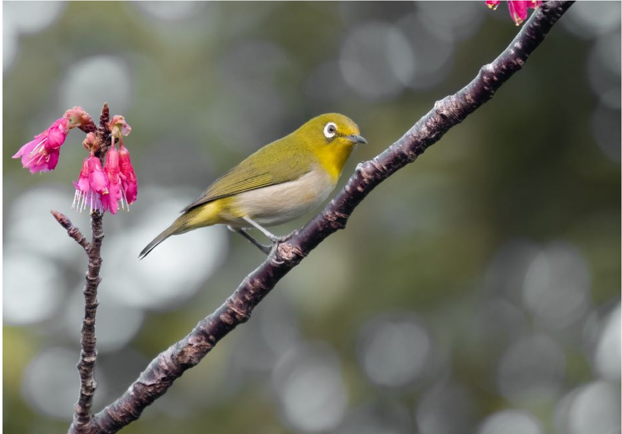
Warbling White-eye: Photo by guide - Ben Knoot

January 15th (Day 1): Day one...always one full of anticipation and excitement as the tour finally gets underway. Our first stop of the morning was a cool little city hotspot called “ Triangle Pond ”. In this relatively open little area we had some great birds like; Temminck’s and Long-toed Stint , Little Ringed Plover , Eurasian and Black-faced Spoonbill , Zitting Cisticola , Common Redshank , a quick fly-by view of Cinnamon Bittern and the first of many Eurasian Tree Sparrows , Large-billed Crows , and Warbling White-eye .