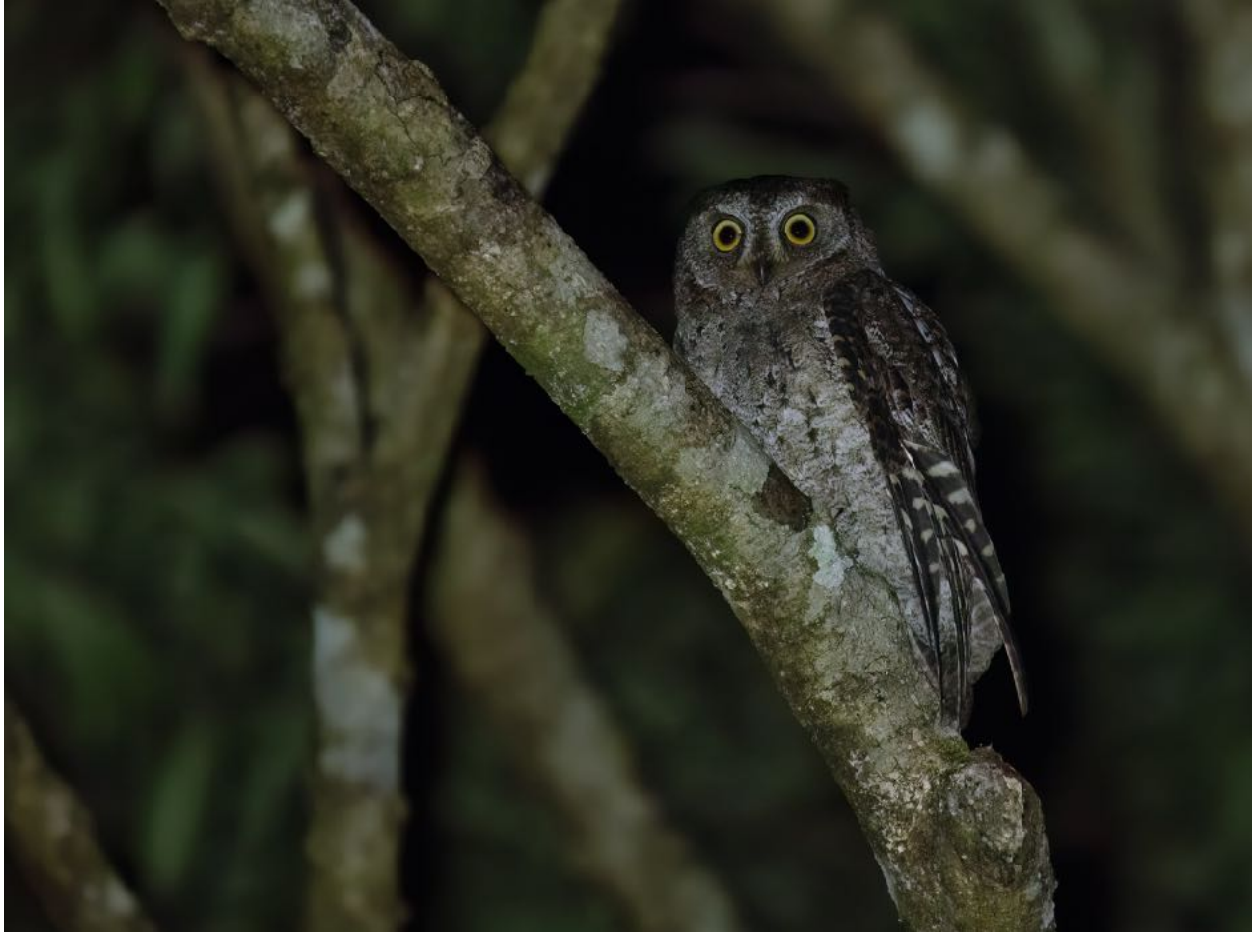
Ryukyu Scops Owl: Photo by guide - Ben Knoot

Once we arrived at the Akina Rice Paddy Fields , we found a few new species like; Eastern Yellow Wagtail , Gray Heron and a Common Sandpiper . Another stop off in the Kinsakubaru Virgin Forest for an evening stroll gave us a great look at Ryukyu Robin and a beautiful Ryukyu Scops Owl .