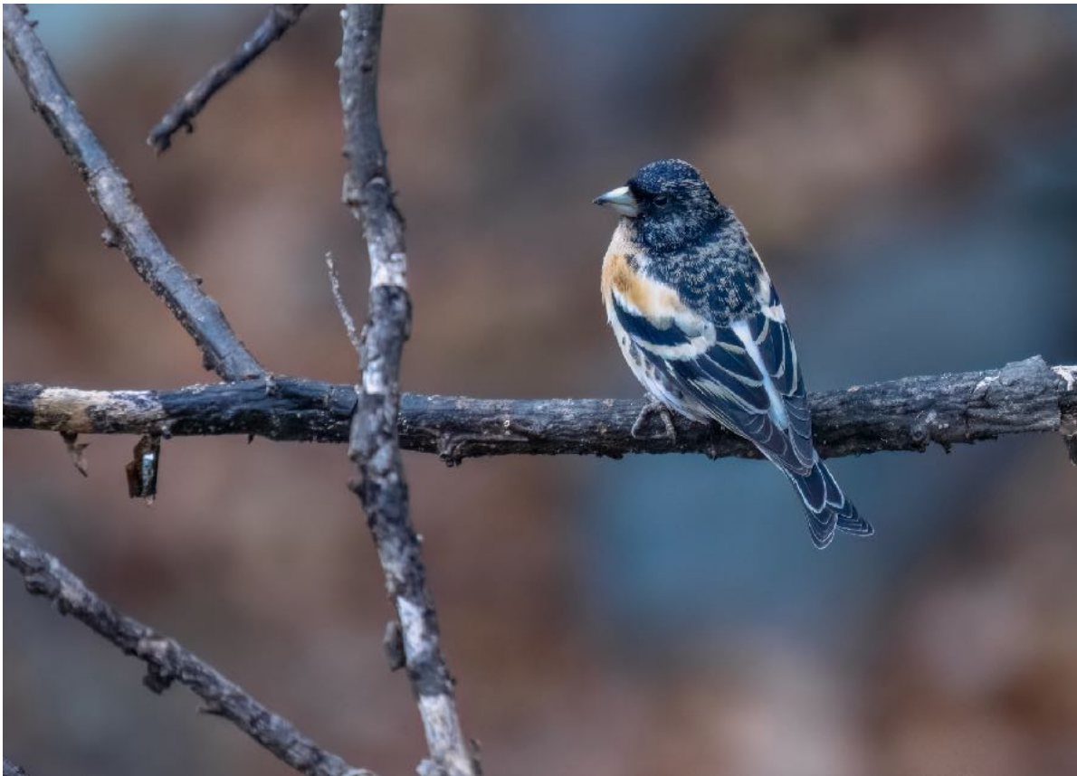
Brambling: Photo by guide - Ben Knoot