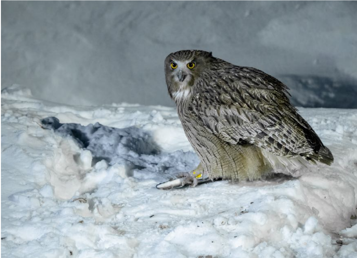
Blakiston's Fish Owl (Both): Photo by guide - Ben Knot