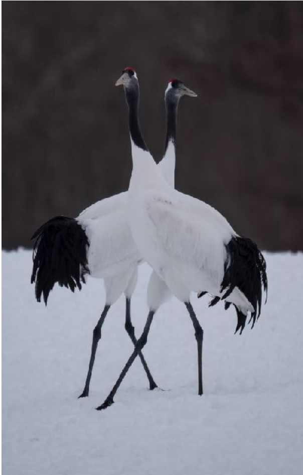
Red-crowned Crane: Photo by guide - Ben Knoot