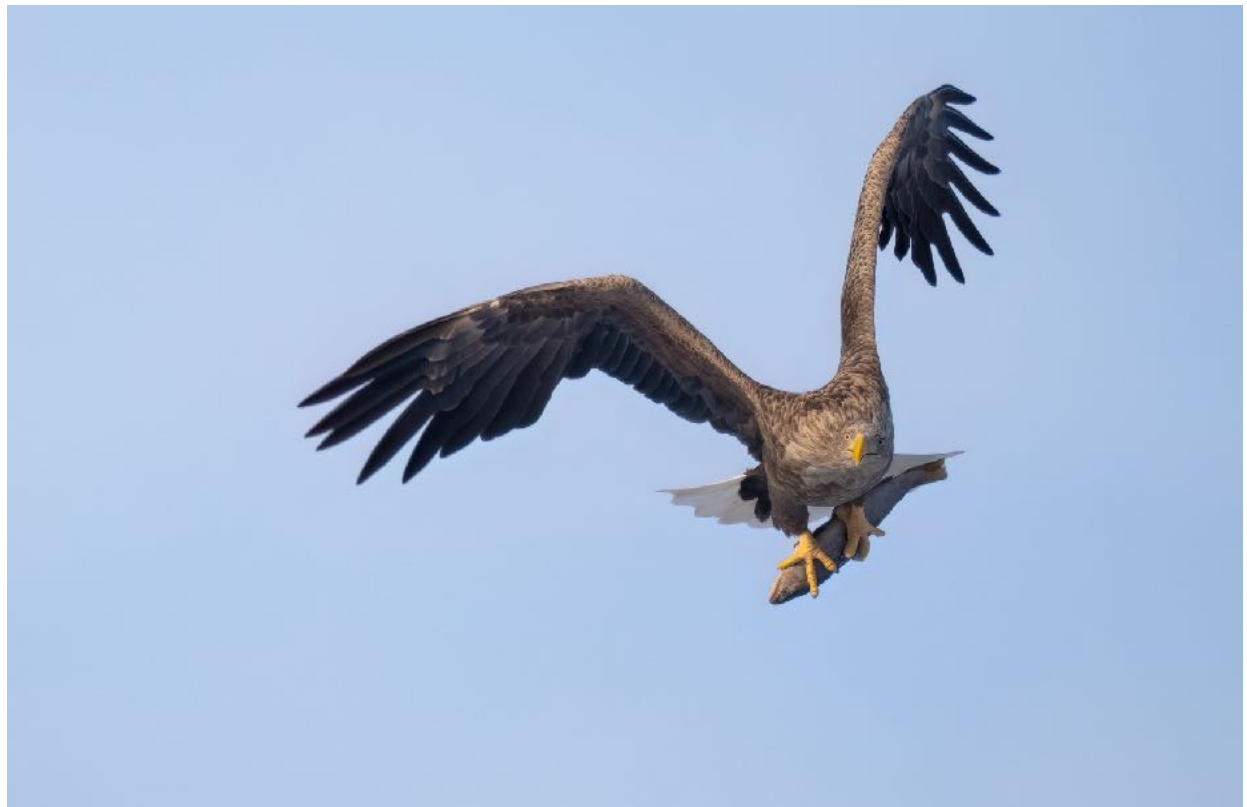
White-tailed Eagle: Photo by guide - Ben Knoot