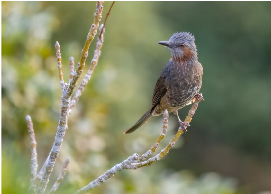
Brown-eared Bulbul: Photo by guide - Ben Knoot