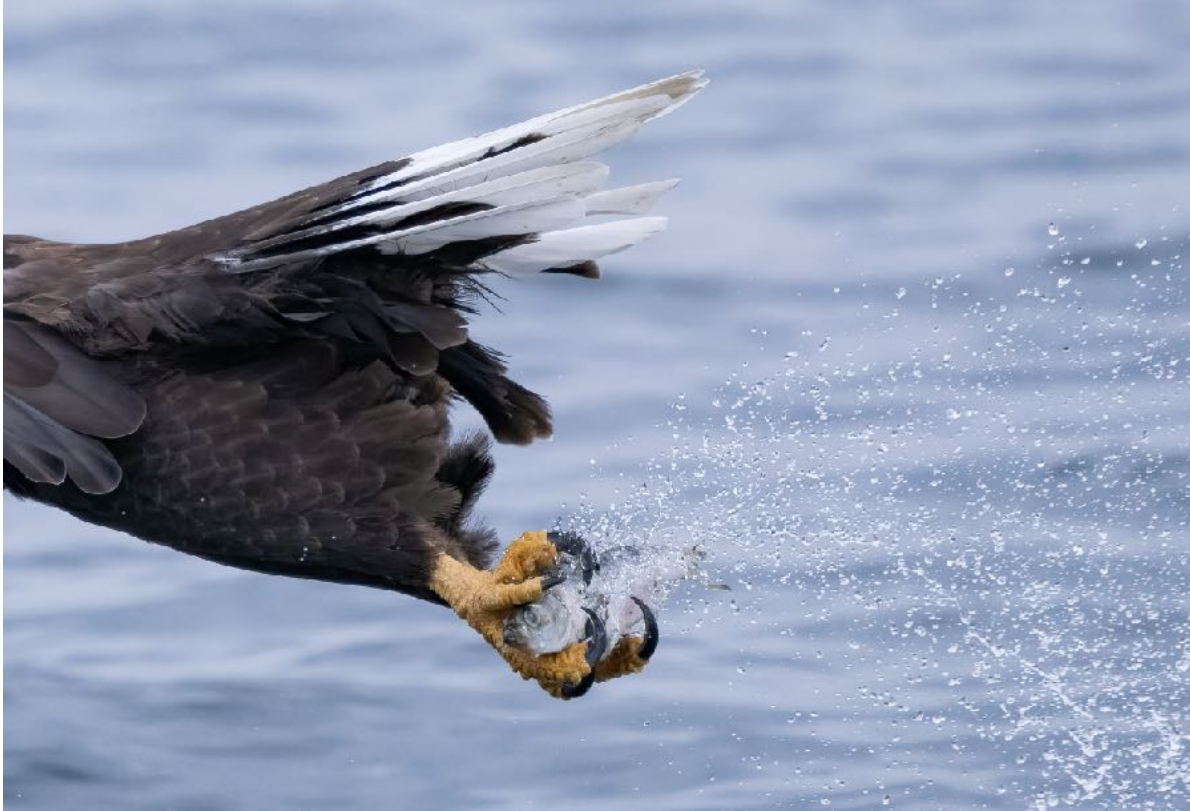
White-tailed Eagle (both): Photo by guide - Ben Knoot