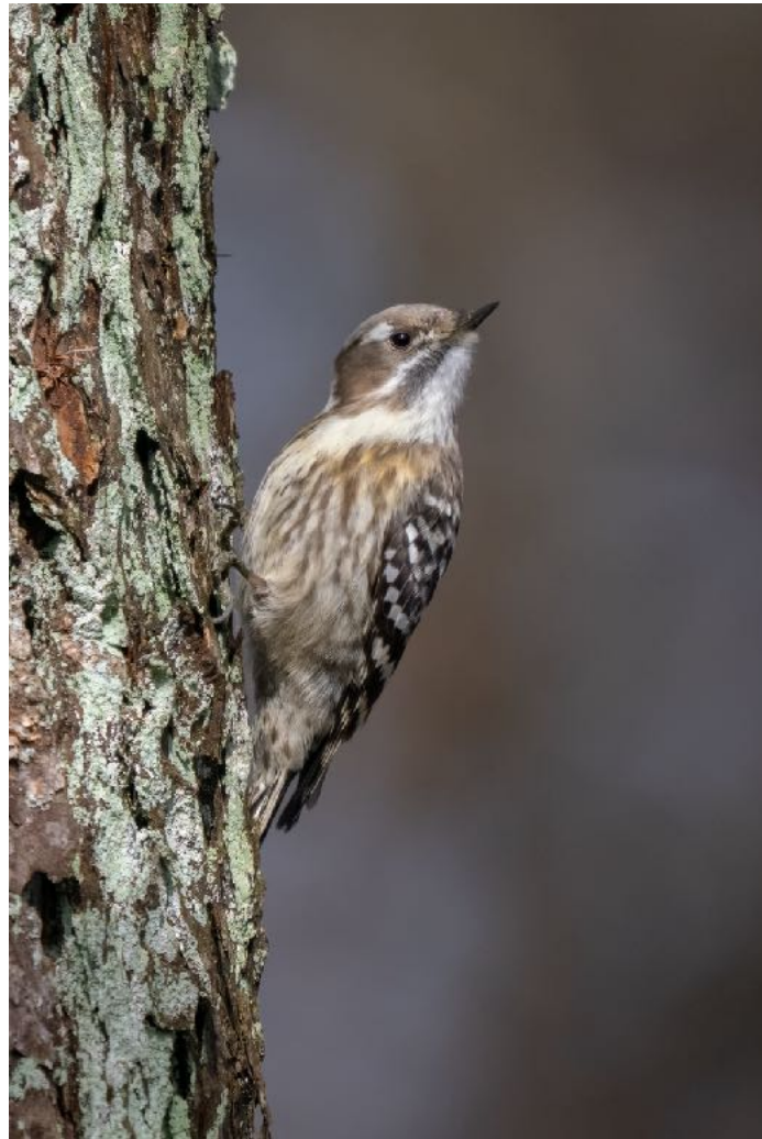
Japanese Pygmy Woodpecker: Photo by guide - Ben Knoot

January 16th (Day 2): Today we set out early into Okuni forest . Our time in Okinawa was pretty much devoted to finding as many endemics as possible. We started off well by getting some quick views of Okinawa Woodpecker , Okinawa Robin and Black Wood-Pigeon . Over all the birding here was a bit slow but it was a lovely morning in a beautiful forest. We returned to our odd little hotel ( Ada Garden Hotel ) where we found a Japanese Pygmy Woodpecker , Ryukyu Minivet , and a Japanese Tit right from the parking lot.