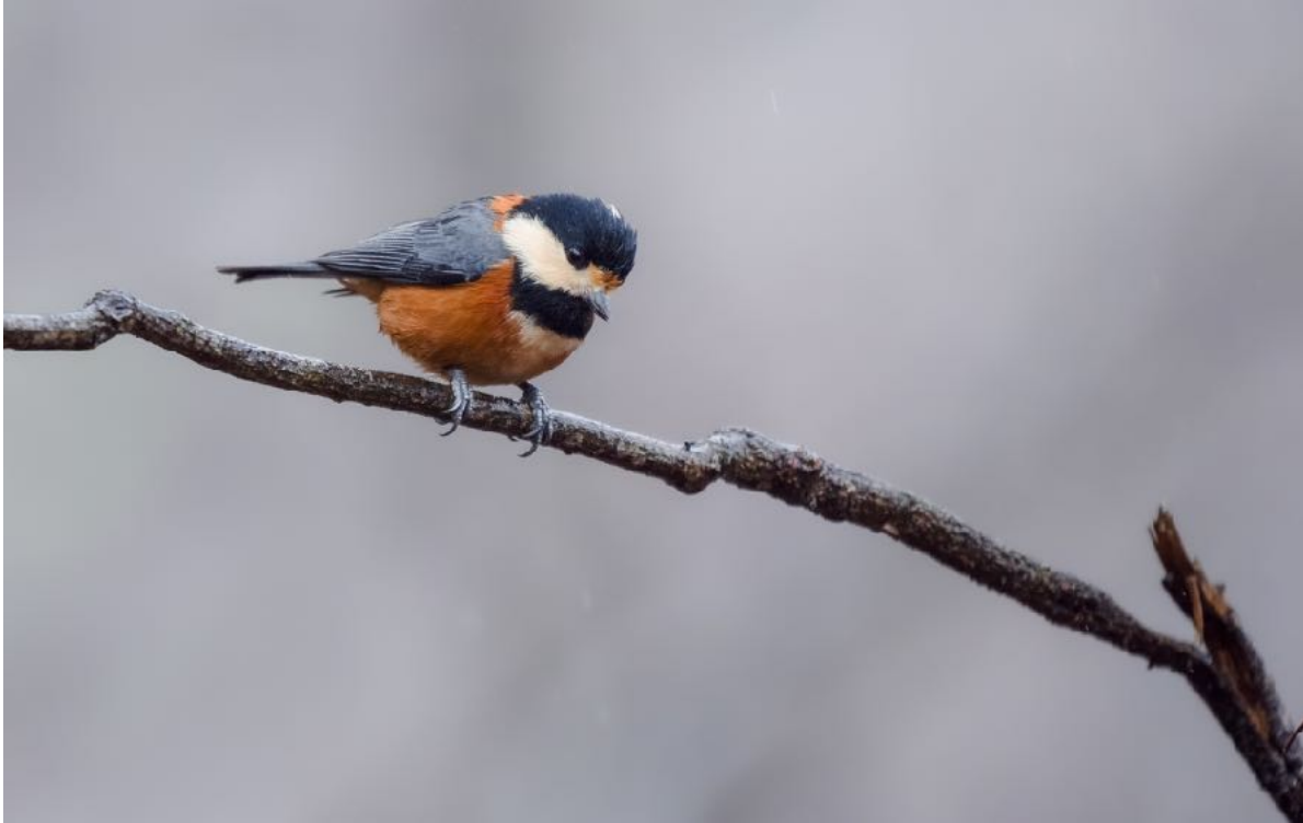
Varied Tit: Photo by guide - Ben Knoot