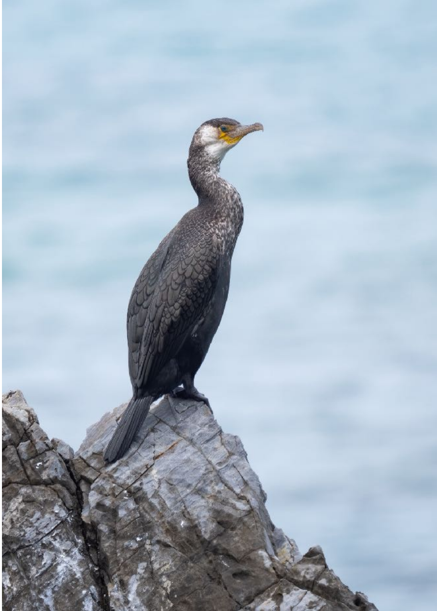
Japanese Cormorant

January 18th (Day 4): The morning was spent in Amani Nature Forest Reserve . It was a bit chilly and a bit windy but we still managed some great new birds. Again, targeting the endemics to the island was the top priority. During some morning birding we managed Whistling Green Pigeon , Black Wood Pigeon , White-backed (Amami) Woodpecker , Lidth's Jay , Japanese Bush Warbler , Ryukyu Robin and many Brown-eared Bulbuls . This forest was absolutely stunning and was so far one of the birdiest sections of the tour...so a great time was had by all here! On our way to our next destination we saw an Eastern Buzzard .