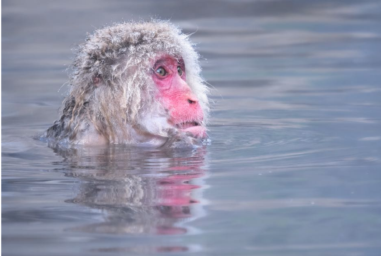
Japanese Macaque (Snow Monkey)

January 24th (Day 10): Today was mostly a wetland water bird day. And what I mean by that is cold frozen wetland birds... haha - gosh it was a cold morning! We started off in the fields that were covered in ice and snow but we still managed Greater White-fronted Goose, Carrion Crow, Eurasian Skylark and Great Egret.