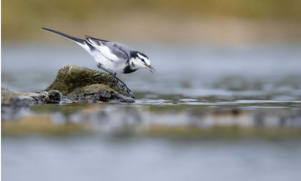
White Wagtail: Photo by guide - Ben Knot

One of our last stops for the morning was the rather large Sunno Dam . We had a bit of a storm front moving in on us so the birding was a bit chilly but we still managed some cool birds, mostly ducks like; Eastern Spot-billed Duck , Mallard , Common Pochard and a few Tufted Duck .