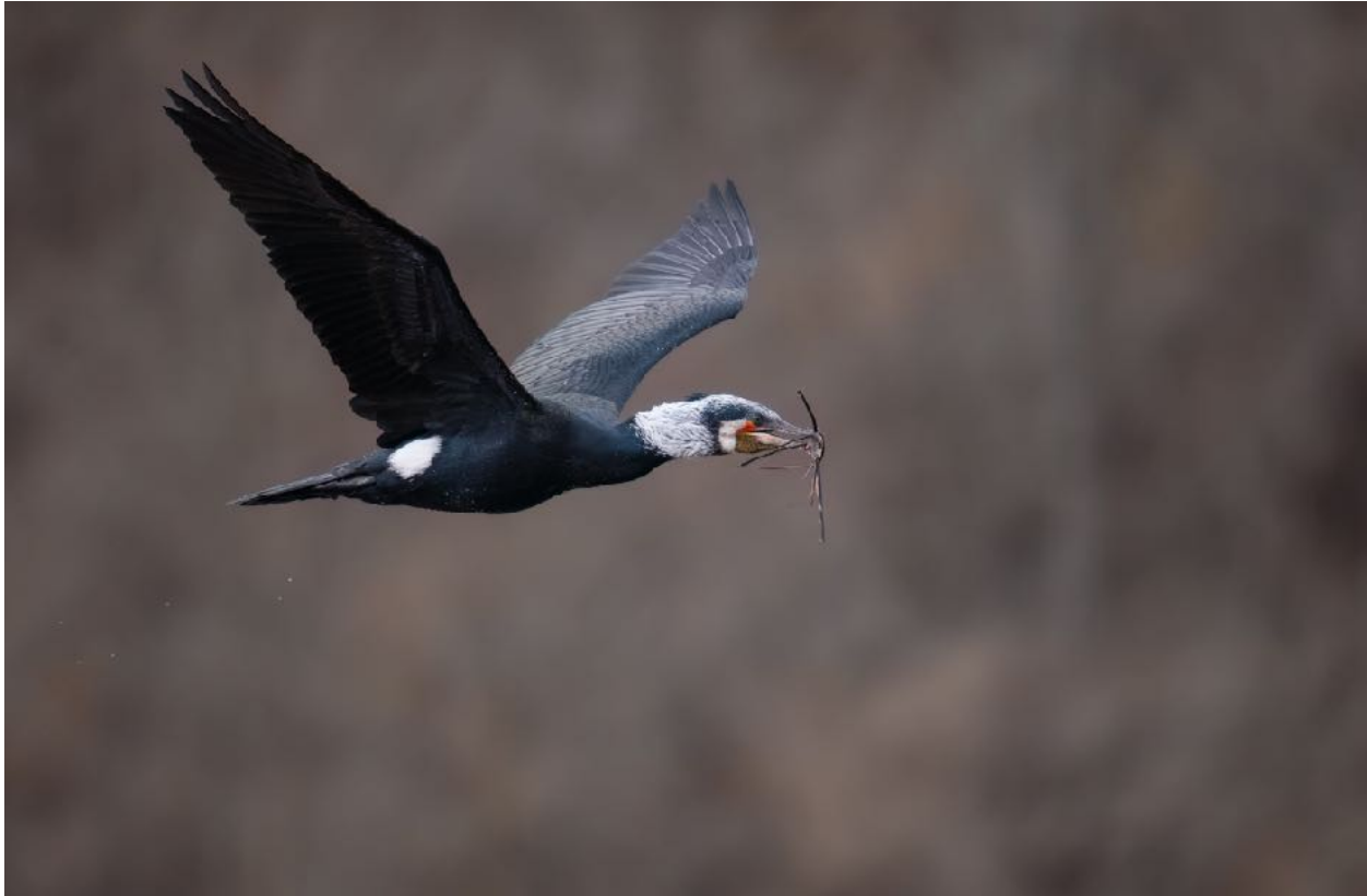
Great Cormorant

January 21st (Day 7): Our first great siting for today was a group of Chinese Bamboo Partridge that we had the pleasure of seeing while on our way to our first location. Along the same road, we also scored Chinese Hwamei and Meadow Bunting . Once in the parking lot of Saitama Prefectural Forest , we saw our first big target, the Eurasian Bullfinch . Some great views of several adult birds feeding on a berrying tree was a great start to our walk. Now in the park proper, we had some great views of birds like; Pallas's Rosefinch, Brambling, Japanese Tit, Varied Tit and Eurasian Jay . Our time here was spent in the cold and slightly drizzly conditions as we waited underneath a shelter with a few other Japanese photographers. They were all incredibly nice, helping us get on these beautiful birds with a make-shift feeder station they had set up. Very fun indeed.