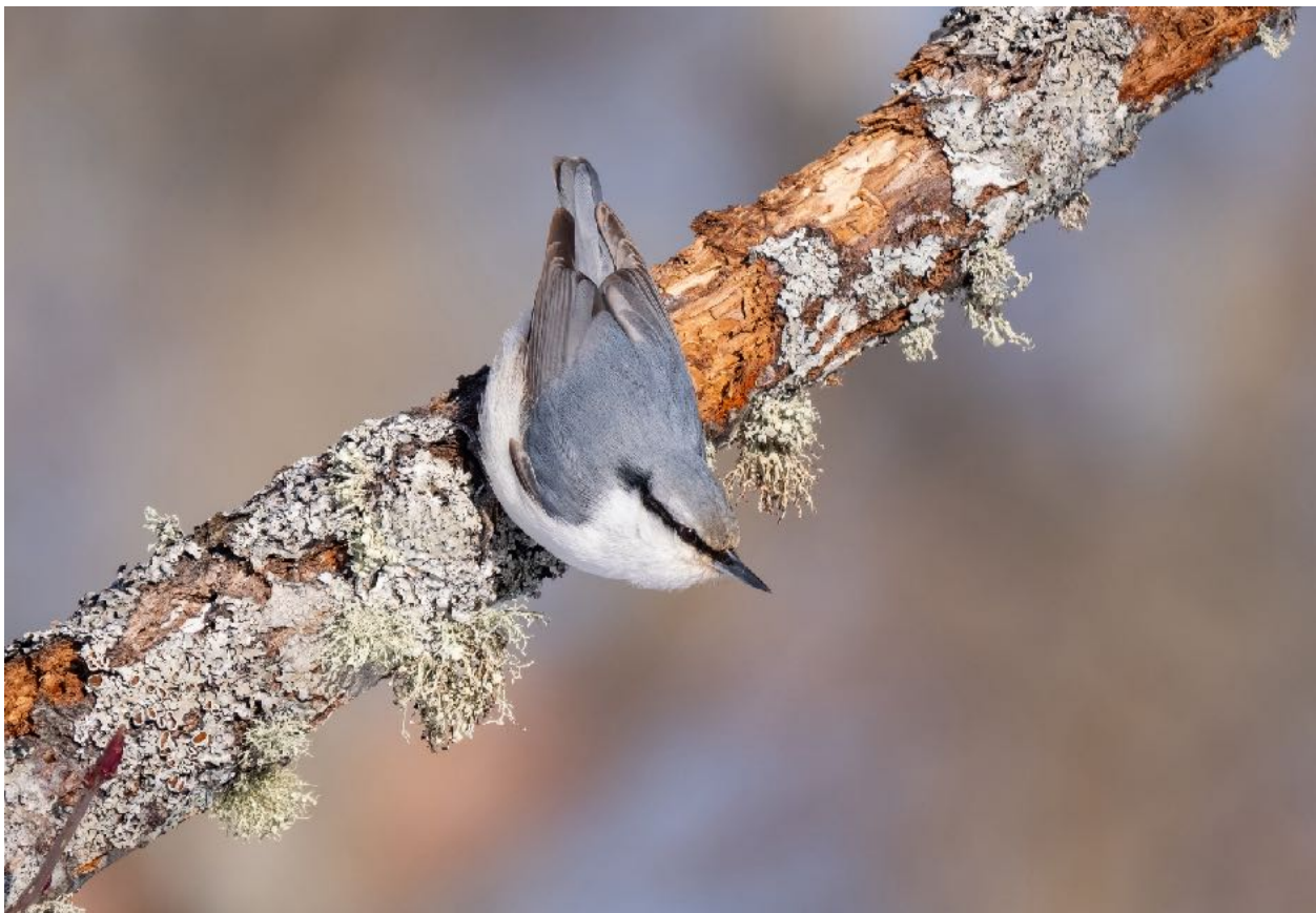
Eurasian Nuthatch: Photo by guide - Ben Knoot

Our next stop was the Karuizawa Wild Bird Sanctuary . We had some fun luck here with Eurasian Nuthatch , Eurasian Wren , Brown Dipper , Japanese Grosbeak and the fantastic little Long-tailed Tit .