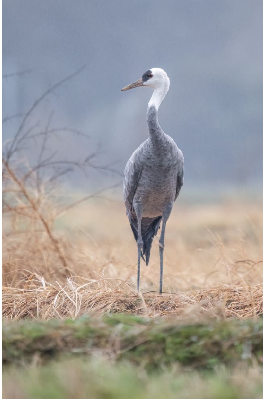
Hooded Crane: Photo by guide - Ben Knoot

February 1st (Day 18): Another visit to the Euchi River Reedbeds for a bird we had missed last time. After a bit of searching we did find a Ruddy-breasted Crake and then the tiny little Chinese Penduline Tit , the bird we had missed! Always nice to rectify a miss with some killer views.