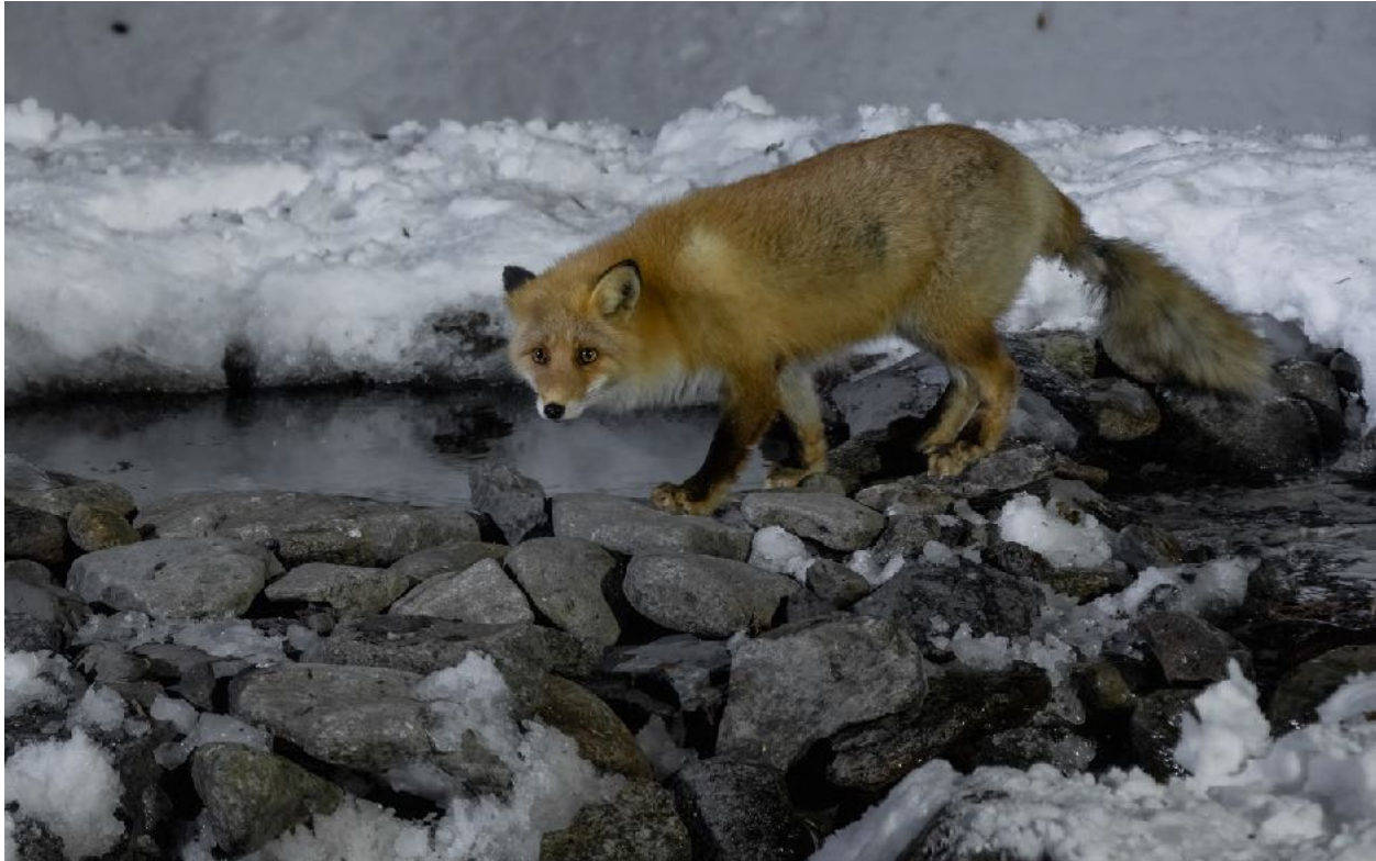
Red Fox: Photo by guide - Ben Knot

January 28th (Day 14): This morning was a highly anticipated one for me personally and a real treat for the guests. I have always wanted to photograph the Steller's Sea and White-tailed Eagles coming down to grab fish off the water. I have always known they were baited and that's just the reality of how you get photos like the ones below. It is also the best and really the only way to guarantee you even get to see these true kings of the frozen north "hunt" for their food. So, in the early hours of the morning, we set out in the Rausu Fishing Port and did just that! What an incredible few hours of watching hundreds of eagles descend on baited fish. We also added Common Murre to our lists. So cool.