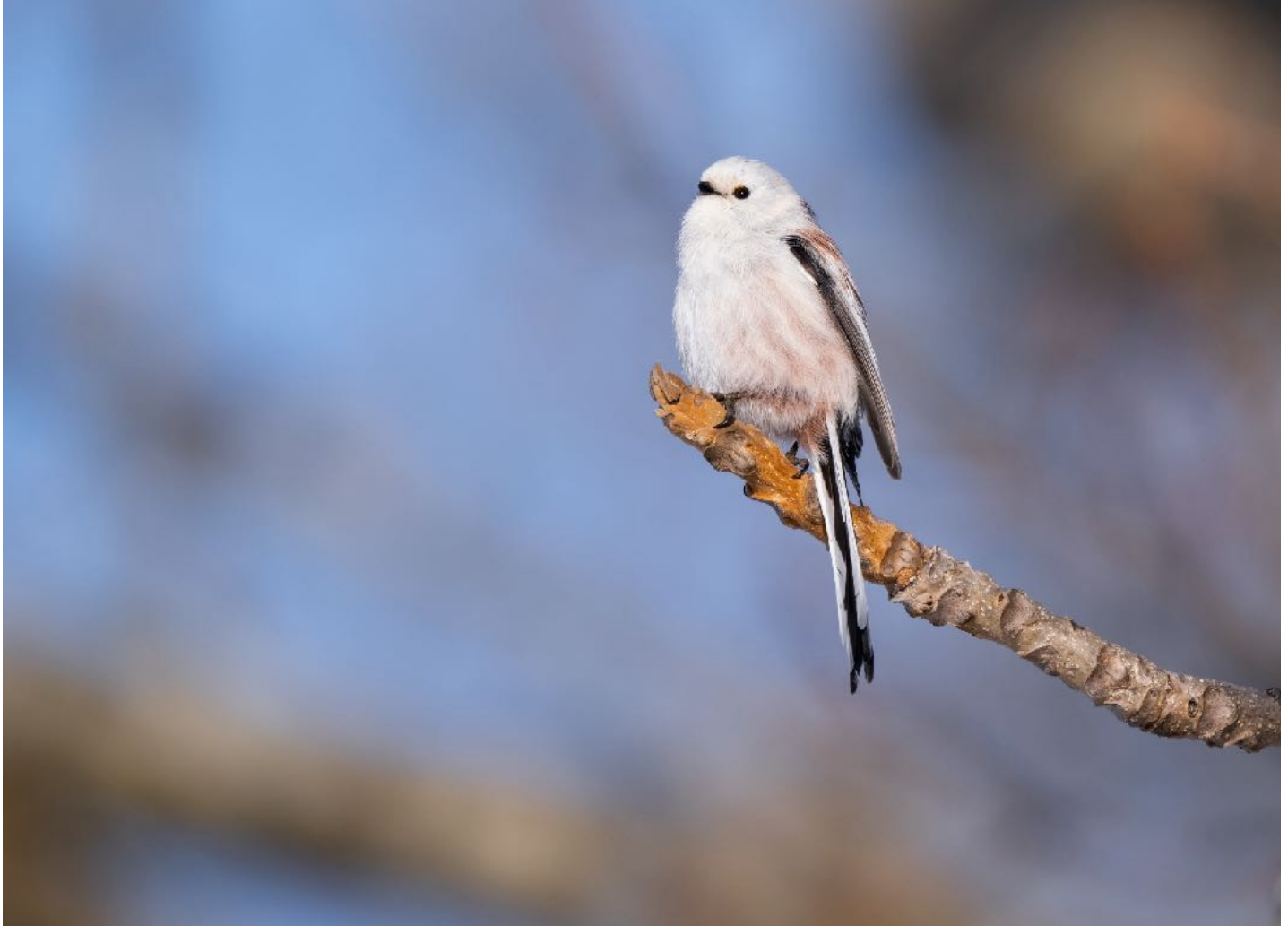
Long-tailed Tit: Photo by guide - Ben Knoot

We took a coastal drive to see what else we could find and added a nice Hen Harrier to our list. The evening was a special one for sure. On the grounds of our hotel, just after a lovely traditional Japanese dinner, we waited in the dining area for a very special bird to make an appearance. We had a long wait but luckily the dining area had some hot tea, and the beers kept flowing. We were entertained by a few Red Fox that came into the area. One of whom was a bit beat up...he was not shy. Unfortunately, the one that was in pristine condition was a bit more shy. It also didn't help that the owners of the lodge would consistently scare off the foxes but the reason why soon became clear. About three hours into our wait, we heard the unmistakable call of our target. A quick scan with the thermal scope revealed a pair of Blakiston's Fish Owl perched high on the hill adjacent to the hotel. We had to wait another 30-min or so for one of the birds to come down to the pond where this bird normally hunts and stages. It slowly wandered over to the pond where in just a few minutes of staring at the water, dove in and grabbed itself a nice meal to start its evening. A wonderful way to end a pretty spectacular day.