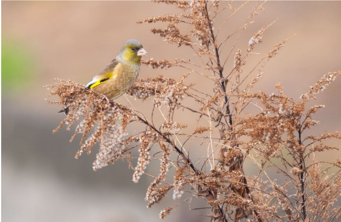
Oriental Greenfinch: Photo by guide - Ben Knoot