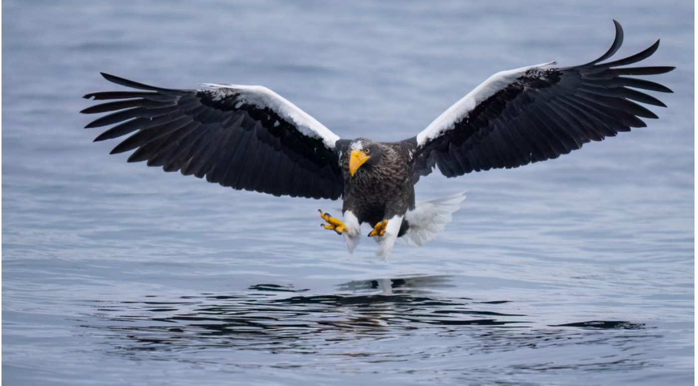
Steller's Sea Eagle (both): Photo by guide - Ben Knoot