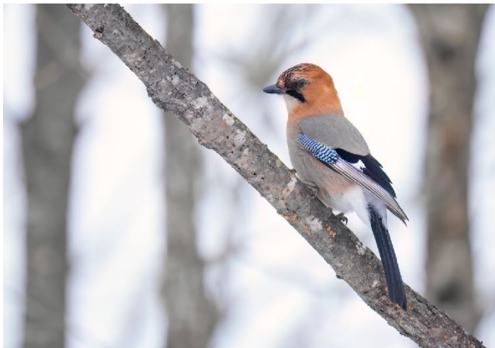
Eurasian Jay: Photo by guide - Ben Knoot