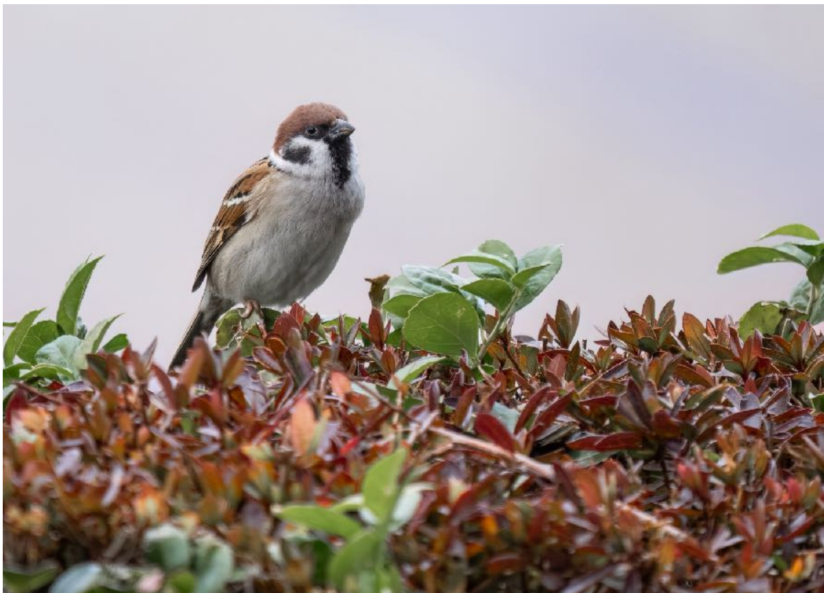
Eurasian Tree Sparrow: Photo by guide - Ben Knoot