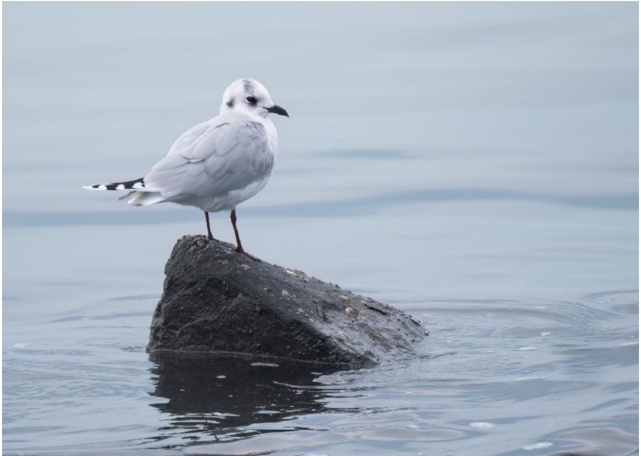
Saunders's Gull: Photo by guide - Ben Knoot

The next bit of our morning was spent in the region of Mizushima . Here along the coast we added several great birds to our trip. Birds like; Common Shelduck , Northern Shoveler , Great Crested Grebe , Black-bellied Plover , Common Sandpiper , Common Greenshank , Osprey , Common Kingfisher , Blue Rock Thrush , Black-tailed Gull , Reed Bunting and the main target for this location, the Saunders's Gull which we had some great looks at...especially alongside a Black-headed Gull , a great comparison. A wonderful area but it was time to leave and head over for lunch. Not 7-11 this time but one of our typical diner experiences, another a great lunch with automated services ... haha quite a hoot! Now a visit to the Euchi River Reedbeds .