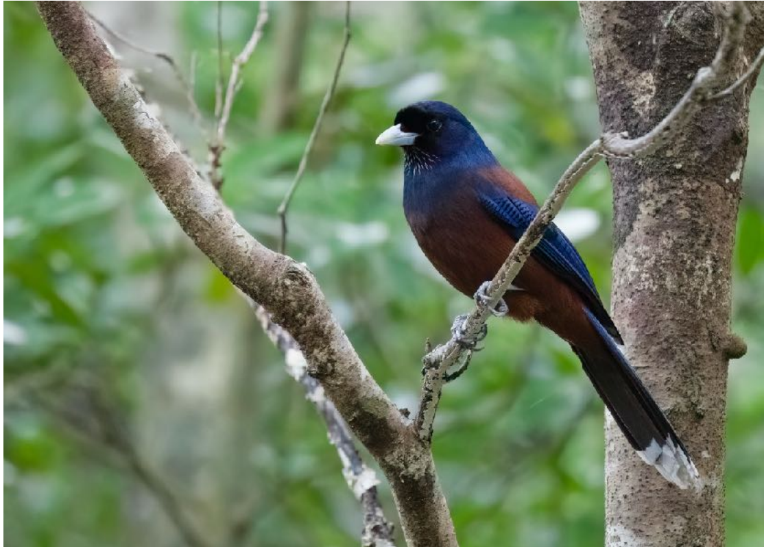
Lidth's Jay: Photo by guide - Ben Knoot