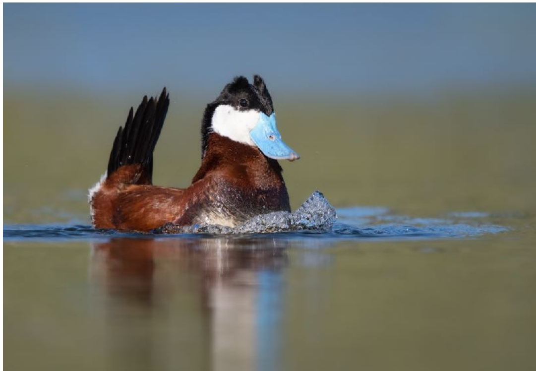
Ruddy Duck: Photo by Guide - Ben Knoot