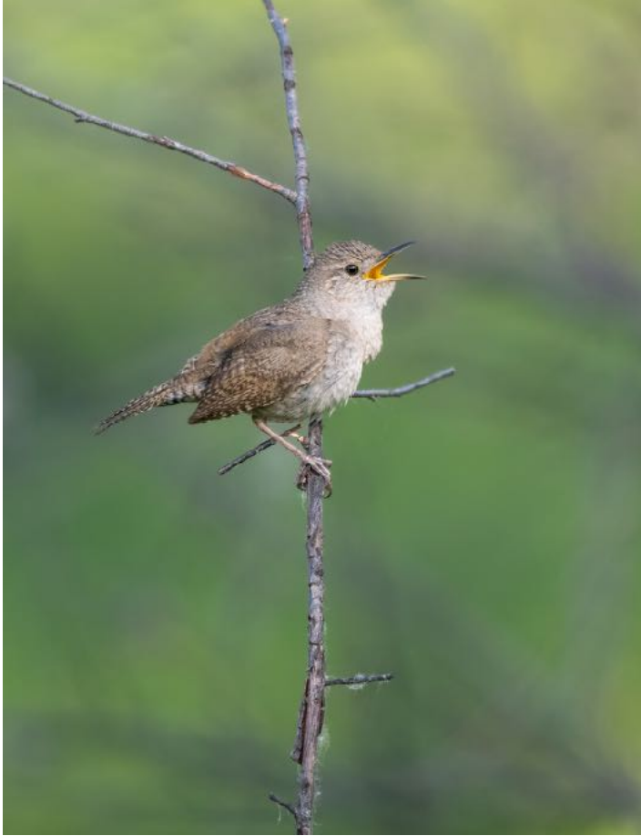
House Wren: Photo by Guide - Ben Knoot