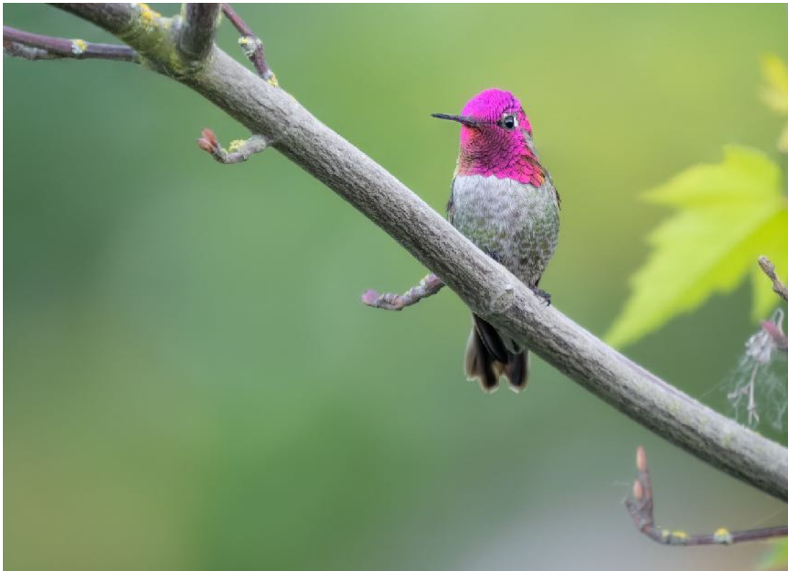
Anna's Hummingbird: Photo by Guide - Ben Knoot