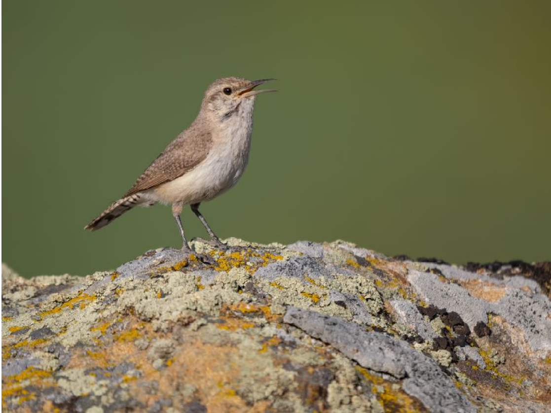
Rock Wren: Photo by Guide - Ben Knoot