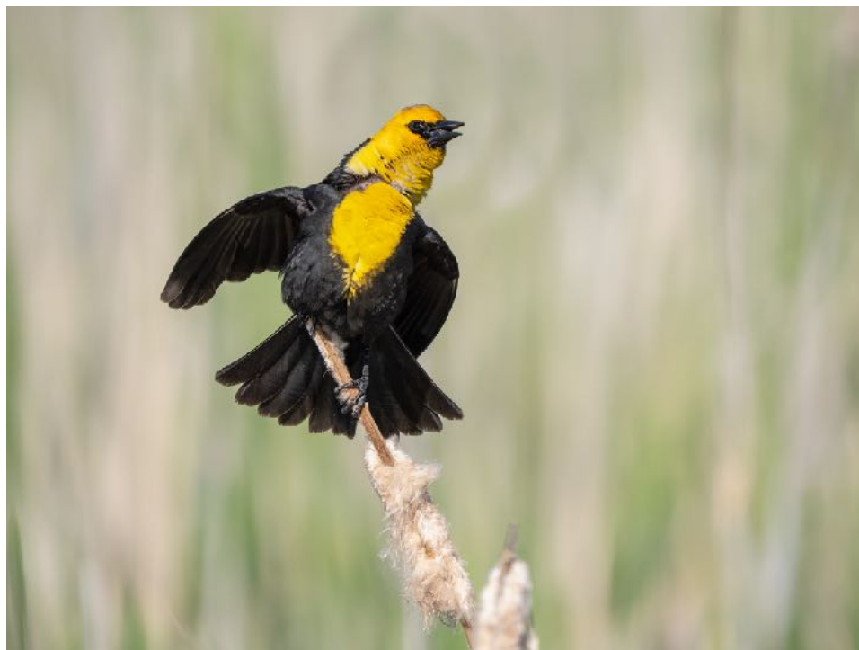
Yellow-headed Blackbird: Photo by Guide - Ben Knot