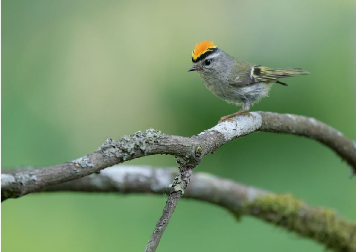
Golden-crowned Kinglet: Photo by Guide - Ben Knoot