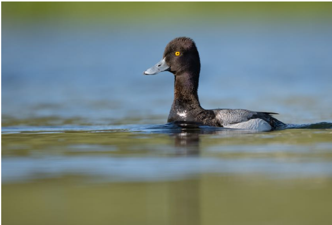
Lesser Scaup: Photo by Guide - Ben Knoot