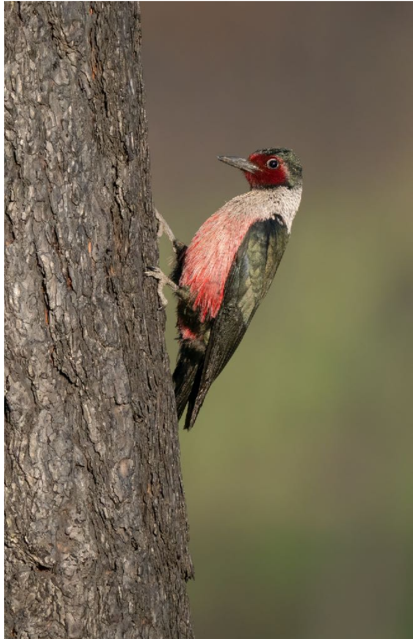
Lewis's Woodpecker: Photo by Guide - Ben Knoot