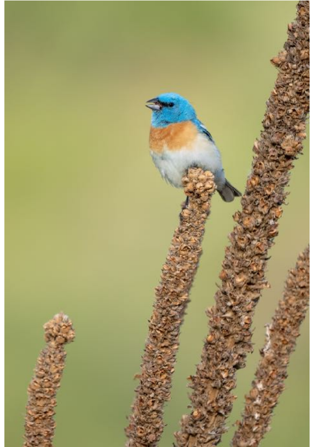
Lazuli Bunting