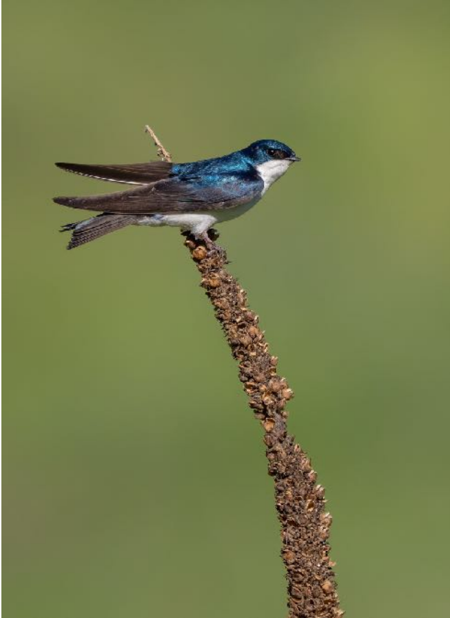
Tree Swallow: Photo by Guide - Ben Knoot