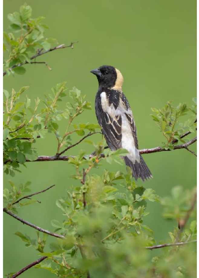
Bobolink: Photo by Guide - Ben Knot