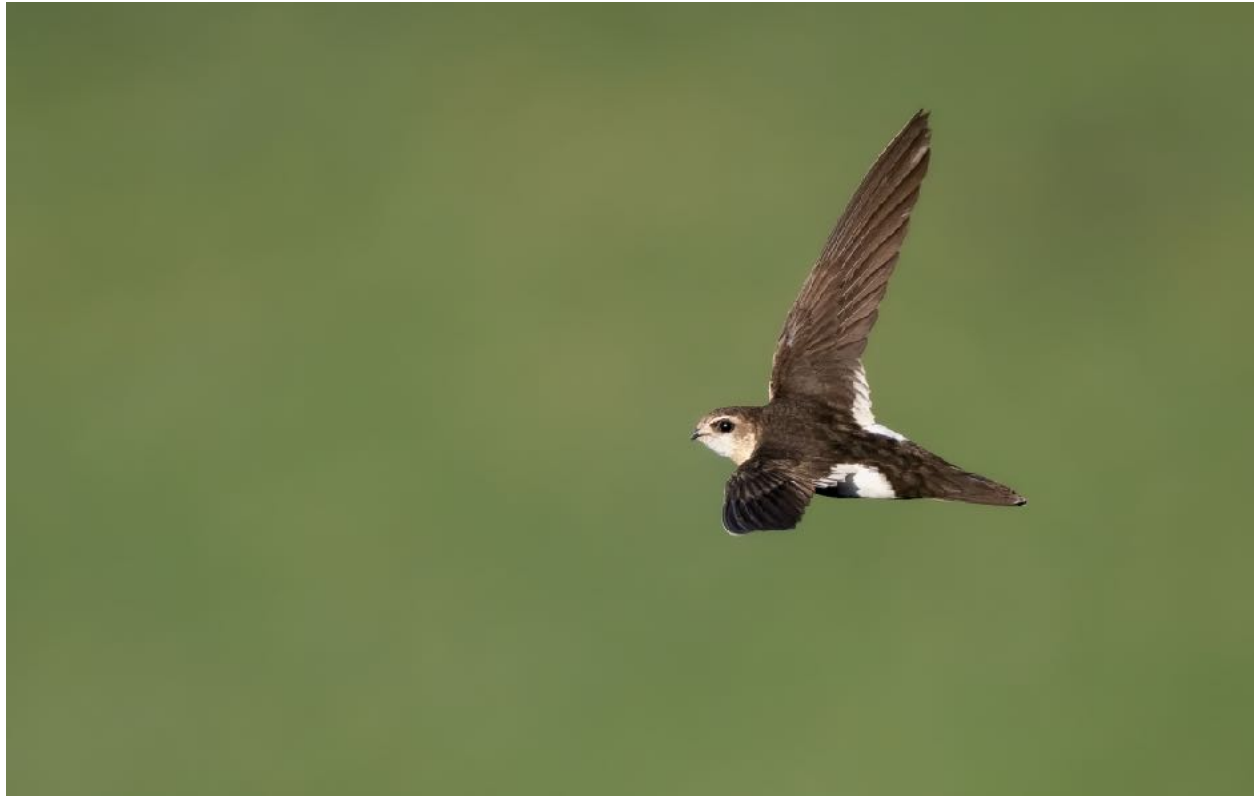
White-throated Swift: Photo by Guide - Ben Knot