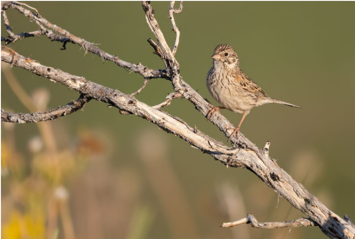
Vesper Sparrow: Photo by Guide - Ben Knoot