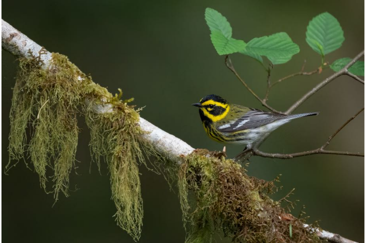
Townsend's Warbler: Photo by Guide - Ben Knoot