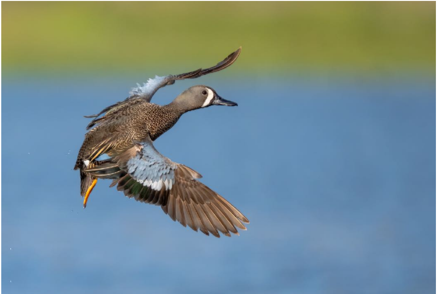
Blue-winged Teal: Photo by Guide - Ben Knoot

This is arguably the most photo-rich target area on the entire tour which is why when you combine these two locations they account for more than half of the tour. The Mixed Ponderosa Pine forests are accompanied by scattered lakes with breeding waterfowl and songbirds at nearly every turn. There are also rolling hills of wildflowers and riparian woodlands pumping with birdlife all encased in a stunning landscape. In Omak we focus primarily on waterfowl like; Red-necked Grebe, Common Loon, Ruddy Duck, Blue-winged Teal, Common Merganser and this year we even ran into a fun surprise, an Eared Grebe! We also hit some of the prairies for birds like Lark Sparrow, Western Meadowlark, Horned Lark, Brewer's and Vesper Sparrow . The lake edges and forested areas of Omak hold nesting Western and Mountain Bluebird, Tree Swallow, Yellow-headed and Red-winged Blackbird, Say's Phoebe, Western Kingbird, Calliope Hummingbird, Bobolink, Pygmy Nuthatch, Bullock's Oriole, Black-billed Magpie, Cedar Waxwings, Osprey, California Quail and the strikingly proud Bald Eagle . Omak is a real gem! A really cool bonus of the hilly piney area of Omak is the possibility of finding Common Poorwill . Very cool little nocturnal creature!