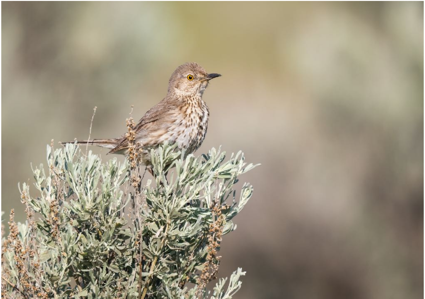
Sage Thrasher: Photo by Guide - Ben Knoot

The Cle Elum area has a lot of great species and that is because of where it lies. It contains both habitats that are typically concentrated on either the east and the west. Several mountain trails where you can find some remnant Douglas fir and Spruce Trees but then vast expanses of Sage Brush-land and open grassland make Cle Elum a must visit for photography. And while this may seem odd to say, we also visit this area because it is typically very prone to fires which is great for a few target species we have. Fire is a big part of the ecosystem regime in the east and we definitely benefited from last and this years fires. Highlights from Cle Elum and this transitional zone included: White-headed, Black-backed, Lewis's and Hairy Woodpecker, Western and Mountain Bluebird, Sage Thrasher, Brewer's Blackbird, Brewer's and Vesper Sparrow, Lazuli Bunting and Western Wood-Pewee . Most of these we could see again but it was great to get two of the big target woodpeckers so well that we didn't need to chase them while properly in the east. We would still decide to get some better Black-backed Woodpeckers near Winthrop. More on that later.