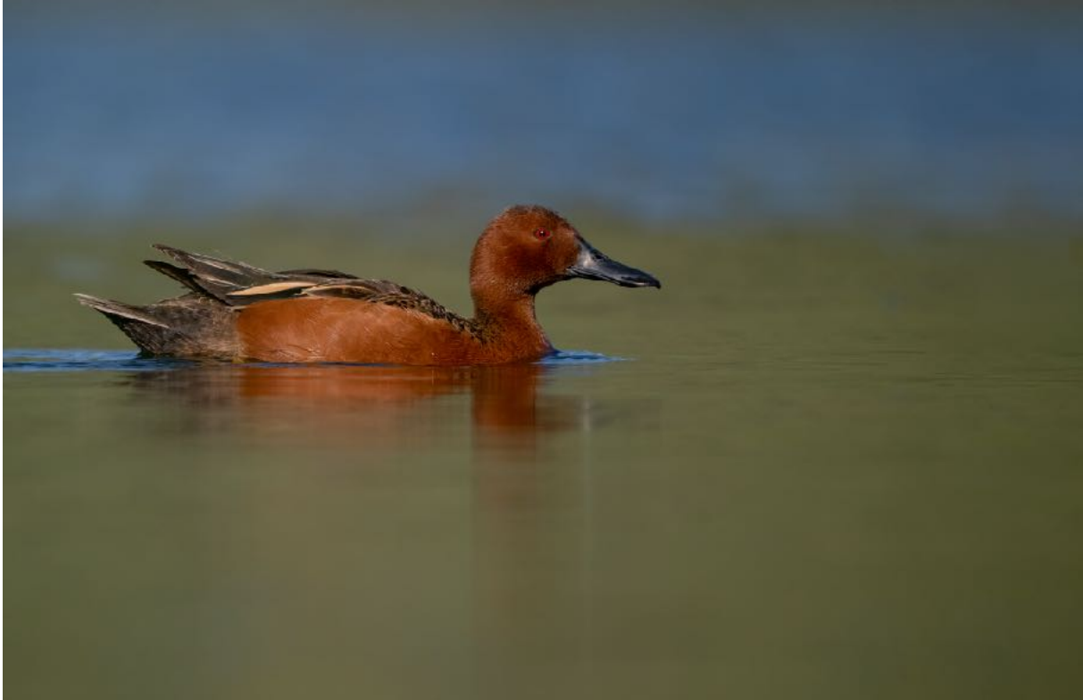
Cinnamon Teal: Photo by Guide - Ben Knoot