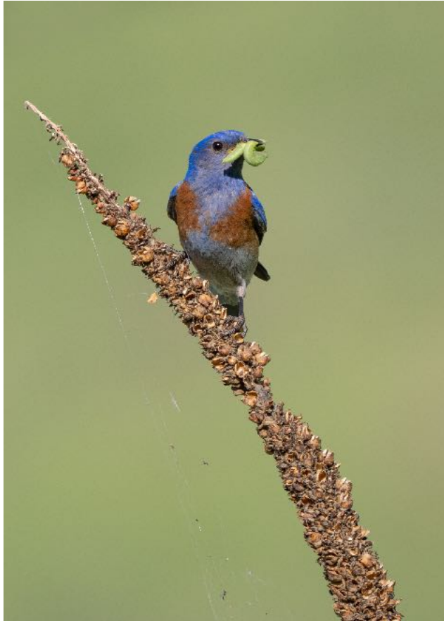
Western Bluebird