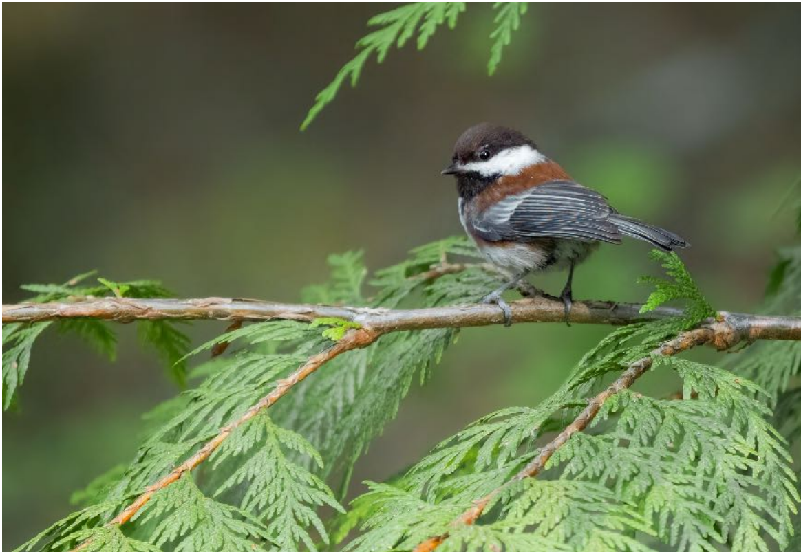
Chestnut-backed Chickadee: Photo by Guide - Ben Knoot