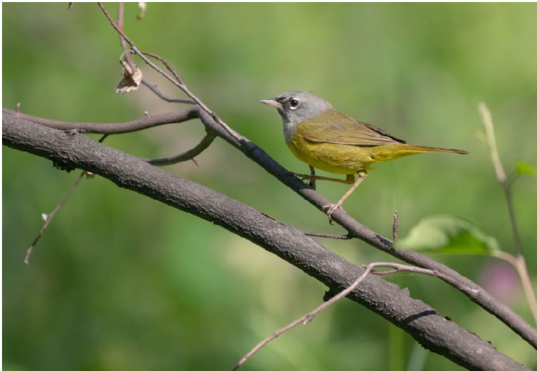
MacGillivray's Warbler: Photo by Guide - Ben Knoot