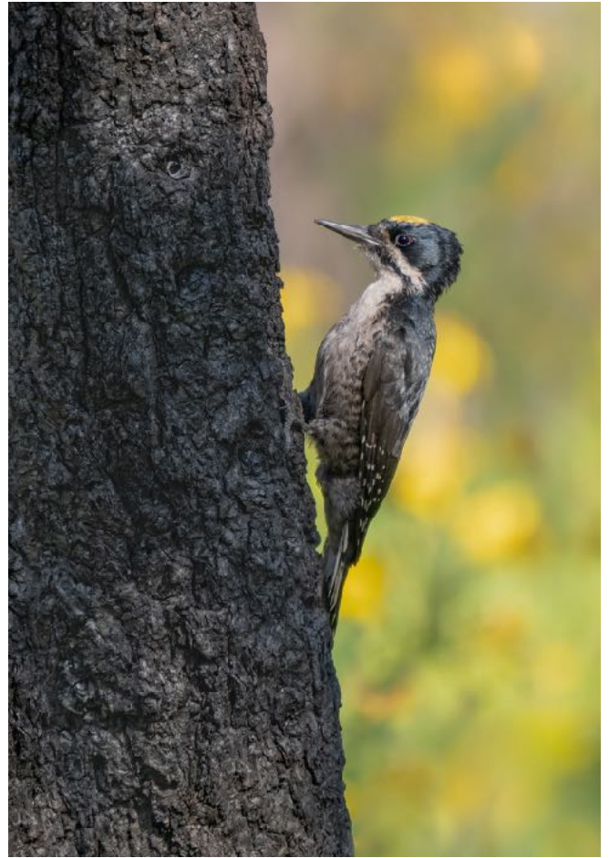
Black-backed Woodpecker: Photo by Guide - Ben Knoot