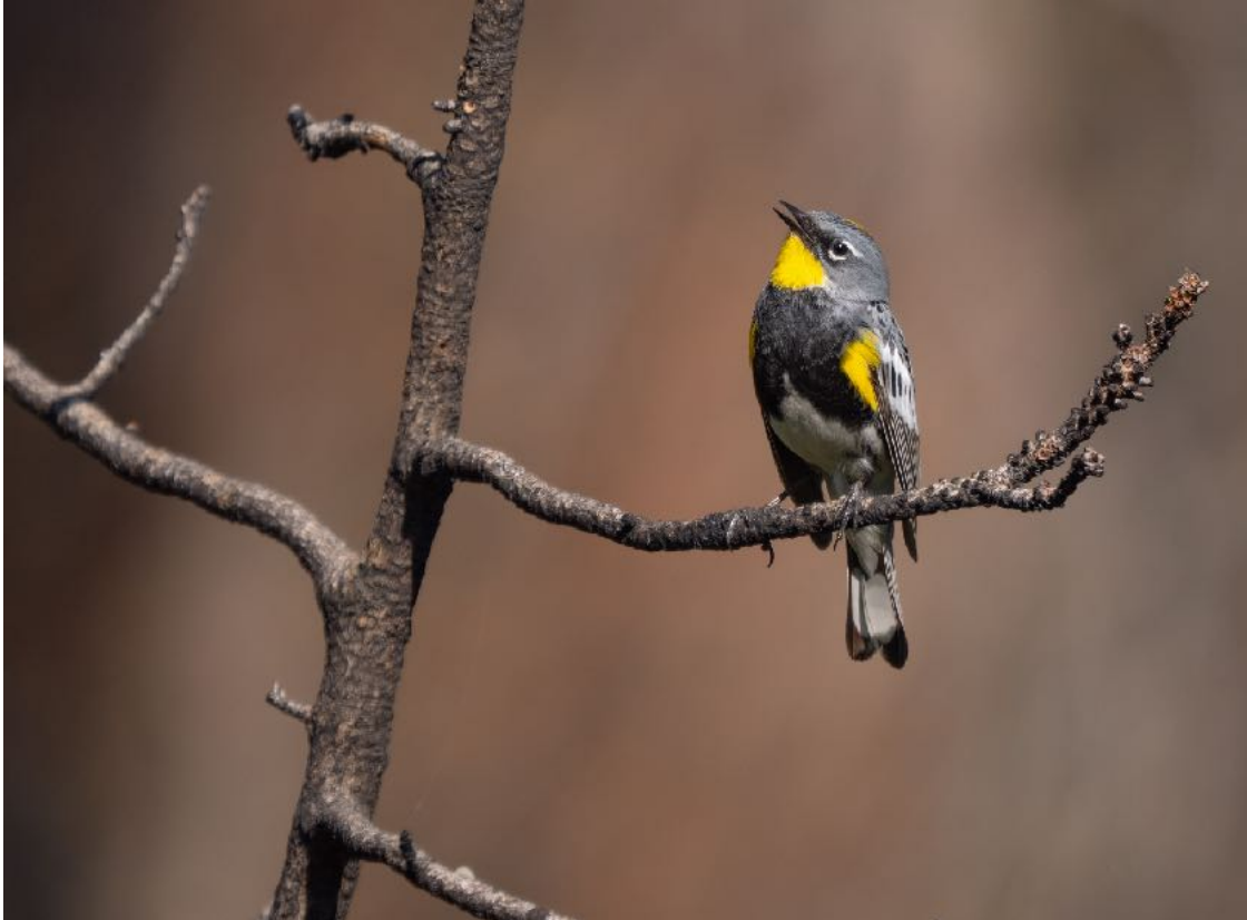
Yellow-rumped Warbler: Photo by Guide - Ben Knoot