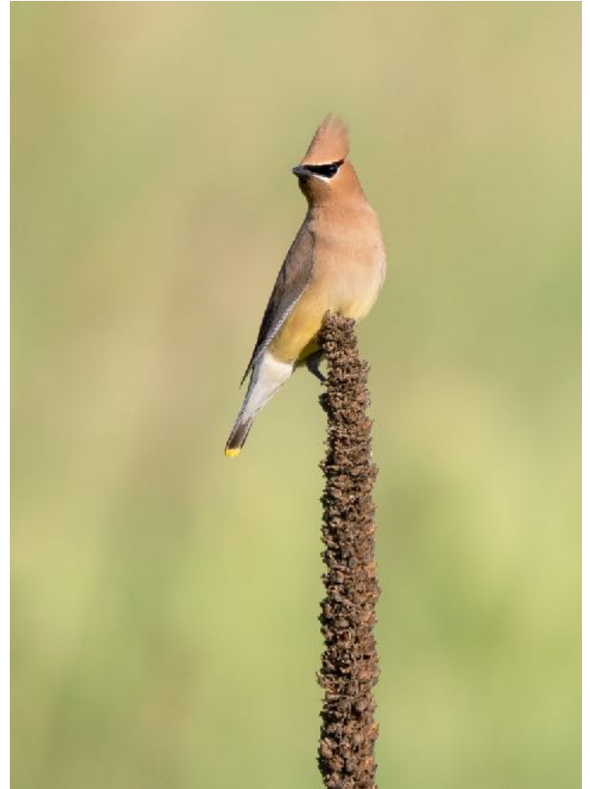
Cedar Waxwing: Photo by Guide - Ben Knot