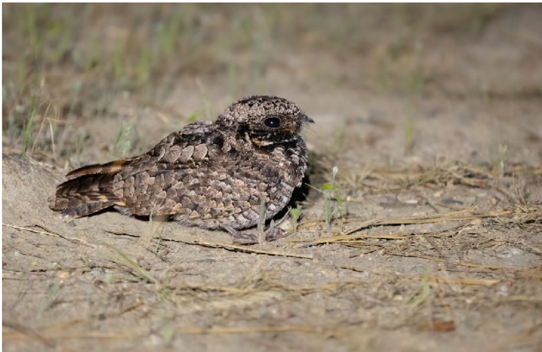
Common Poorwill: Photo by Guide - Ben Knoot