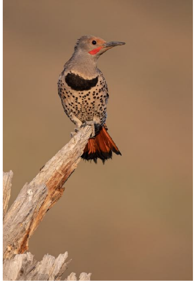
Northern Flicker: Photo by Guide - Ben Knoot