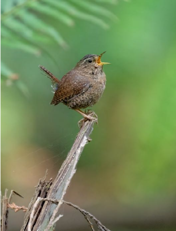
Pacific Wren: Photo by Guide - Ben Knoot