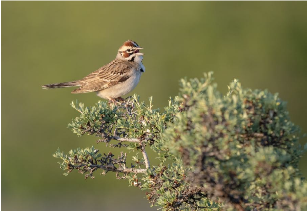
Lark Sparrow: Photo by Guide - Ben Knoot