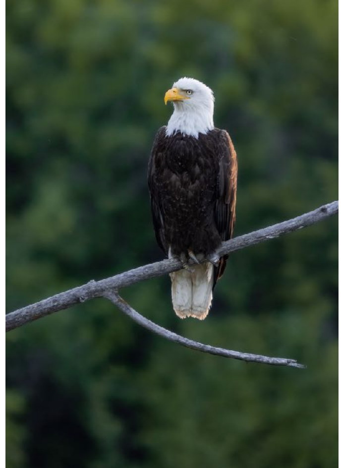
Bald Eagle: Photo by Guide - Ben Knoot