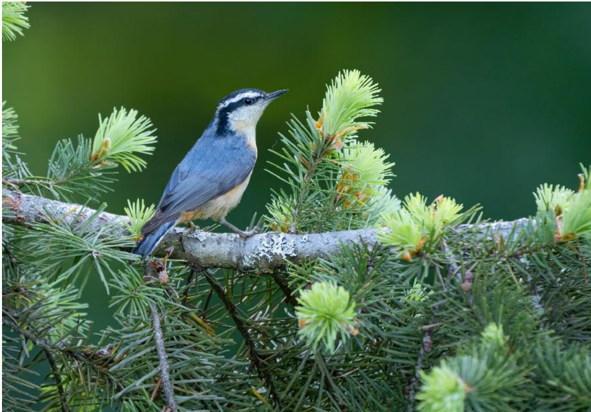
Red-breasted Nuthatch: Photo by Guide - Ben Knot