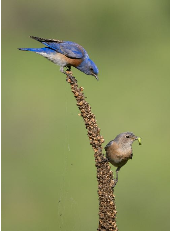
Western Bluebird: Photo by Guide - Ben Knot