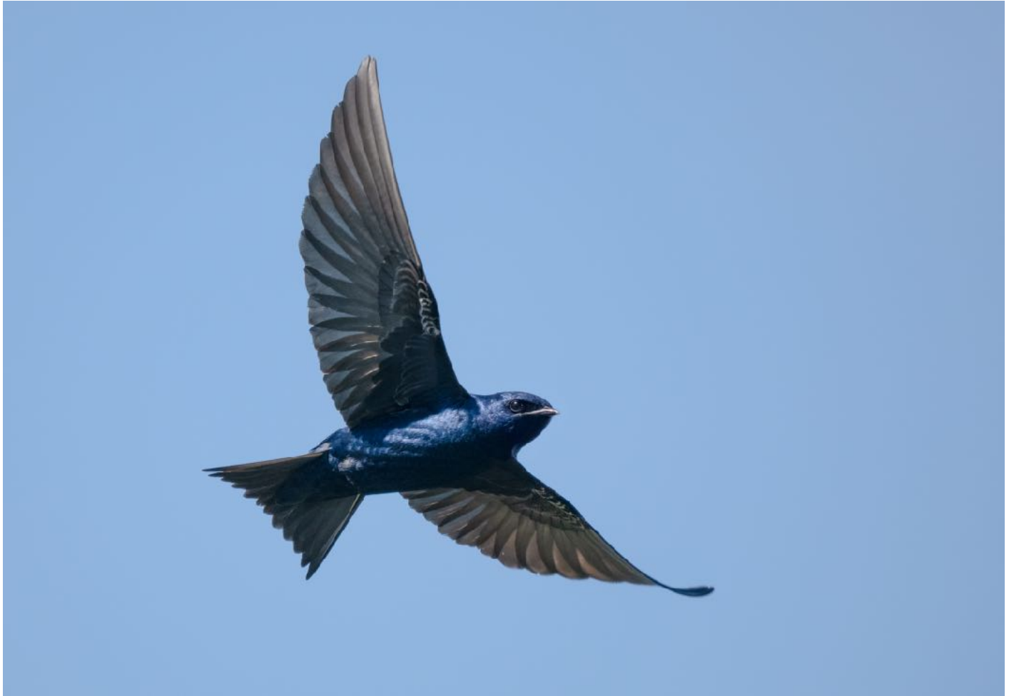
Purple Martin: Photo by Guide - Ben Knoot

*A gallery of ALL of the photos taken by Ben on this tour can be seen by copy and pasting this link into your browser: