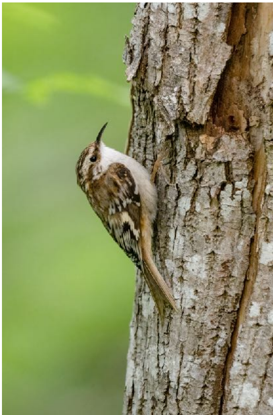
Brown Creeper: Photo by Guide - Ben Knoot

The afternoon arrival as mentioned in the introduction is as much target shooting as it is me figuring out the group and what is going to be best for them going forward during this tour. The few parks we visit typically include some sort of body of water, large stands of Douglas fir trees, thick understories of Salmon & Black Berry bushes and the occasional absolutely stunning Big Leaf Maple. Overall the afternoon was a bit slow. The forests were dark and quiet but we ended up having a few nice shoots with a Wilson's Warbler and a very cute and cooperative Brown Creeper .