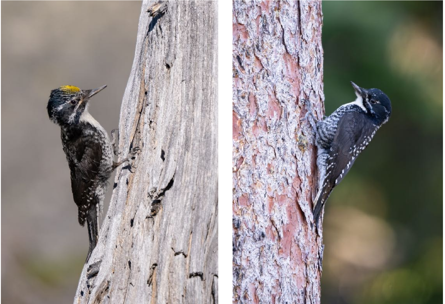
American Three-toed Woodpecker (male left, female right)

Our last day is a travel day from Winthrop to Seattle. There are two routes we can take but since we had done so well in the southern region, we decided to go north and test our luck with the hardest woodpecker on our roster. The American Three-toed Woodpecker isn't one that is readily available every year even though I have some very good spots for this bird, it can still be very tricky which is why I typically leave it until everything else is photographed well. I am delighted to say that we NAILED IT. A fantastic woodpecker finale to what the guests were calling "A Woodpecker Tour".