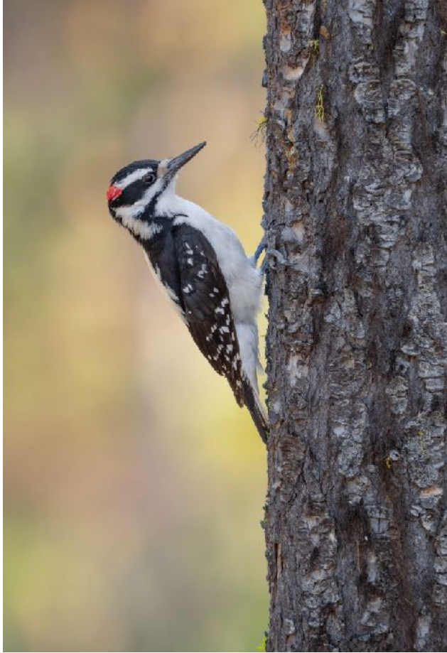
Hairy Woodpecker: Photo by Guide - Ben Knot