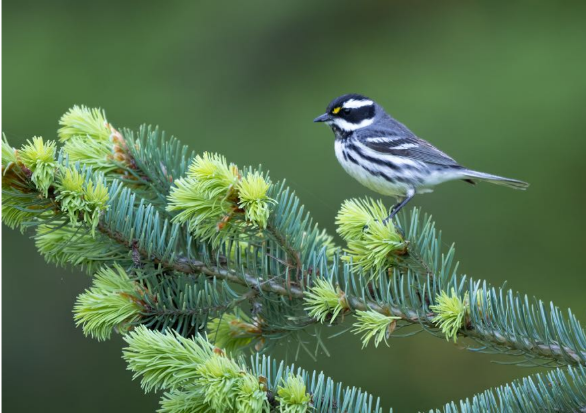
Black-throated Gray Warbler: Photo by Guide - Ben Knot