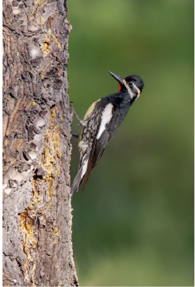
Williamson's Sapsucker: Photo by Guide - Ben Knot