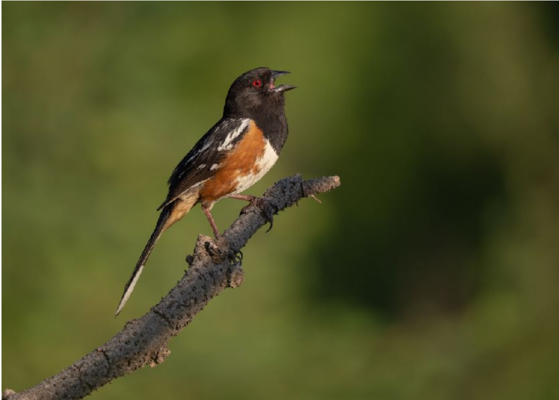
Spotted Towhee: Photo by Guide - Ben Knoot