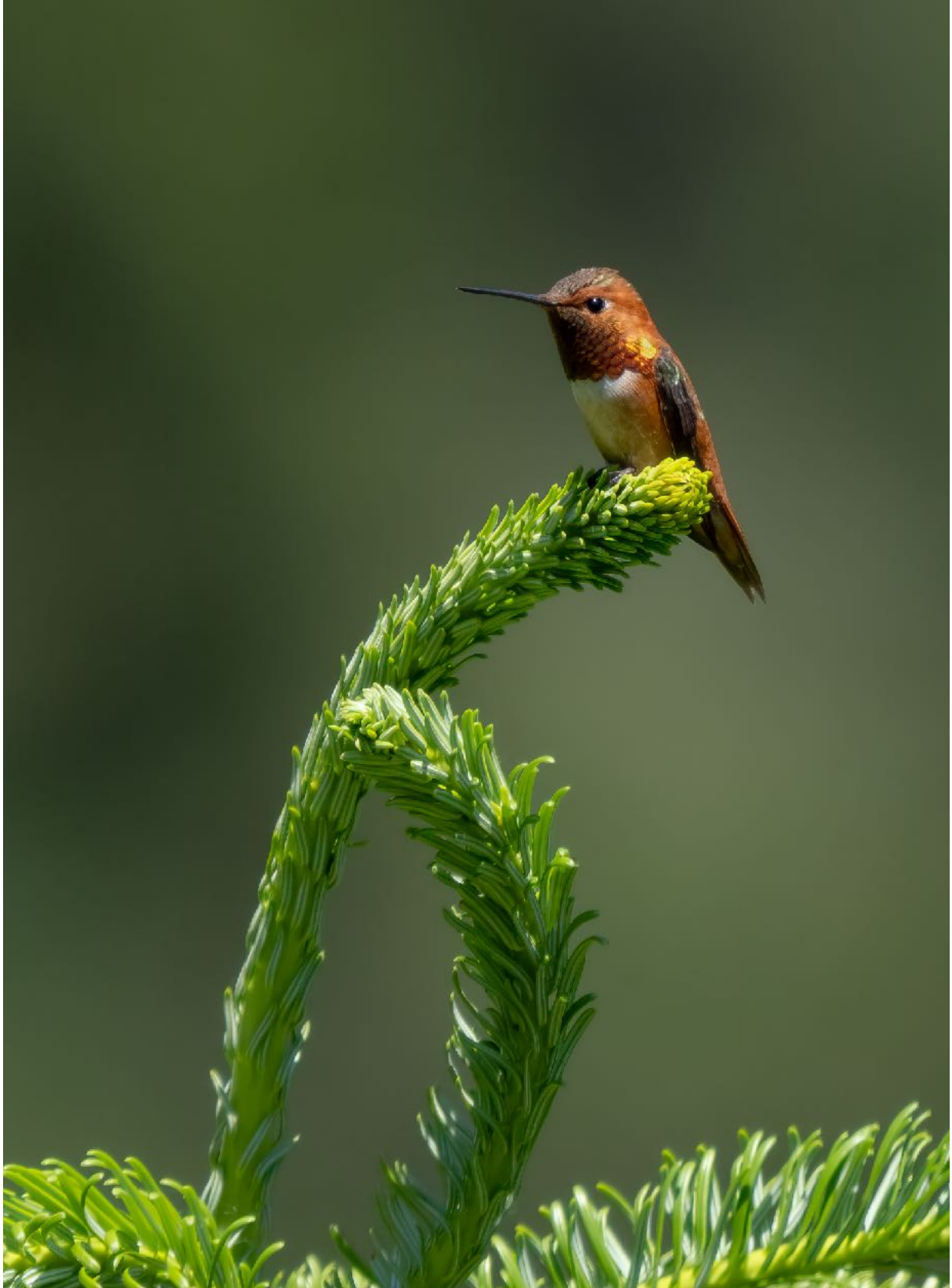
Rufous Hummingbird: Photo by Guide - Ben Knoot