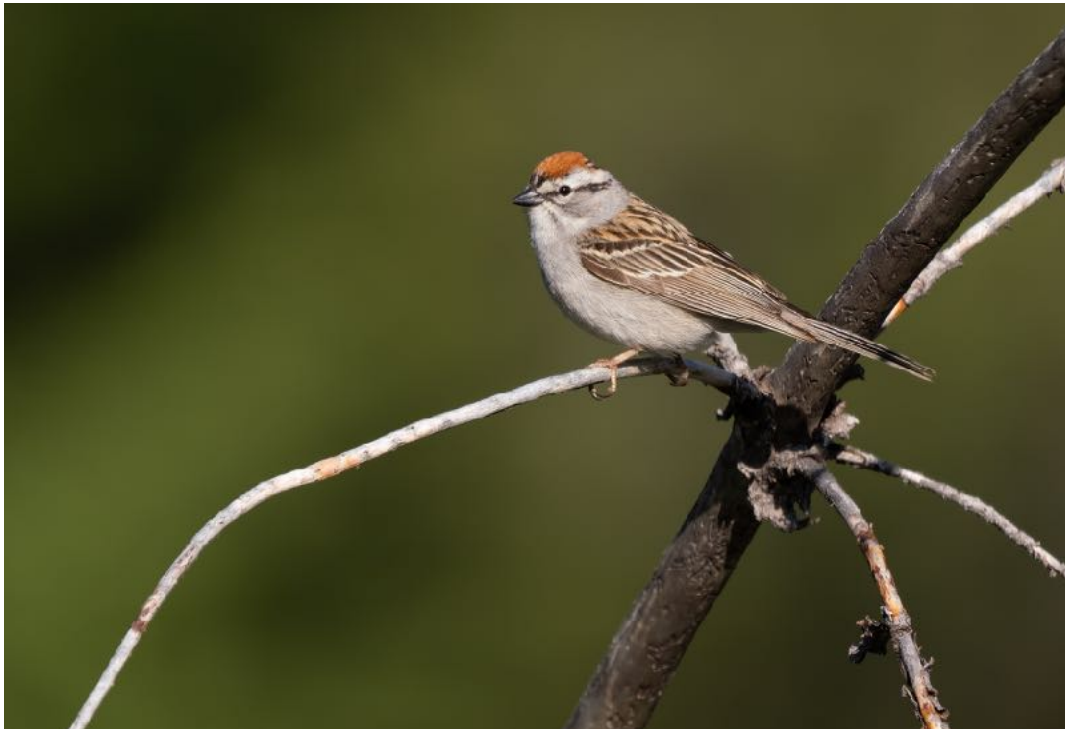
Chipping Sparrow: Photo by Guide - Ben Knot