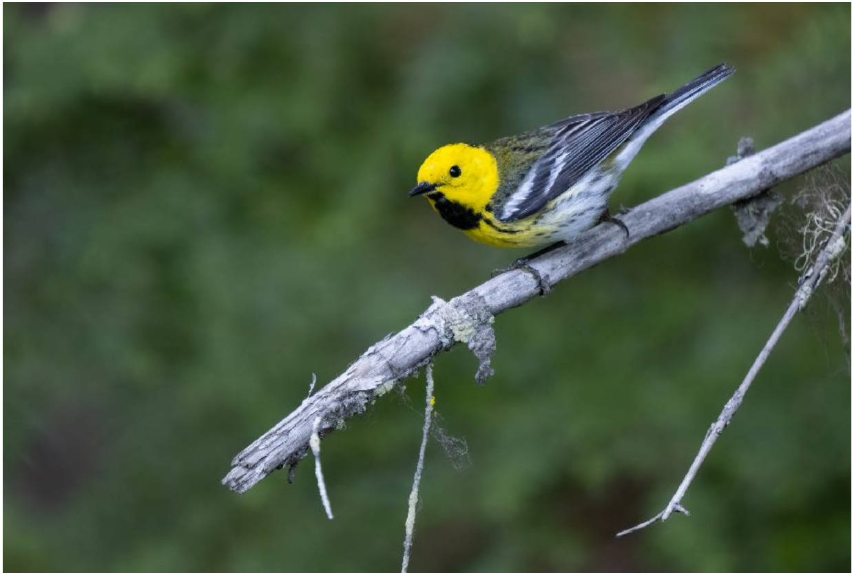
Hermit Warbler (Hybrid w/Townsend's)