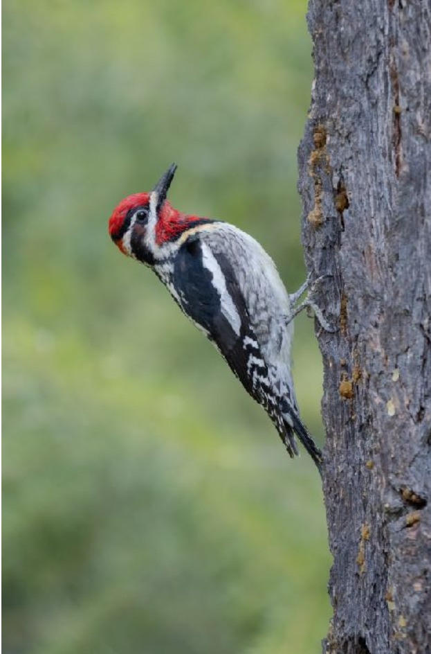
Red-naped Sapsucker: Photo by Guide - Ben Knoot