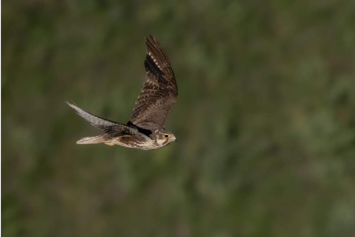
Prairie Falcon