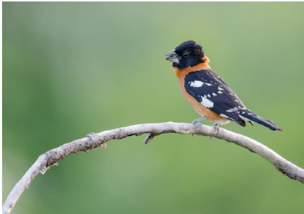
Black-headed Grosbeak: Photo by Guide - Ben Knoot