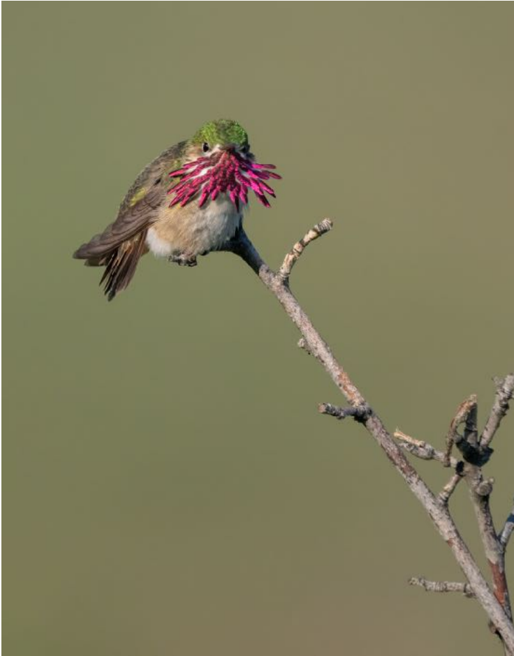
Calliope Hummingbird