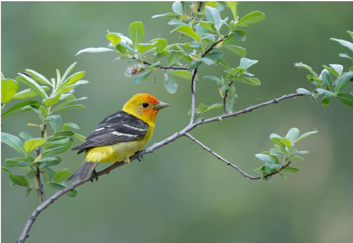
Western Tanager: Photo by Guide - Ben Knoot