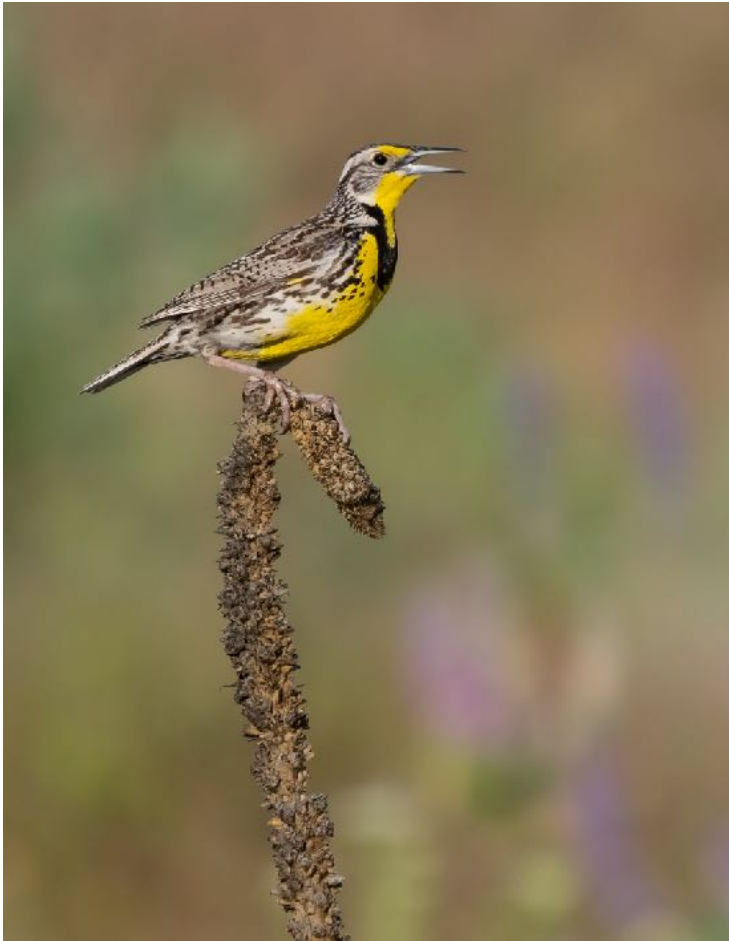
Western Meadowlark: Photo by Guide - Ben Knoot