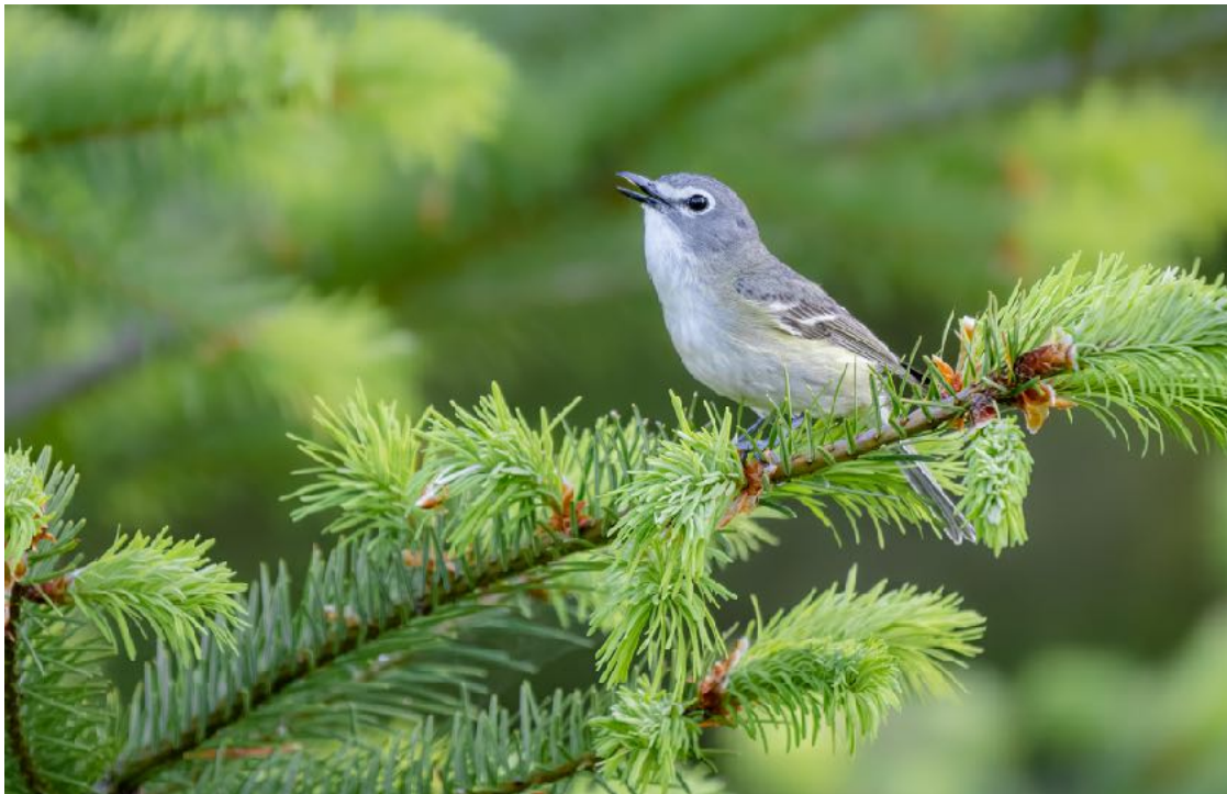
Cassin's Vireo: Photo by Guide - Ben Knoot