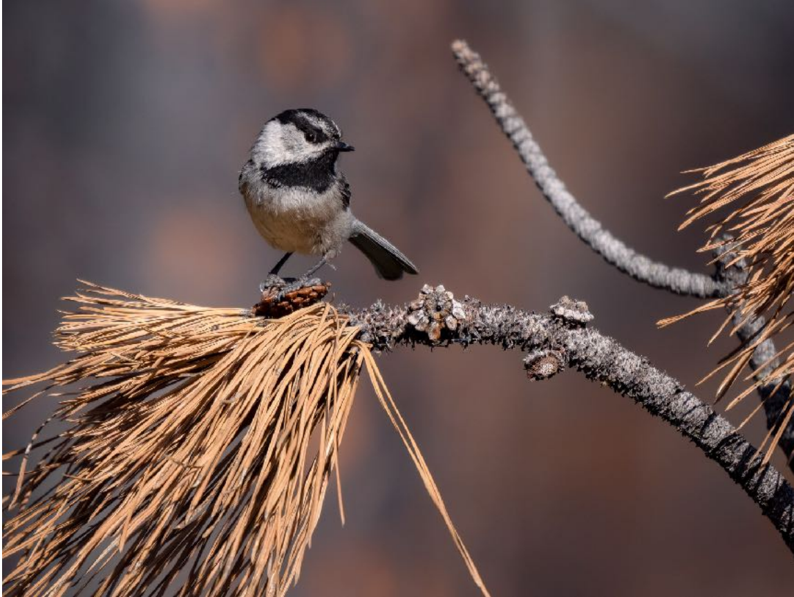
Mountain Chickadee: Photo by Guide - Ben Knoot