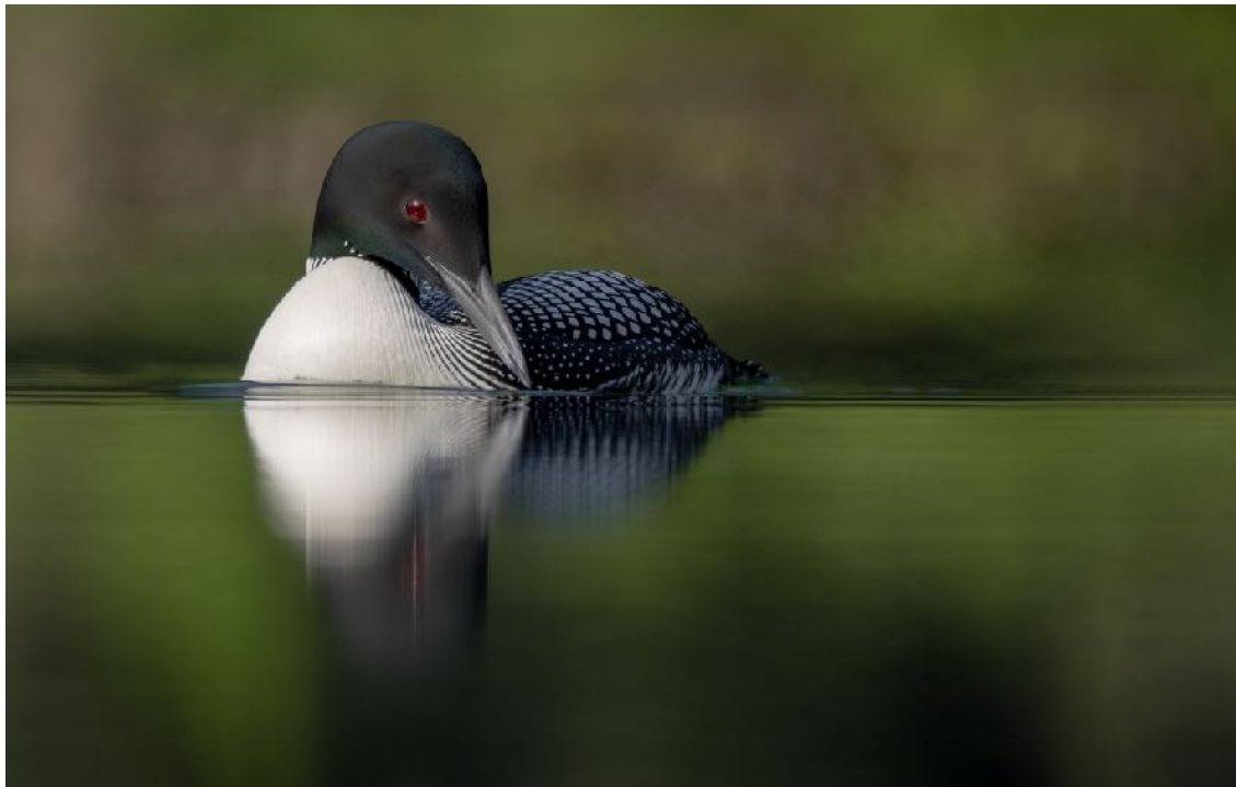
Common Loon: Photo by Guide - Ben Knoot