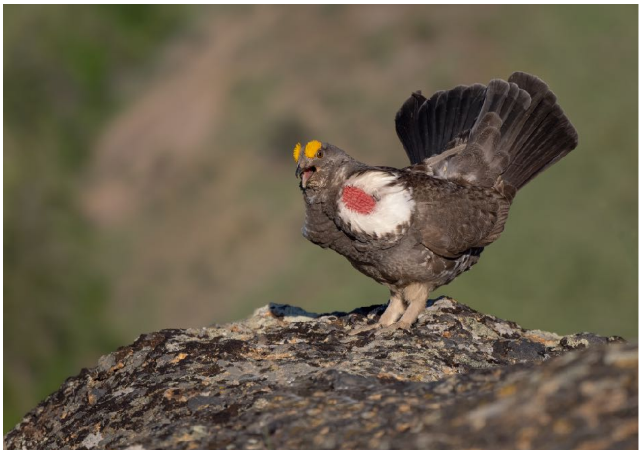
Dusky Grouse: Photo by Guide - Ben Knot