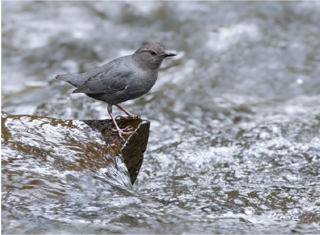
American Dipper: Photo by Guide - Ben Knot