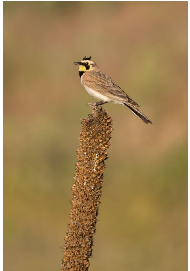
Horned Lark: Photo by Guide - Ben Knoot