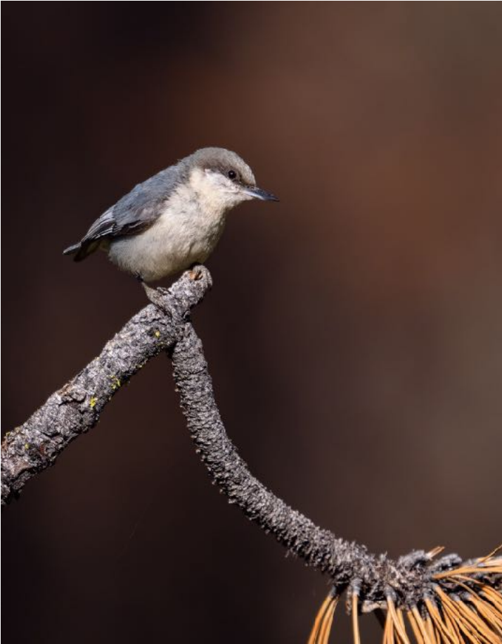
Pygmy Nuthatch: Photo by Guide - Ben Knoot