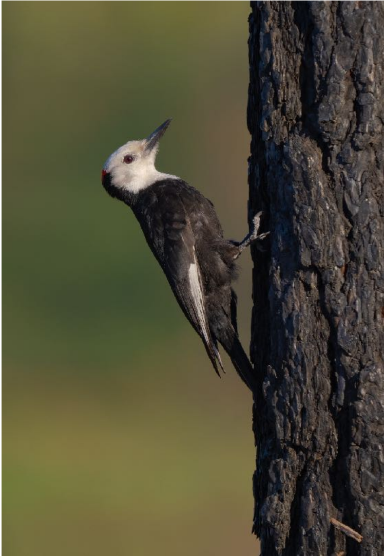
White-headed Woodpecker: Photo by Guide - Ben Knoot