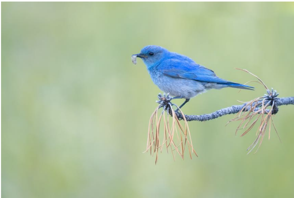
Mountain Bluebird: Photo by Guide - Ben Knoot