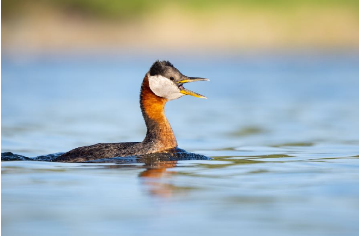
Red-necked Grebe: Photo by Guide - Ben Knoot