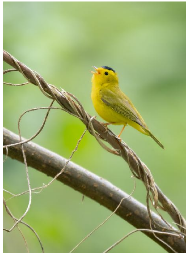
Wilson's Warbler: Photo by Guide - Ben Knoot