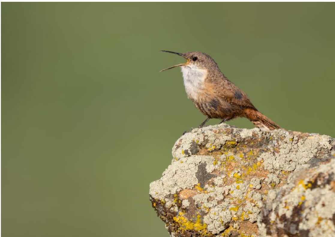
Canyon Wren: Photo by Guide - Ben Knoot