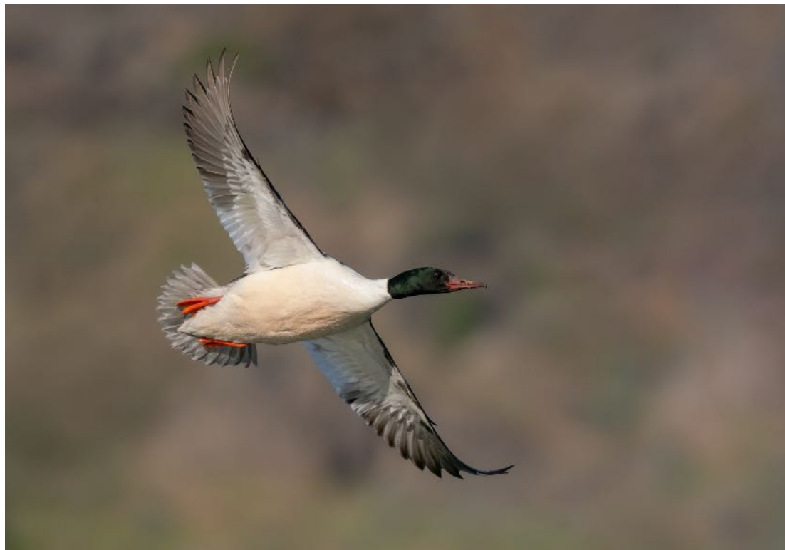
Common Merganser: Photo by Guide - Ben Knot