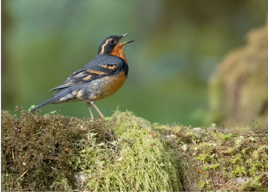
Varied Thrush: Photo by Guide - Ben Knoot