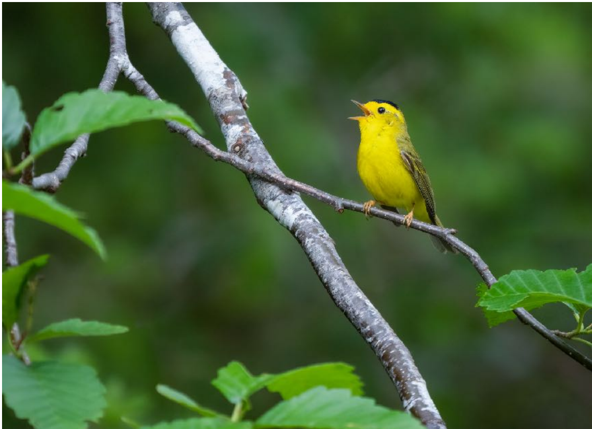
Wilson's Warbler: Photo by Guide - Ben Knot