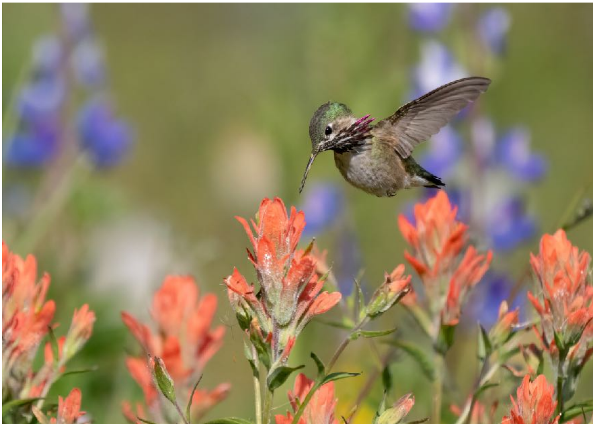
Calliope Hummingbird: Photo by Guide - Ben Knot