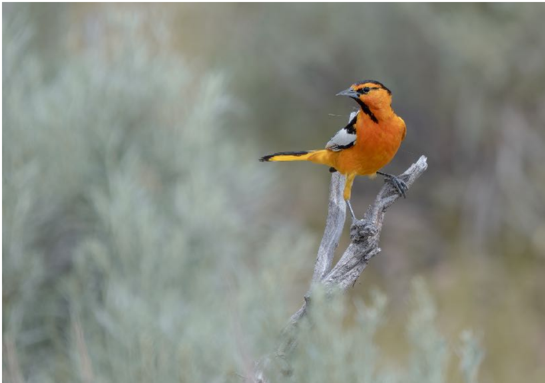
Bullock's Oriole: Photo by Guide - Ben Knoot