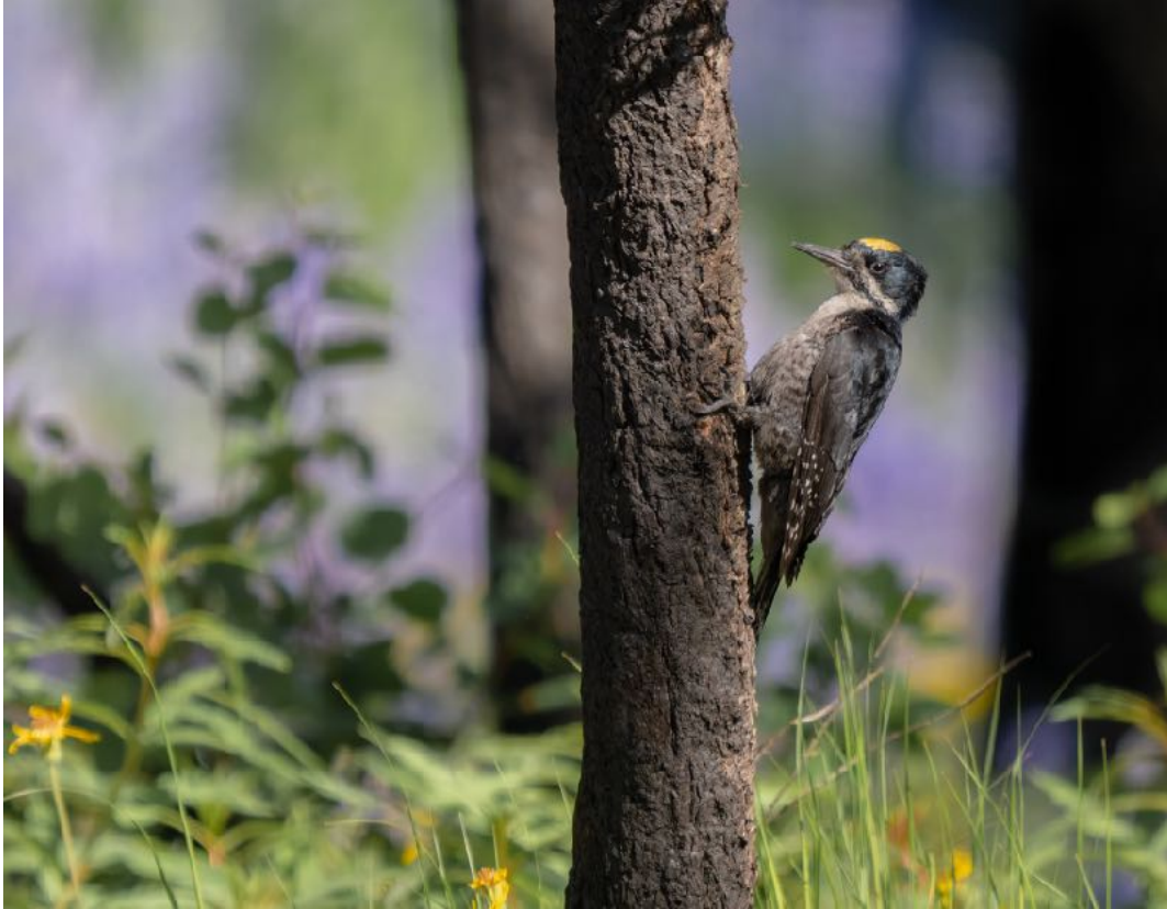
Black-backed Woodpecker: Photo by Guide - Ben Knot