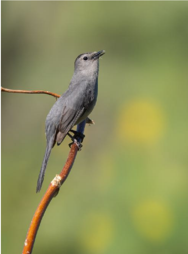
Gray Catbird: Photo by Guide - Ben Knoot