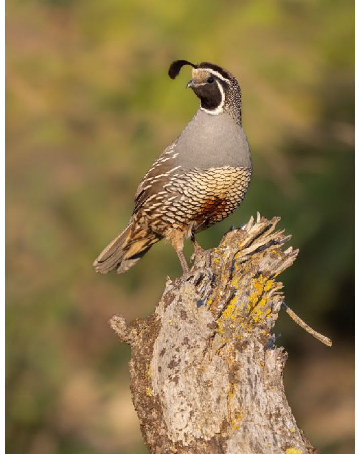
California Quail: Photo by Guide - Ben Knoot