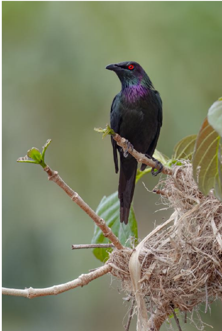
Metallic Starling

After a quick lunch, we set off for some target chasing. We started with one of my personal favorite photo locations for the Metallic Starling in Mossman . The colony here is among the lowest I've seen...and what I mean by that is that the nests hang low in the trees which are also easily accessible, have good background opportunities and typically, very cooperative birds. Overall this is just a darn good spot to enjoy these birds!