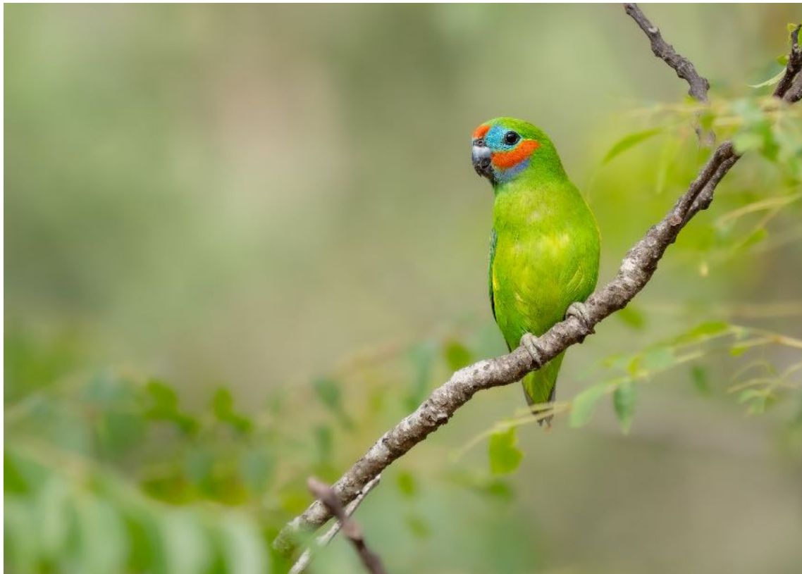
Double-eyed Fig Parrot

When we got back from the boat cruise we had a few hours so we decided to visit Centenary Lakes for the rest of the afternoon. Here the freshwater and saltwater lakes along with the mangroves and forests held a few new birds for us. Birds like; Radjah Shelduck , Pacific Black Duck , Australian Brush Turkey , Orange-footed Megapode , Australian Grebe , Rock Pigeon , Fan-tailed Cuckoo , Australian Swiftlet , Plumed Egret , Little Egret , Osprey , Brown Goshawk , Brahminy Kite , Torresian Kingfisher , Dollarbird , Red-tailed Black Cockatoo , Double-eyed Fig Parrot , Scaly-breasted Lorikeet , Yellow Honeyeater , Dusky Myzomela , Helmeted Friarbird , Varied Triller , Black Butcherbird , Spangled Drongo , and a few of the common birds like House Sparrow and Welcome Swallow . We also had the pleasure of seeing the very cool and unique Krefft's River Turtle . Great day all around!