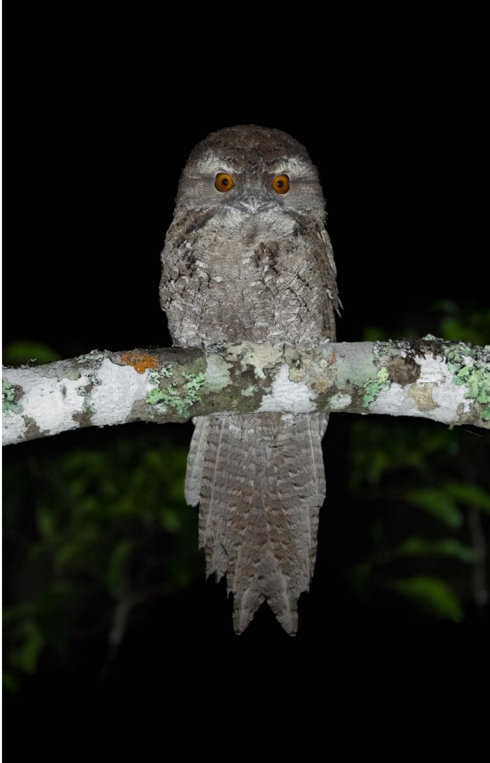
Marbled Frogmouth

Now it was time for a date with a superb mammal. We entered Whites Hill Park and were elated to find six (6) Koala not far from the parking lot...so cool!! A quick check at a local roost allowed us some great views of an adult and juvenile Powerful Owl .