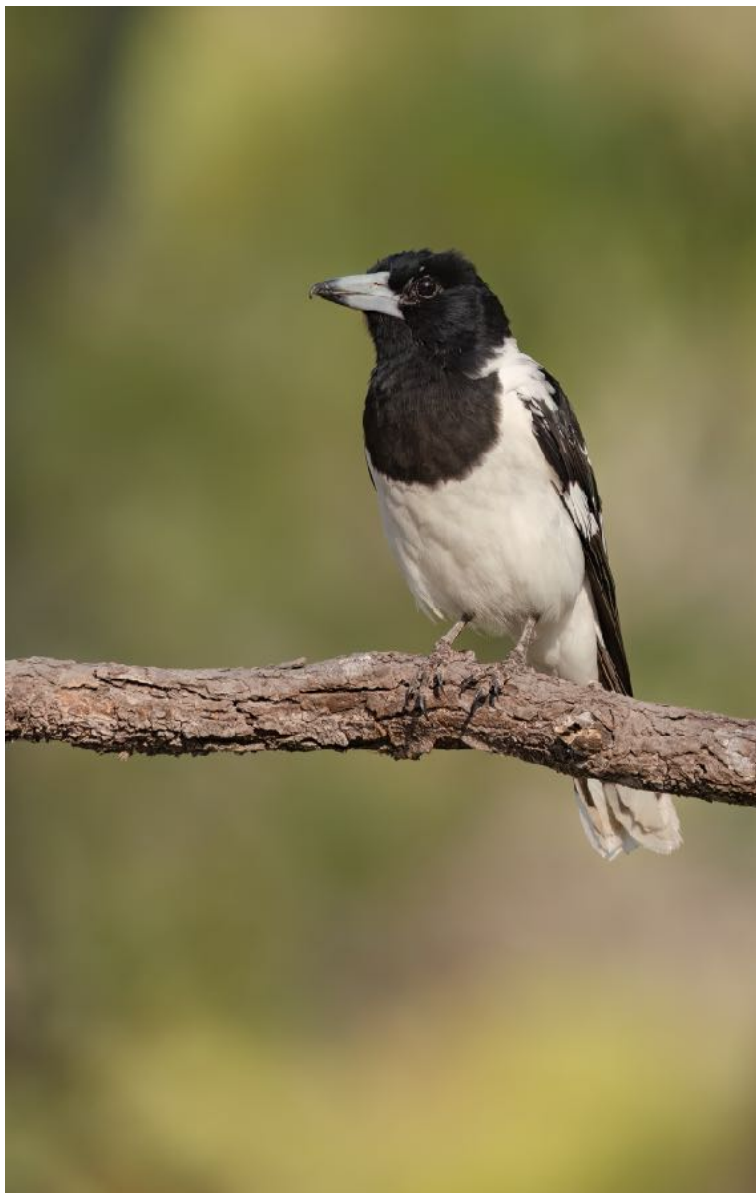
Pied Butcherbird

Finally it was time for the main location of the afternoon, Mt. Carbine RV Park . In this dry forested area we picked up some great new birds like; Tawny Frogmouth , Torresian Crow , Red-tailed Black Cockatoo , Galah , Apostlebird , Great Bowerbird , Pied Butcherbird , Australian Magpie , Blue-winged Kookaburra , Red-winged Parrot , and Blue-faced Honeyeater . One last stop at the Mareeba Golf Course gave us another shot at some Eastern Gray Kangaroos and a pretty sweet Brush Cuckoo .