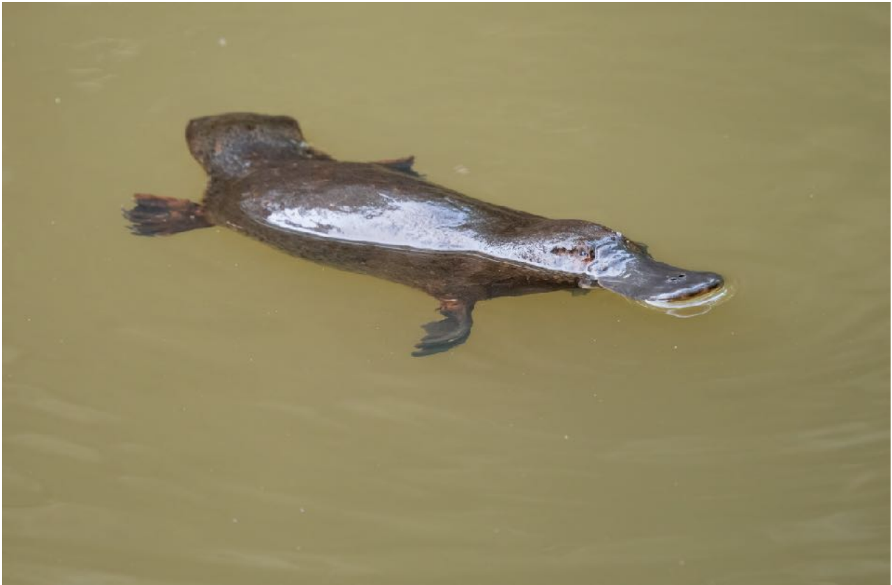
Duck-billed Platypus - Photo by Guide: Ben Knoot

Now that it was nearing sunset, we had a very important appointment to keep. We hustled over to Peterson Creek “Allumbah Pocket” . Here we have three targets and I am stoked to report that we found all three. We started off with a pair of Lumholtz’s Tree Kangaroo , then a colony of Spectacled Flying Fox and finally, an amazing experience with a Duck-billed Platypus . Stupendous afternoon!