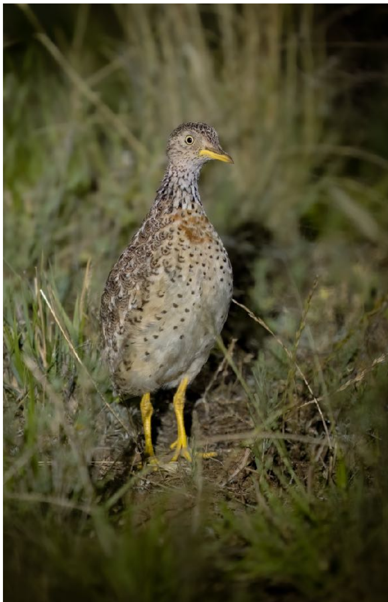
Plains Wanderer