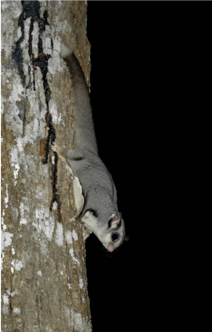
Krefft's Glider