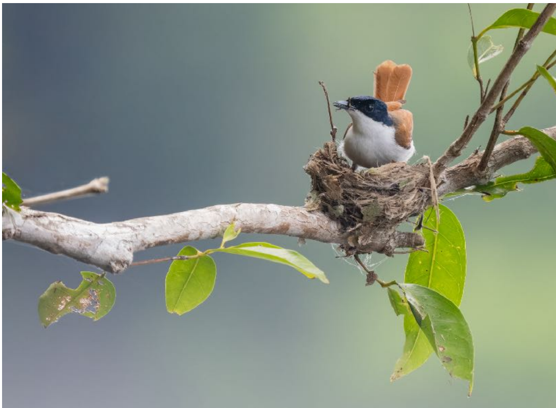
Shining Flycatcher (female)

As our cruise wasn't until 9am, we tried again for the Buff-breasted Paradise Kingfisher with the same sort of luck as before...not good enough yet again. On the way to the ferry a few of us managed to get on a Pacific Emerald Dove . On the ferry itself we had a flyby Striated Heron . After we crossed the ferry, we ventured down Steward Creek Road . This bit of rainforest is often quite good. We struck gold quickly with a Lovely Fairywren , Pacific Koel , Channel-billed Cuckoo , Mistletoebird and Tree Martin .