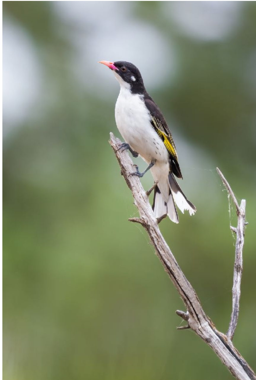
Painted Honeyeater

Our next stop was in Darlington Point . I typically drive around here until I find our target. This time as it was last time, was quite easy. We ran into a small group of Long-billed Corella feeding in a random grassy field. Alongside them we also had a surprise group of Superb Parrot . Unexpected and very nice! Next up was a great area I have had a lot of luck with in the past called McCann Road . Here we were treated to our first Shingleback Lizard ! We also managed to get the primary honeyeater target for this area and one of my personal favorites, the Painted Honeyeater along with Purple-backed Fairywren , Double-barred Finch and Little Crow .