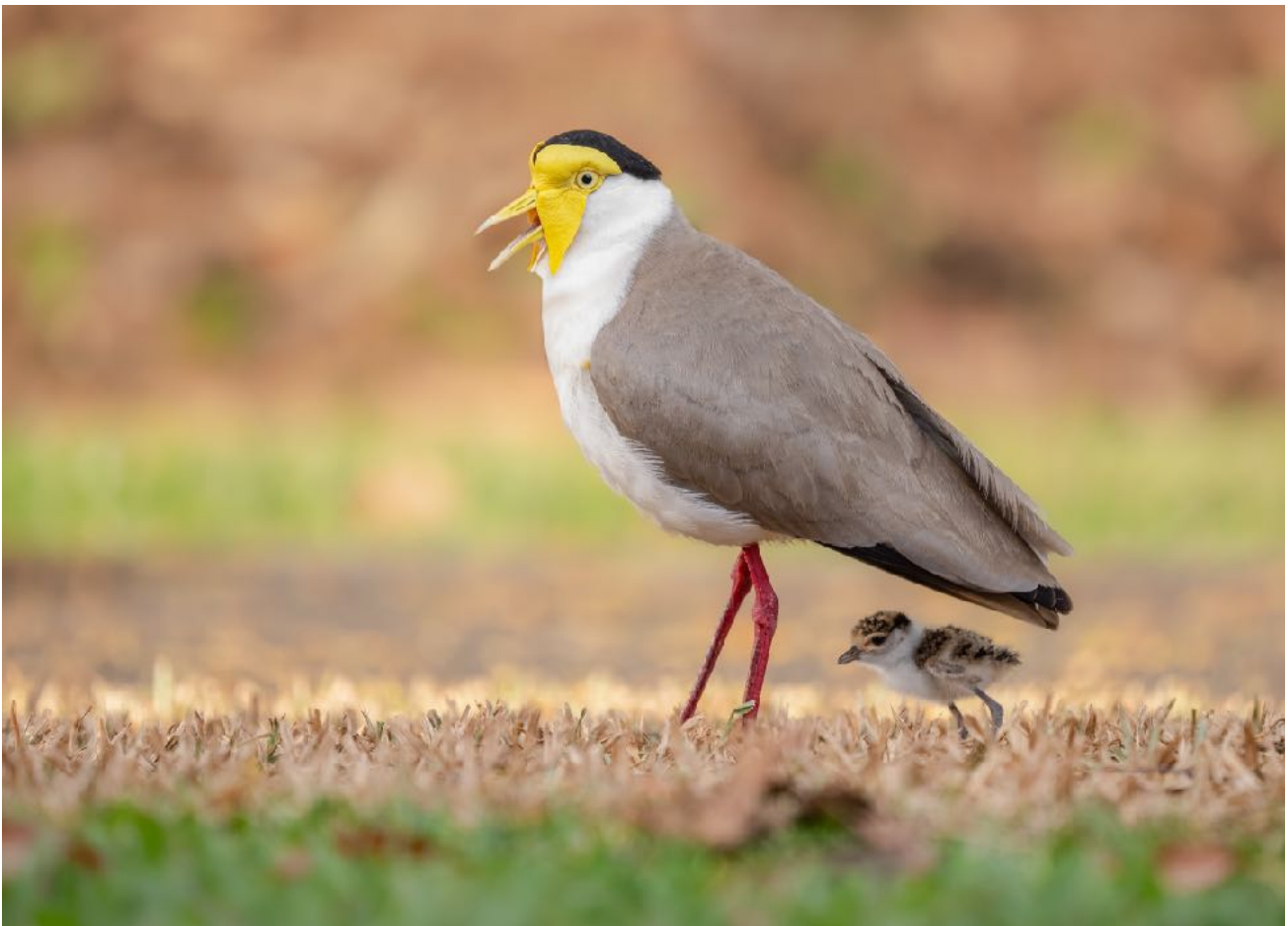
Masked Lapwing

Onward now to the main even for the afternoon. An hour and a half journey south we started some afternoon birding along Etty Bay Road . Here we picked up the more common and abundant birds like; Metallic Starling, Bar-shouldered, Spotted and Peaceful Dove, Bush Thick-knee, Rainbow Bee-eater, White-breasted Woodswallow, Forest Kingfisher, Masked Lapwing, Great and Eastern Cattle Egret, White-bellied Sea-eagle, Black Kite, Sulphur-crested Cockatoo, Rainbow Lorikeet, Australasian Figbird, Willie Wagtail, Magpie Lark and Common Myna . It was lovely to get these common birds out of the way but not what we were here to see.