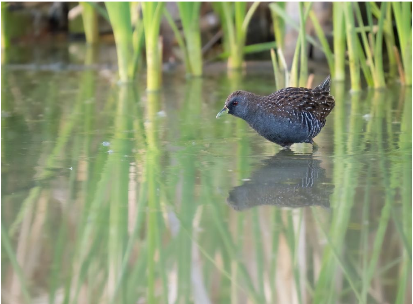
Australian Crake

Today we visit so many different habitats. Everything from trace amounts of Mulga to caravan parks. Most of the birds on today's list are things we have seen before but we added some new birds right off the bat by starting in Fivebough Wetlands . Here we found; Australian , Baillon's and Spotless Crakes , Red-necked Avocet , Red-kneed Dotterel , Whiskered Tern , Little Grassbird , Golden-headed Cisticola , and a very cool Red-bellied Black Snake .