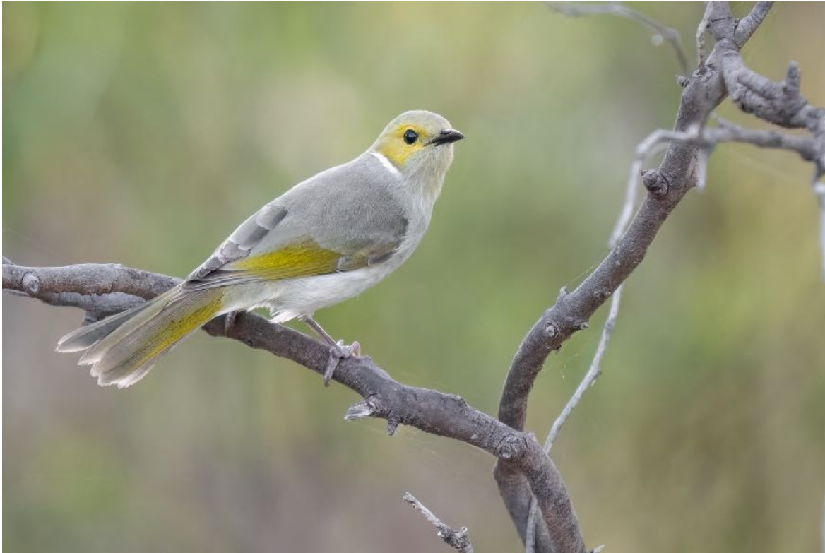
White-plumed Honeyeater

After a quick visit there, we made our way into the main location for the morning, the Capertee Valley . Hot and dry conditions here but we still managed some great birds like; Spotted Pardalote , Weebill , White-browed Woodswallow , Restless Flycatcher , White-winged Chough , White-plumed Honeyeater , Rufous Songlark , White-throated Gerygone , White-browed Babbler , Diamond Firetail , Jacky-winter , Crested Shrike-tit , Hooded Robin , Rufous Whistler , Sacred Kingfisher , Red-rumped Parrot and Brown Quail .