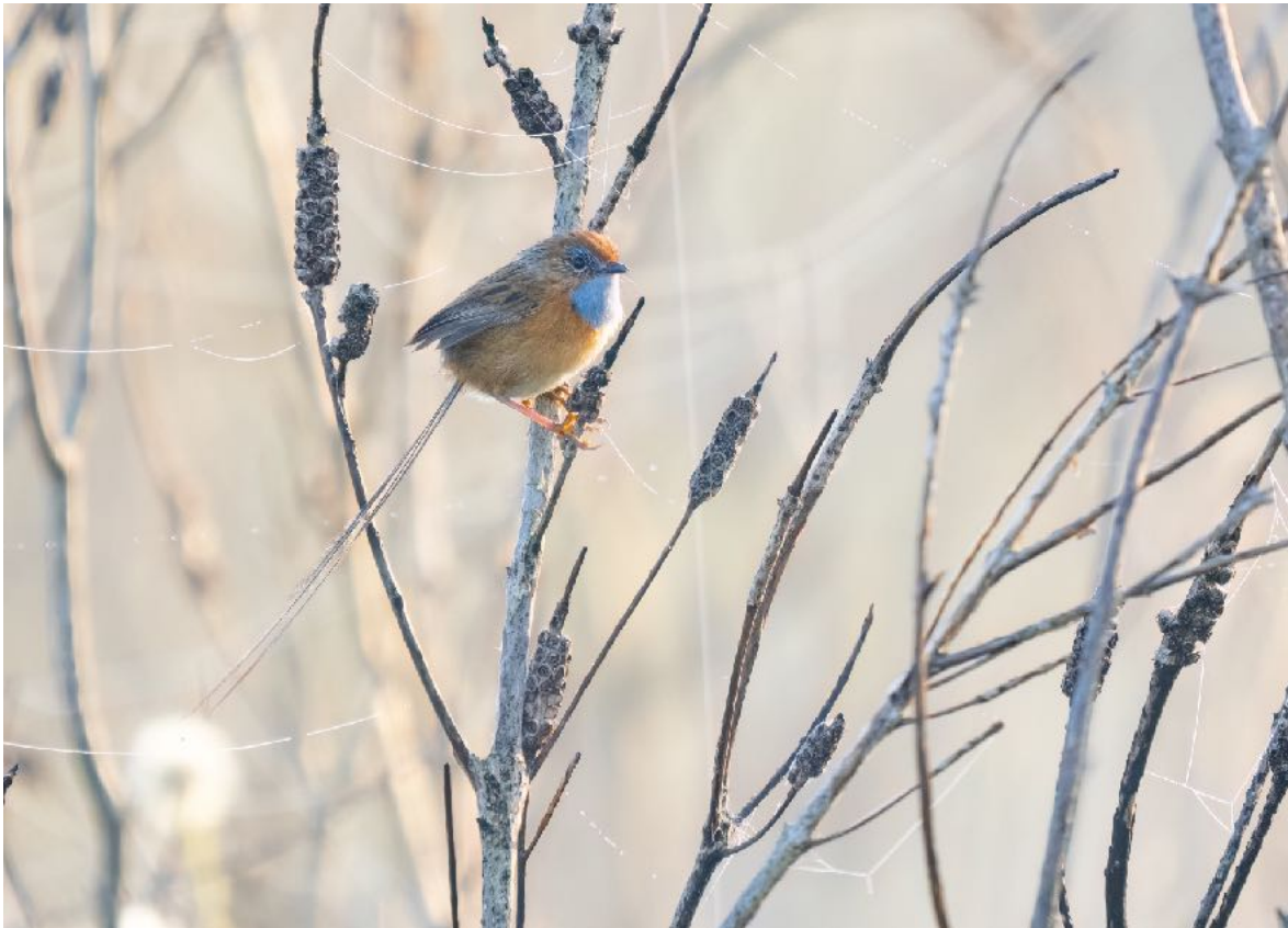
Southern Emu Wren

Our first stop of the day is an early morning walk down Budderoo Fire Trail . It was a nice windless morning and we did get most of our targets which included; Yellow-tailed Black Cockatoo , Southern Emu Wren , New Holland Honeyeater , Eastern Bristlebird and we finally caught up with a Horsfield’s Bronze Cuckoo .