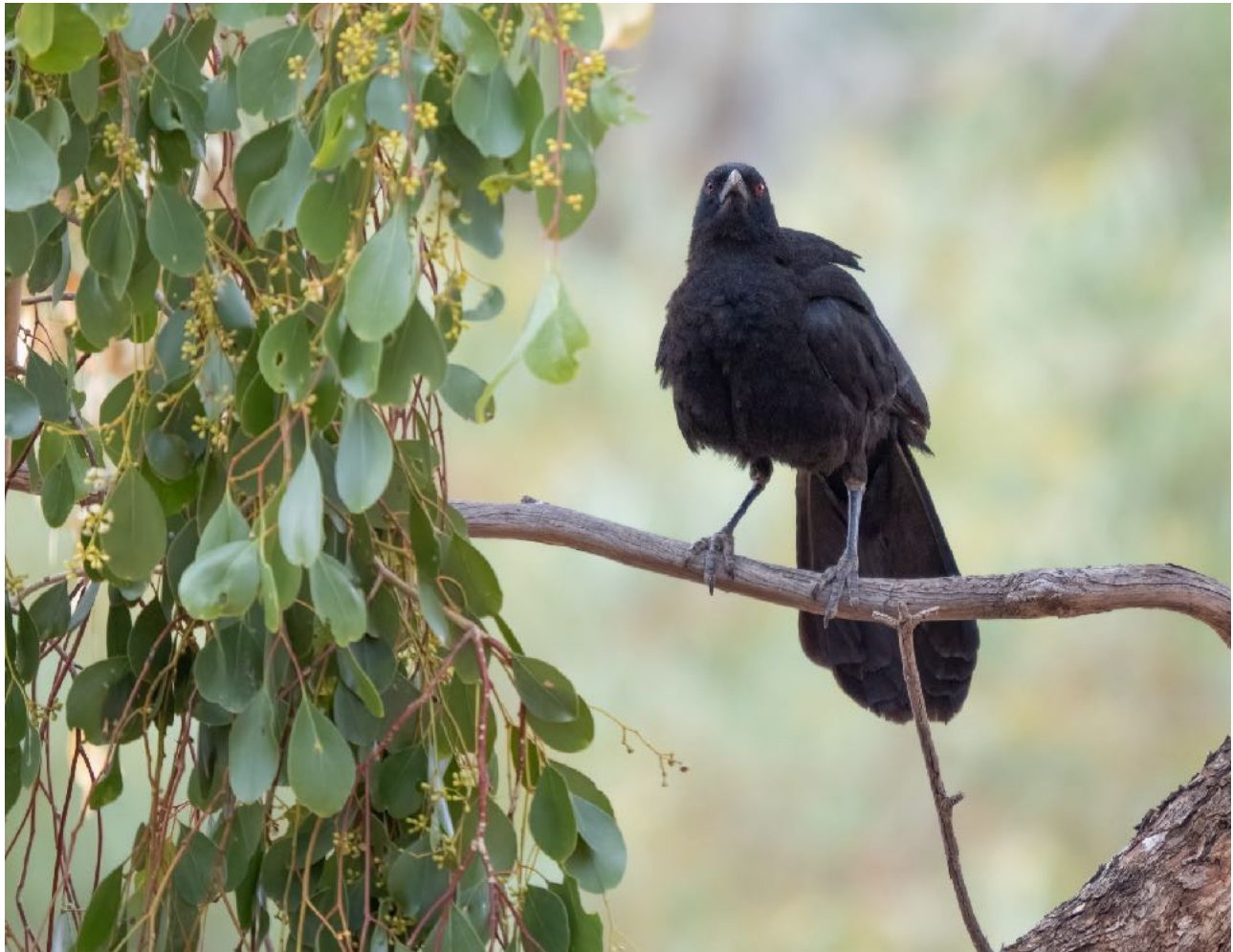
White-winged Cough

Our first stop of the day was the Lithgow Sewage Works . Here we found; Pink-eared Duck , Blue-billed Duck , Chestnut Teal , Australian Shoveler , Hoary-headed Grebe , Eastern Rosella , European Goldfinch , Red Wattlebird , Yellow-rumped Thornbill , Little Raven , Australian Reed Warbler , European Starling , Eurasian Blackbird and Western Gray Kangaroo .