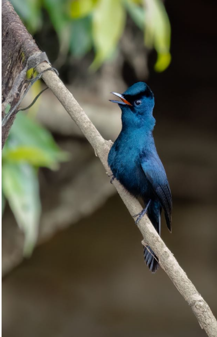
Shining Flycatcher (male)

Now that it was time for our tour we met up with our boat captain and hit the Daintree River Cruise . A lovely few hours on the water gave us views at Azure Kingfisher , Sacred Kingfisher , Great Egret , Shining Flycatcher , Australasian Darter , Great-billed Heron , Little Pied Cormorant and another great sighting of Papuan Frogmouth and surprise White-winged Tern that had wandered inland. We also ran into 'Barrat' the massive Saltwater Crocodile and another Common Tree Snake . Try as we did, we couldn't locate our Little Kingfisher.