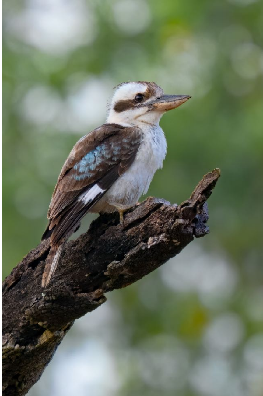
Laughing Kookaburra

After a fairly successful stop here, I decided on a whim to stop off at the Rifle Creek Rest Stop . A decent move as we picked up one of the harder doves, a White-headed Pigeon . We also got some quick looks at White-throated Honeyeater (better looks to come later).