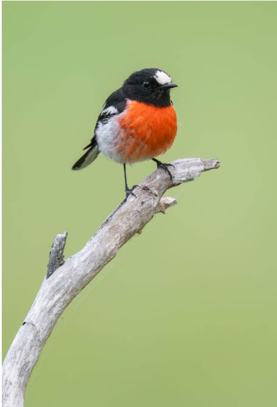
Scarlet Robin

Today was our day on Bruny Island . You can get all 12 endemics on Bruny Island and in just about 5-hours, we managed all but one (but don't worry, we'd get it later). We started with Mission Road and picked up; Black-headed Honeyeater , Tasmanian Thornbill , Blue-winged Parrot , Forest Raven , Dusky Robin , Yellow-throated Honeyeater , Green Rosella , Swift Parrot , and an absolutely stunning display from a Scarlet Robin .