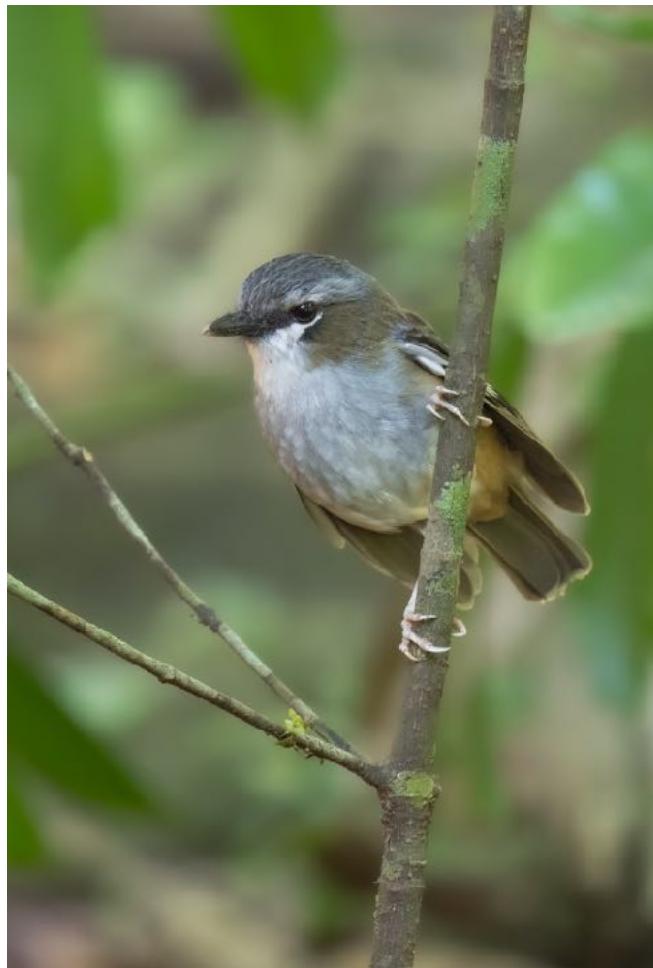
Gray-headed Robin

Our next stop was Hypipamee National Park . I was pretty shocked how quiet this park was this morning but we did end up gathering the last few species we needed. Those were; Mountain Thornbill, Gray-headed Robin and Brown Gerygone .