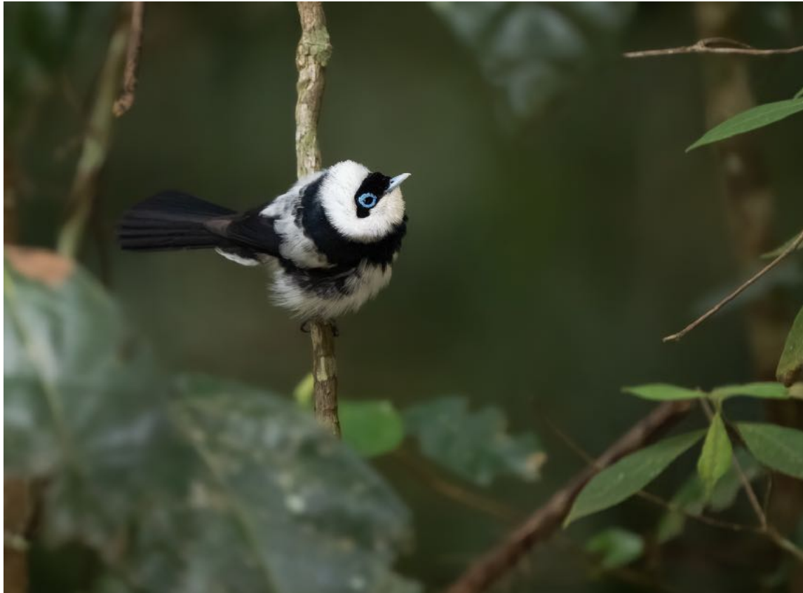
Pied Monarch

After a fun boat ride, we made our way towards Mareeba but first we made a quick stop to Carr Road . Here we found; Red-legged Pademelon , Black-faced , Spectacled and Pied Monarch , and our last fruit dove, the Superb Fruit Dove . And finally, with all of our effort we managed to get everyone on great looks of a Buff-breasted Paradise Kingfisher ...talk about a lot of work for one species!