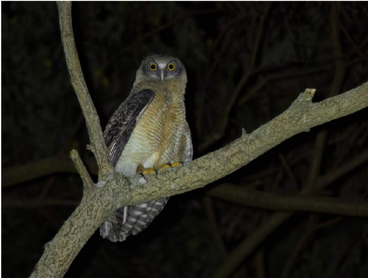
Rufous Owl

Continuing on with our afternoon we head back down south...remember that giant bird and indeed HUGE target we missed on the first day? How could you not...neither did I nor the guests...so round two! Let's do it. We made our way down to Etty Bay once more. This time I used the strategy of literally driving back and forth as not to put all of our eggs in one basket. And this time...it paid off. We were able to have a unique experience with a Southern Cassowary hanging out in a persons yard. We watched as their tiny child ran around nearly naked by this monstrous beast of a bird. What a hoot! A weird experience with a weird bird and a huge weight lifted. On this stretch of road while everyone was photographing the cassowary, I heard a Gray Whistler , something I thought we were going to miss but luckily, he came right down for everyone to get a great view of him. Incredibly successful day of target chasing deserved an excellent dinner so we grabbed some Italian and then hit the road for our long drive back to Carins. The day was not over. I asked if anyone wanted to go chase a Rufous Owl in nearby Les Davies Park (and by nearby I mean 2-minutes) - almost all said yes and within about 5-minutes, we had ourselves a juvenile and adult Rufous Owl . What a lovely evening and end to the northern Queensland section of this tour.