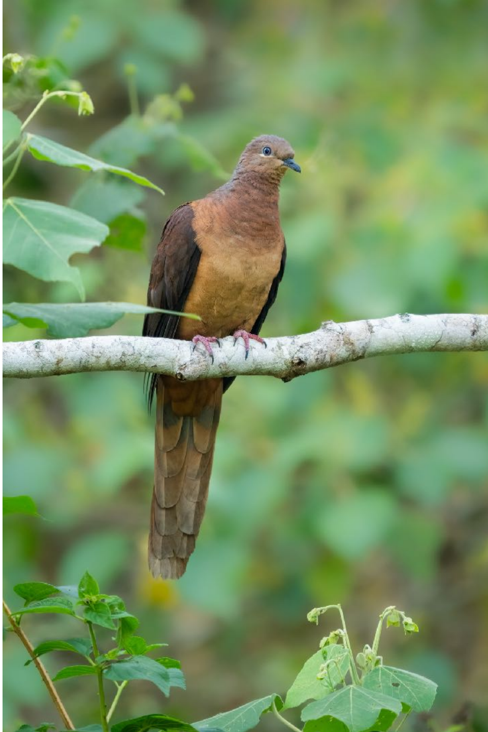
Brown Cuckoo Dove - Photo by Guide: Ben Knoot

We had one more stop to make before our primary location for the morning. Mt. Lewis needs a little time to ‘warm-up’ so we killed a few more minutes and visited McDougal Road and Ponds . Here we picked up, Gray Teal , Comb-crested Jacana , Pacific Heron , Buff-banded Rail and a surprise White-browed Crake .