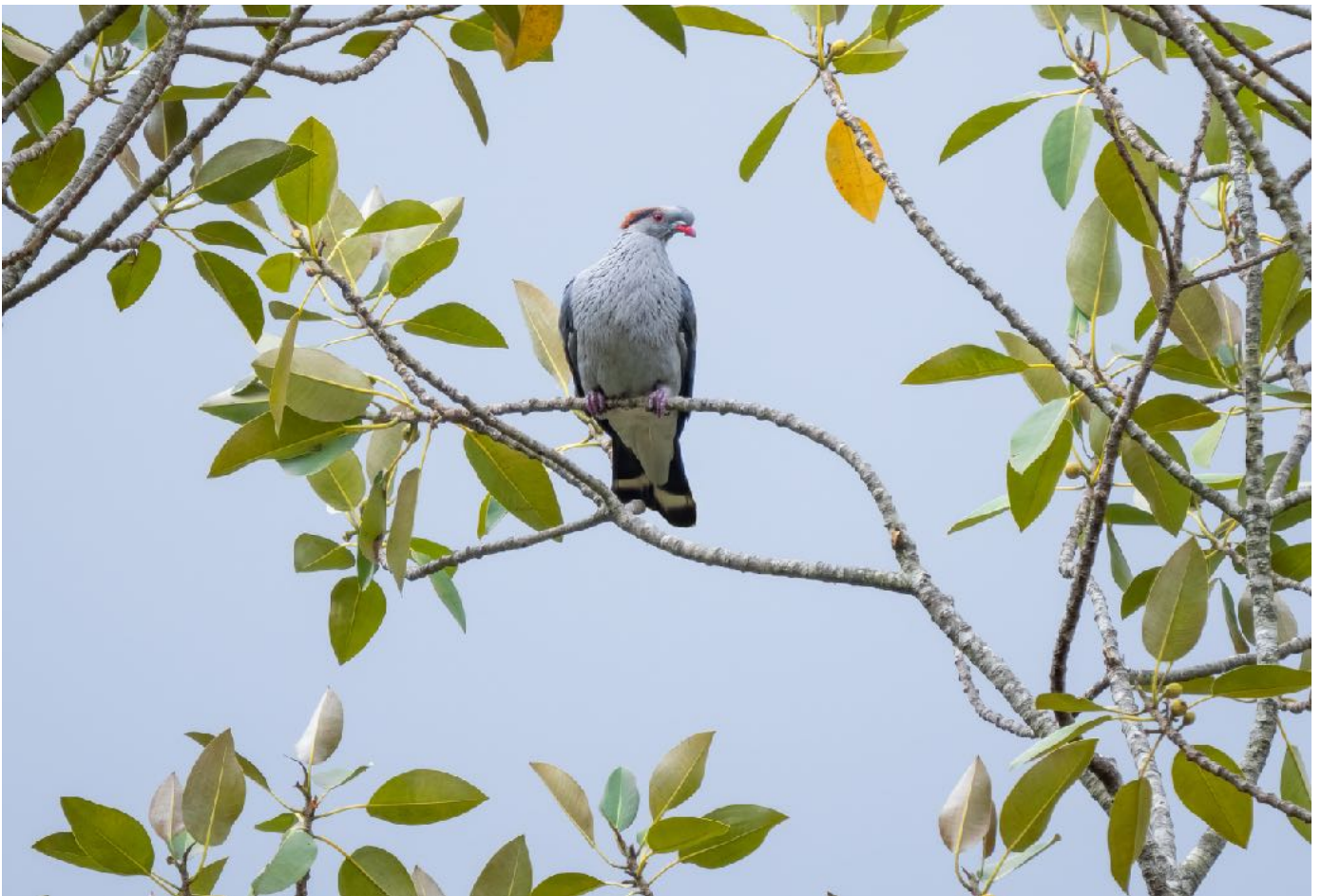
Topknot Pigeon

It was so windy that while on the Wattamulla Coastal Track , one of the first birds we saw was a Short-tailed Shearwater resting in the bay. The gentle waterfalls across that very same bay were no longer 'falling' but instead, rising! So anyway, with this extreme wind we did our best but really didn't managed much except a really quick glimpse of Chestnut-rumped Heathwren for a few people.