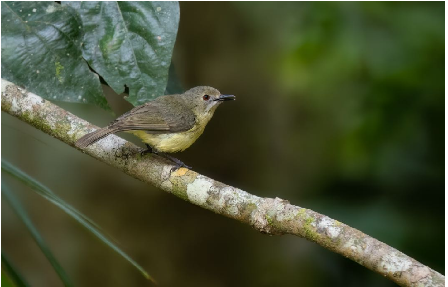
Fairy Gerygone

After the Esplanade, we birded our first section of sub-tropical rainforest. Lake Morris Road was our destination and thankfully, it did not disappoint. Here we added; Wompoo Fruit Dove , Rufous Shrike-thrush , Pacific Baza , Victoria's Riflebird , Macleay's , and Cryptic Honeyeater , Dusky Myzomela , Barred Cuckoo-shrike , Fairy Gerygone , Varied Triller , Yellow-breasted Boatbill , Pale-yellow Robin , and the ever abundant Silvereye . A pretty sweet haul for our mid-morning birding.