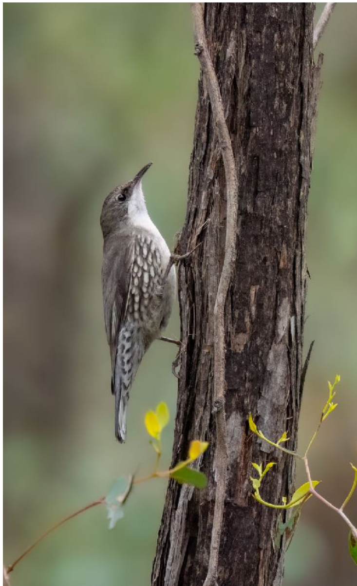
White-throated Treecreeper

After some sweet success here, we moved on to Wandea “Bluff” State Forest . Here the dry eucalypt forest gave away; Brown and White-throated Treecreeper , Little Lorikeet , Noisy Miner , Fuscous and Yellow-tinted Honeyeater , Gray Shrike-thrush , Dusky Woodswallow and for a few of us, a beautiful Crested Shrike-tit . For those who didn't see this bird this time around, we'd get some great looks later in the tour. On the way out of the state forest, we found a great group of Brolga .