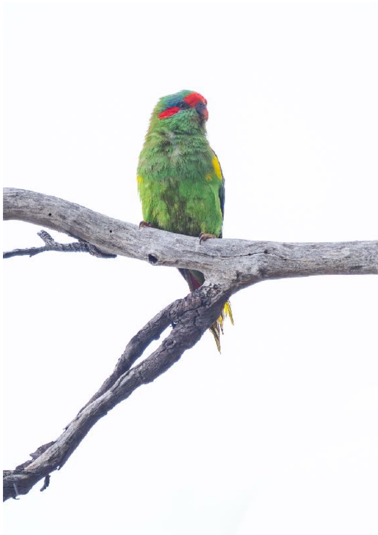
Musk Lorikeet

Alas, after dinner, it was time for the main event of the evening. Typically somewhere around 45min - 1hr after sunset, Pirates Bay hosts a fun 'home-coming' event for those who can brave the chilly conditions. In the dark of night, Little Penguins make their way ashore from a day of fishing to roost in the sandy banks. They are typically a little weary but with a little patience, you can have a really fun night with the worlds smallest penguin. It really is an awesome way to end the day. A nice long drive home and we hit the hay to prep for our last full day of the tour on the Tasman Peninsula.