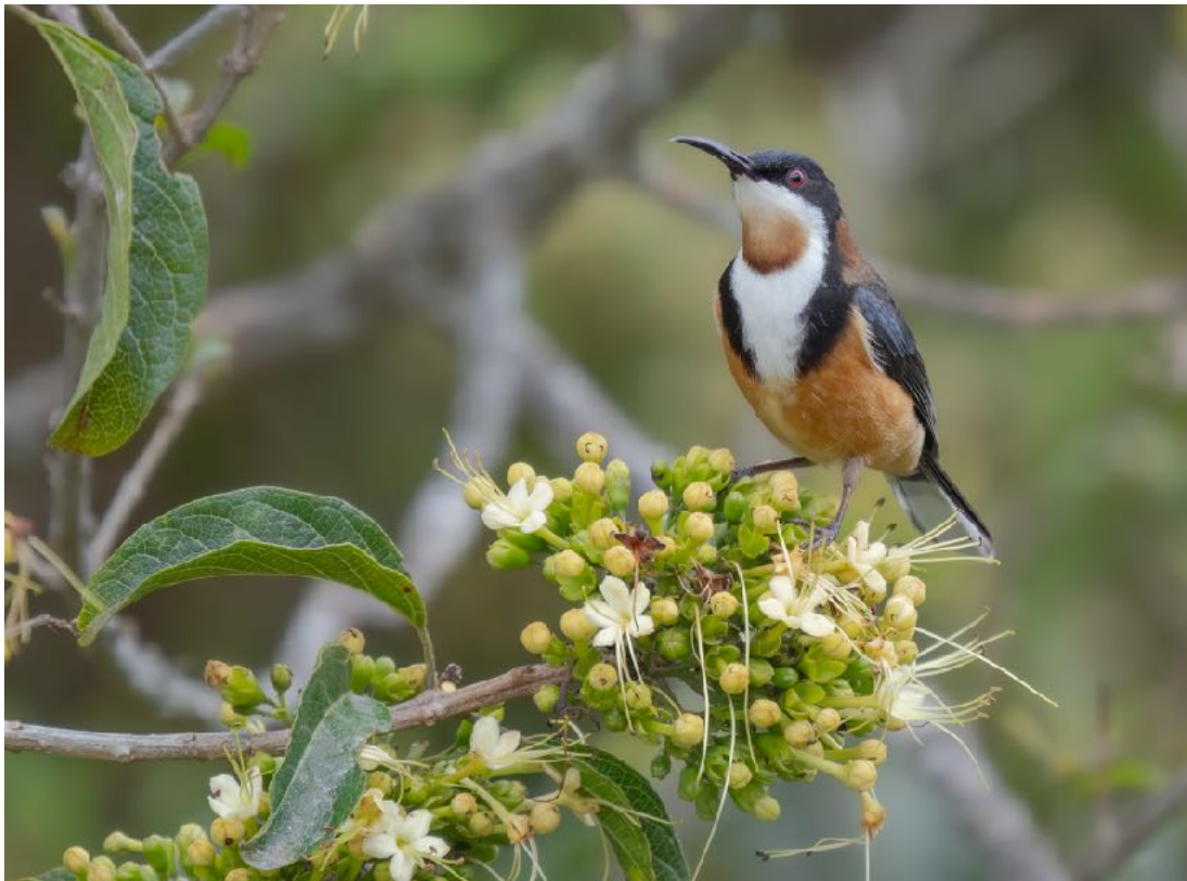
Eastern Spinebill

During our time in O'Reilly's Rainforest Retreat we visit several tracks, trails, roads and the grounds around the accommodations for a great list of Montane Rainforest species. We were able to add; Rose and Eastern Yellow Robin , Noisy Pitta , Paradise Riflebird , Superb Fairywren , Satin and Regent Bowerbird , Green Catbird , Albert's Lyrebird , Australian Logrunner , Eastern Whipbird , Russet-tailed and Bassian Thrush , Crimson Rosella , Australian King Parrot , White-browed and Yellow-throated Scrubwren , Shining Bronze Cuckoo , Wonga Pigeon , Eastern Spinebill , White-throated Treecreeper and Brown Thornbill . Not to mention a cool Coastal Carpet Python !