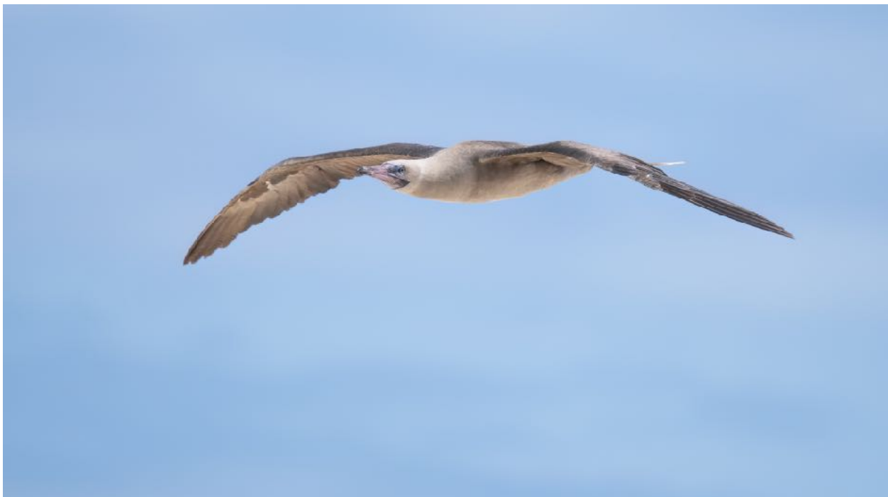
Red-footed Booby

If you haven't explored The Great Barrier Reef , you need to. It is a very cool experience. Equally as cool are the birds that call the tiny little sandy island of Michaelmas Caye home. Birds like; Great and Lesser Frigatebird , Sooty , Bridled , Roseate , Lesser Crested , Great Crested , and Black-naped Tern , Red-footed Booby , Ruddy Turnstone , Brown Booby , Silver Gull and Brown Noddy .