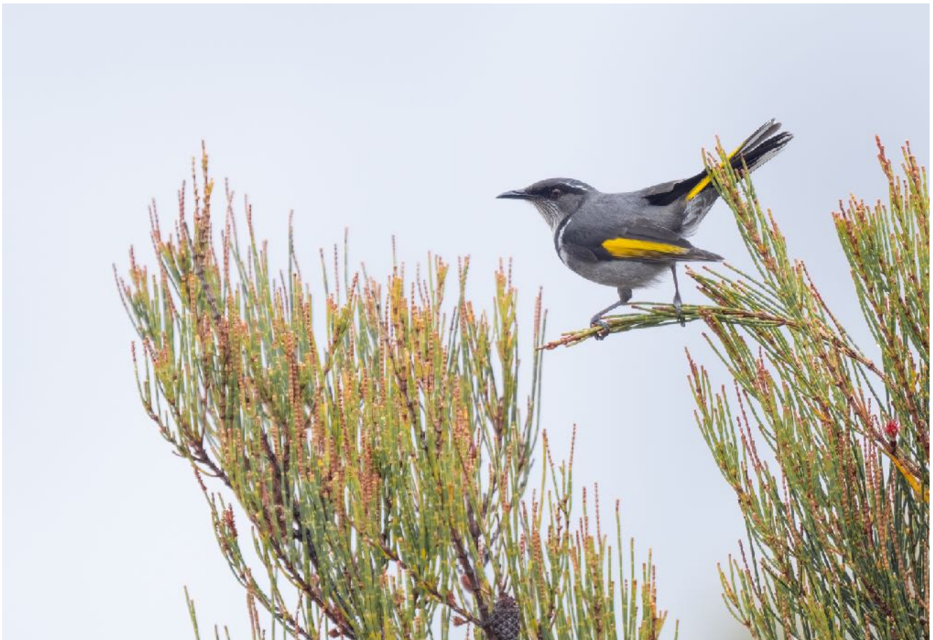
Crescent Honeyeater

After lunch, we birded the Adventure Bay area and picked up the threatened Hooded Plover , the owner of the chunkiest bill in Tasmania, the Pacific Gull (along with tons of Kelp Gull ), and the sharp looking Black-faced Cormorant . After lunch over looking a sparkling bay, it was now time to go and find the hardest targets on Bruny. We drove up the bumpy and slick Mount Mangana Road with hopes of nailing more of our Tasmanian targets. Luckily, everyone one of them was pretty cooperative this time around so we picked up; Crescent and Strong-billed Honeyeaters , Pink Robin , Tasmanian Scrubwren and no matter how hard I tried I could not find the Scrubtit... but I have a few other spots to check for this bird. Before leaving Bruny we found several Short-beaked Echidna ..our very last epic mammal!