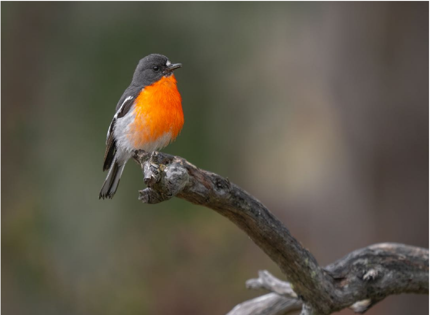
Flame Robin

We arrived at our next location, Eaglehawk Neck National Park "Devil's Kitchen and "The Blowhole". In these two spots I had a few targets in mind and we managed a good majority of them but not all, which is unfortunate but we still managed; Yellow Wattlebird, Flame Robin, Tasmanian Scrubwren and Crescent Honeyeater .