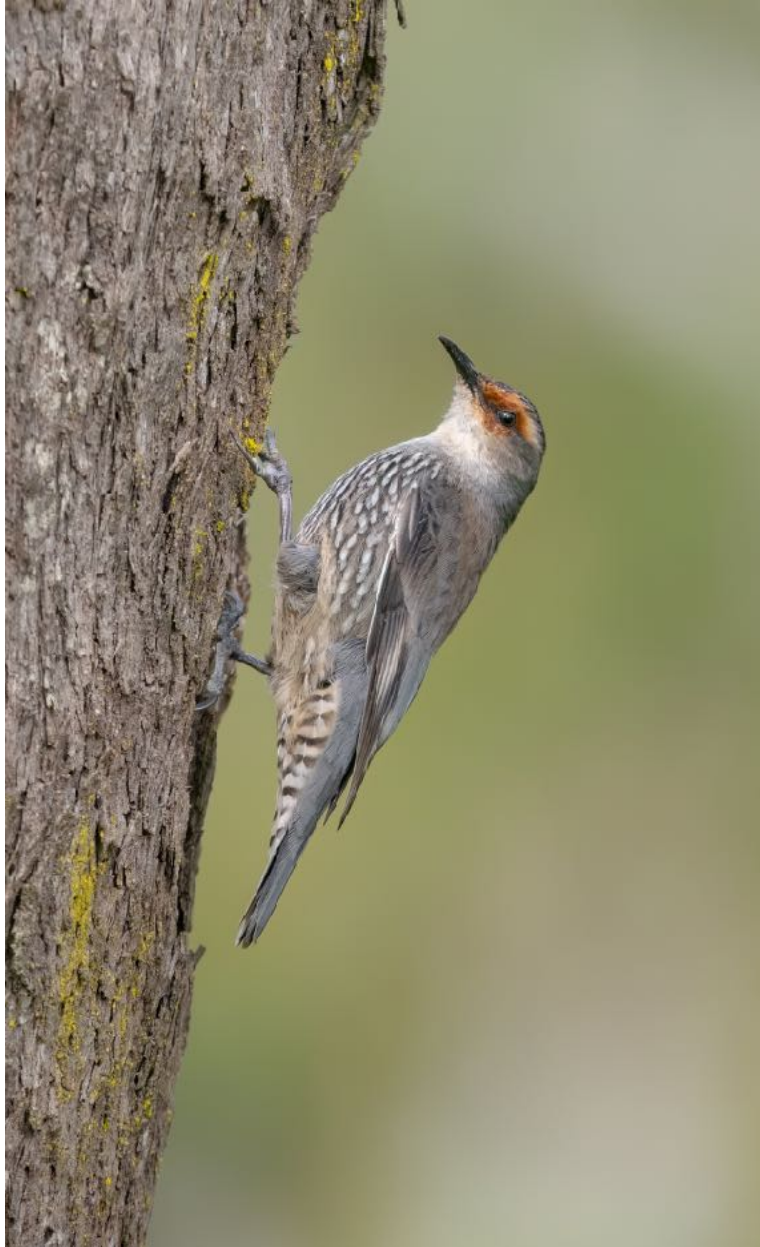
Red-browed Treecreeper