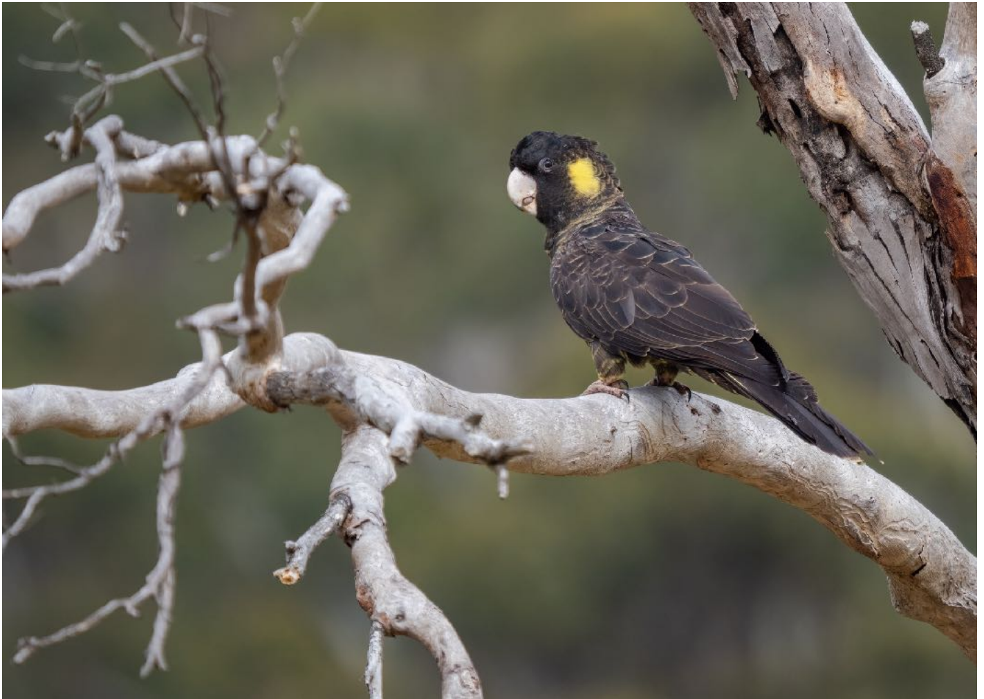
Yellow-tailed Black Cockatoo

After a quick flight to Hobart, we picked up our van and immediately picked up our first new bird and first of twelve (12) Tasmanian endemics, the Tasmanian Nativehen . These guys just run around everywhere and is usually the first one we find regardless! After a nice dinner, most of the group decided to have a little night session over at the Waterworks Reserve . Here we found our main target, the Tasmanian Boobook along with another Tawny Frogmouth , Common Brush-tailed Possum , Common Ring-tailed Possum , Bennet's Wallaby and Rufous-bellied Pademelon .