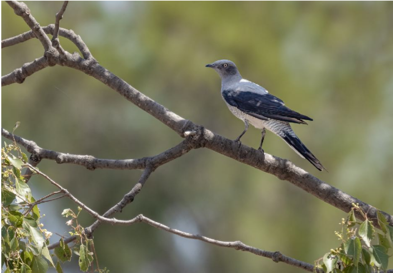
Ground Cuckooshrike - Photo by Guide: Ben Knoot

Next up was another species chase plain and simple. I saw that a Red-backed Kingfisher had been reported at the Forbes Cemetery . This is a tough bird for this itinerary so we had to give it a shot. While driving around, I looked at two large birds in a tree, turned away and then said out-loud, “Hang-on...no freaking way...” Sure enough, three Ground Cuckooshrike were perched up pretty right there in front of us, just staring! This is not an easy bird so I was stoked to see them again and to get them for the group.