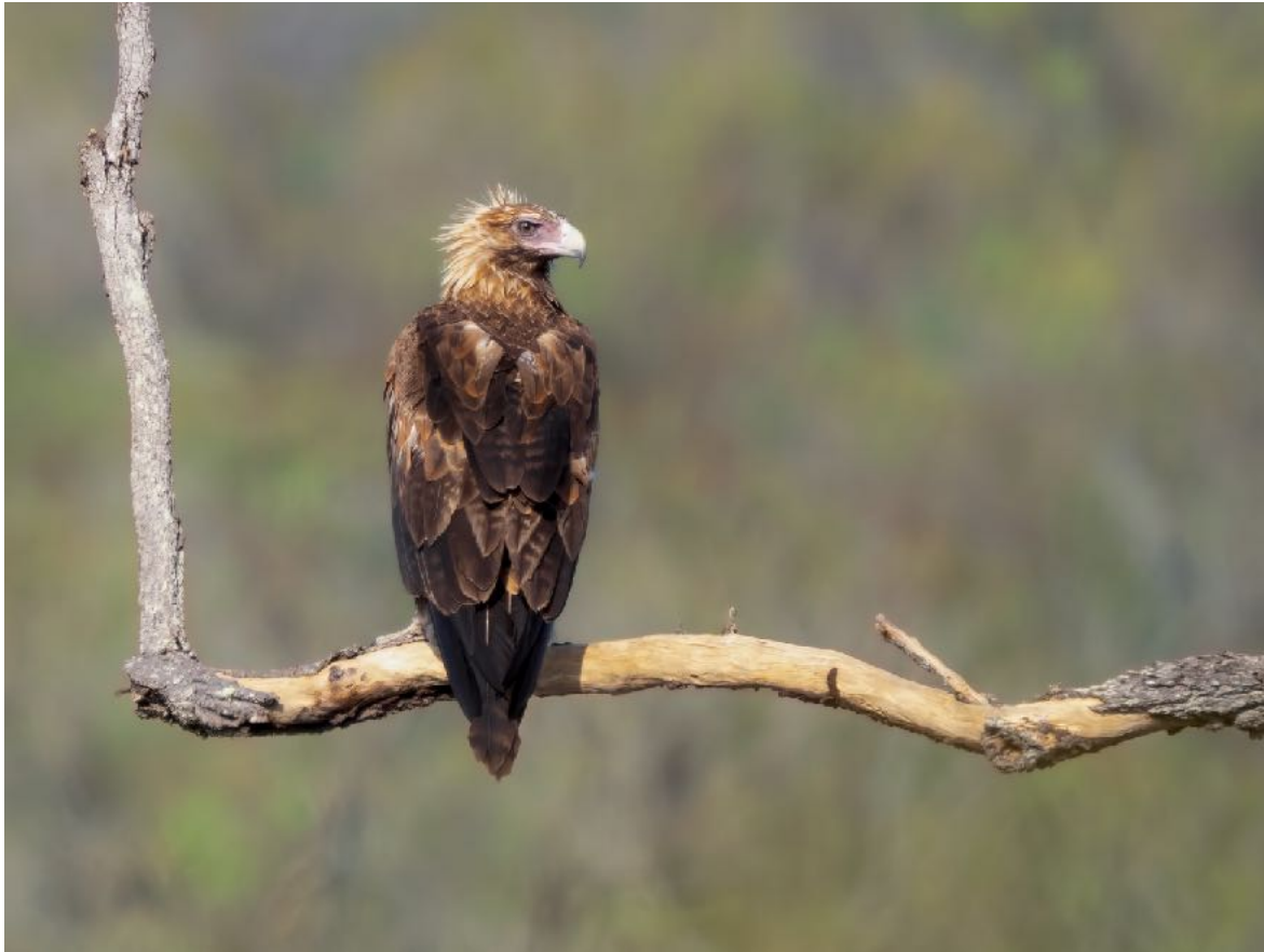
Wedge-tailed Eagle

On the way out of the park, we managed to catch up with Chestnut-breasted Munia . As the sun really started to set, we made one last play for a difficult Australasian robin species. We arrived at Jack Bethel Park and with a little bit of work and some great spotting by a guest, we managed to get everyone on a White-browed Robin . A great end to the day...but was it?! After a nice Thai dinner in downtown Mareeba, I offered a night excursion and nearly everyone decided to take it. A quick visit (and I mean that literally - probably the quickest I have ever found this bird) to Davies Creek gave us some cracking views at Australian Owlet Nightjar and my reliable Barn Owl was hunting in its usual field. Now that, was a great end to the day.