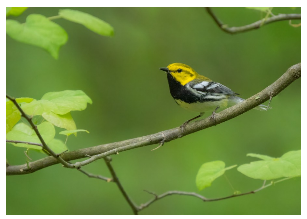
Black-throated Green Warbler