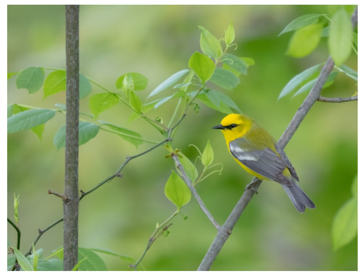
Blue-winged Warbler