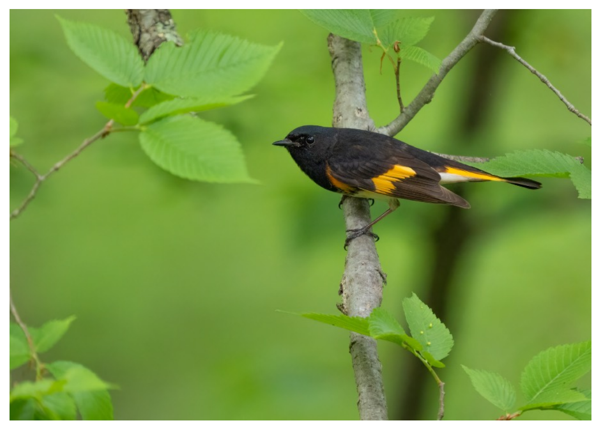
American Redstart