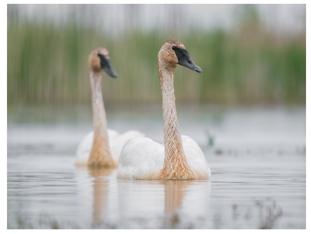
Trumpeter Swan - Photo by Guide: Ben Knoot