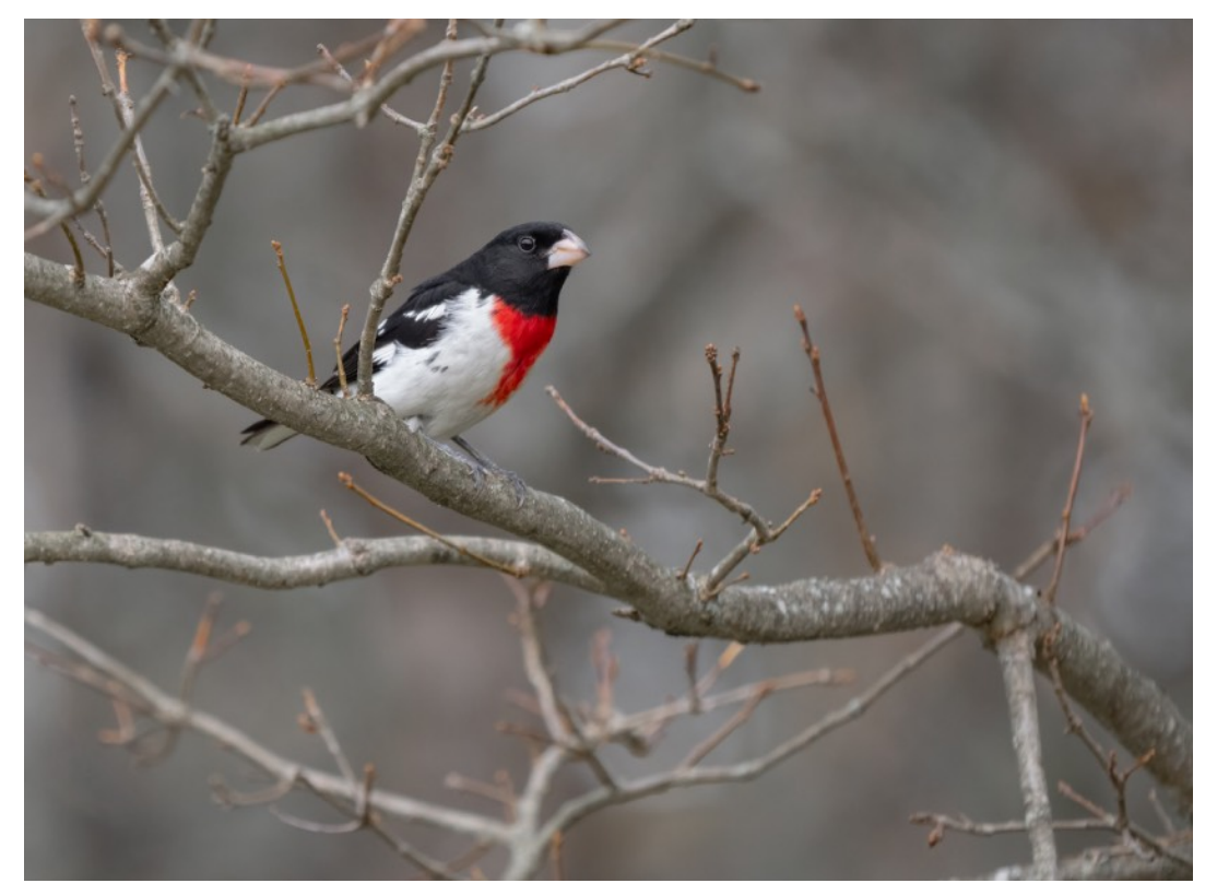
Rose-breasted Grosbeak