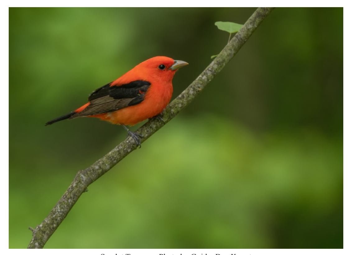
Scarlet Tanager