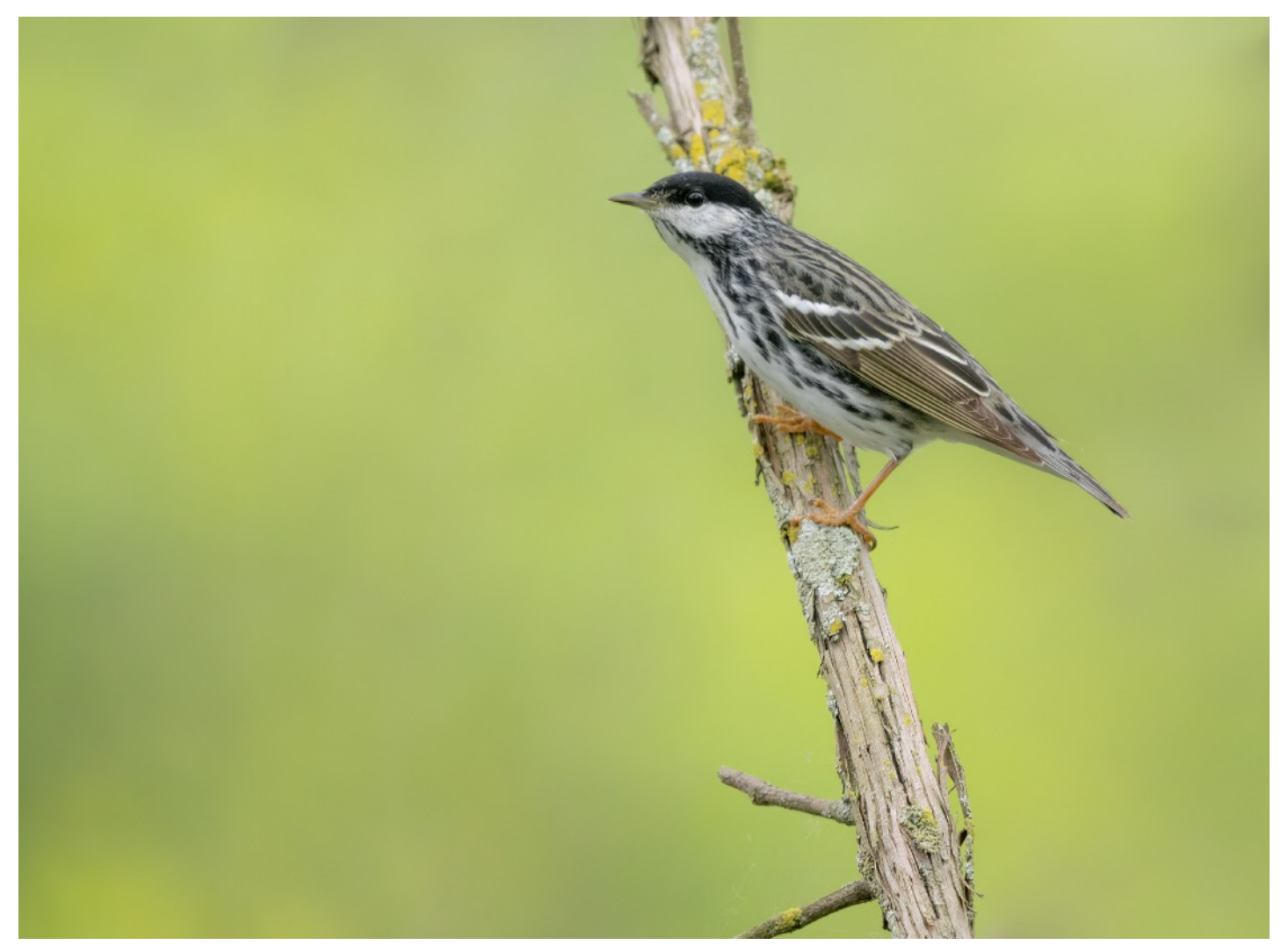
Blackpoll Warbler

Here on the shores of one of the great lakes, we spent three great days exploring four wonderful locations; Magee Marsh, Metzger Marsh, Ottawa NWR and Maumee Bay. The photography here is difficult for a multitude of reasons. For one, there are many more people here so ducking under and around them can prove difficult for photographic success. Another is that most of the warblers do not breed here, making find them on breeding territories literally impossible which also means they are not singing on exposed perches. Regardless, we were able to add; Chestnut-sided Warbler, Bay-breasted Warbler, Canada Warbler, Magnolia Warbler, Blackburnian Warbler, Mourning Warbler, Connecticut Warbler, Yellow-rumped (Myrtle) Warbler, Black-throated Blue Warbler and Prothonotary Warbler. We added several more non-warbler birds like; Philadelphia Vireo, Warbling Vireo, Gray Catbird, Red-winged Blackbird, Eastern Kingbird, Trumpeter Swan, Eastern Bluebird, Tree Swallow, Black-tailed Gnatcatcher and Eastern Screech Owl.