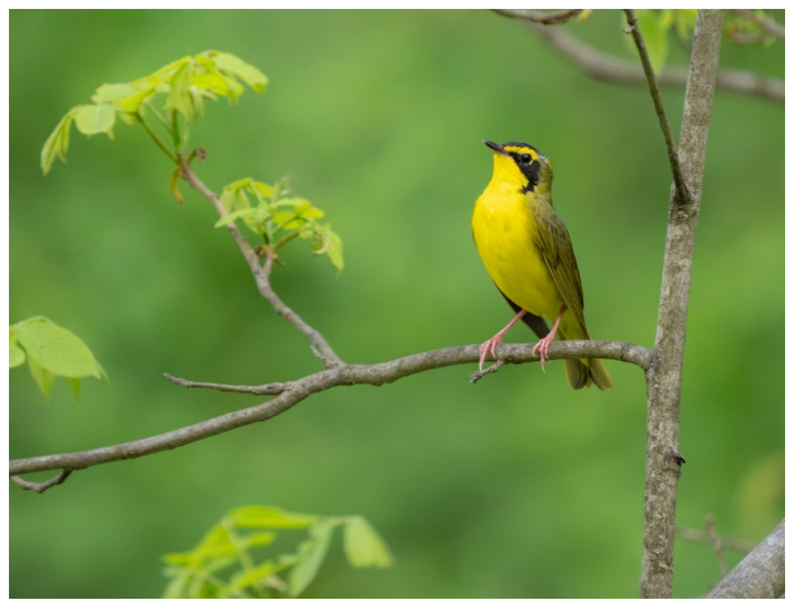
Kentucky Warbler