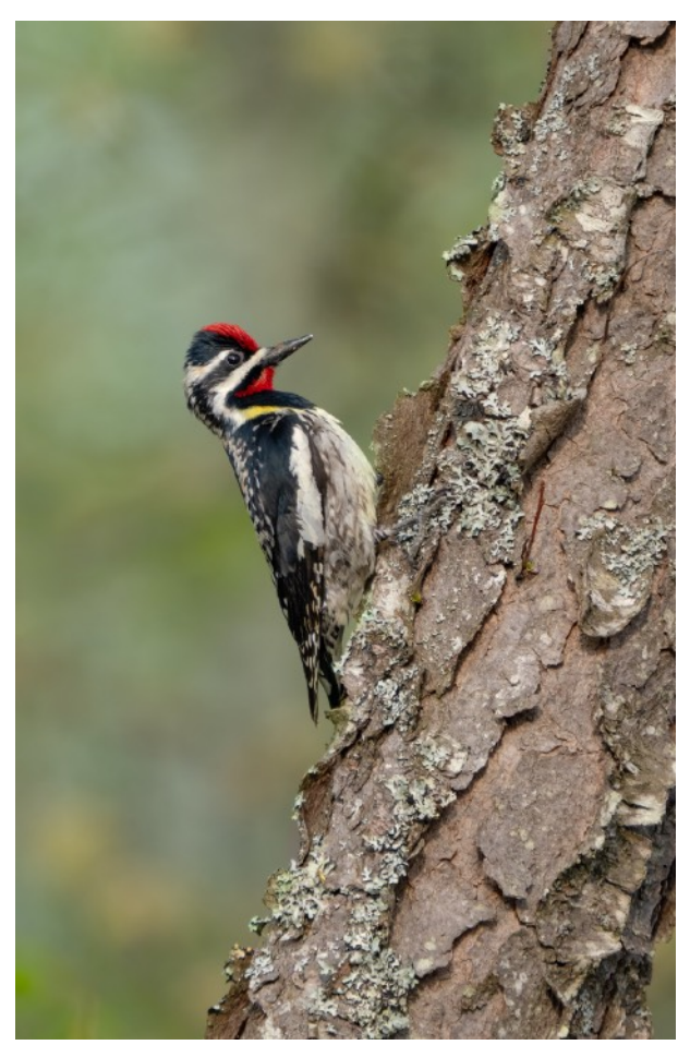
Yellow-bellied Sapsucker