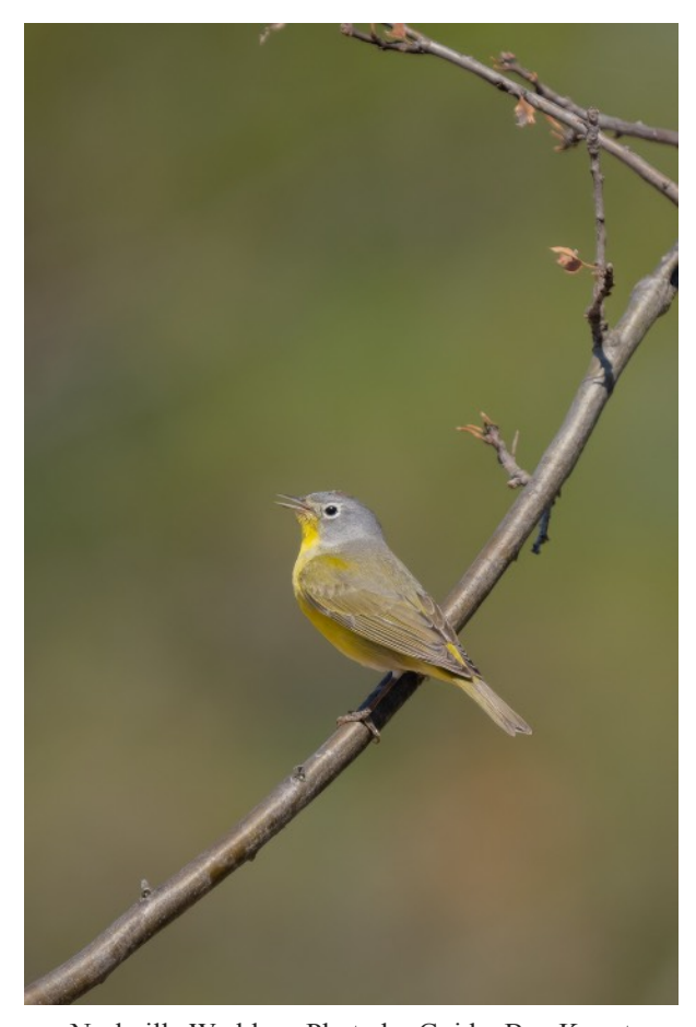
Nashville Warbler