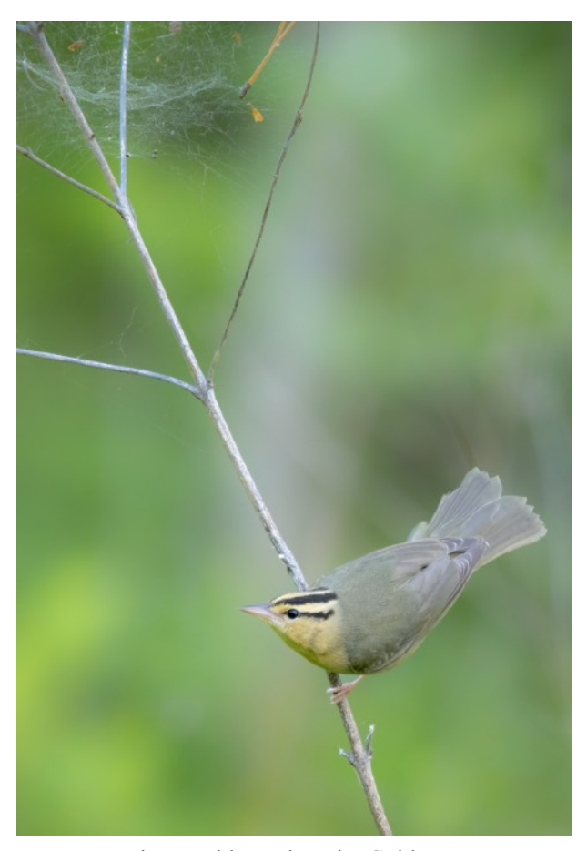
Worm-eating Warbler