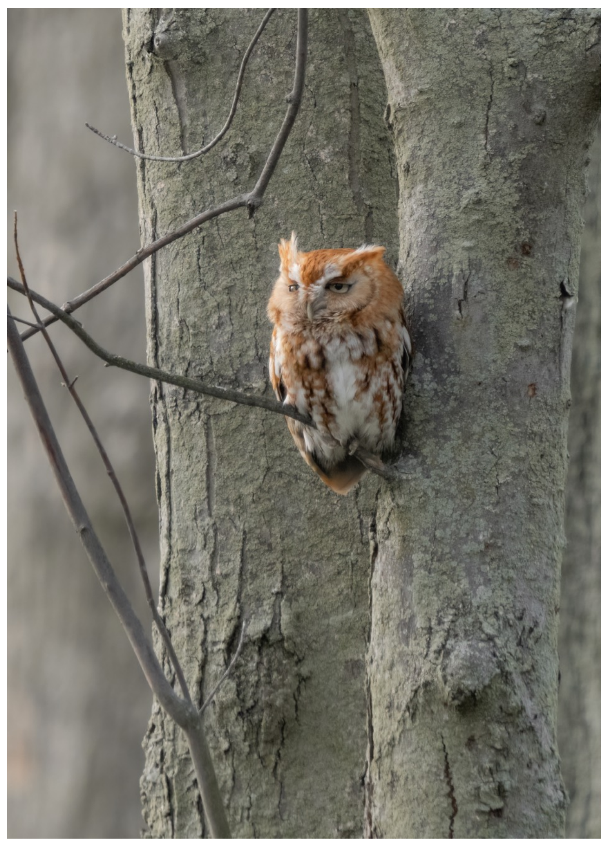
Eastern Screech Owl