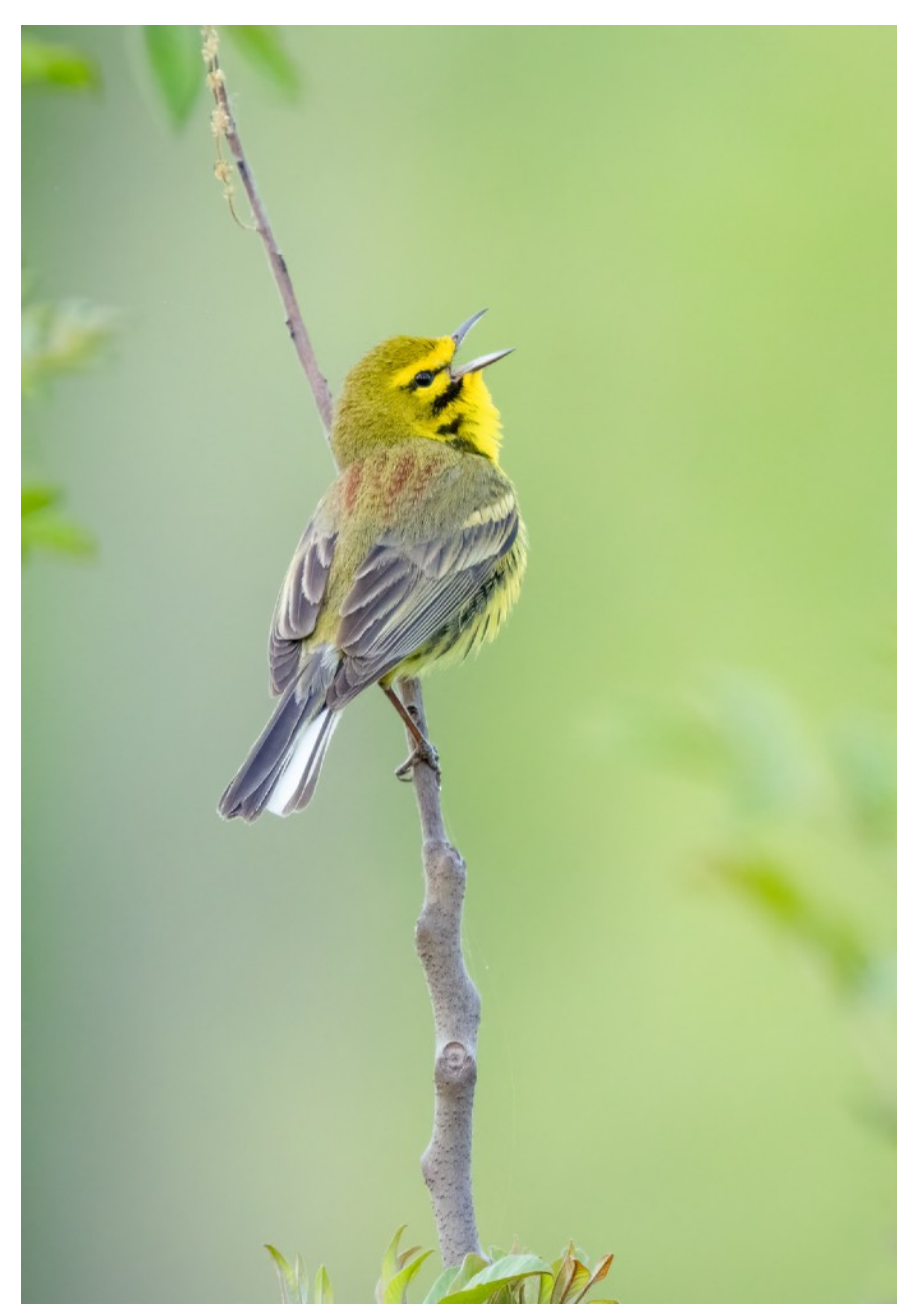
Prairie Warbler

Ohio & Michigan: CUSTOM Warbler Photo Tour