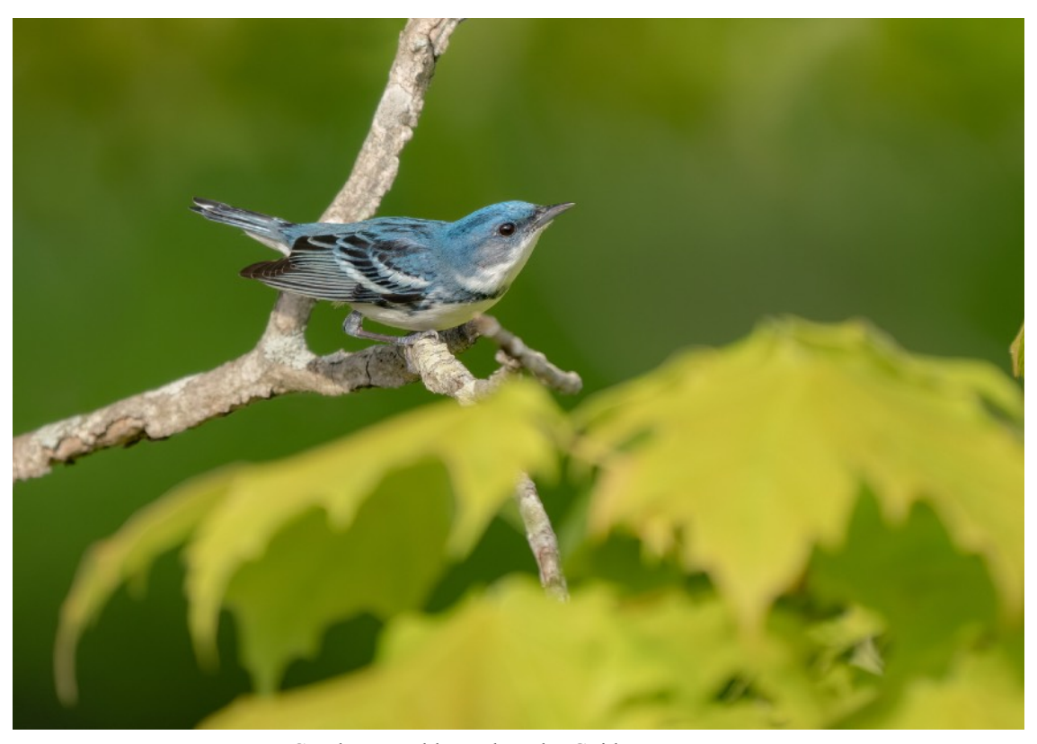
Cerulean Warbler - Photo by Guide: Ben Knoot