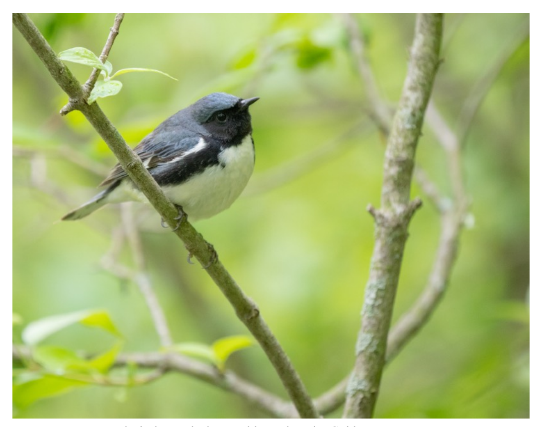
Black-throated Blue Warbler