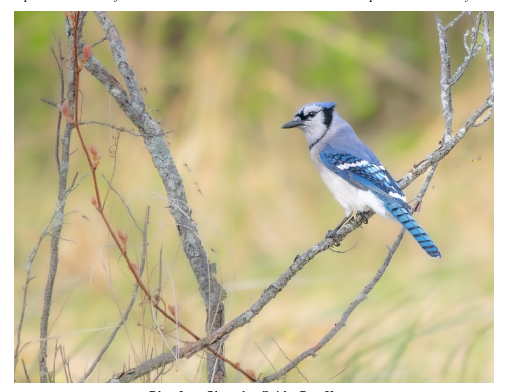
Blue Jay