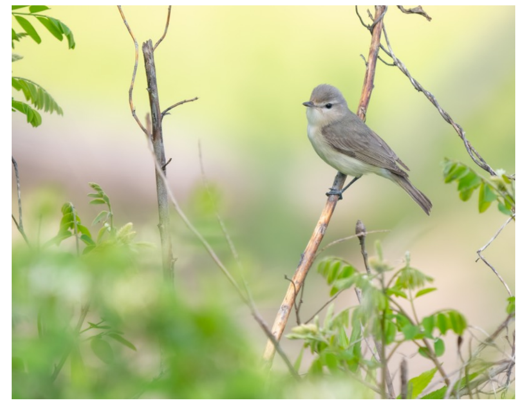
Warbling Vireo