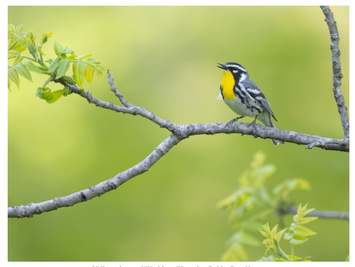
Yellow-throated Warbler