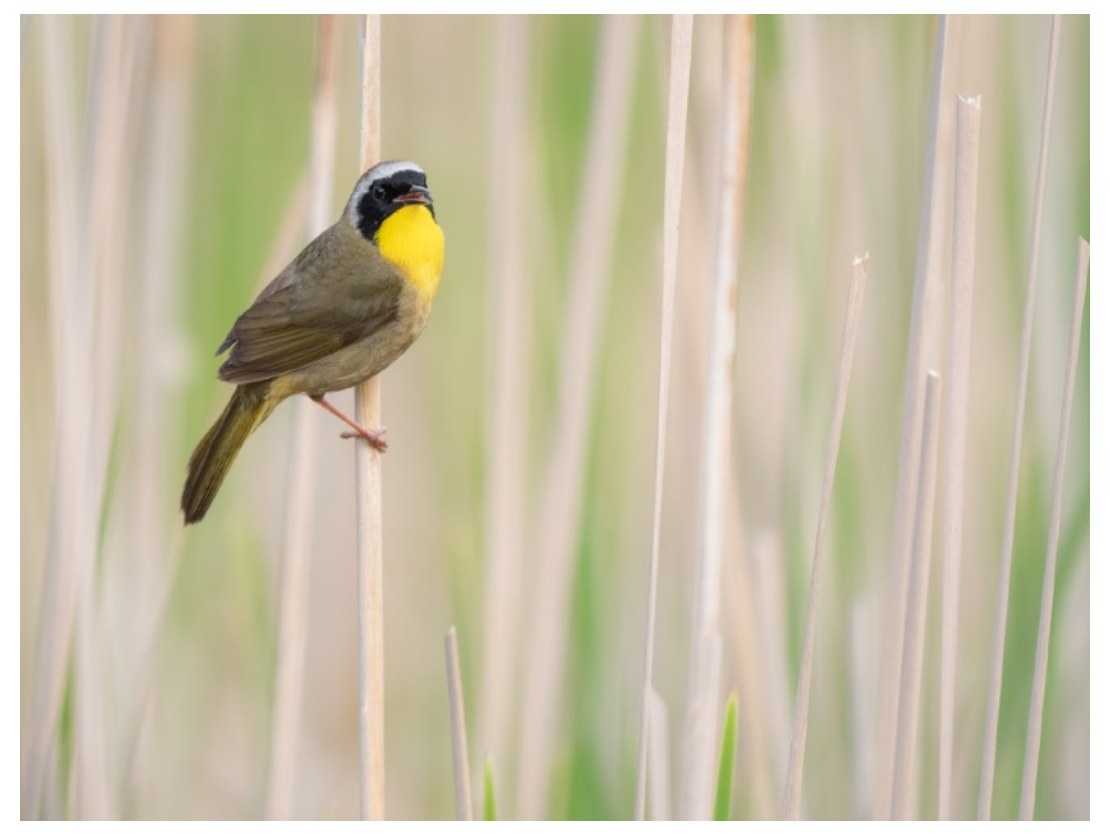
Common Yellowthroat