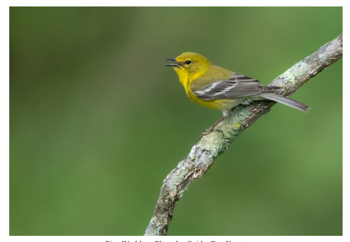
Pine Warbler