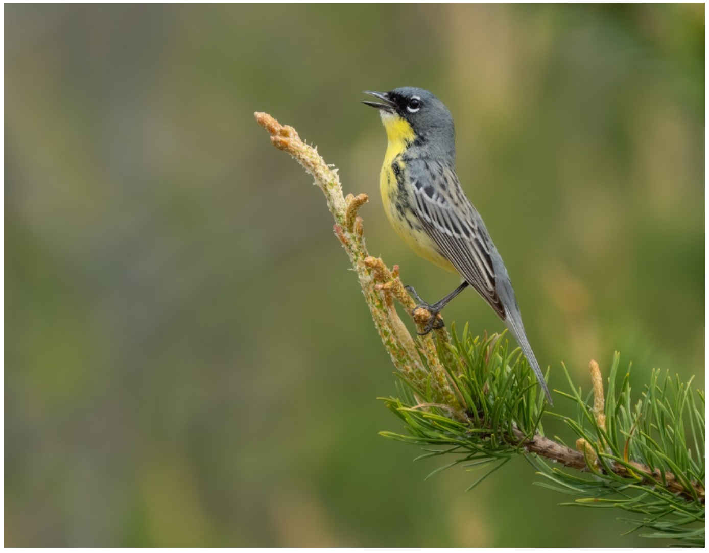
Kirtland's Warbler

The last section of our trip took place in central Michigan, specifically around the Houghton Lake area. Here we searched Jack Pine forests, and forested lake regions for more warbler photography opportunities and to find the last two warblers for our birder friend. Luckily, one of them was quite easy, the famous Kirtland's Warbler. The other, the Golden-winged Warbler required a bit more effort but we did managed to spend several wonderful minutes photographing both of these warblers. We were able to photograph a lovely Chestnut-sided Warbler, American Redstart and Common Yellowthroat very well. Nashville Warbler was a bit trickier but we managed some decent photos and we photographed several good "non-warblers" like; Rosebreasted Grosbeak, Yellow-bellied Sapsucker, Red-breasted Nuthatch, Pileated Woodpecker, Blue Jay and a Common Grackle. The tour concluded here and the guests flew out of Grand Rapids the next day.