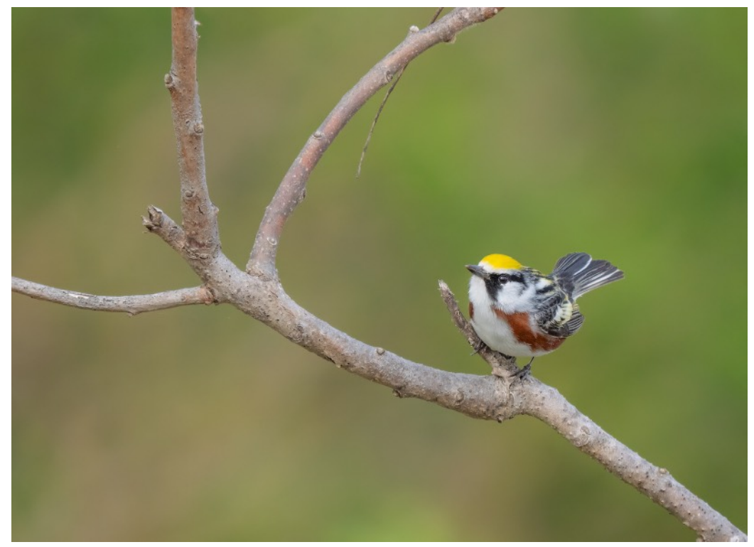
Chestnut-sided Warbler