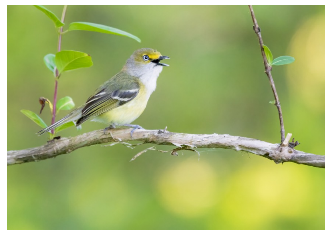
White-eyed Vireo