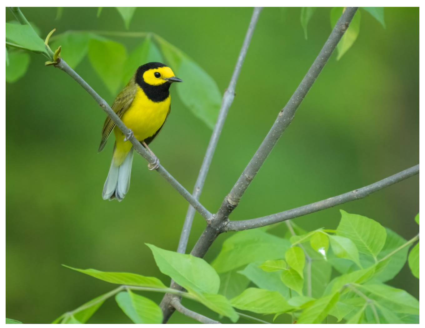
Hooded Warbler

This was my first time in this beautiful area. Full of stunning trees, beautiful streams, swamps and breathtaking scenery. I did truly fall in love with this part of Ohio and the birds, WOW...this area was packed full of breeding warblers. Everything from Yellow-throated Warbler to Wormeating Warbler breeds in this part of the state which means the photographic opportunities are abundant and ripe for the taking. Throughout the three days we had here, we photographed 17 warbler species; Kentucky Warbler, Northern Parula, Cerulean Warbler, Hooded Warbler, American Redstart, Blue-winged Warbler, Pine Warbler, Black-throated Green Warbler, Black-and-white Warbler, Prairie Warbler, Yellow-throated Warbler, Worm-eating Warbler, Yellow Warbler, Ovenbird, Yellow Warbler, Blackpoll Warbler, and Hooded Warbler. We also managed many "non-warbler" birds like; Eastern Towhee, Scarlet Tanager, White-eyed Vireo, Yellow-throated Vireo, Red-eyed Vireo, Indigo Bunting, Brown Thrasher, Red-bellied Woodpecker, and Wood Thrush. After our time here we ventured north to the shores of Lake Erie.