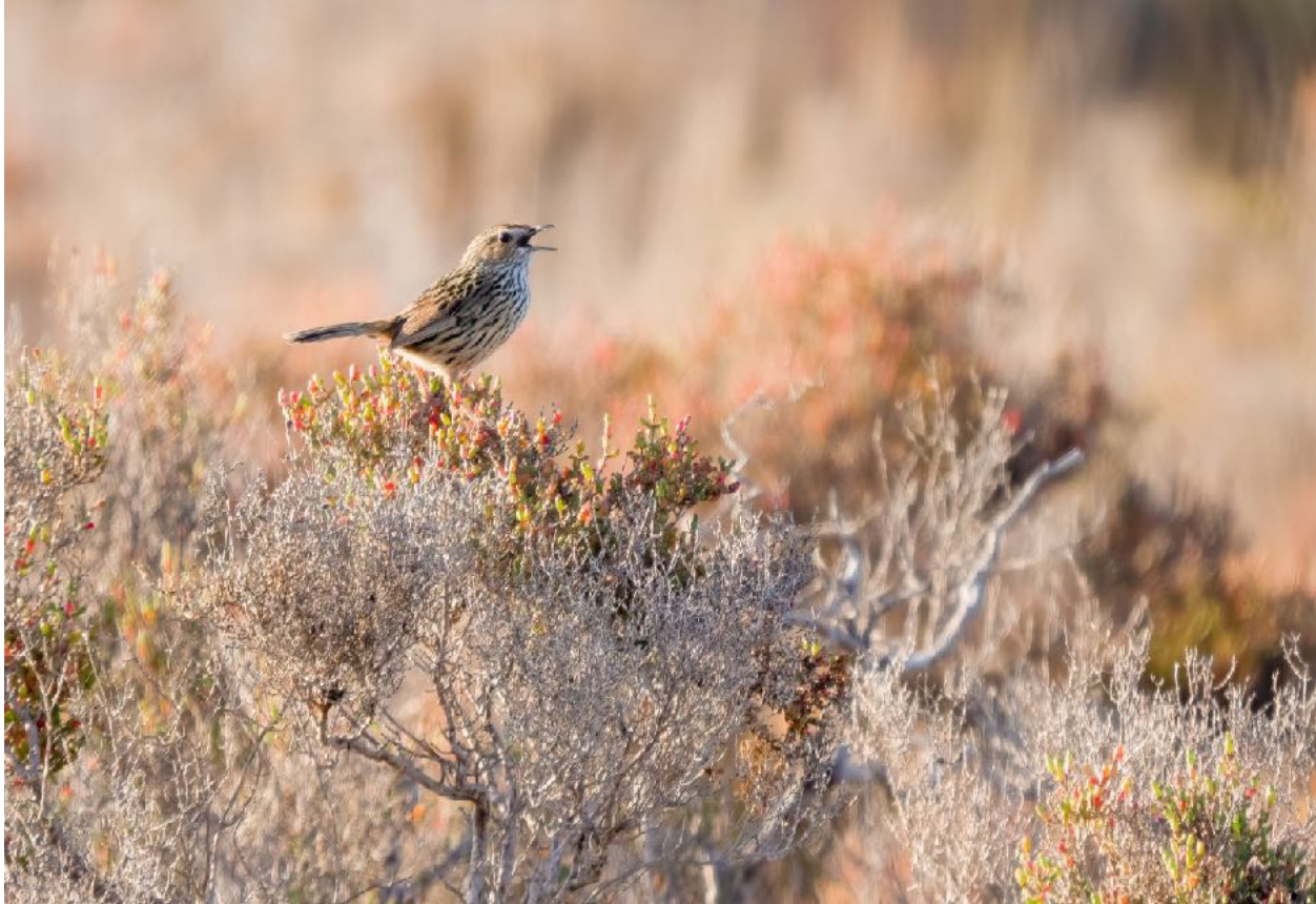
Striated Fieldwren