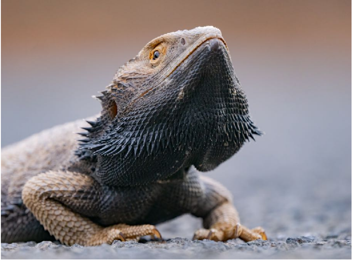
Central Bearded Dragon - Photo by Guide: Ben Knoot