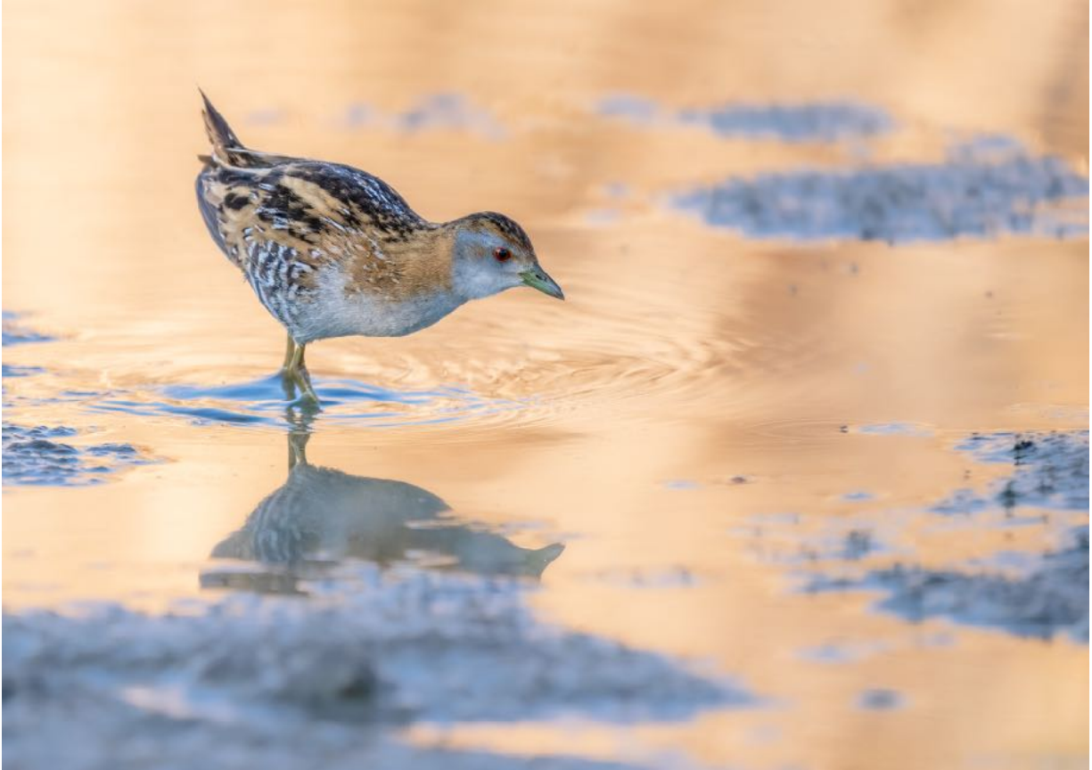
Baillon's Crake

The next stops were mainly targets chases. I started off by visiting a row of trees where I'd had Australian Hobby in the past. Sure enough...a slow drive-by lead to our only sighting of Australian Hobby for the trip. Pretty sweet when you can rely on an area year after year that isn't specifically an eBird hotspot!