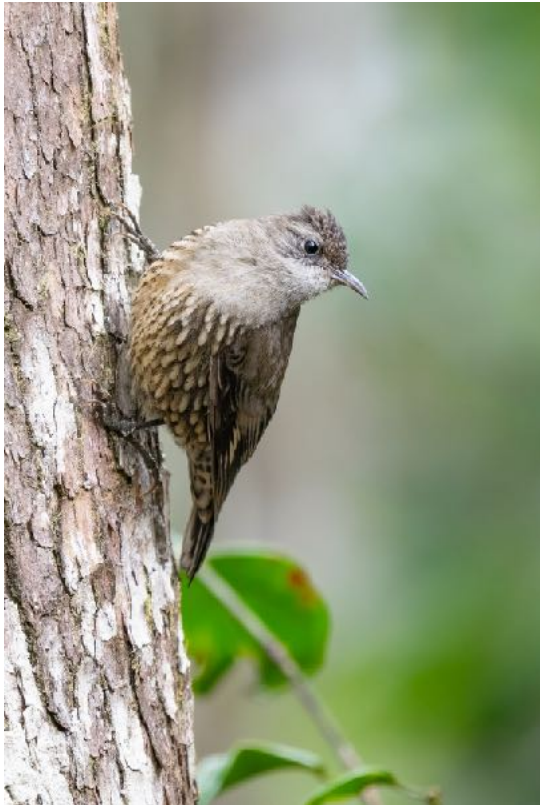
White-throated Treecreeper

Excited for more forest birding, we ventured over to our main location for the morning, Hypipamee National Park . Here the dense forests make for some tougher viewing but we still managed; Gray-headed , Pale-yellow Robin , White-throated Treecreeper , Bridled and Lewin's Honeyeater , Large-billed Scrubwren , Brown Gerygone , Mountain Thornbill , Top Knot Pigeon and Golden Whistler .