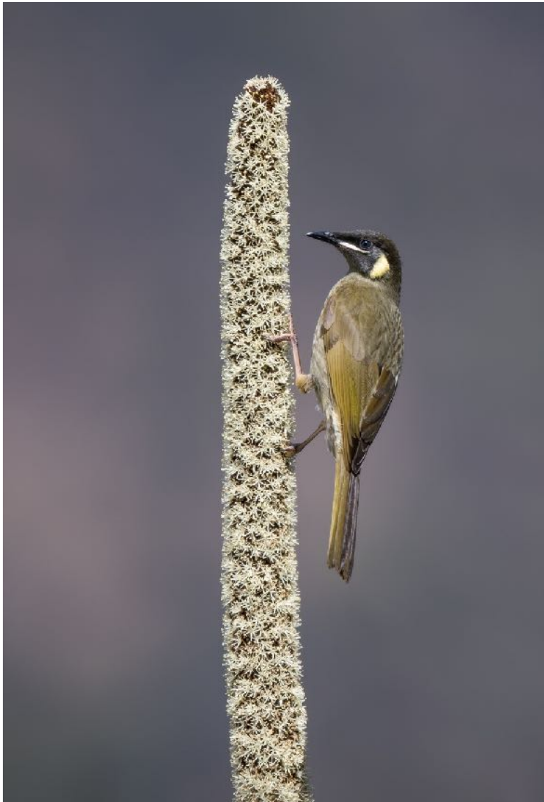
Lewin's Honeyeater

During our time in O'Reillys Rainforest Retreat we visit several tracks, trails, roads and the grounds around the accommodations for a great list of Montane Rainforest species. We were able to check off; Rose and Eastern Yellow Robin , Noisy Pitta , Paradise Riflebird , Superb Fairywren , Satin and Regent Bowerbird , Pied Currawong , Lewin's Honeyeater , Green Catbird , Albert's Lyrebird , Australian Logrunner , Eastern Whipbird , Russet-tailed Thrush , Crimson Rosella , Australian King Parrot , Fan-tailed Cuckoo , Wonga Pigeon , Eastern Spinebill , White-headed Pigeon , White-throated and Red-browed Treecreeper and Brown Thornbill . We also got to see a few fun 'other animals' like Land Mullet , Red-necked Pademelon , Mountain Brushtail Possum , Common Ringtail Possum and Red-bellied Snake . And we had a great evening nailing 2/3 night-time targets, the Marbled Frogmouth and Southern Boobook .