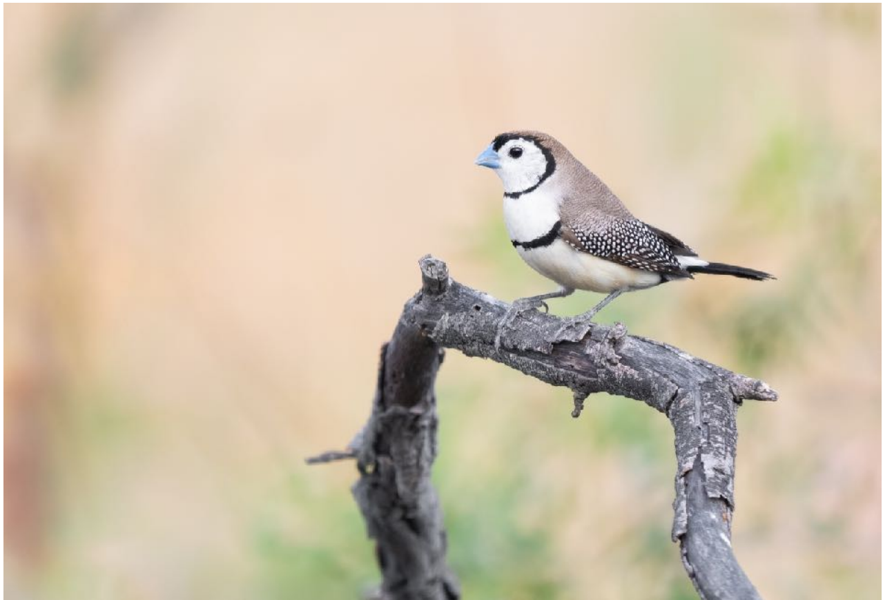
Double-barred Finch