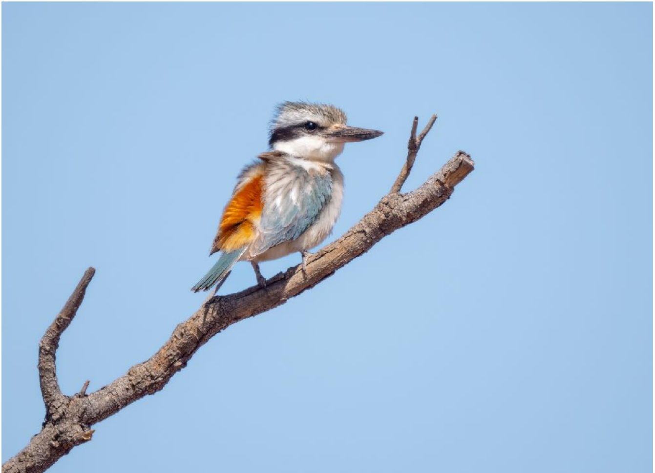
Red-backed Kingfisher

On the way back to town, we had a sweet look at Red-backed Kingfisher and then had a lovely breakfast before heading out again. Last stop in Lake Cargelligo was the Lake Cargelligo Sewage Ponds . Here we snagged Australian , Baillon's and Spotless Crake , Cockatiel , Galah , Horsfield's Bronze Cuckoo , Black-tailed Native-hen , Little Grassbird and a big surprise was two White-backed Swallows . Awesome conclusion to this section of the tour.