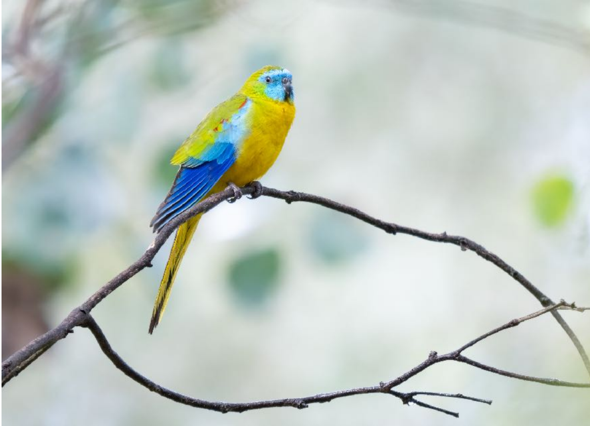
Turquoise Parrot