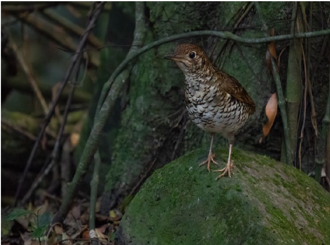
Bassian Thrush - Photo by Guide: Ben Knoot