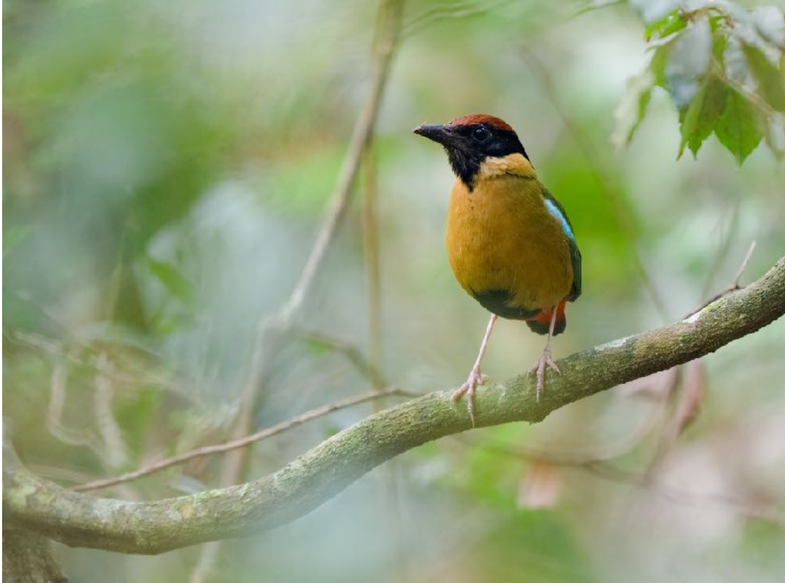
Noisy Pitta