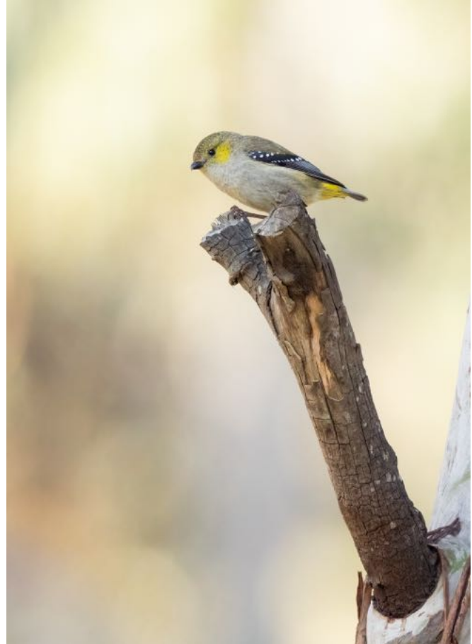
Forty-spotted Pardalote

Our next stop was Cape Queen Elizabeth Track . This can be a good spot for some of the endemics and other “easier on Tasmania” birds. We ran into Blue-winged Parrot and Musk Duck , two new species for us so great pick ups! On our way down to Adventure Bay (the area for lunch), we stopped off at “ The Neck Wildlife and Game Reserve ”. Here we scoped and found some Short-tailed Shearwaters passing through but very, very distant. They roost in the area so this is a pretty reliable place to find them.