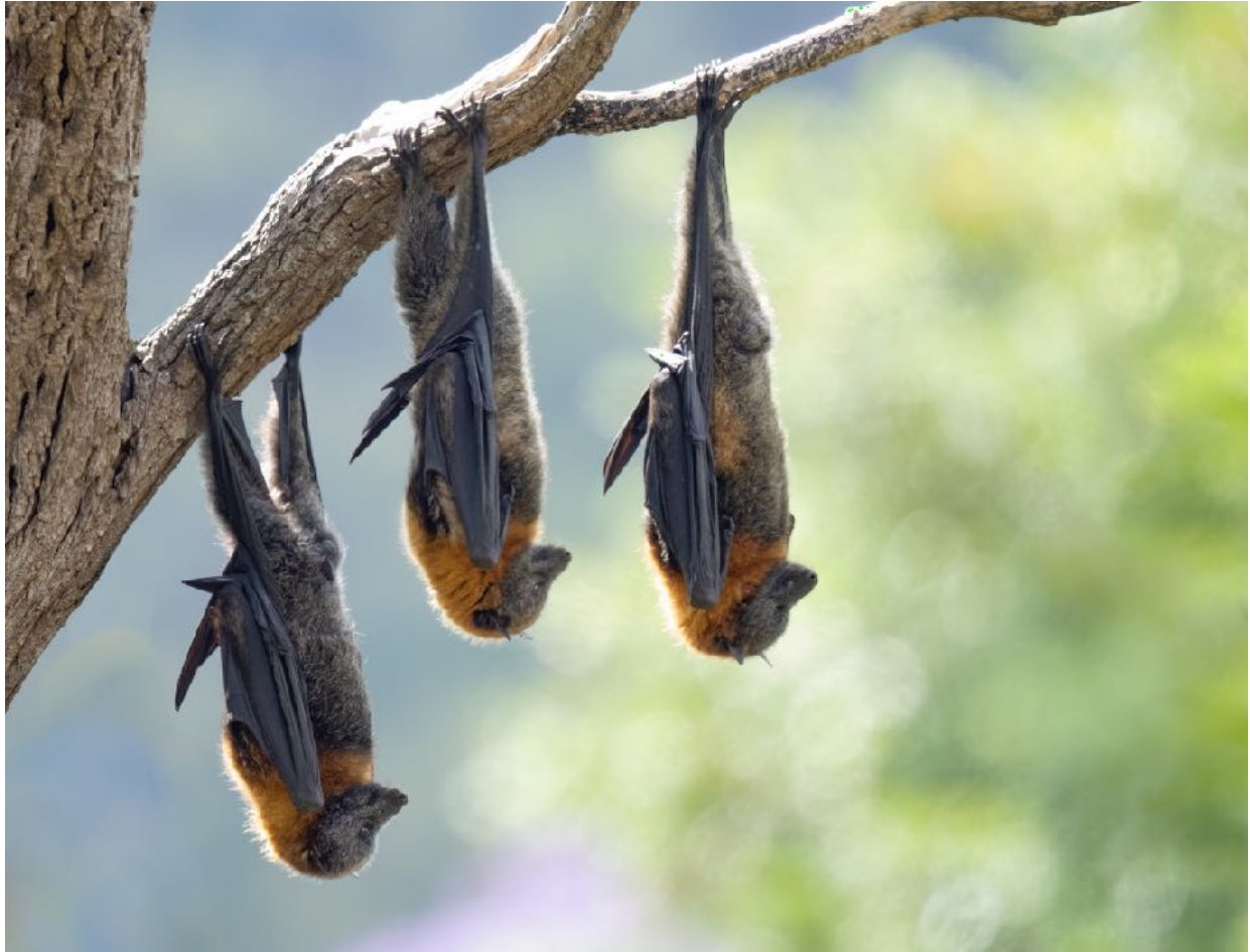
Gray-headed Flying Fox

Today we had a looooooong drive over to Goondiwindi. I wanted to leave O'Reilly's fairly early and after a quick walk around the grounds, we did just that. Our first stop was a visit to a Gray-headed Flying Fox roost in Canungra .