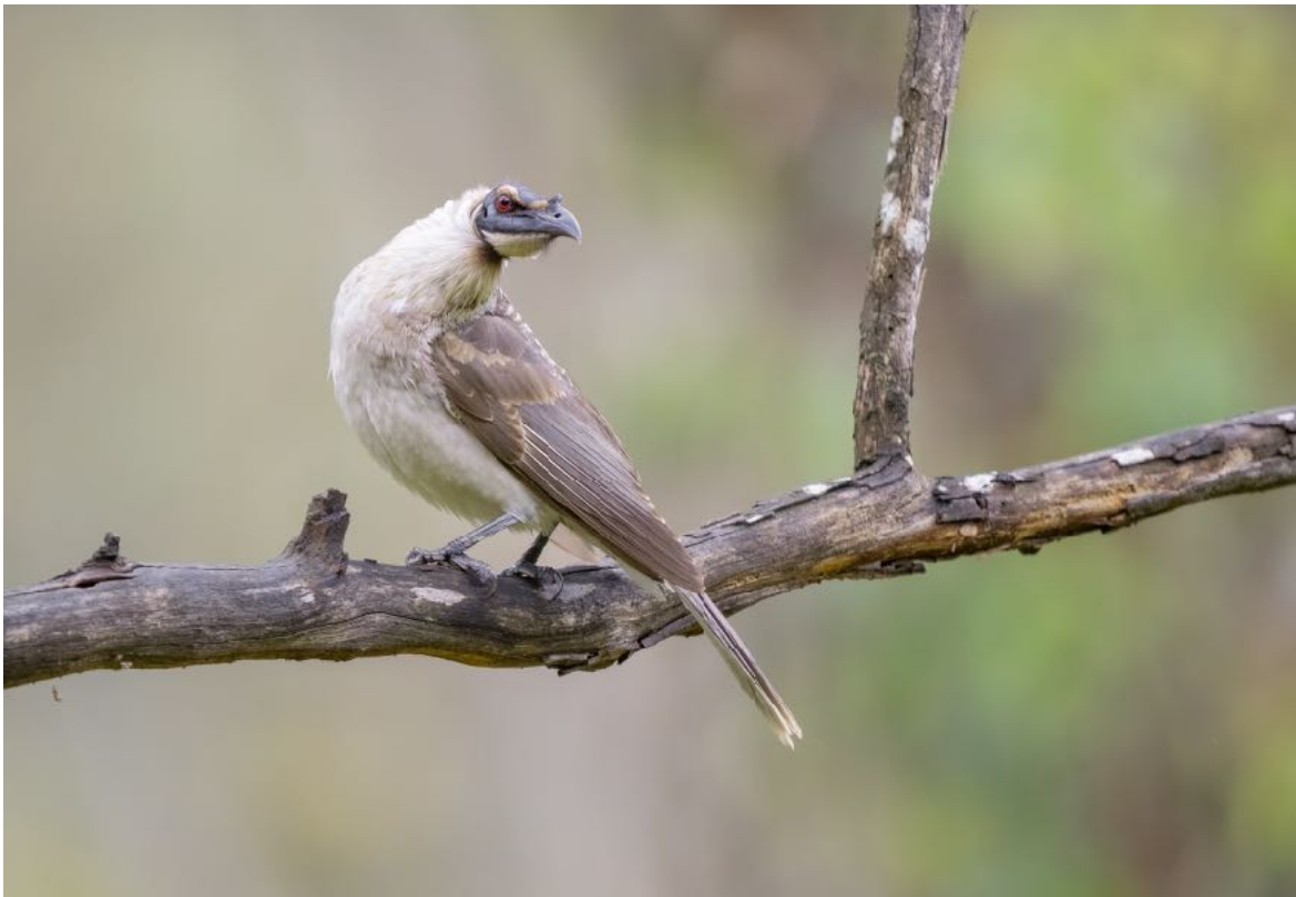
Noisy Friarbird - Photo by Guide: Ben Knoot