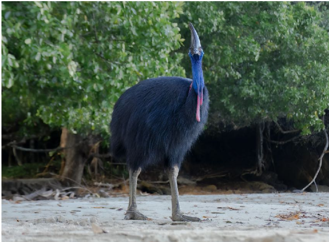
Southern Cassowary

Today was arrival day so there was a definitely energy in the air. In my mind, there is only ever one way to start this tour...with a HUGE win! First thing I like to do is take a long drive south towards Etty Bay . It's an hour and a half away and with very low numbers for the first afternoon but it all becomes clear when we get there. Just before we arrived we had an incredible encounter with a Yellow-billed Spoonbill , something I have never seen in this area before...an auspicious start! After about an hour or so of waiting and walking around we were delighted with our main target, the uniquely epic Southern Cassowary . We hung out with 'Etty' for about 30min and then made our way back to civilization for some dinner. On the way out towards dinner we spotted; Bush Thick-knee , Spotted Dove , White-bellied Sea Eagle , Rock Pigeon , Australia and Straw-necked Ibis , Eastern Cattle Egret , Plumed and Little Egret , Peaceful Dove , Torresian Imperial Pigeon , Australian Swiftlet , Australasian Swamphen , Bar-shouldered Dove , Masked Lapwing , White-breasted Wood Swallow , Rainbow Lorikeet , Metallic Starling , Forest and Sacred Kingfisher , a pretty stunning Laughing Kookaburra and our first mammal, an Agile Wallaby . Just outside of the restaurant we saw a group of Red-tailed Black Cockatoo and after a few minutes with them, we had a fantastic meal to end the day. A great start.