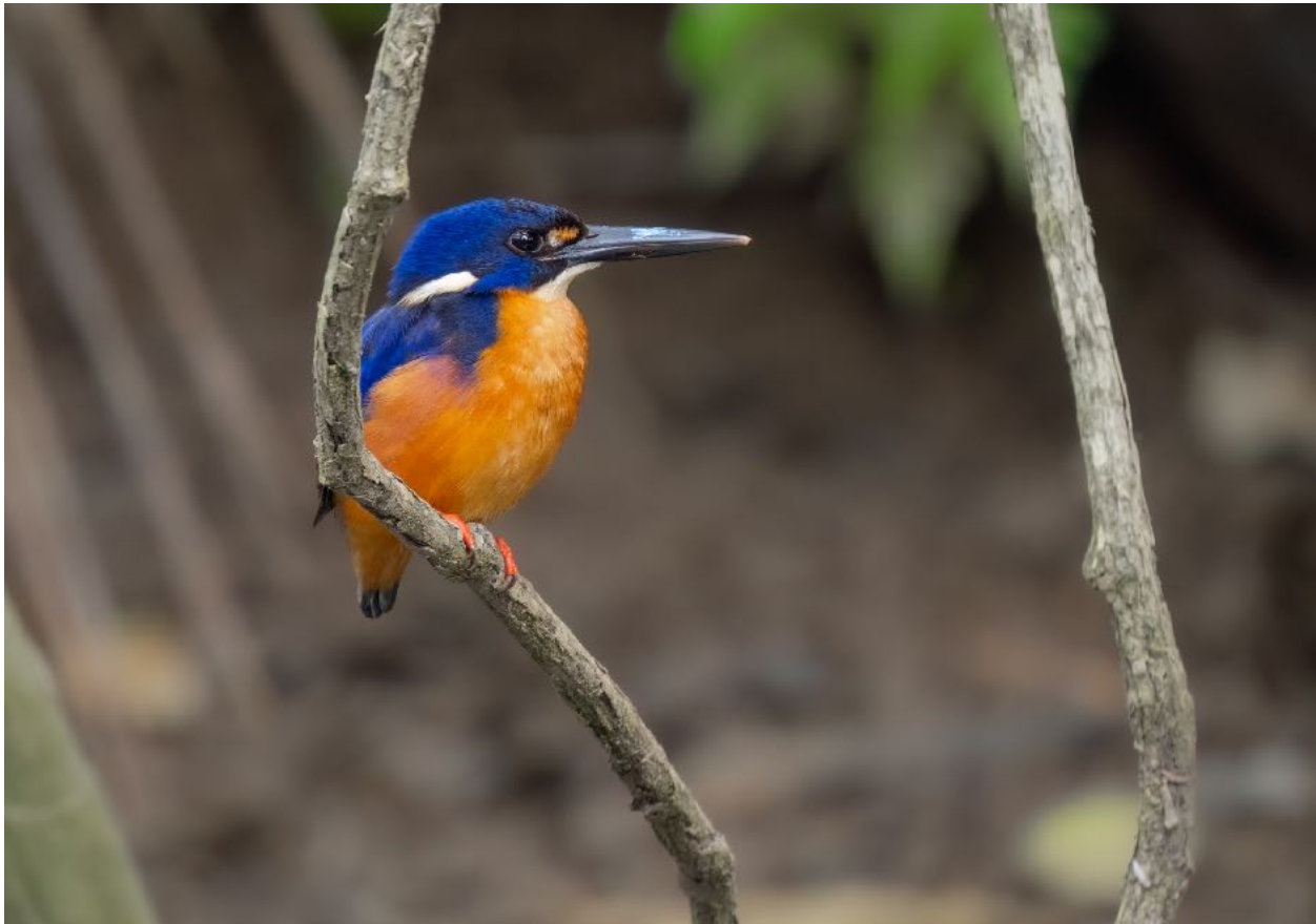
Azure Kingfisher

Now that it was time for our tour we met up with our boat captain and hit the Daintree River Cruise . A lovely few hours on the water gave us views at Azure Kingfisher , Black Bittern , Great Egret , Shining Flycatcher , Australasian Darter , Little Pied Cormorant and a sweet sighting of Spotted Whistling Duck . We also ran into ‘Barrat’ the massive Saltwater Crocodile and a Common Tree Snake . Try as we did, we couldn’t locate our Little Kingfisher, so we’d have to try that in another spot.