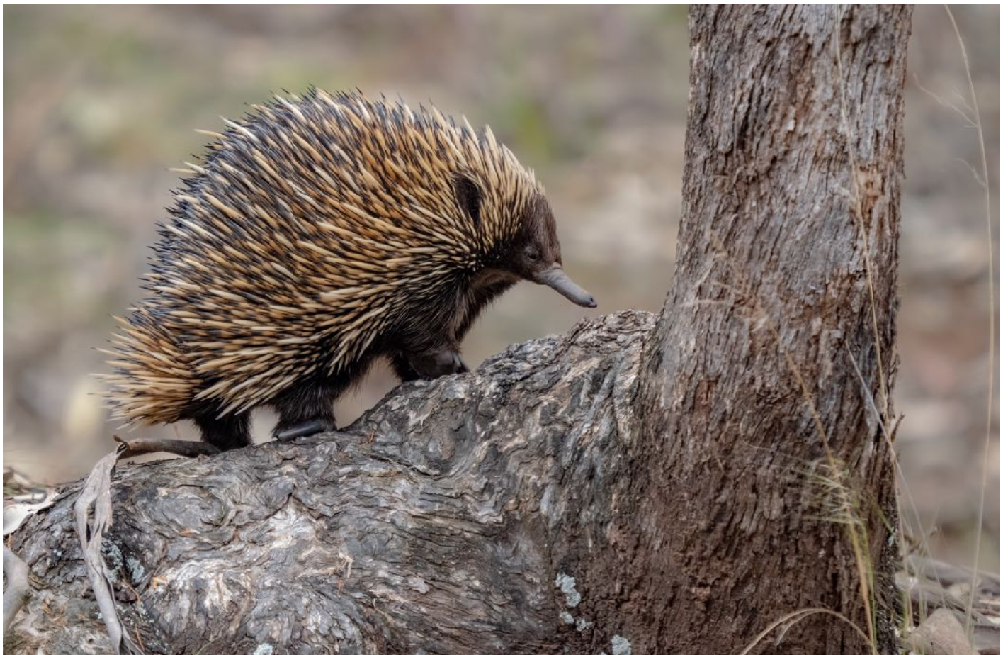
Short-beaked Echidna

Our next two stops were Galore Hill Reserve and The Rock Reserve . Mainly we were searching for Diamond Firetail which unfortunately we did not find. In fact, we would miss this bird for the trip which was a real bummer considering we got the other two fire tails but hey, you can't catch them all... we did however have a wonderful viewing and shoot with a Short-beaked Echidna , Western Gerygone and Brown-headed Honeyeater .