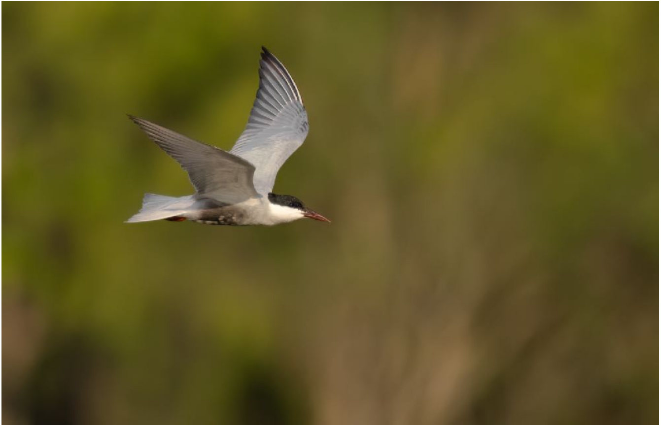
Whiskered Tern

Another long driving day awaited and since we had done so well in Cunnamulla, I opted to leave early and head towards the city of Bourke. Our first stop was the North Bourke River View Point . Here we caught up with hundreds of Tree Martin , a pair of White-winged Trillers and a lone Rufous Songlark .