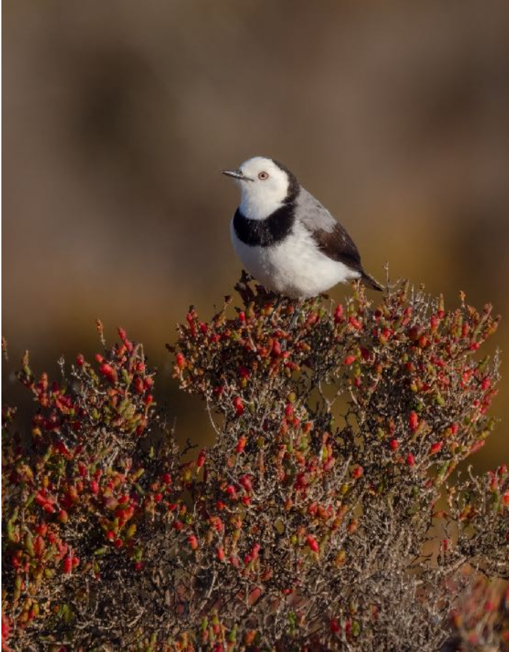
White-fronted Chat - Photo by Guide: Ben Knoot