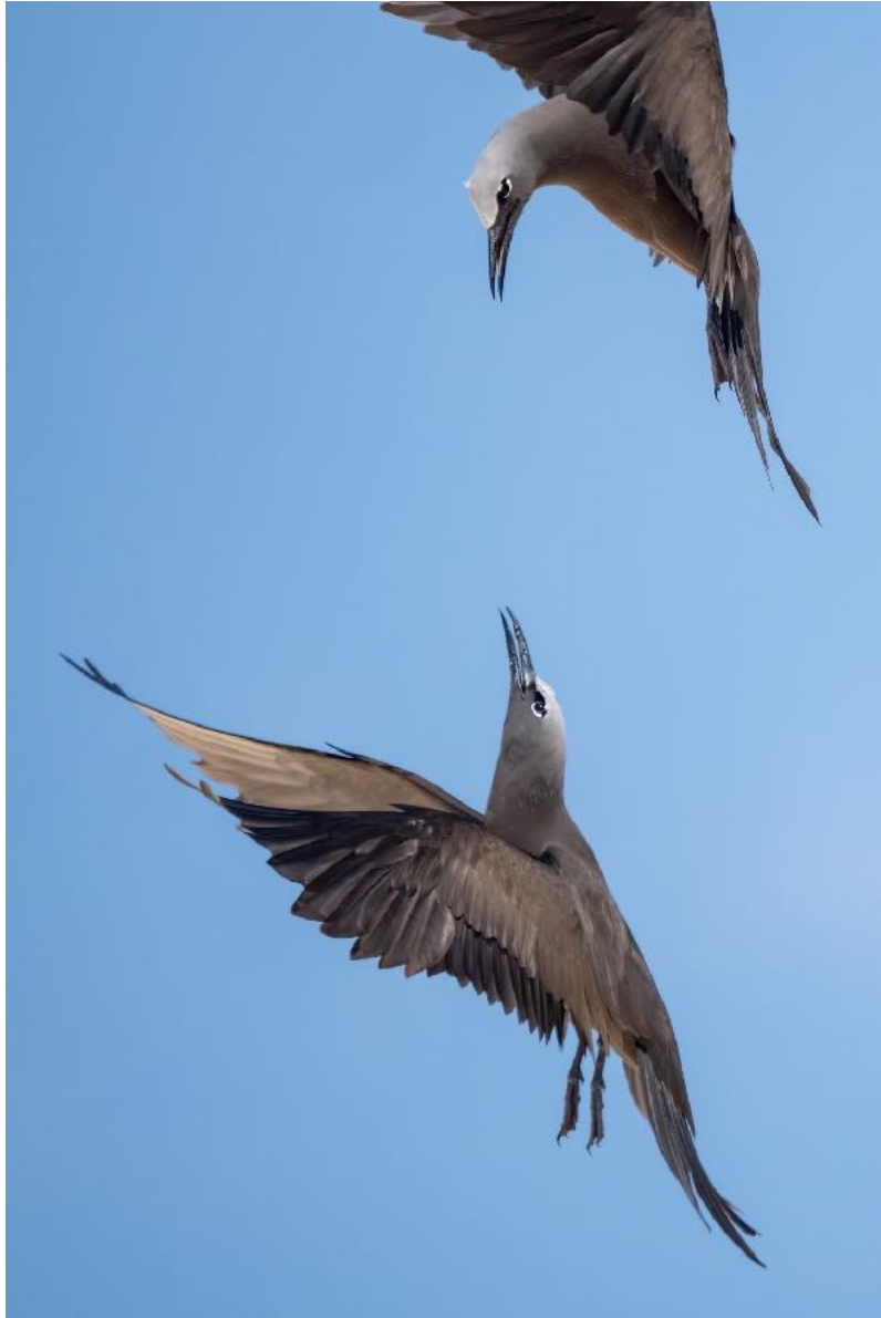
Brown Noddy