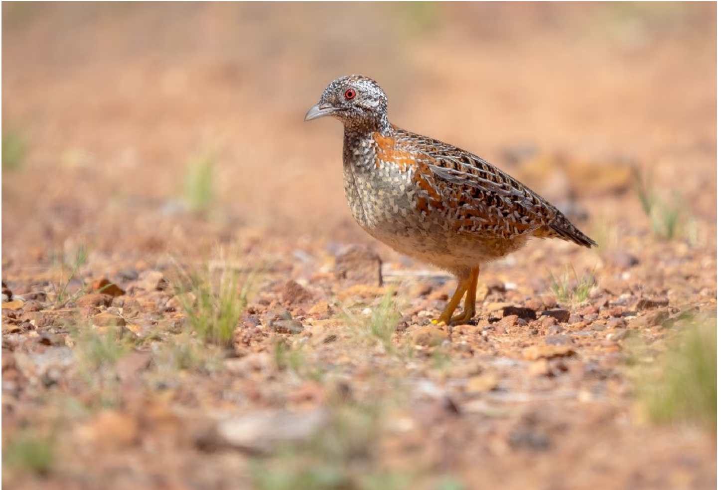
Painted Buttonquail

The biggest surprise for this area came when one of the guests came to me after I had visited the facilities saying “I just saw a ‘quail-like’ bird walking around over there” ... Thinking the habitat seemed a bit dense for Brown Quail (and given the fact she had just seen them and thought it looked a bit different) we went over to investigate. Sure enough, she had spotted a Painted Buttonquail ! A very awesome species and what follows are my first photos of this bird so a big thanks to her! The light was a bit harsh but we had a tremendous experience with this usually shy species.