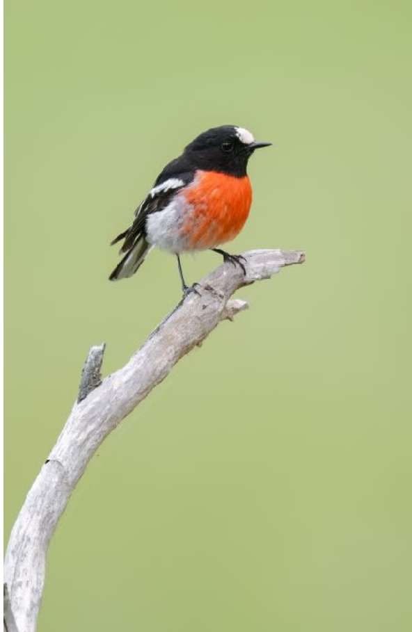
Scarlet Robin