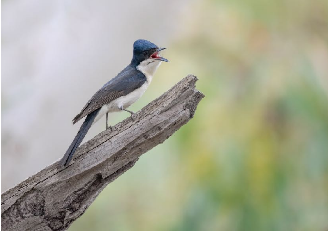
Restless Flycatcher