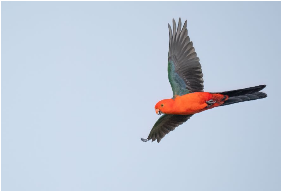
Australian King Parrot