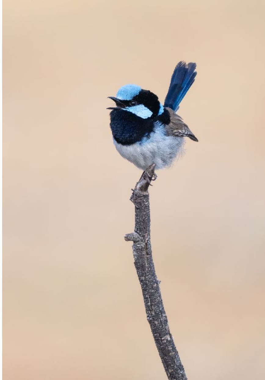
Superb Fairywren

As we still had a long way to go, we grabbed a quick breakfast and then hit the road towards Cunnamulla . We made several opportunistic stops along the way during our drive with one purposeful stop in the outback town of Bollon . Here (and on the drive) we spotted; Spotted Bowerbird , Red-backed Kingfisher , Crested Pigeon , Brown and Black Falcon , Buff-rumped, Yellow and Chestnut-rumped Thornbill , Pink Cockatoo , Splendid Fairywren , Diamond Dove , Singing and Spiny-cheeked Honeyeaters , Red-capped Robin , Little Eagle and Little Woodswallow . I. Love. This. Drive! We also had a sweet run in with a Central Bearded Dragon and hundreds of the outbacks famous, Feral Goats .