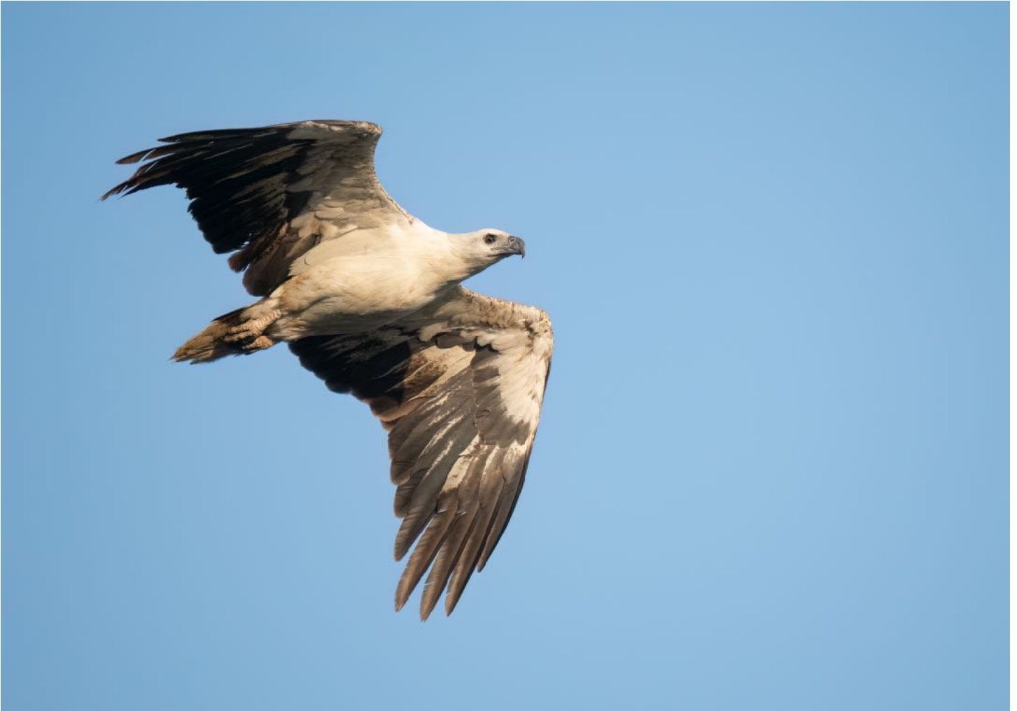
White-bellied Sea Eagle