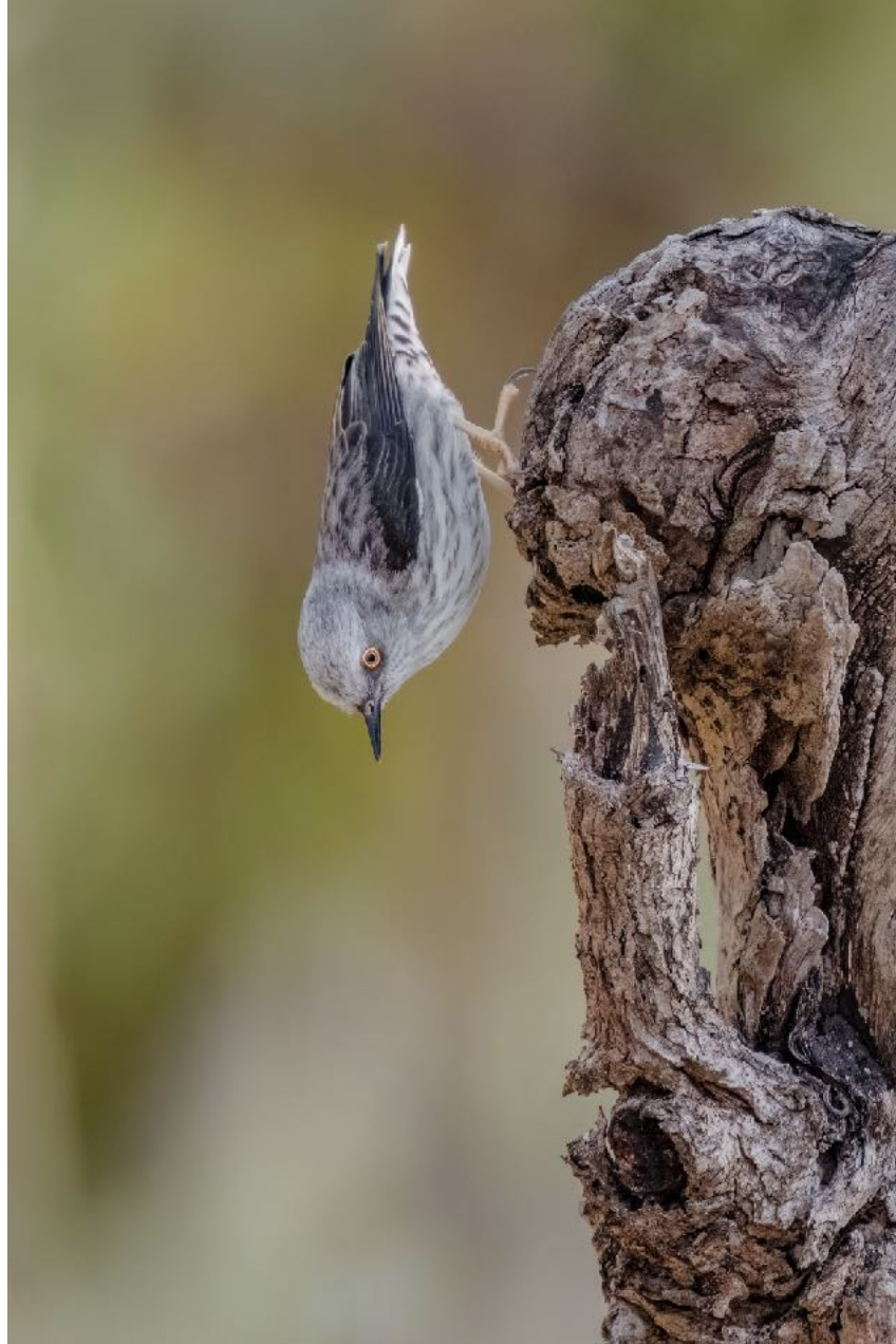
Varied Sittella