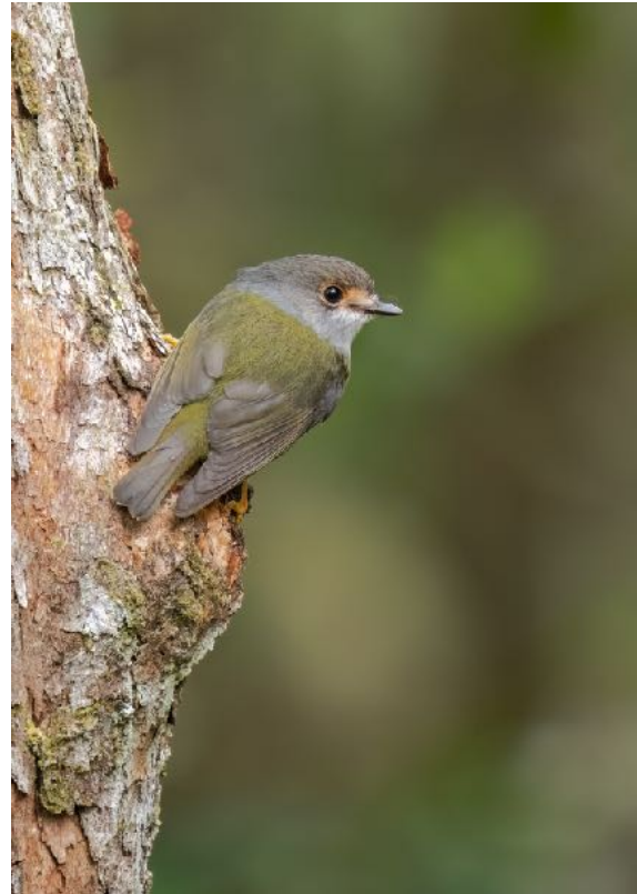
Pale-yellow Robin - Photo by Guide: Ben Knoot