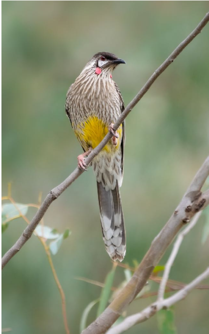
Red Wattlebird

Next up, a quick stop off at Horseshoe Lagoon . We parked, got out and there was our target, a cool Red Wattlebird . Everyone piled back in and we continued on. Target birding at its best right there! We then went on a hunt for Gang-gang Cockatoo and Diamond Firetail in which we turned up empty. The rest of the days locations didn't yield anything new but it is always fun to see the same birds again in different locations. We settled into Chiltern after a nice dinner and prepped for an early morning around Mt. Pilot National Park.