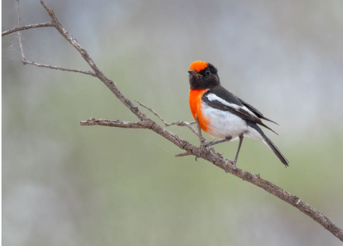
Red-capped Robin