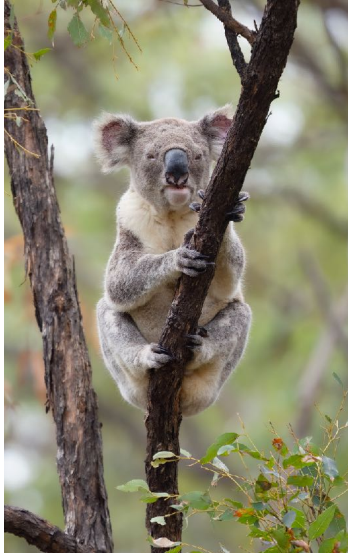
Koala

Now it was time for a date with a superb mammal. We entered Whites Hill Park and were elated to find a pretty active Koala right from the parking lot...so cool!! We also had a fun Laughing Kookaburra , Pied Butcherbird , Pied Currawong and Australian Magpie .