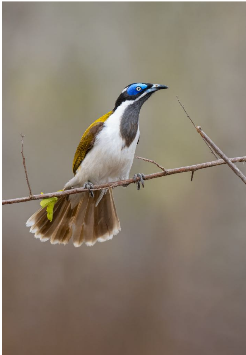
Blue-faced Honeyeater

After Granite Gorge we went over to Jack Bethel Park to quickly grab White-browed Robin , Rufous Fantail and Brush Cuckoo . Then a quick stop off at Mareeba Golf Course to pick up Eastern Gray Kangaroo during the setting sun. A sweet ending to the day.