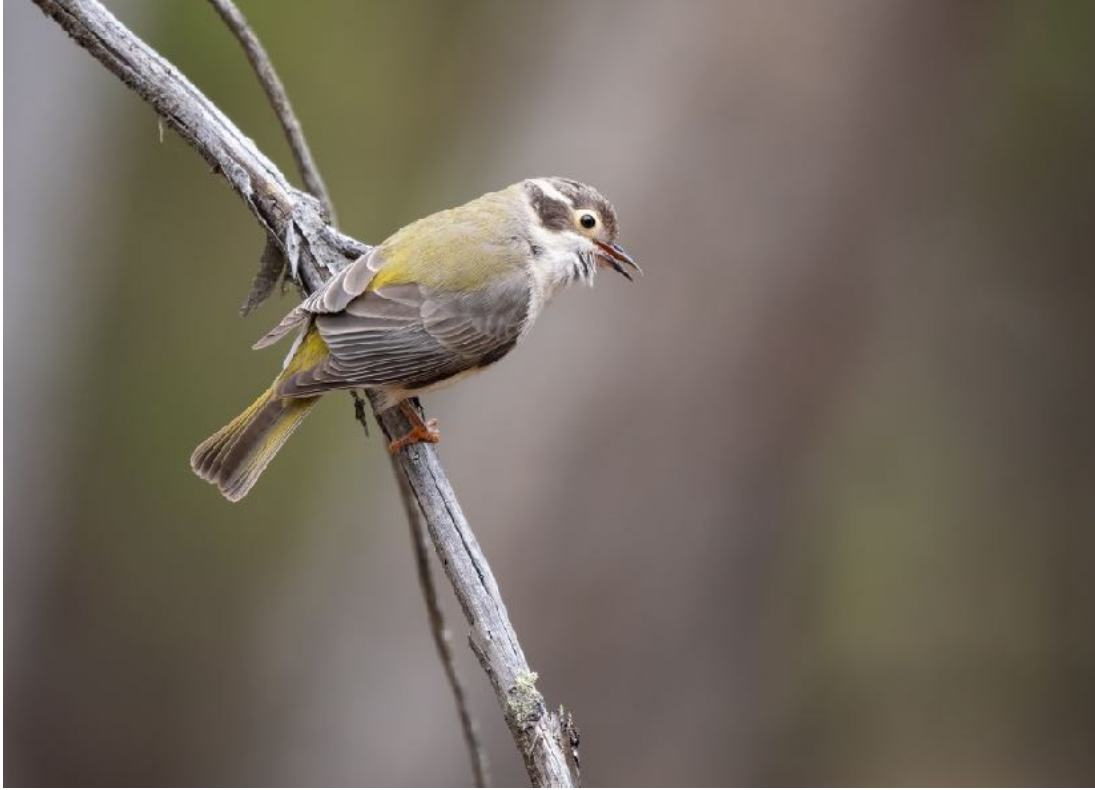
Brown-headed Honeyeater