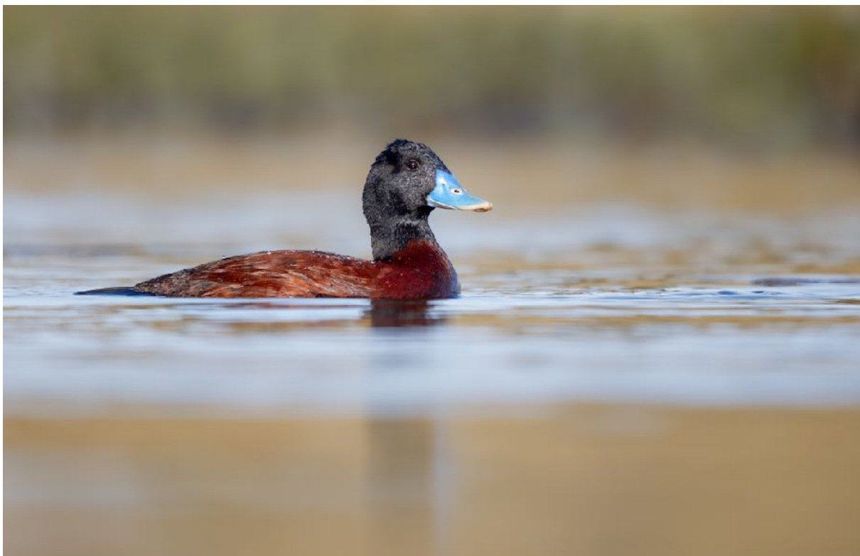
Blue-billed Duck

At this time, two of the guests wished to return to town to do some souvenir shopping while the other two wished to take an hour and a half drive north to my surprise to see if we could catch up with that Blue-billed Duck . Not only did we find it, but along the shoreline of Lake Dulverton Conservation Area , we nailed it, getting my best photos of this bird to date! An incredible way to end the day and indeed bird filled tour of Australia!