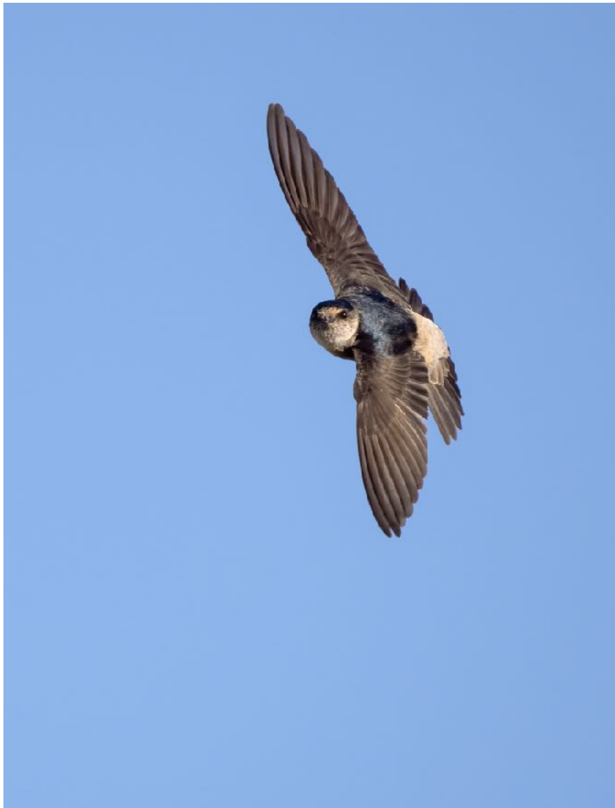
Tree Martin

As our cruise wasn't until 9am, we did some birding down Steward Creek Road . This bit of rainforest is often quite good. We struck gold quickly with a Lovely Fairywren , Pacific Koel , Black-necked Stork , Orange-footed Megapode , Sacred Kingfisher , Leaden Flycatcher , Tree Martin , and Large-billed Gerygone .