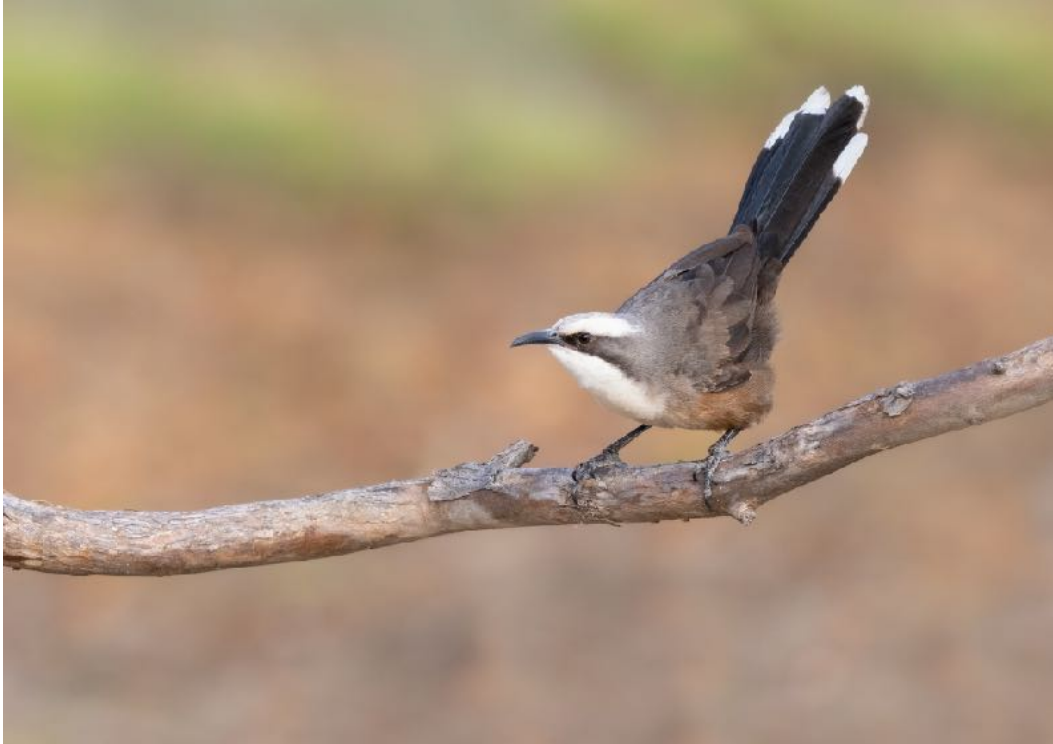
Gray-crowned Babbler