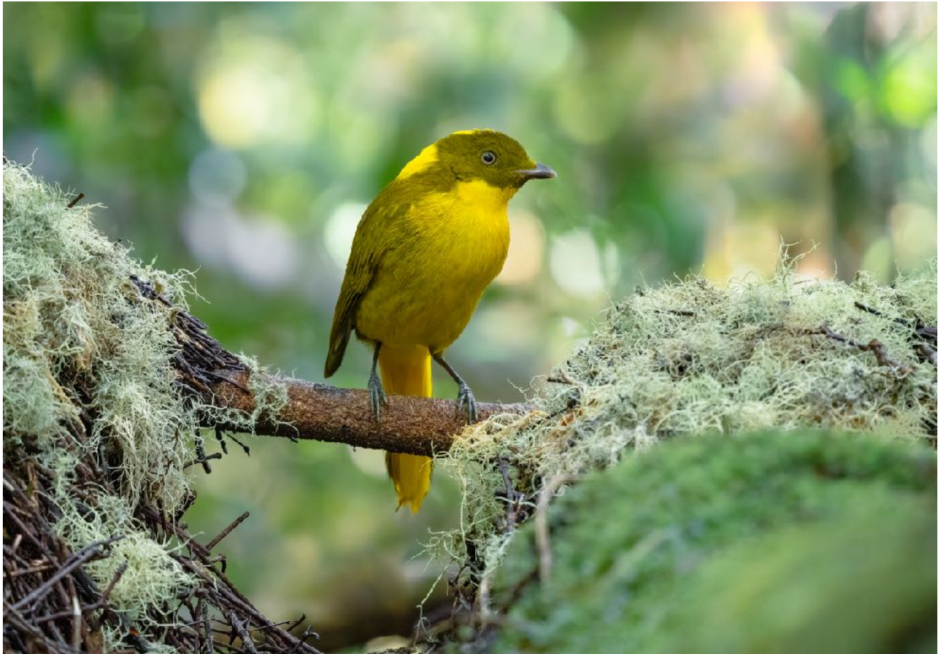
Golden Bowerbird

Next up... Mount Lewis "Clearing to Dam" Track . This 2ish mile trail had several very special targets. I am happy to report, we got all of the big ones. Birds like; Chowchilla , Gray Fantail , Fernwren , Atherton Scrubwren , Bower's Shrike-thrush , Yellow-throated Scrubwren and the biggest prize of them all, the sensational Golden Bowerbird who we even got to watch tend to his bower at a close distance.