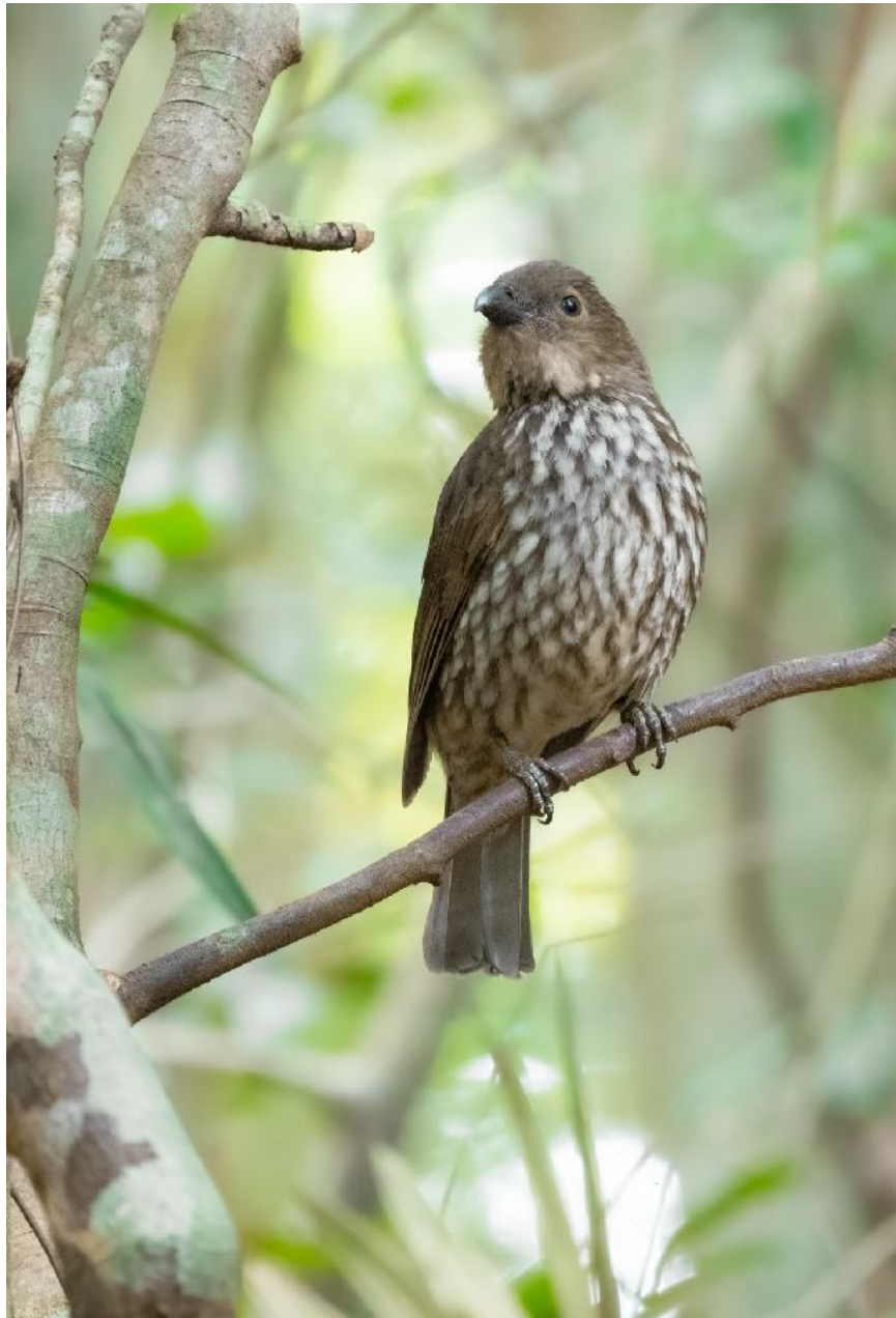
Tooth-billed Bowerbird

After a quick stop at Curtain Fig Tree (which was largely unproductive), we ventured over to Lake Barrine for a nice afternoon walk around the lake. Here we managed; Great-crested Grebe , Tooth-billed Bowerbird , Pied Currawong , Spectacled Monarch , Spotted Catbird and White-browed Scrubwren . A top mammal highlight here was the cute little Musky Rat Kangaroo .