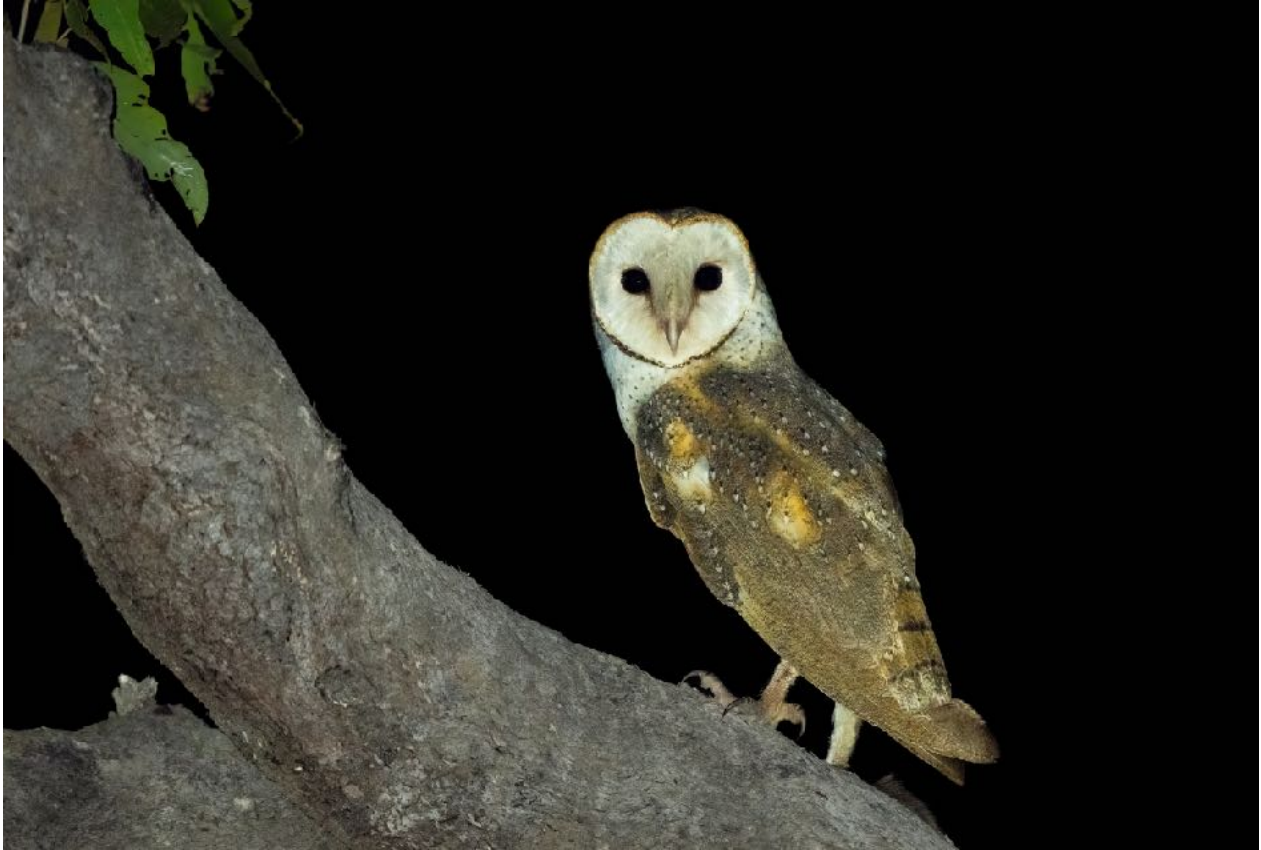
Barn Owl

As if the day wasn't long enough, we ventured out for a bit of a night outing. Close to our hotel lies a terrific location called Davies Creek . Here we had some terrific luck with Australian Owlet Nightjar , Barn Owl , Northern Brown Bandicoot , Eastern Quoll and Giant White-tailed Rat . A sweet ending to an incredibly long and fruitful day.