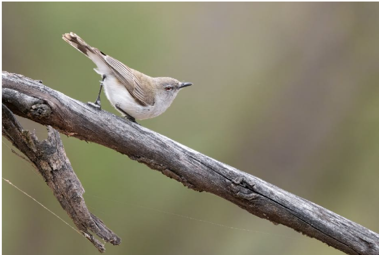
Western Gerygone