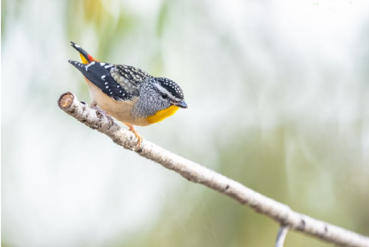
Spotted Pardalote