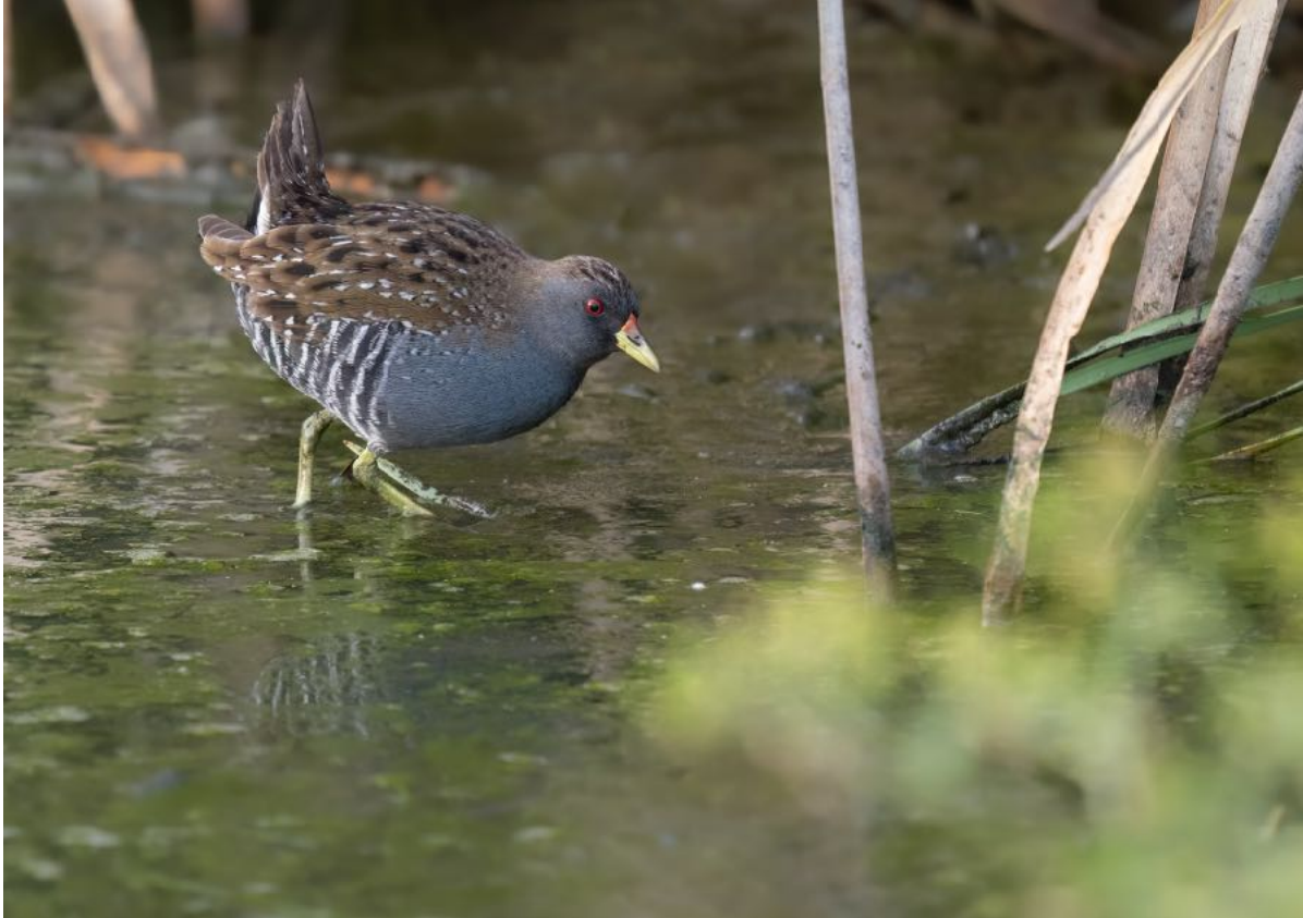
Australian Crake

A long drive later landed us in Binya State Forest , just on the outskirts of Griffith. Here we scored our last babbler species, the White-browed Babbler . We also managed to find Australia's only remnant to North American warblers, the Speckled Warbler . Additional birds we added were European Goldfinch and Western Gerygone . There were also plenty of European Hare around.