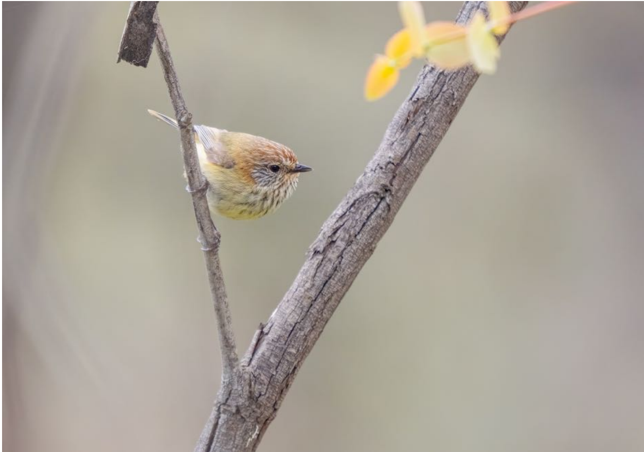
Striated Thornbill

The day was rainy. This wasn't good. This was our best chance for two mega birds. The Gang-gang Cockatoo and Spotted Quail Thrush. We had on and off heavy rain for several hours in our first few locations. Despite the rain we ended up seeing one of the two, the Spotted Quail Thrush . After checking several areas for Gang-gang Cockatoo, we had to eventually give in. One other bird was added in Chiltern National Park , the Striated Thornbill .