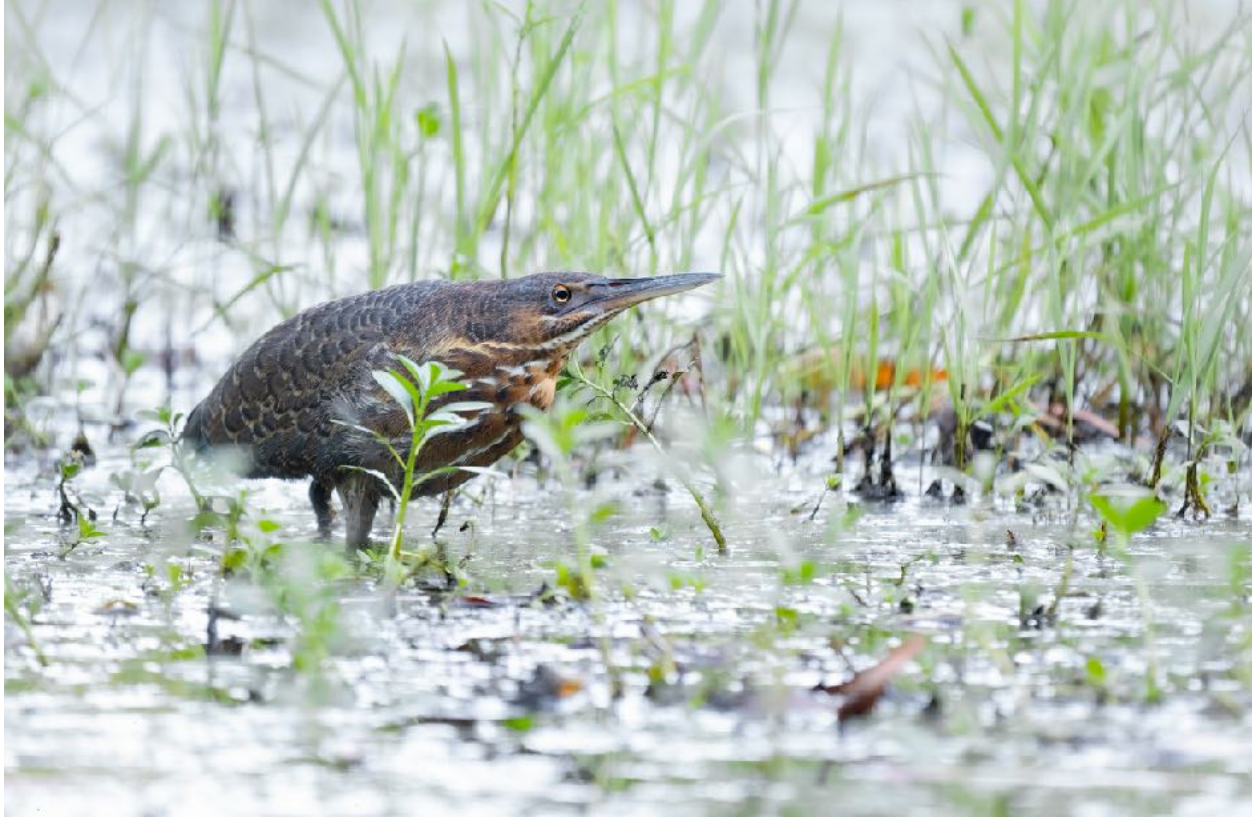
Black Bittern