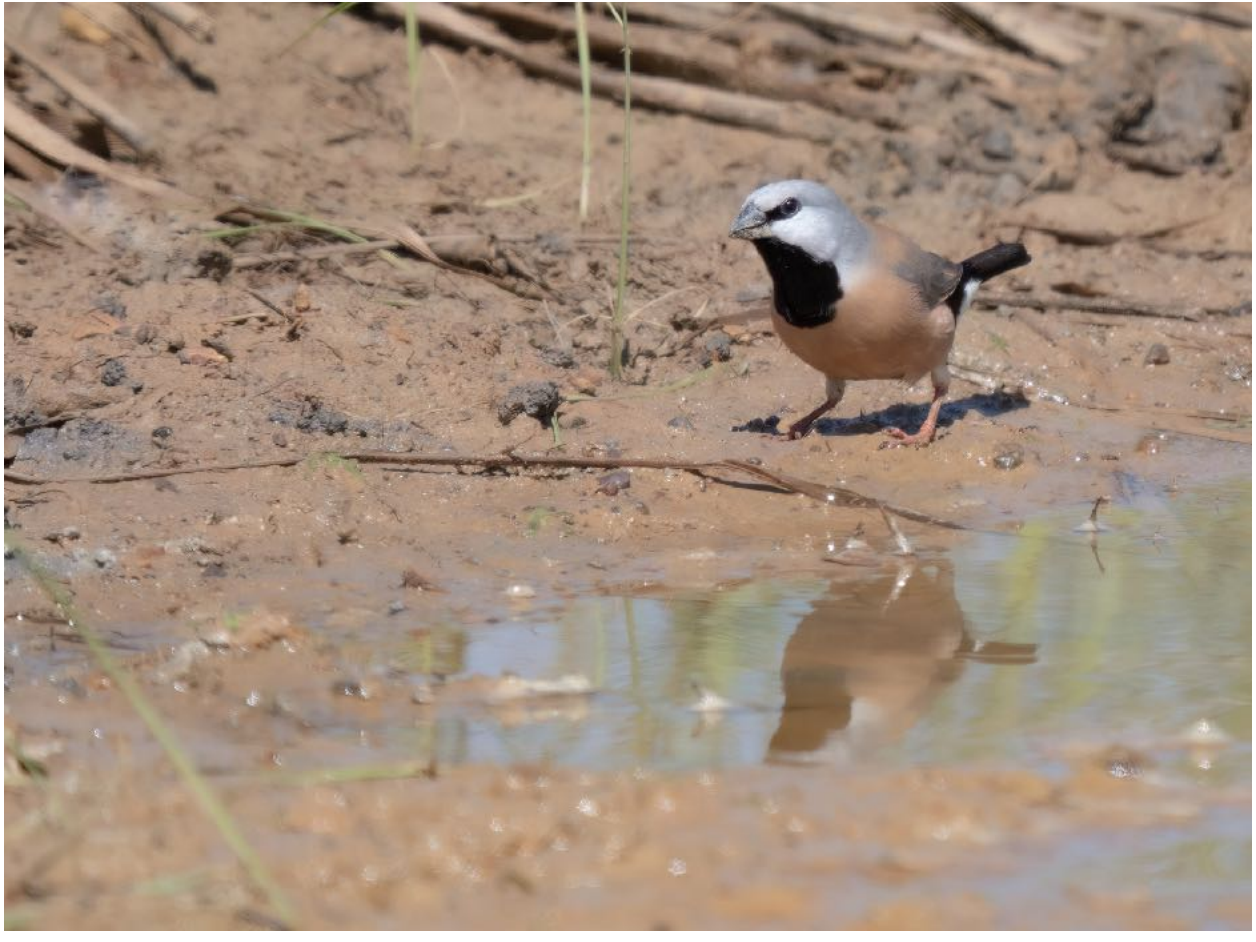
Black-throated Finch (set-departure tour) - Photo by guide: Ben Knoot