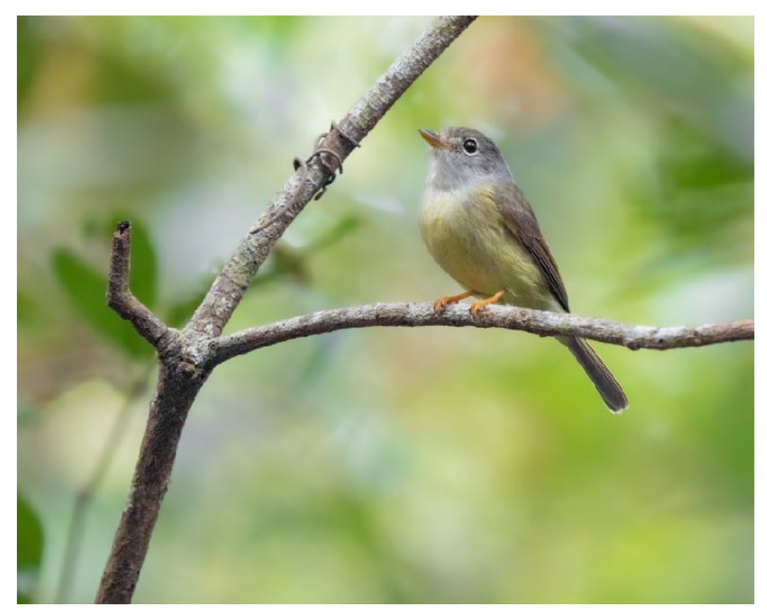
Yellow-legged Flycatcher (scouting trip)