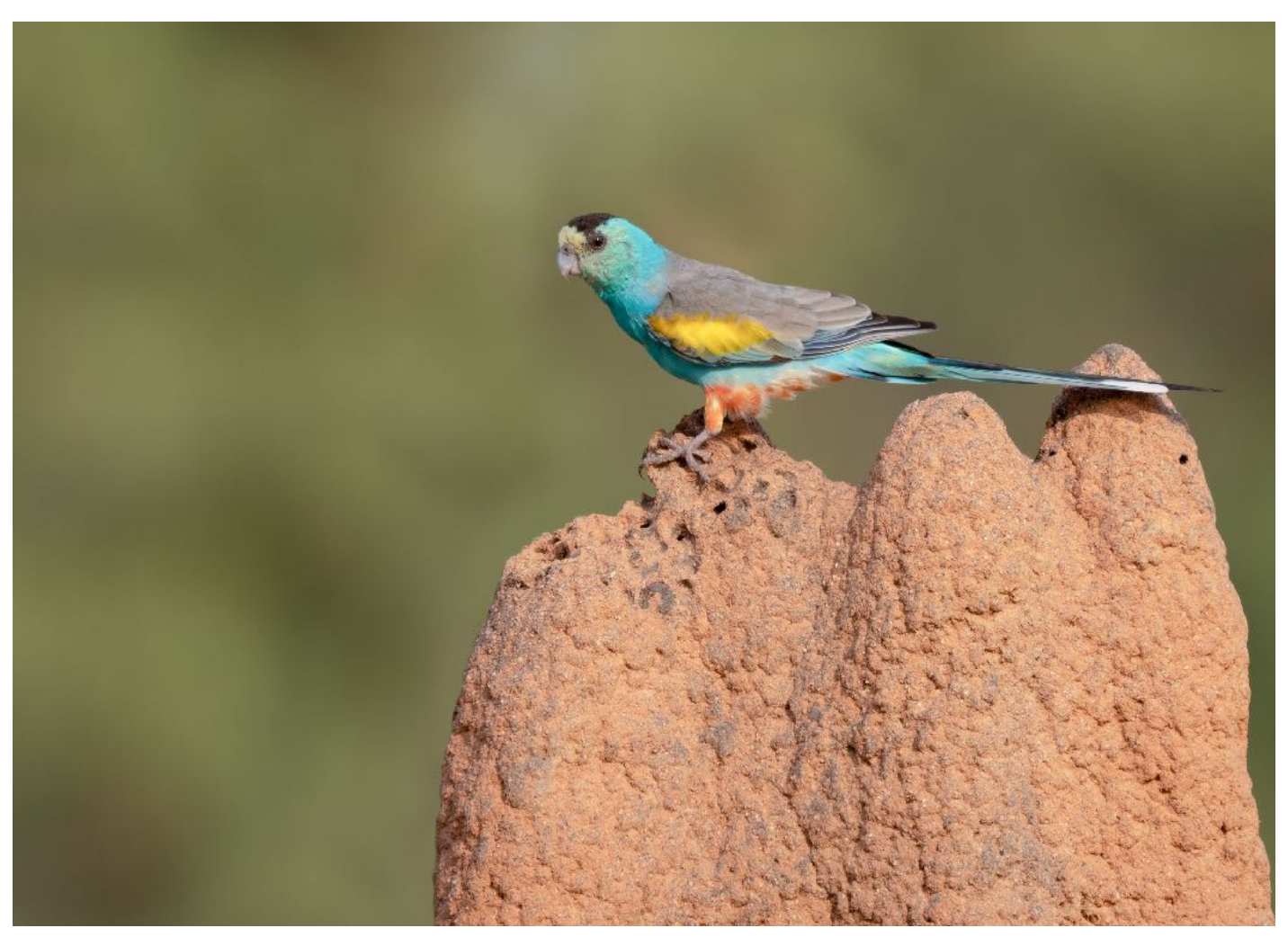
Golden-shouldered Parrot (set-departure tour)