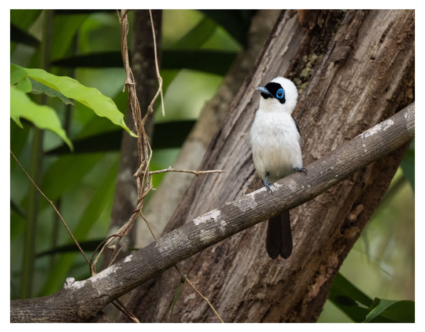
Frill-necked Monarch (set-departure tour)

The locations all offered a different set of birds, some of the more common species will be left out of the following but for a full list of species seen on the tour, again, please refer to the list at the very end of this document. The highlight species from these locations were; Tropical Scrubwren, Northern Scrub-robin, Red-cheeked Parrot, Eclectus Parrot, Palm Cockatoo, Trumpet Manucode, Yellow-legged Flycatcher, White-faced Robin, Magnificent Riflebird, White-streaked Honeyeater, Green-backed Honeyeater, Tawny-breasted Honeyeater, Black-winged Monarch, Fawn-breasted Bowerbird, Spotted Whistling Duck, Pied Heron, Little Curlew, Chestnut-breasted Cuckoo, Marbled Frogmouth, Yellow-billed Kingfisher, Buff-breasted Paradise Kingfisher, White-eared Monarch, Lovely Fairywren, Yellow-breasted Boatbill and Frill-necked Monarch. Many more species of birds were seen and those are listed on the list at the end. The highlight mammal of our time in the Iron Ranges was a Southern Common Cuscus. It was an awesome few days! Below is a small gallery of some of the birds we saw. Again, some photos were from the tour itself and some from my scouting trip but are all species that were seen on the set-departure tour.