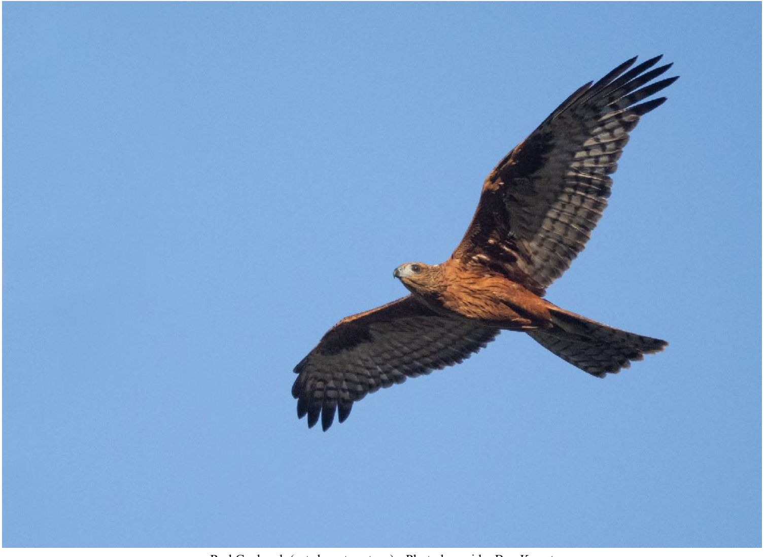
Red Goshawk (set-departure tour)