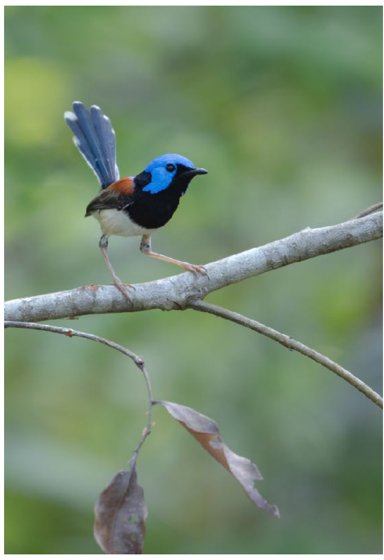
Lovely Fairywren (set-departure tour)