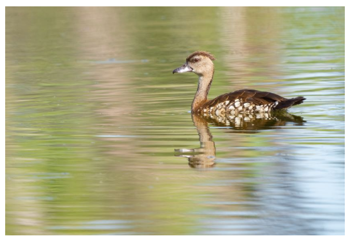
Spotted Whistling Duck (set-departure tour)