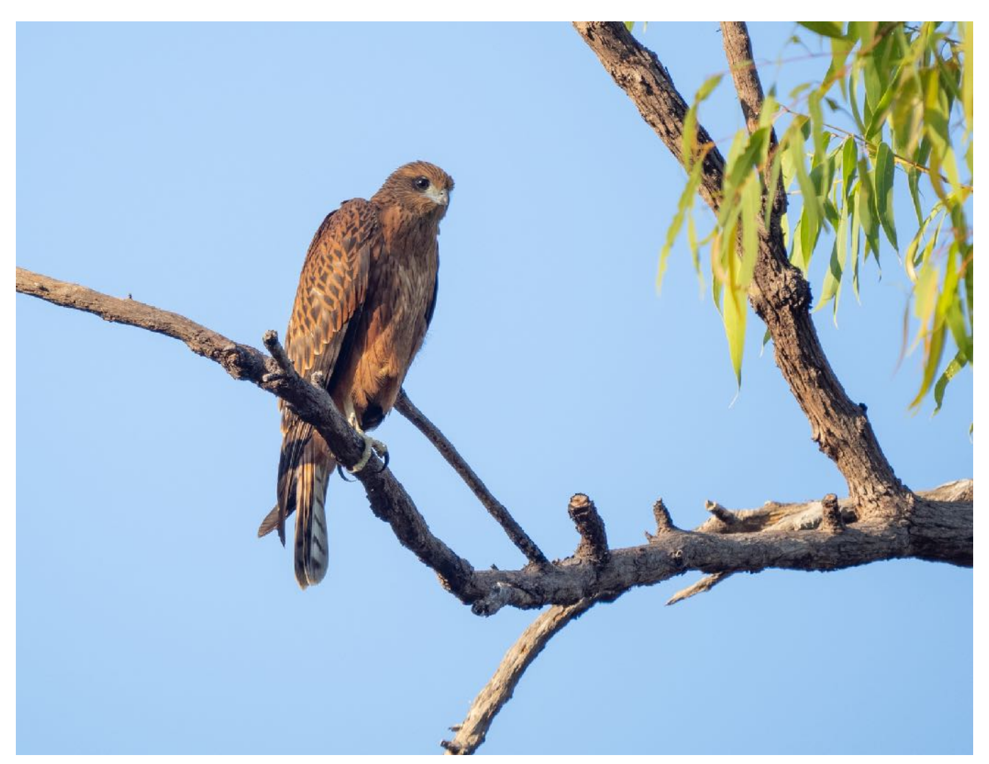
Red Goshawk (set-departure tour)

This morning was a special one indeed. Since breakfast didn't start until about 7:30am, we took a quick walk around Musgrave Station to see what we could find. We added Blue-winged Kookaburra, Nankeen Night Heron, Pacific Koel, and Peaceful Dove. We then went to see our main target of the morning along Lakefield Road, the incredible and rarest raptor in the Australia, the Red Goshawk. Awesome to spend a few minutes with two of these amazing raptors.