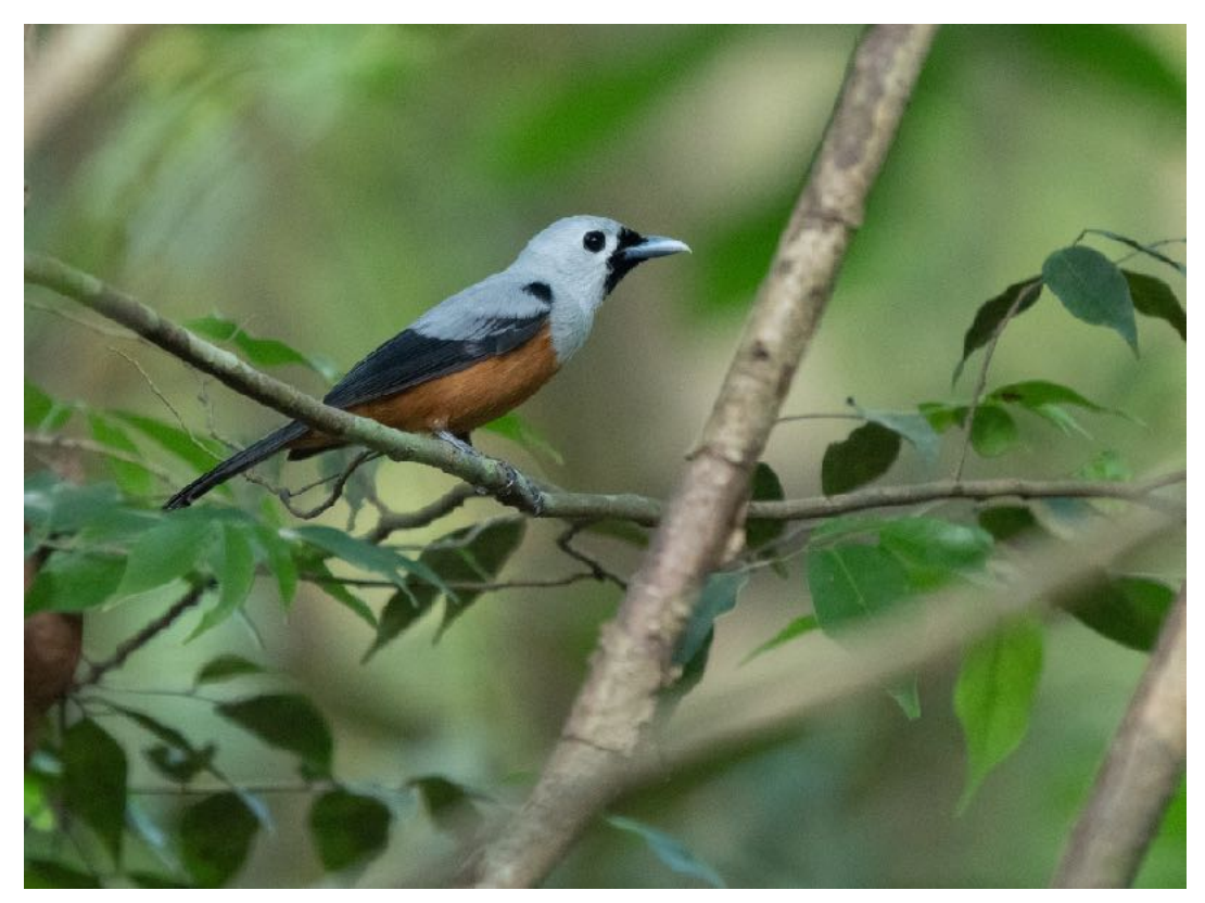
Black-winged Monarch (set-departure tour)