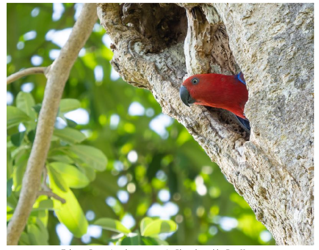
Eclectus Parrot (set-departure tour)