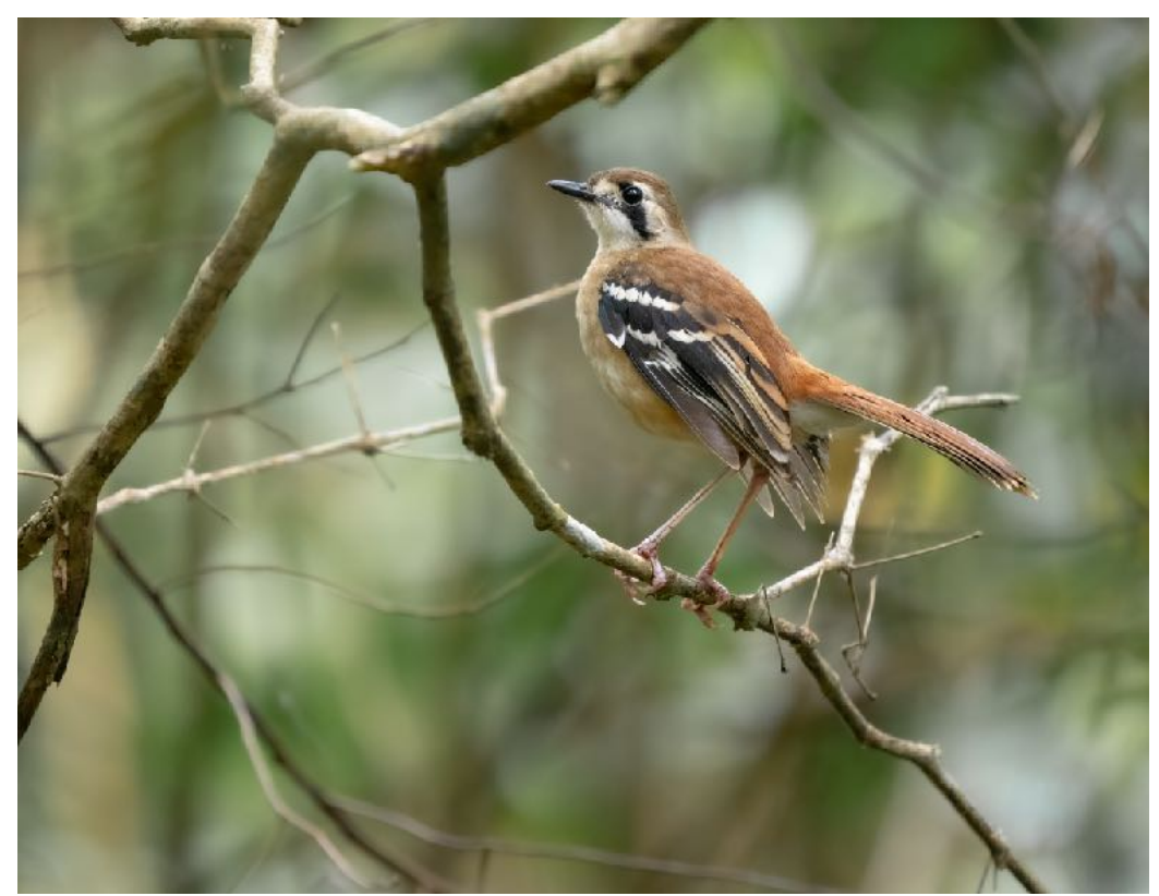
Northern Scrub-robin (scouting trip)