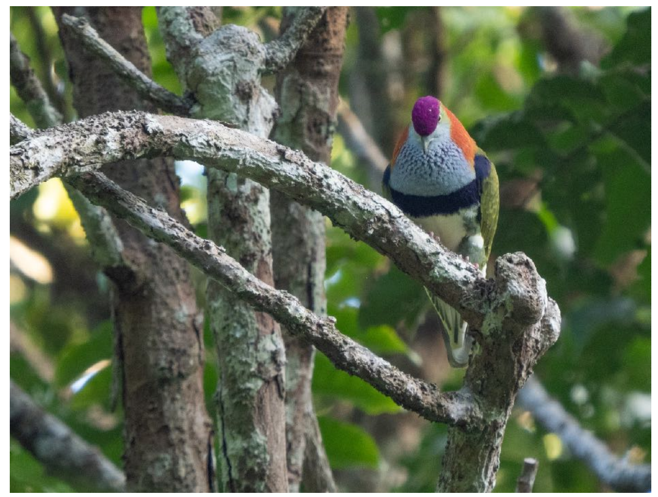
Superb Fruit Dove (photo from set-departure tour)

The tour began this afternoon around Cairns. I began by visiting a few of the great roosting birds in the area. An easy Bush Thick-knee, Gray Goshawk and Papuan Frogmouth made for a great intro of the tour. We then took quick look at Yorkey's Knob Golf Course lagoon for a few more targets. Here we found; Torresian Kingfisher, Double-eyed Fig Parrot, Olive-backed Sunbird, Chestnut-breasted Munia, Scaly-breasted Munia, Radjah Shelduck, Little Black Cormorant, Australasian Darter, (Eastern) Osprey, Green Oriole, Yellow Honeyeater, Welcome Swallow, Tree Martin and an accommodating Brown-backed Honeyeater. We then went over to Cattana Wetland and found Black Butcherbird, Green Pygmy Goose, Scaly-breasted Lorikeet, Combcrested Jacana, Great and Intermediate Egret, Crimson Finch, Helmeted (hornbill) Friarbird, Torresian Imperial Pigeon, Common Greenshank, Black-fronted Dotterel, Orange-footed Megapode, Australian Brush Turkey and Pacific Black Duck. Our final location for the day was Lake Morris Road. This dense rainforest is home to many amazing birds and as an important note, both of the guests had already done a bit of birding in Australia so we targeted the species they hadn't seen rather than blanket the area. We rounded out the day with; Macleay's Honeyeater, Large-billed Scrubwren, Noisy Pitta, Wompoo Fruit Dove, Superb Fruit Dove, Victoria's Riflebird, Yellow-spotted Honeyeater, Fairy Gerygone and Spangled Drongo.