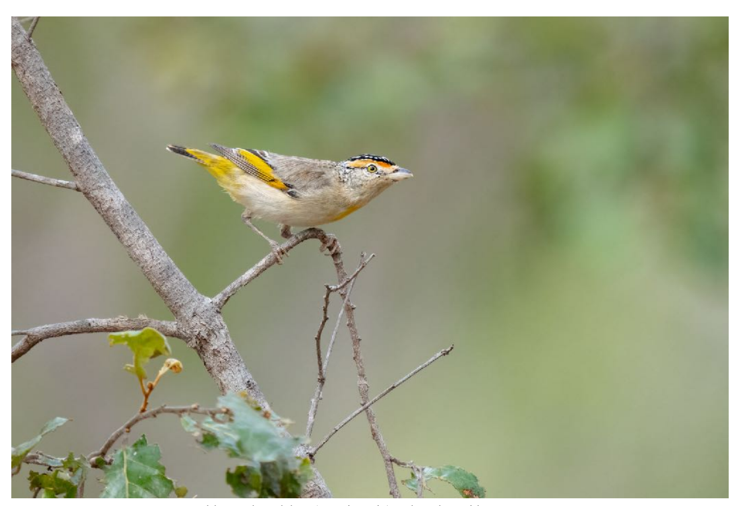
Red-browed Pardalote (scouting trip)

Our next stop was the Mt. Carbine Cemetery. Here we found one bird of interest, the Banded Honeyeater. That was enough birding for awhile, it was time to down some kilometers and travel. After about 2-hours or so, we landed (metaphorically) at the Laura Roadhouse. Here we had one target of which we found immediately, the Black-backed Butcherbird. We also added, White-throated Honeyeater, Laughing Kookaburra, Black and Whistling Kite. Our final destination was calling so we hit the road and arrived in Artemis Station at the absolute perfect time. We pulled in and immediately found the main target, the Golden-shouldered Parrot. Around the grounds we added Red-browed Pardalote, Bar-shouldered Dove, Sulphur-crested Cockatoo, Weebill, and a singing White-throated Gerygone (to be seen well on our return visit).