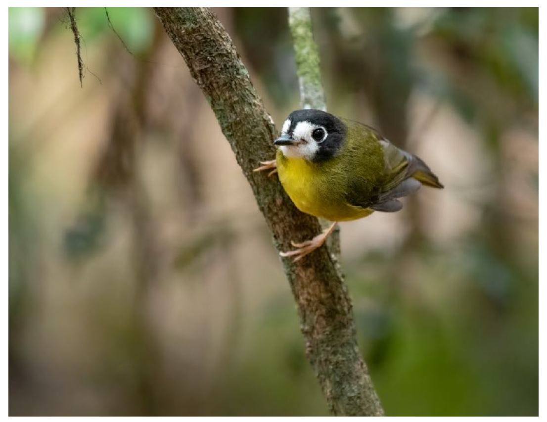
White-faced Robin (scouting trip)