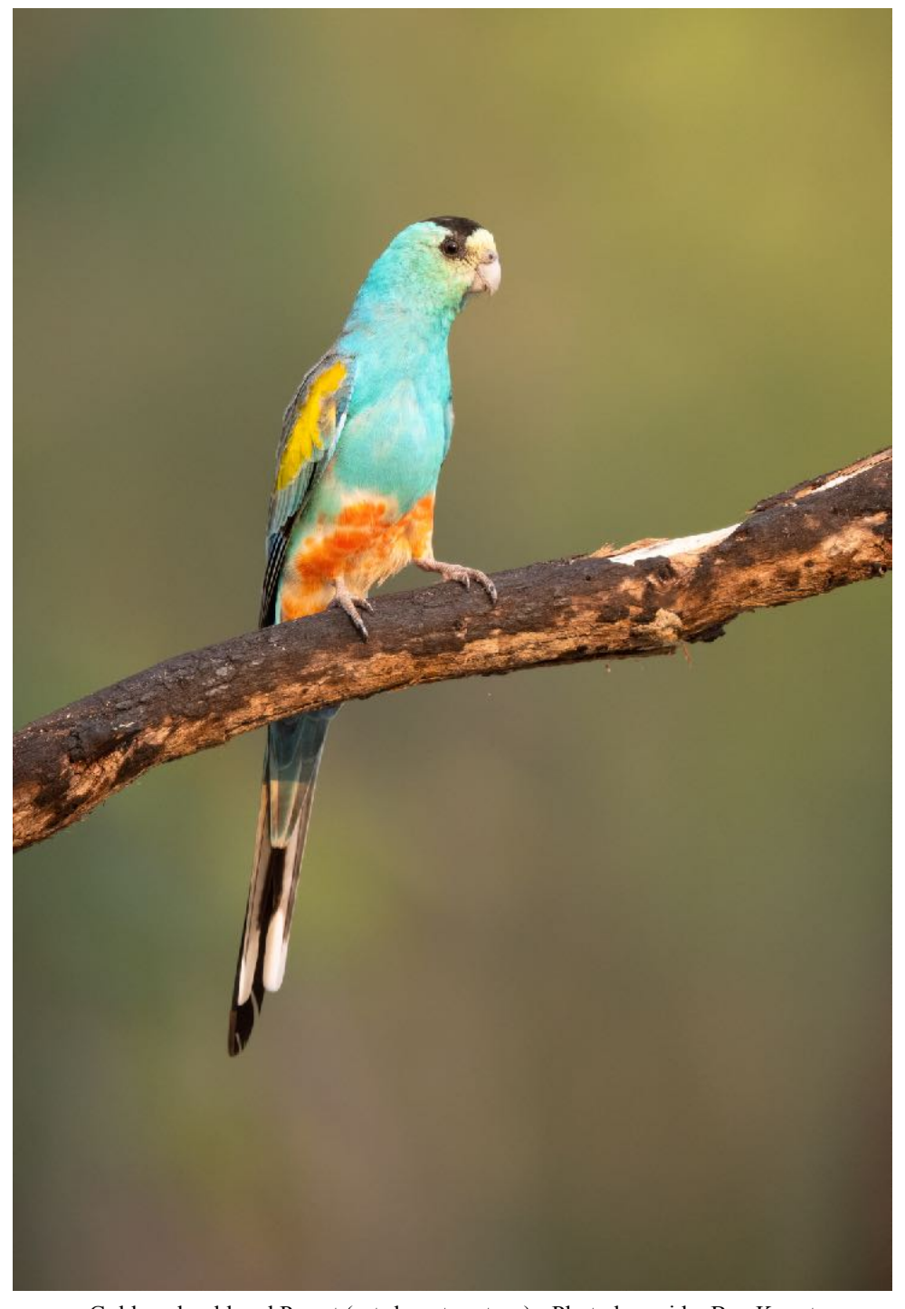
Golden-shouldered Parrot (set-departure tour)