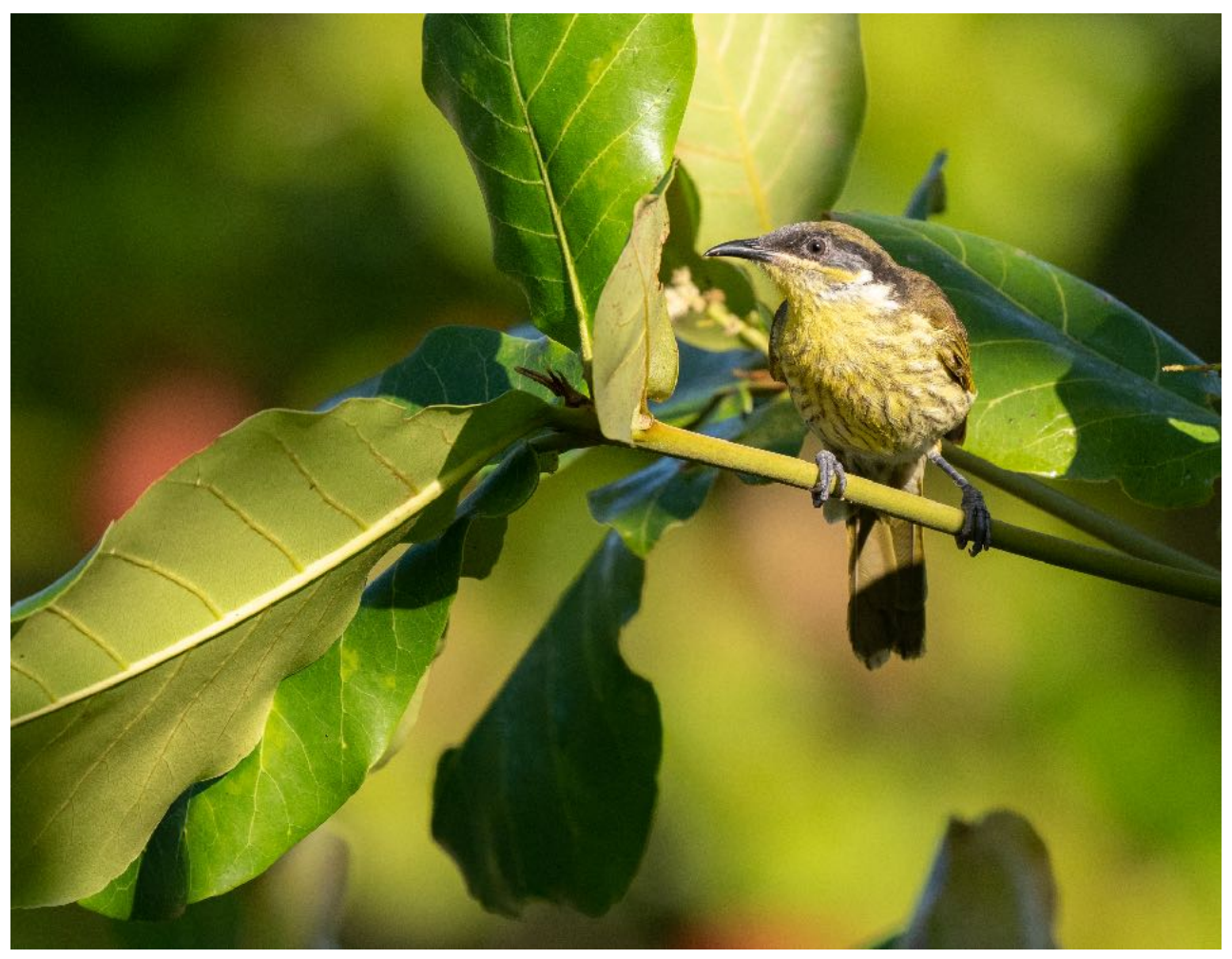
Varied Honeyeater (set-departure tour)

Our day began early at the Cairns Esplanade. Here we picked up Mangrove Robin, Rose-crowned Fruit Dove, Varied Honeyeater, Terek Sandpiper, Gray-tailed Tattler, Greater and Lesser Sand Plover, Red-capped Plover, Far-eastern Curlew, Whimbrel, Bar-tailed and Black-tailed Godwit, Red-necked Stint, Pacific Golden Plover, Silver Gull, Masked Lapwing, Common Myna, Australasian Figbird, and Rainbow Lorikeet.