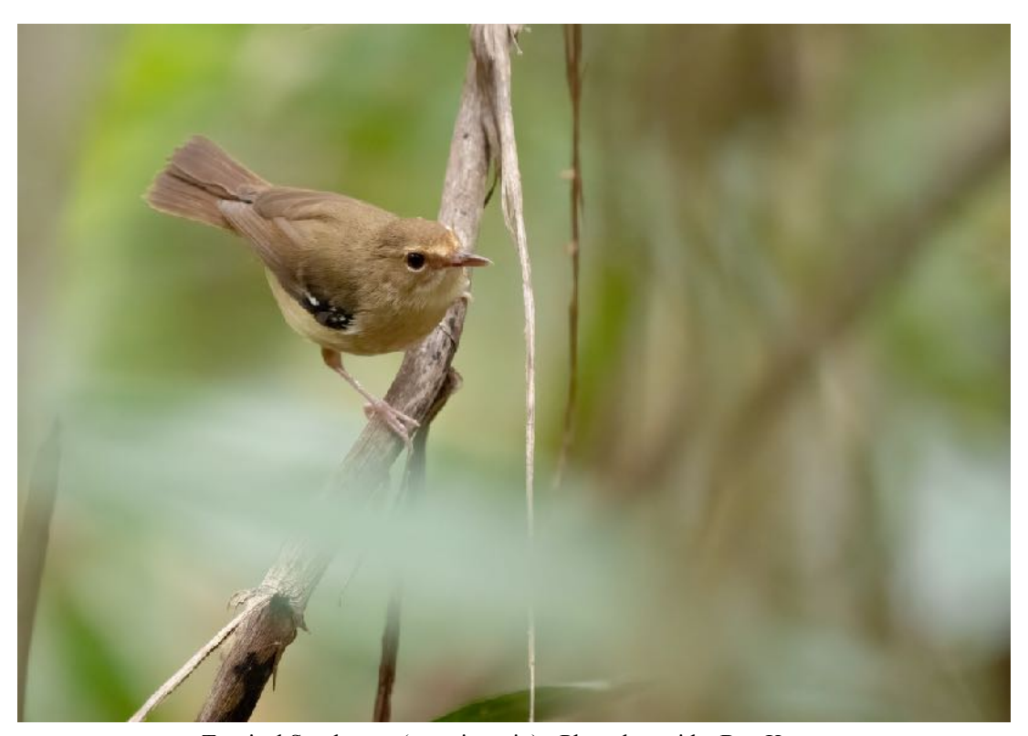
Tropical Scrubwren (scouting trip)