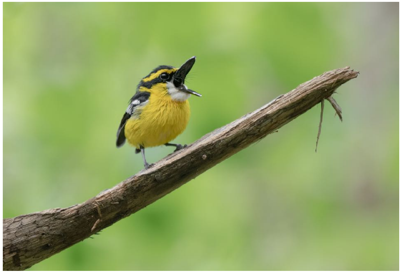
Yellow-breasted Boatbill (set-departure tour)