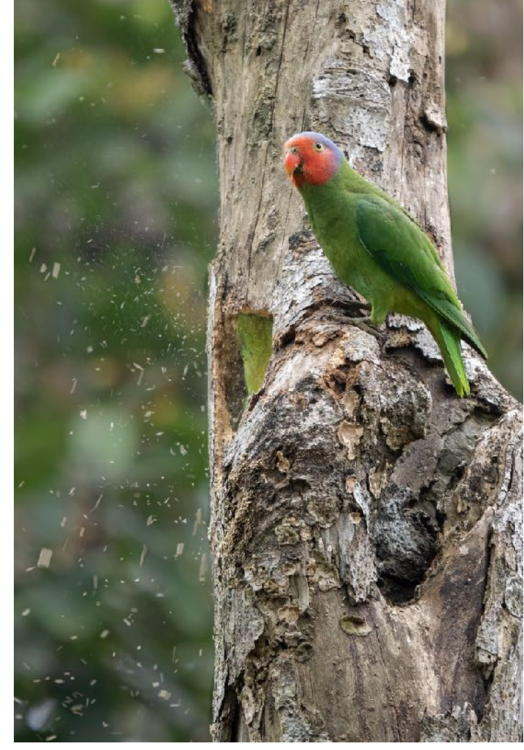
Red-cheeked Parrot (scouting trip)